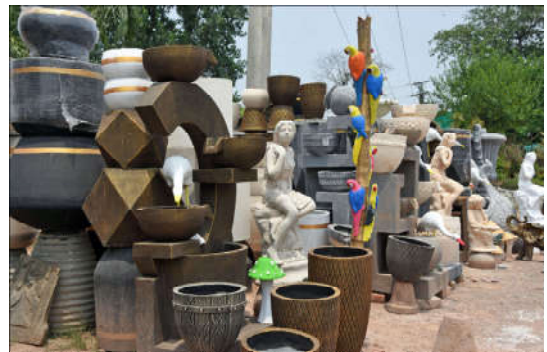
ISLAMABAD: A vendor is displaying decorative sculptures and fancy plant pots attraction for customers at his local nursery along a road in the Federal Capital.

The Governor expressed heartfelt condolences to the families of the martyred security forces personnel and police officer, and assured them of full support and solidarity in their time of grief.