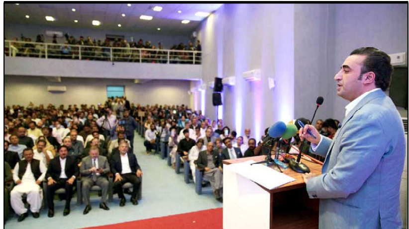
KARACHI: Peoples Party (PPP) Chairman, Bilawal Bhutto Zardari addresses during inauguration ceremony of new facilities, held at Jinnah Hospital in Karachi.

ernment had already given upto Rs 5 per unit relief to all the protected and non-protected consumers in three months' electricity bills (June to August) with a generous allocation of a subsidy of 50 billion rupees. Tarar pointed out that all those consumers who used upto 200 units of the electricity per month, had already received the relief across the country. Likewise, the Punjab government allocated Rs 45 billion from its own funds to give subsidy to those who were using 200 units to 500 units per month. Cumulatively, the relief initiatives of both the governments did provide the much-needed relief to the masses, he said, adding now it was up to other provincial governments to take identical steps to ensure relief to the masses.