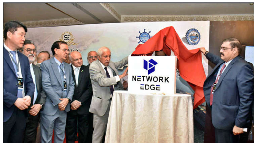
KARACHI: Federal Minister for Maritime Affairs Qaiser Ahmed Sheikh unveiling the plaque during the one-day conference titled 'COLMAB 24' on Logistics, Maritime Affairs and Blue Economy.