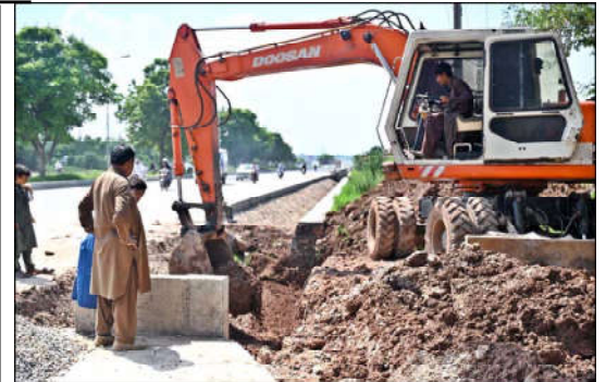
ISLAMABAD: During the expansion work of Club Road, heavy machinery is being utilized to carry out the construction and development tasks.

The KP government's focus on alleged corruption has hindered its ability to address the needs of its citizens, he said this while addressing a press conference here.