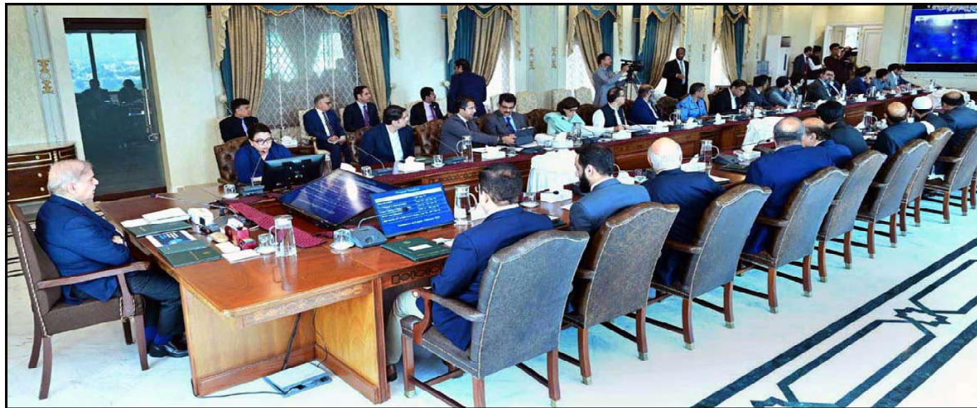
ISLAMABAD: Prime Minister Muhammad Shehbaz Sharif chairs a meeting regarding the review of ongoing projects of Information Technology, digitization and steps to increase IT exports.

Vol. XIV No. 192 Reg. mails-B / ID-445 Tuesday August 20, 2024, Safar 14, 1446 A.H. Ph: 2158688, 2158997 Pages 4: Rs. 12