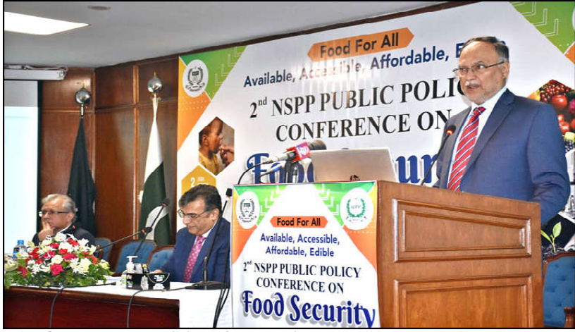
LAHORE: Federal Minister for Planning and Development Ahsan Iqbal addressing the conference on food security SPP (National School of Public Policy) during the opening ceremony.