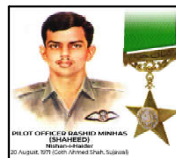
Portrait of Pilot Officer Rashid Minhas, a national hero of Pakistan.

Independent Report RAWALPINDI: The Armed Forces of Pakistan, the Chairman Joint Chiefs of Staff Committee, and the Services Chiefs pay solemn tribute to Pilot Officer Rashid Minhas on the occasion of his 53rd martyrdom anniversary. Pilot Officer Rashid Minhas stands as a luminous exemplar in the annals of Pakistan's history, embodying the very essence of valor and sacrifice. On this day in 1971, Pilot Officer Rashid Minhas made the ultimate sacrifice in the line of duty, demonstrating unshakable bravery and an unrelenting commitment to the defense of Pakistan. As we honor this national hero, we recall his extraordinary act of valor, which epitomizes the spirit of our Armed Forces and serves as a testament to his unyielding dedication. The sacrifice of Pilot Officer Rashid Minhas will be etched in our collective memory forever, inspiring future generations to emulate his exemplary courage and loyalty. The Armed Forces of Pakistan salute Pilot Officer Rashid Minhas's extraordinary courage, steadfast loyalty, and devotion to duty, drawing inspiration from his legacy to uphold the highest standards of professionalism and dedication to our great nation.