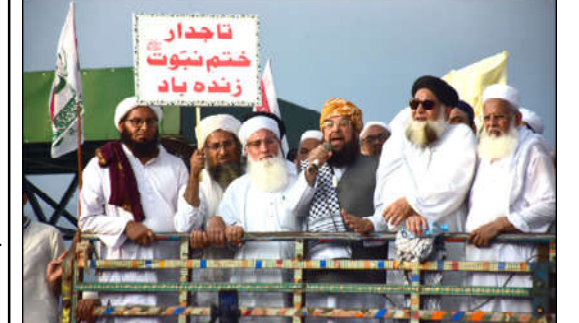
General Secretary Jamiat Ulama-i-Islam-Fazl (JUI-F) Maulana Abdul Ghafoor Haideri addressing during Aalimi Majlis Tahaffuz Khatm-e-Nubuwwat protesting in favor of their demands in front of Parliament house, in the Federal Capital.

RAWALPINDI (Online): PTI founder Imran Khan has said all the drama of arresting Gen (Retd) Faiz is being enacted to take him to military court. "Efforts are underway to make Gen (Retd) Faiz approve against me. They know all other cases against me have been discharged. Therefore, they want to take me to military court, he said this while talking to journalists in Adiala jail Monday. He held they want to get divulge some thing from Gen (Retd) Faiz. They will force Gen (Retd) Faiz to give some statement that May 9 was conspiracy. If Gen (Retd) Faiz issued order of my arrest and stole CCTV footage then arrest him. Whoever hatches conspiracy he does not demand for judicial commission. Regime change was done against us and I was put into jail. They are saying now Gen (Retd) was mastermind. Faiz got me arrested. They don't feel ashamed that they are saying Gen (Retd) Faiz issued directives to Bushra Bibi. They fear when Qazi Isa will be retired their theft will open. He held Gen (Retd) Bajwa had removed Gen (Retd) Faiz by striking a deal with Nawaz Sharif.