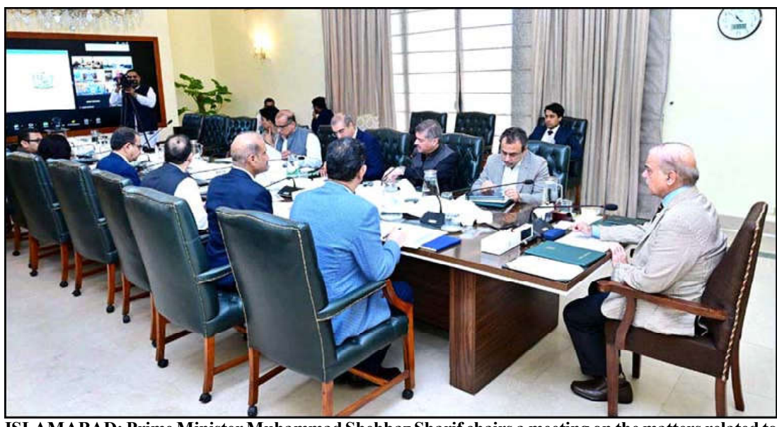
ISLAMABAD: Prime Minister Muhammad Shehbaz Sharif chairs a meeting on the matters related to

Vol. XIV No. 191 Reg. mails-B / ID-445 Monday August 19, 2024, Safar 12, 1446 A.H. Ph: 2158688, 2158997 Pages 4: Rs. 12