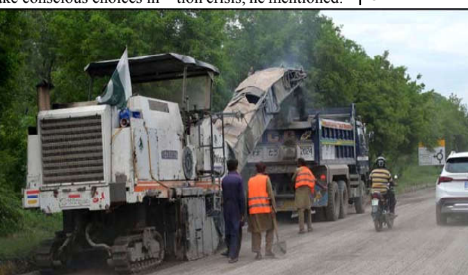
ISLAMABAD: Labourers busy repairing Bari Imam Road during repairing and development work in Federal Capital.