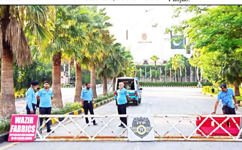
ISLAMABAD: Police personals stands alert in front of a local hotel due to security reason during Pakistan's and Bangladesh cricket team players living in hotel, As the first Test cricket match between Pakistan and Bangladesh on 21 August, at Rawalpindi Cricket Stadium.

to mention here that Salman Akram Raja had filed a repreme Court of Pakistan, seeking to make functional the Election Tribunal in