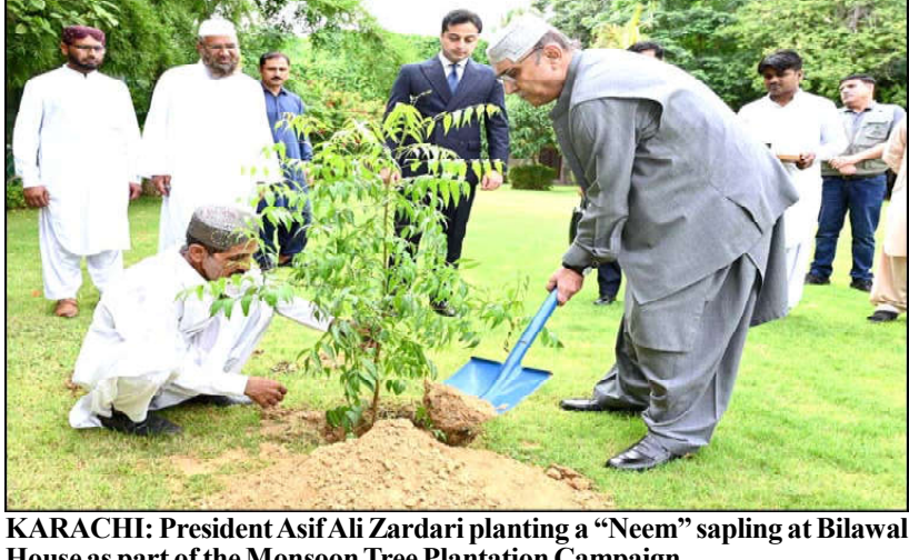
House as part of the Monsoon Tree Plantation Campaign.

Meanwhile Minister for Information, Broadcasting, Culture and National Heritage Attaullah Tarar on Sunday said the anti-state decisions made by the "Faiz-Niazi nexus" had been emerged as the "worst example" of the hostility towards the