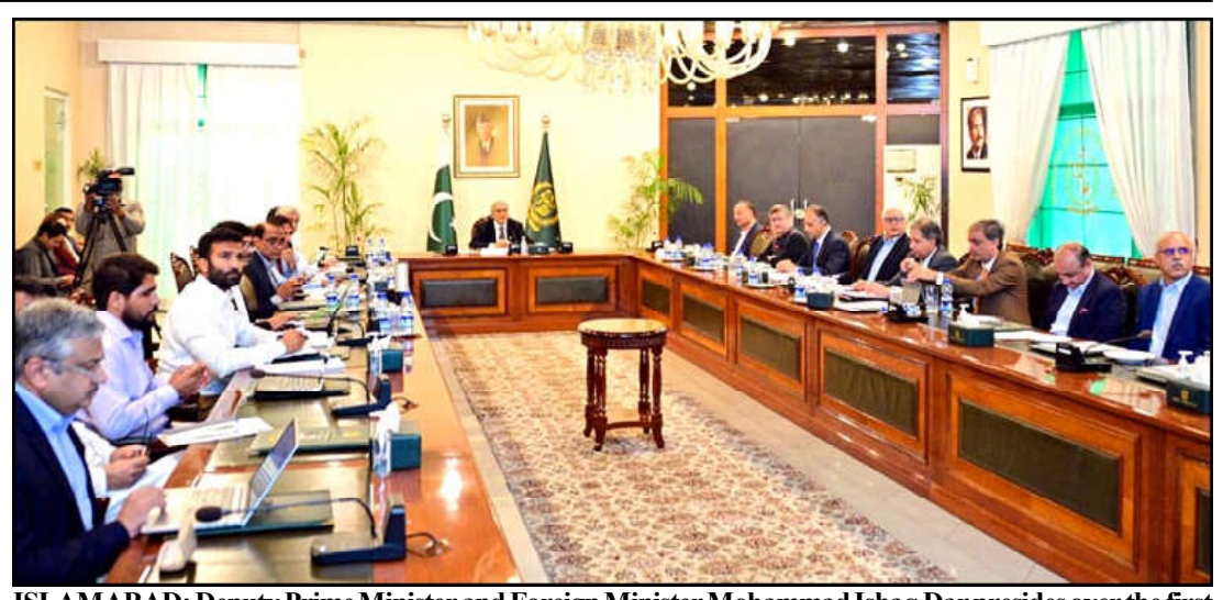
ISLAMABAD: Deputy Prime Minister and Foreign Minister Mohammad Ishaq Dar presides over the first meeting of a committee, formed to consider the issues faced by the petroleum sector's E&P companies.