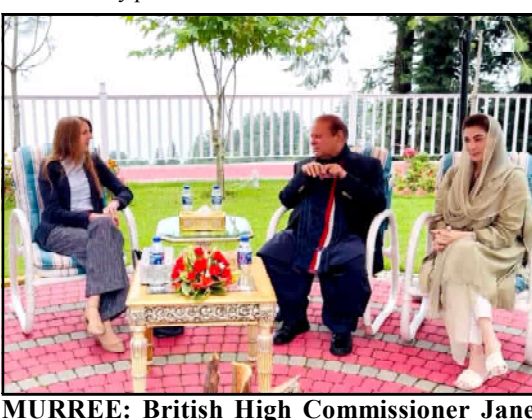
MURREE: British High Commissioner Jane Marriott meeting with Punjab Chief Minister Maryam Nawaz and PML-N President Nawaz Sharif

approaching completion. The chief minister appreciated participation of foreign, Commonwealth and development offices in education and other