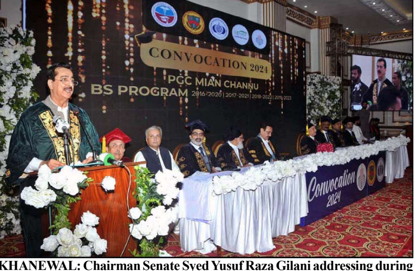
KHANEWAL: Chairman Senate Syed Yusuf Raza Gilani addressing during the Convocation of the Punjab College Mian Channu.