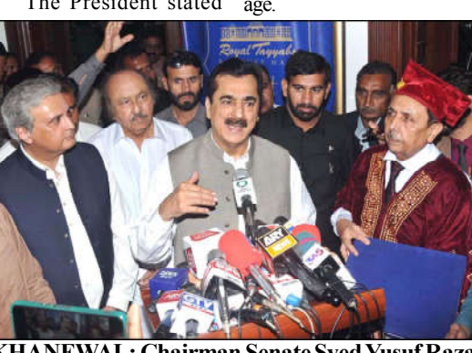
KHANEWAL: Chairman Senate Syed Yusuf Raza Gilani talking to media persons after the Convocation of the Punjab College Mian Channu.

The President said that all segments of society should actively participate in tree plantation campaigns to bring down the temperatures, increase greenery and forest cover-