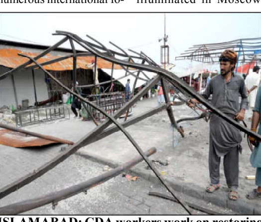
ISLAMABAD: CDA workers work on restoring stalls after the fire at H-9 weekly bazaar in the Federal Capital

"It underscores our strong friendship... It was truly heartening to see the colors of the Pakistani flag illuminated in Moscow.