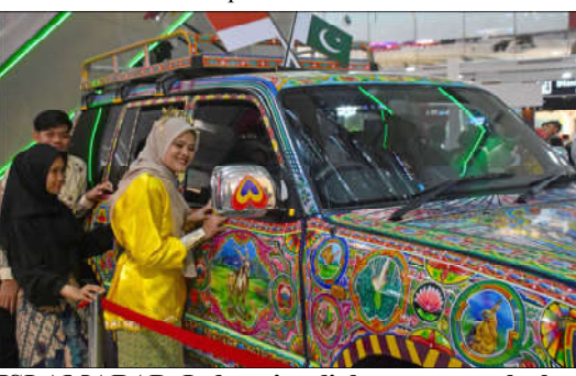
ISLAMABAD: Indonesian diplomat women looks a traditional truck art vehicle placed at a shopping mall during Indonesian Expo 2024, in the Federal Capital.

He assured that the laws will strike a balance between individual liberties and societal responsibilities, promoting a culture of respectful and constructive online discourse.