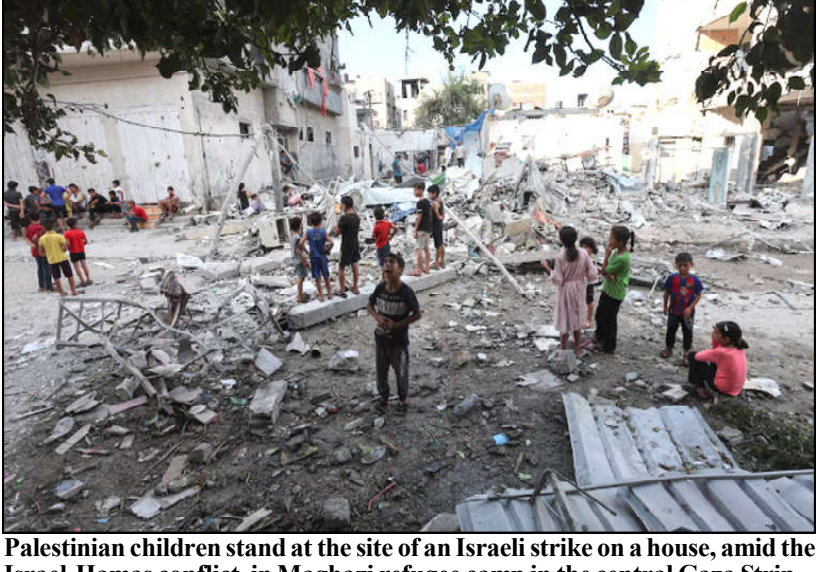
Israel-Hamas conflict, in Maghazi refugee camp in the central Gaza Strip.