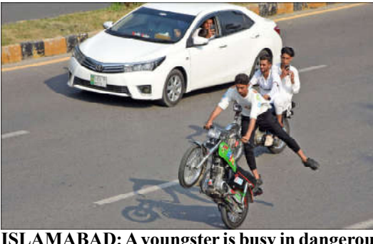
ISLAMABAD: A youngster is busy in dangerous and risky stunt at Islamabad Highway during Independence Day celebrations, in the Federal Capital.