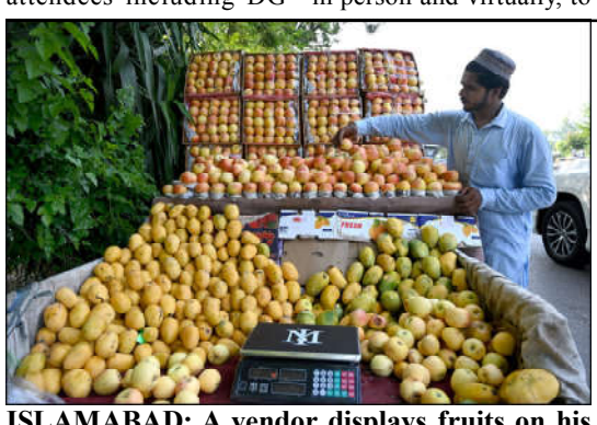
ISLAMABAD: A vendor displays fruits on his roadside setup to attract the customers at F-10 area.

divided into four groups, each presenting on various government departments.