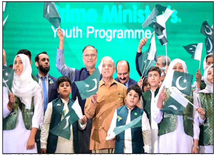
ISLAMABAD: Prime Minister Muhammad Shehbaz Sharif in a group photo with students on the International Youth Dav ceremony.

Vol. XIV No. 186 Reg. mails-B / ID-445 Tuesday August 13, 2024, Safar 07, 1446 A.H. Ph: 2158688, 2158997 Pages 4: Rs. 12