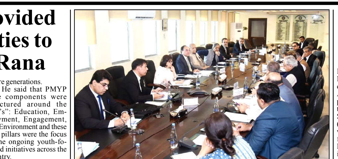
"Let us work together Federal Minister for Finance & Revenue Senator Muhammad Aurangzeb presiding over a meeting of the Cabinet Committee on State-Owned Enterprises (CCoSOEs) in Islamabad.

for all", he added. Rana Mashhood afship Program, National Innovation Award, setting up firmed his commitment that of the PM National Youth PMYP through various Council, PM National Volprograms, initiatives, and capacity-building trainings unteer Corps, PM Digital Youth Hub, PM Talent was equipping the younger generation with the tools Hunt, Youth Sports League, and knowledge required to PM Sports Academies, Green Energy Solarization overcome contemporary and PM Green Youth challenges and contribute to Movement to empower the the development goals.