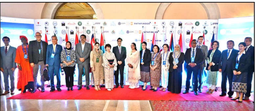
ISLAMABAD: Speaker National Assembly, Sardar Ayaz Sadiq in a group photograph with other guests at the inaugural session of the Asian Forum of Parliamentarians on Population and Development on 'Gender Empowerment and Green Economy'

and established women caucus, youth parliamentarians committee, and other parliamentary forums for inclusive engagement of all stakeholders in policy making initiatives, he 'The Parliament of Pakistan became the first public building for securing net metering license to promote green economy and renewables. The Speaker National Assembly's residence and the Parliament building were first converted over solar energy when there was no public