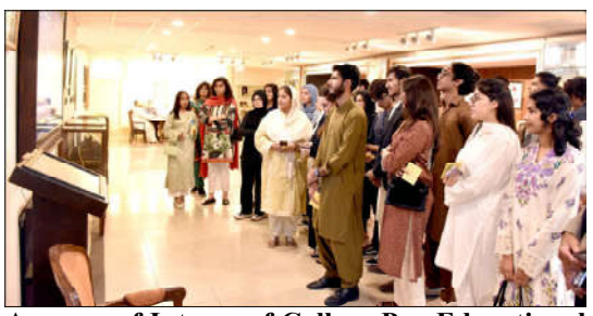
A group of interns of College Pro-Educational consultancy visiting Senate Museum at Parliament House, Islamabad.