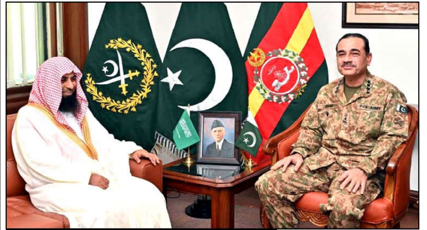
According to ISPR, during the meeting, matters of mutual interest were discussed.

RAWALPINDI (Online): Imam Masjid Al-Nabawi, Dr. Salah bin Mohammad Al-Budair called on Chief of Army Staff General Syed Asim Munir in Rawalpindi Friday.