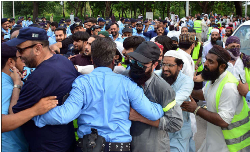
ISLAMABAD: Police personals try to stop activists of Sunni Ulema Council during protest in favor of their demands at Aabpara in the Federal Capital.

government's initiatives aimed at stimulating economic growth, creating jobs, and reducing poverty. Ahmad Sheikh stressed that the government is committed to taking all necessary measures to address the economic challenges, but the support and cooperation of the opposition are crucial in this regard. Sheikh's appeal for unity and cooperation is a testament to the government's commitment to putting the interests of the country above political considerations. Minister for Maritime Affairs also urged the media to play a positive role in portraying Pakistan's true face to the world, adding, the media has a significant influence on shaping public opinion and creating perceptions about the country.