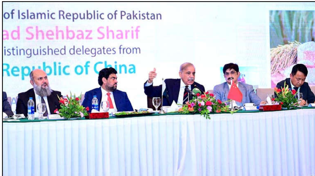
KARACHI: Prime Minister Muhammad Shehbaz Sharif addresses business delegates from the People's Republic of China.

Vol. XIV No. 184 Reg. mails-B/ID-445 Saturday August 10, 2024, Safar 04, 1446 A.H. Ph: 2158688, 2158997 Pages 4: Rs. 12