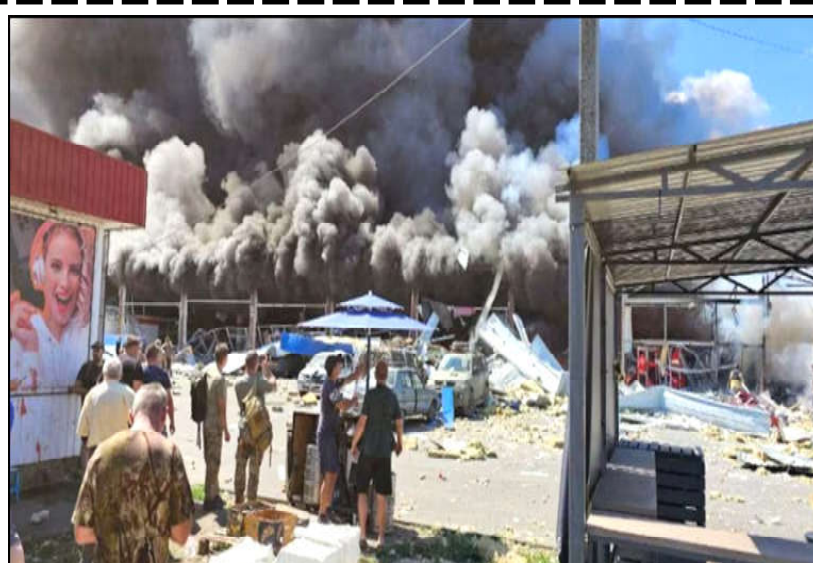
A view shows a supermarket heavily damaged in a Russian military strike, amid Russia's attack on Ukraine, in Kostiantynivka, Donetsk region, Ukraine.