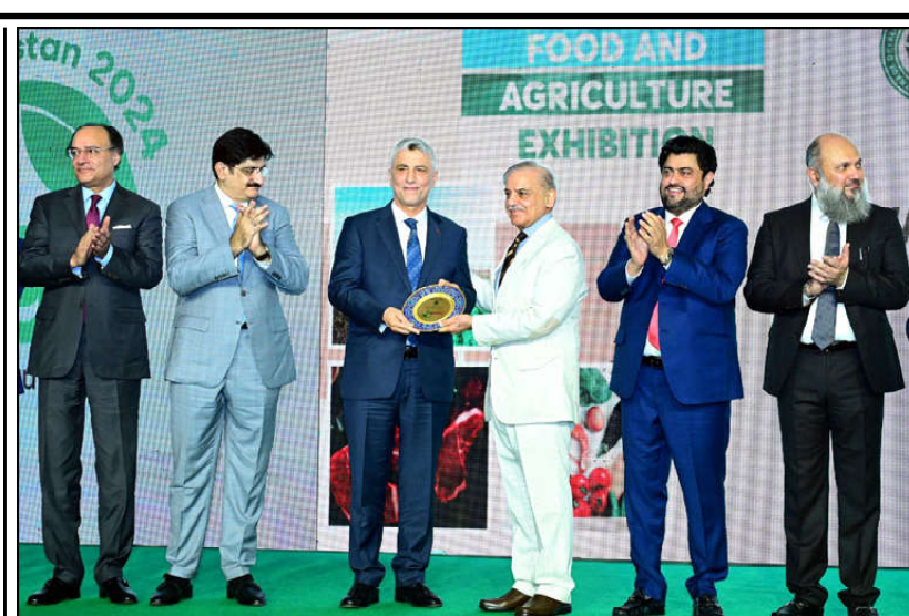
KARACHI: Prime Minister Muhammad Shehbaz Sharif presents a souvenir to the Minister of Trade of Türkiye Omar Bolat, at the 2nd International Food & Agriculture Exhibition, in the Provincial Capital.

Earlier, Prime Minister Shehbaz Sharif along with other dignitaries presented awards to top three exporters including rice, fruit and vegetable and meat sectors.