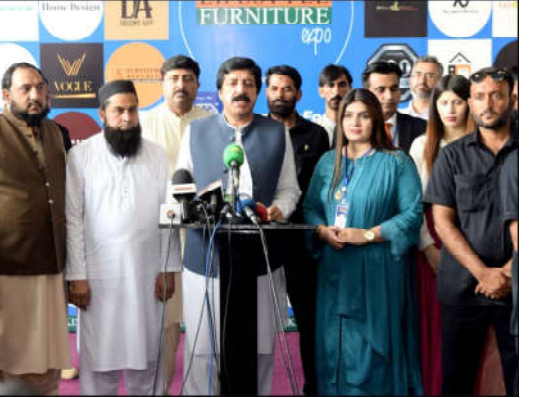
LAHORE: Punjab Governor Sardar Saleem Khan talking to media persons on the eve of inaugural ceremony of 100th Pakistan Lifestyle Furniture Expo.

ATTOCK (APP): Punjab Transport Minister, Bilal Akbar Khan on Friday announced a major upgrade to the province's transport system, vowing the purchase of 3,000 new buses to improve public transportation. During a visit to the Attock General Bus Stand, Minister Bilal Khan emphasized the government's commitment to providing quality travel experiences for passengers. He directed officials to enforce axle-load regulations, prohibit LPG cylinders in public transport and implement measures to reduce road accidents. Highlighting the government's broader efforts to improve public services, Minister Khan mentioned initiatives like providing free solar systems to households with electricity consumption below 200 units and offering subsidized tractors to farmers.