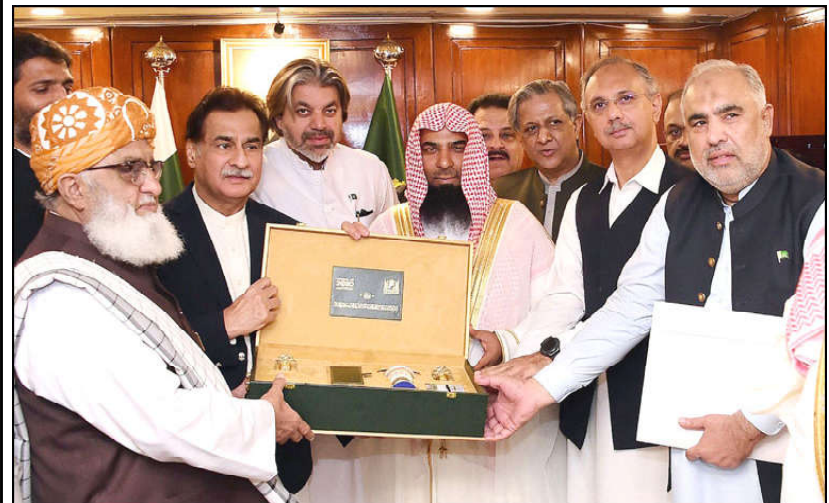
ISLAMABAD: Speaker National Assembly Sardar Ayaz Sadiq, along with other Parliamentarians present gift to Imam Masjid Al-Nabawi (S.A.W) Sheikh Dr Salah Mohammad MAI-Bdeer at Parliament House, in the Federal Capital.

Taking floor at opening of fifth meeting of eighth session of the National Assembly at the Parliament House, the Opposition Leader said the chief guest, Imam Masjid-e-Nabawi (PBUH) was the unique honour of being the Imam as he led the prayers.