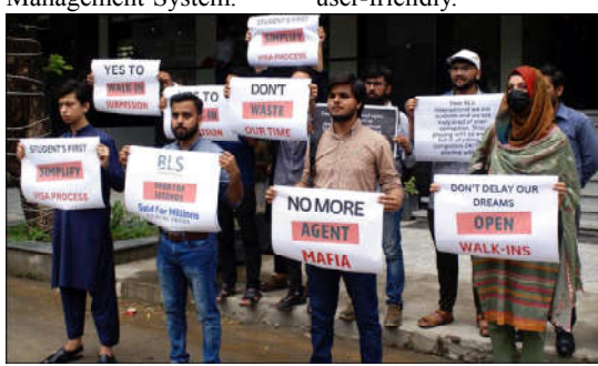
ISLAMABAD: Pakistani students are protesting against the blocking of visa applicants of the Indian company BLS European countries Italy.

The Secretary BISP emphasized the importance of an efficient complaint reporting mechanism and suggested the introduction of a simple complaint form specifically for BISP beneficiaries. He stressed that this would make the system more accessible and user-friendly.