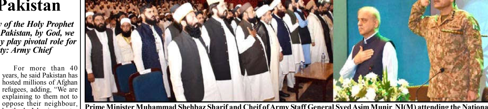
Prime Minister Muhammad Shehbaz Sharif and Cheif of Army Staff General Syed Asim Munir NI(M) attending the National Ulema & Mashaikh Conference in Islamabad.

Property, children, estates may also be temptation or strife if it diverse you from justice; and the sword for injustice will be a strife including the slogan of Takbeer.'