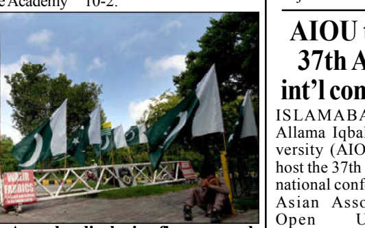
ISLAMABAD: A vendor displaying flags on roadside at Jinnah Super to mark the 78th Independence Day celebrations.

Shaheed Road after the heavy monsoon rain in the