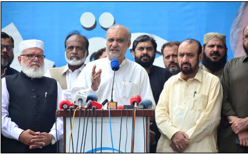
RAWALPINDI: Ameer JI Hafiz Naeem-ur-Rehman giving a press conference at Liaquat Bagh in the city.

Lahore High Court (LHC) on Thursday criticized the government for its disparate treatment with political parties, specifically pointing out differences in its approach towards Pakistan Tehreeke-Insaf (PTI) and Jamaat-e-Islami (JI).During a hearing on PTI's request for permission to hold a rally in Lahore, Justice Ali Baqar Najafi questioned the government's policy on political activities,