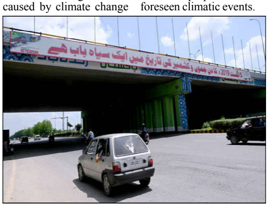
ISLAMAAD: A large banner hangs over the Zero Point Bridge in Federal Capital, observing a commemorating 5 August 2019 as a Black Day in the history of Jammu and Kashmir.

She introduced the Hybrid Social Protection Scheme, designed to promote savings culture among beneficiaries, ensuring they are better prepared for unforeseen climatic events.