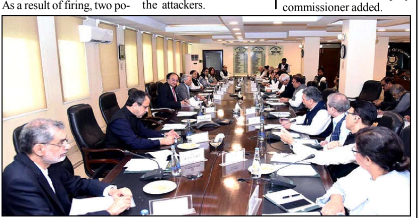
ISLAMABAD: Federal Minister for Finance & Revenue Senator Muhammad Aurangzeb presiding over a meeting of Economic Coordination Committee (ECC).

"The ministry vowed to open all the roads for traffic and remove obstacles from the roads," the deputy commissioner added.