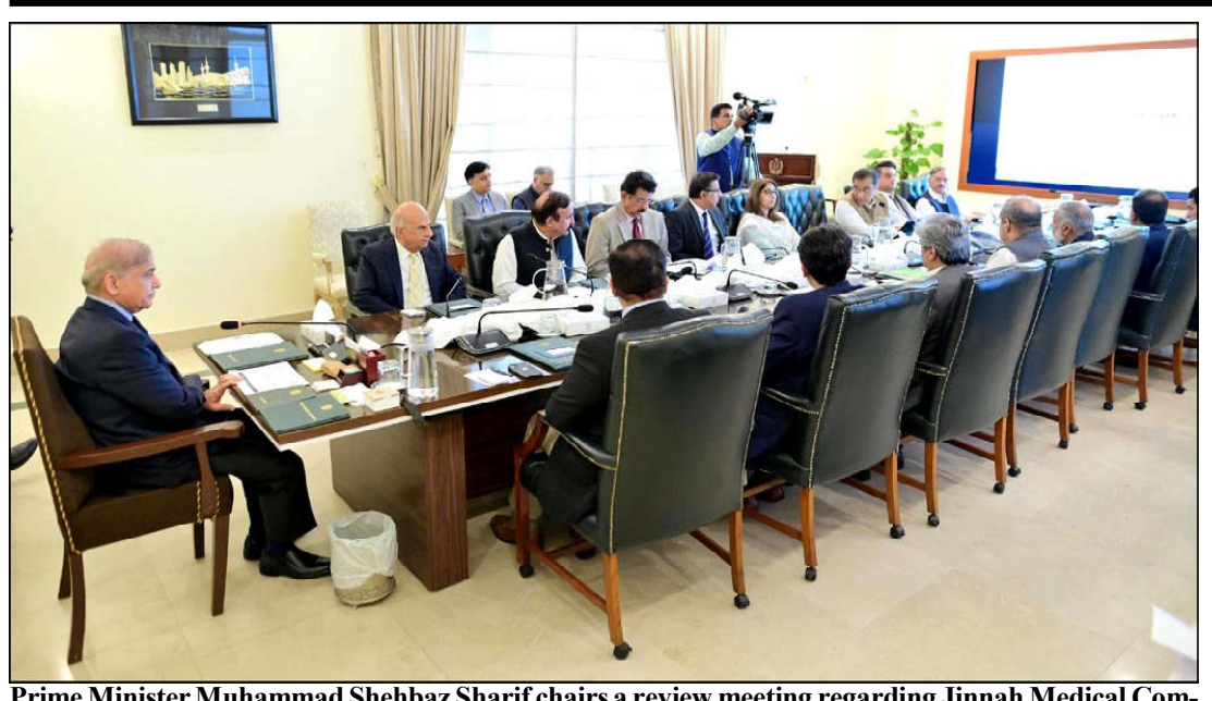
Prime Minister Muhammad Shehbaz Sharif chairs a review meeting regarding Jinnah Medical Com-