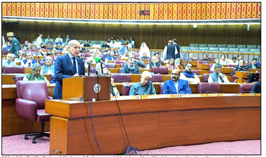
ISLAMABAD: Prime Minister Muhammad Shehbaz Sharif addressing National Assembly Session on

Vol. XIV No. 178 Reg. mails-B / ID-445 Saturday August 03, 2024, Muharram 27, 1446 A.H. Ph: 2158688, 2158997 Pages 4: Rs. 12