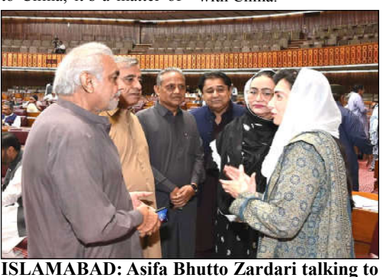
MNAs during national assembly session at parliament house.

The process can help a country to mitigate the currency risk that often exacerbates sustainability issues. The prime minister also lauded the friendly ties to China, it's a matter of with China.