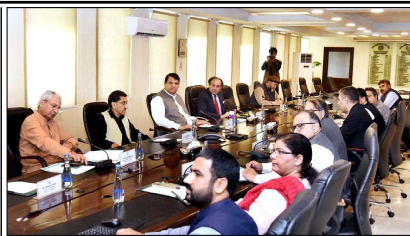
ISLAMABAD: Federal Minister for Finance & Revenue Senator Muhammad Aurangzeb chairing a meeting of the Committee on the issues of Gilgit-Baltistan.

A total of nine ships were engaged at PQA berths during the last 24 hours, out of them Gas carrier 'Epic Sunter' left the port on today morning while three more ships, Apollon-D, Endeavour and Sea Luck-III are expected to sail on today afternoon. Cargo volume of 122,590 tonnes, comprising 62,651 tonnes imports cargo and 59,939 tonnes export cargo carried in 2,470 Containers (980 TEUs Imports & 1,490 TEUs Export) was handled at the port during last 24 hours.