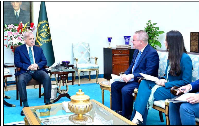
ISLAMABAD: A delegation of Asia Internet Coalition calls on Prime Minister Muhammad Shehbaz Sharif.

The bill is now set to be presented to the National Assembly for final approval on Friday.