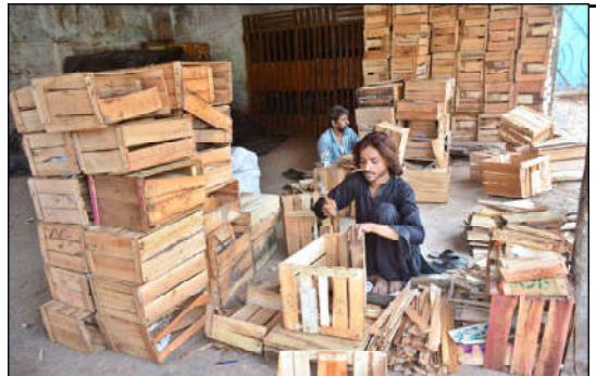
HYDERABAD: Labourers busy in preparing the wooden boxes at his workplace.

He said that the Pakistani rupee also stabilized, and things are moving in a positive direction. Although it was challenging to stabilize the exchange rate, we've successfully achieved it.