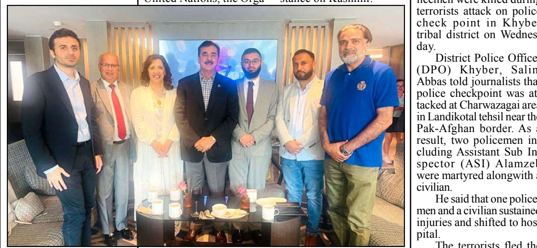
Chairman Senate Syed Yousaf Raza Gilani while leading a delegation of the members of Senate held a meeting with UK based representatives of Jammu & Kashmir Self Determination Movement, International Lobby on Kashmir and International Students Society based in UK in London

the issue. According to NEPRA's instructions, bills charged on an estimated basis due to lower-than-scheduled readings from April 2024 to June 2024 will be adjusted to reflect actual recorded units. Consumers unable to pay bills based on estimated readings will not incur late payment surcharges, and those who have paid such surcharges will receive adjustments.