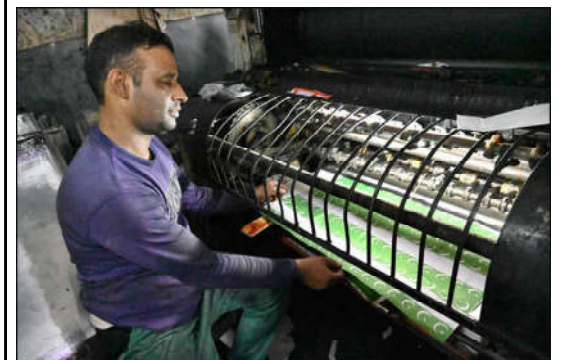
LAHORE: Paper flags of Pakistan are being printed at the printing press in preparation for Independence Day celebrations.