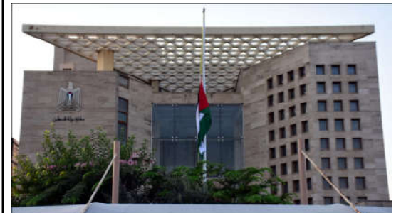
ISLAMABAD: Embassy of Palestine in Islamabad hoisted the flag at half-mast to mourn the martyrdom of head of the Hamas movement, senior leader Ismail Haniyeh.

ISLAMABAD (APP): Minister for Law and Justice Azam Nazeer Tarar on Wednesday chaired the first meeting of the committee formed to give recommendations for independent drug pricing in the country. Under the directions of the prime minister, a committee has been constituted to address drug pricing in Pakistan, said a press release. The meeting was attended by relevant stakeholders who presented an overview of the operations of independent price authorities and their functions worldwide, highlighting best practices. The committee deliberated on the best model for Pakistan, considering various viewpoints from all stakeholders. It was decided that a detailed working paper will be prepared for the next meeting. This paper will identify the current issues related to the pharmaceutical industry,