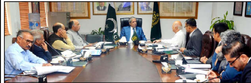
ISLAMABAD: Federal Minister for Law and Justice, Senator Azam Nazeer Tarar chaired first meeting of the Committee to give recommendations for independent Drug Pricing Body.

ISLAMABAD (APP): Iran Embassy on Wednesday paid tribute to Madr-e-Millat, Mohtarama Fatima Jinnah, on her 131st birth anniversary. The embassy, in a statement, termed her character fully inspiring as a woman and leader. It quoted Fatima Jinnah as saying: "People of Pakistan are by nature devoted to the cause of peace and goodwill."