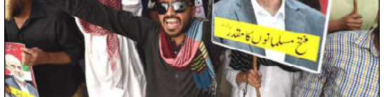
KARACHI: Karachi Jamat e Islami hold protest against Israel Government after killing of Hamas political chief Ismail Haniyeh in Tehran.