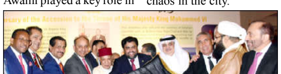
ISLAMABAD: Federal Minister for Petroleum Mussadaq Malik, Governor Sindh Kamran Tesuri, Ambassador of the Kingdom of Morocco Mohamed Karmoune and others cutting cake to celebrate the Fifth Anniversary of the Accession to the throne of His Majesty of the Kingdom of Morocco at a local hotel in the Federal Capital.

He clarified that Mehrang Baloch has not been harmed in any way, and the rumors spreading are baseless and false. The Deputy Commissioner termed the news circulating on social media, WhatsApp groups, and other platforms as propaganda aimed at creating chaos in the city.