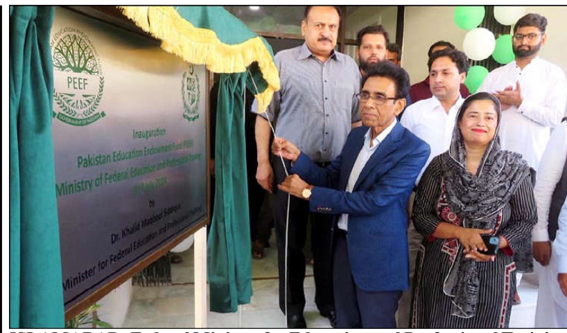
ISLAMABAD: Federal Minister for Education and Professional Training, Dr. Khalid Maqbool Siddiqui inaugurated a new building for the Pakistan Education Endowment Fund (PEEF).

youth through various initiatives and programmes. She said that the recipients of the Young Entrepreneurs Awards need to transform themselves in the context of a rapidly changing world through the emerging multi-billion dollar market of artificial intelligence. Speaking on the occasion, Rana Mashood Ahmad Khan thanked the Commonwealth Secretary General Patricia Scotland for her maiden visit to Pakistan for strengthening the relations of Pakistan with the Commonwealth. He said that Pakistan's ranked as 3rd in the employment and opportunity category of the global Youth Development Index by the Commonwealth is a testament to the incredible potential and resilience of our young entrepreneurs. This achievement is not merely a statistic but a reflection Prime Minister Shehbaz Sharif's vision. Under the Prime Minister's Youth Loan and Agricultural Scheme, started in 2013, as many as 186 billion had been distributed among more than two lakh eighty thousand young entrepreneurs, creating countless employment opportunities across the nation.