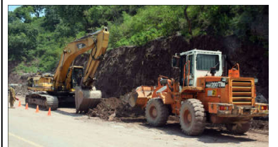
MUZAFFRABAD: Labourers are busy in construction work with the help of heavy machinery alongside a road in the city.