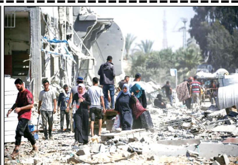
Palestinians carry their belongings salvaged from the debris following Israeli strikes in eastern Deir Al Balah, central Gaza Strip.

He said the campaign would start in central Gaza with a three-day pause in fighting, then move to southern Gaza, where there would be another three-day pause, followed by northern Gaza.