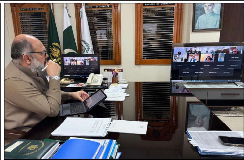
Federal Minister for Commerce Jam Kamal Khan holding a virtual meeting with the Sectoral Council for Engineering, highlighting the need for strategic reforms and government support to elevate Pakistan's engineering industry to compete globally Islamabad.

ISLAMABAD (APP): The Federal Minister for Commerce Jam Kamal Khan holding a virtual meeting with the Sectoral Council for Engineering, highlighting the need for strategic reforms and government support to elevate Pakistan's engineering industry to compete globally Islamabad.