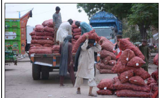
FAISALABAD: Daily wages laborers unload sacks of potatoes from a delivery truck at a bustling vegetable market.

A cornerstone of this partnership is the establishment of a dedicated PSQCA Information Desk at LCCI. This desk will serve as a one-stop resource center where businesses, entrepreneurs and traders can seek guidance on standards, regulations and best practices. The Information Desk will be staffed by nominated officials from PSQCA to provide expert advice and assistance. Kashif Anwar highlighted the importance of this initiative stating that this MoU is more than just a formal agreement; it is a strategic alliance aimed at empowering our members with the knowledge and resources they need to meet global standards.