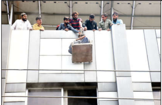
LAHORE: Employees of a local hotel rescue customer during fire in hotel at Australia Chowk in the Provincial Capital.