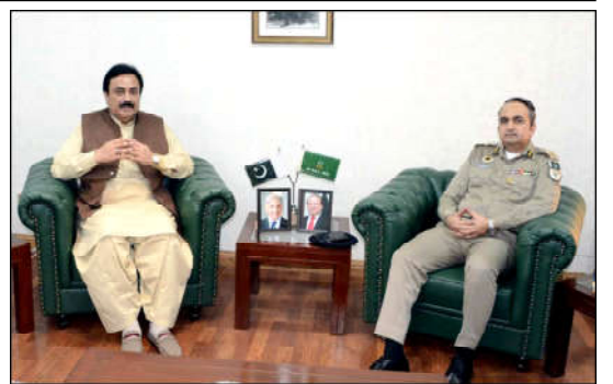
ISLAMABAD: Deputy Chairman Senate Syedaal Khan in a meeting with Inspector General National Highways & Motorway Police (NHMP) Salman Chaudhry at Parliament House.

She expressed these views while briefing to media regarding situation Hub Dam. She said that the recent monsoon rains in Sindh and Balochistan has significantly increased the water level in the Hub Dam. The DC said that the reason for the increase in the reservoir water level of the dam was heavy rains in the catchments areas of the district Hub and Khuzdar of Balochistan and the catchments areas of the dam.