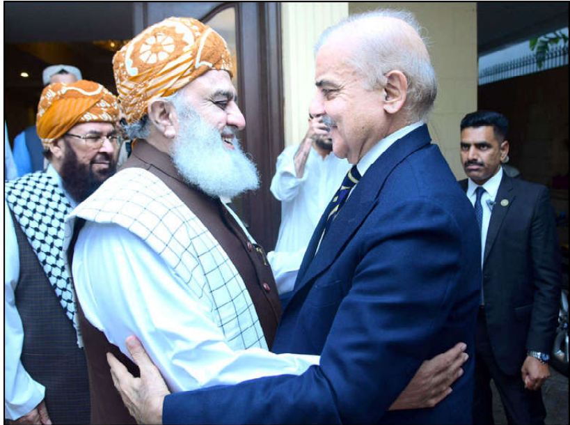
ISLAMABAD: Prime Minister Muhammad Shehbaz Sharif meets the President of Jamiat Ulema-e-Islam (F) Maulana Fazal ur Rehman, in the Federal Capital.

Ph: 2841470/2841473 Vol: XIX No. 189, Safar 25, 1446 AH Saturday August 31, Pages 04, Price Rs.15