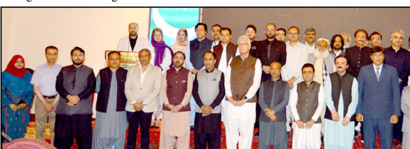
QUETTA: A group photo of participants of policy workshop organized in joint collaboration of Balochistan Health Card Programme and German Development Cooperation GIZ

He mentioned that the people of the province can get free treatment in more than 1200 hospitals of the country.