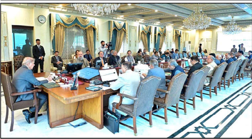
ISLAMABAD: Prime Minister Muhammad Shehbaz Sharif chairs a meeting of the Federal Cabinet.