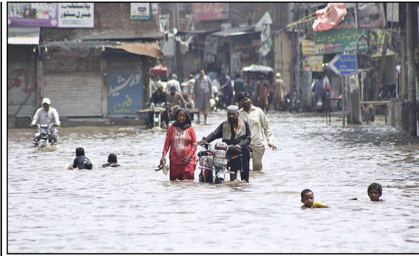
MULTAN: People navigate flooded Khuni Burj Road after heavy monsoon rain in the city.

Out of these, 407 people with serious injuries were shifted to different hospitals, while 580 victims with minor injuries were treated at the incident site by Rescue Medical Teams thus reducing the burden of hospitals.