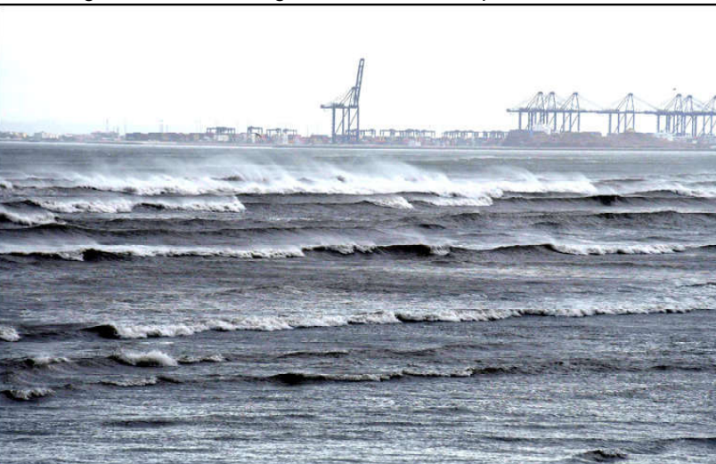
KARACHI: A view of sea waves seen from a residential apartment, following reports from the Pakistan Meteorological Department of a potential cyclonic storm that could develop over the Arabian Sea, at Clifton Beach, in the city.

Federal Interior Minister Mohsin Naqvi paid tribute to the security forces for the successful intelligence-based operation in Panjgur and Zhob on Friday.