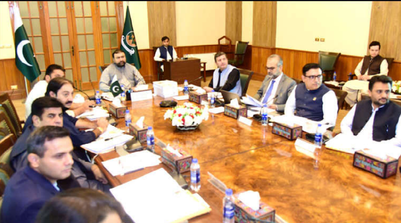
QUETTA: Chief Minister Balochistan Mir Sarfraz Ahmed Bugti presiding over meeting of Disaster Management Commission

The Chairman NHA assured the Governor that we would provide good news to the people about construction of Zhob bypass very soon.