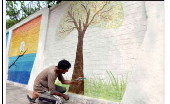
LAHORE: An artist painting a motivational wall mural on the Government Kinnaird High School wall to capturing the students' attention.

The Rescue operation has been completed and debris removed after retrieving the bodies.