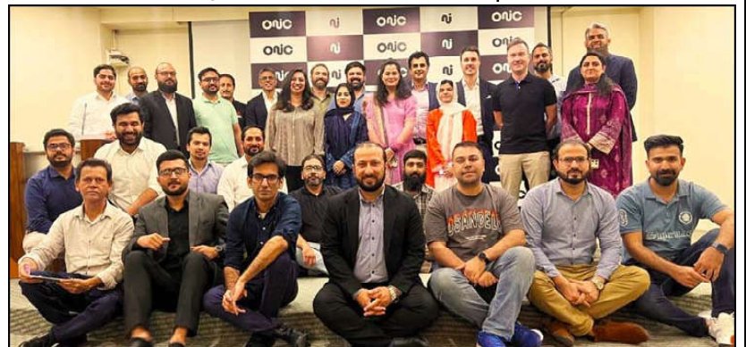
Team ONIC comes together for a group photo to mark the First anniversary of digital Telco.

11.1 percent on Year-on-Year basis in July 2024 as compared to 12.6 percent in previous month, and 28.3 percent in July 2023. On a month-on-month (M-o-M) basis, it increased by 2.1 percent in July 2024 compared to an increase of 0.5 percent in the previous month. The government managed to reduce the fiscal deficit to 6.8% of GDP in FY2024, down from 7.8% last year. The primary balance showed a surplus of 0.9% of GDP, in contrast to a deficit of 1.0% of GDP in FY2023.