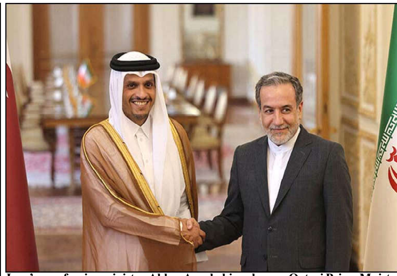
Iran's new foreign minister, Abbas Araghchi, welcomes Qatari Prime Minister Sheikh Mohammed bin Abdulrahman al-Thani ahead of their meeting in Tehran.

The war began when Hamas-led militants stormed into southern Israel on Oct. 7, killing some 1,200 people, mostly civilians, and abducting around 250 people.