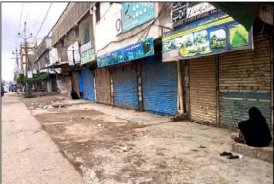
HUB: View of business activities seen shutdown due to strike called by Business Community against rising sales and advance taxes, inflated electricity bills and the FBRs fixed tax policy, in Hub.

Independent Report QUETTA: The Minister for Irrigation, Government of Balochistan, Mir Muhammad Sadiq Umrani, visited the Omerli Dam located in the Çekmeköy district of Istanbul Province, accompanied by senior officials. The dam, which was constructed based on the principles of integrated water resources management, features upstream watershed management, significant water storage capacity, and downstream irrigation to support agricultural activities. During the visit, Minister Umrani proposed replicating this strategic approach in Balochistan. Although the irrigation department is already implementing integrated water resources management in several projects, the Minister emphasized the need for further improvements. He suggested adopting the Omerli Dam as a model for future irrigation initiatives in Balochistan to enhance the efficiency and effectiveness of water management in the region. Although the irrigation department is already implementing integrated water resources management in several projects, the Minister emphasized the need for further improvements.