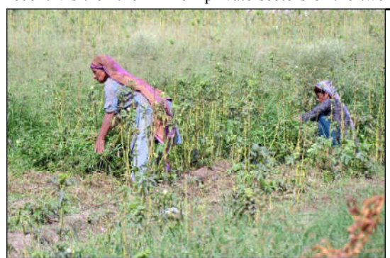
MULTAN: Farmer women busy in cutting grass in the field for their animals.