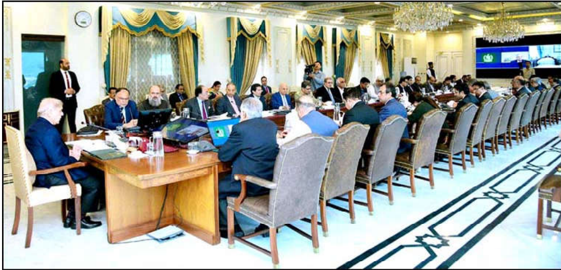
ISLAMABAD: Prime Minister Muhammad Shehbaz Sharif chairs a review meeting regarding economic growth and investment.

Ph: 2841470/2841473 Vol: XIX No. 185, Safar 23, 1446 AH Thursday August 29, Pages 04, Price Rs.15