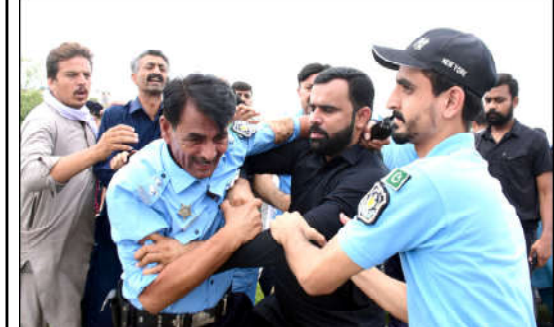
ISLAMABAD: Employees of PWD scuffle with the police during a sit-in protest (Dharna) in favor of their demands at Srinagar Highway in the Federal Capital.