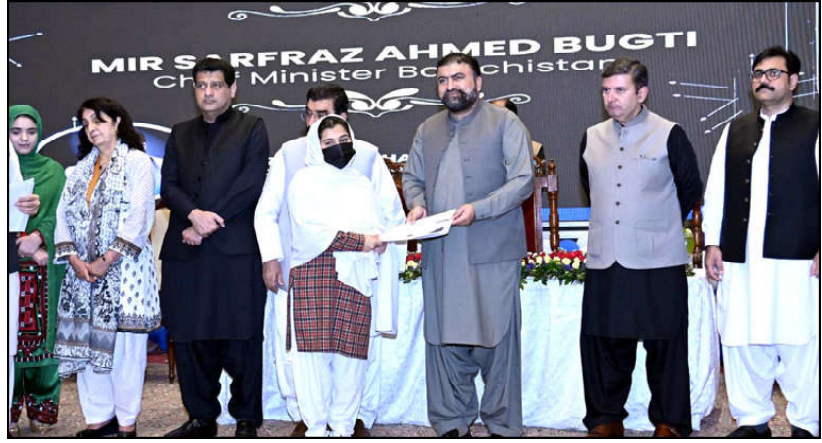
QUETTA: Chief Minister Balochistan Mir Sarfraz Ahmed Bugti distributing cheques of scholarships through Balochistan Education Endowment Fund (BEEF) under Shaheed Benazir Bhutto Scholarship Program