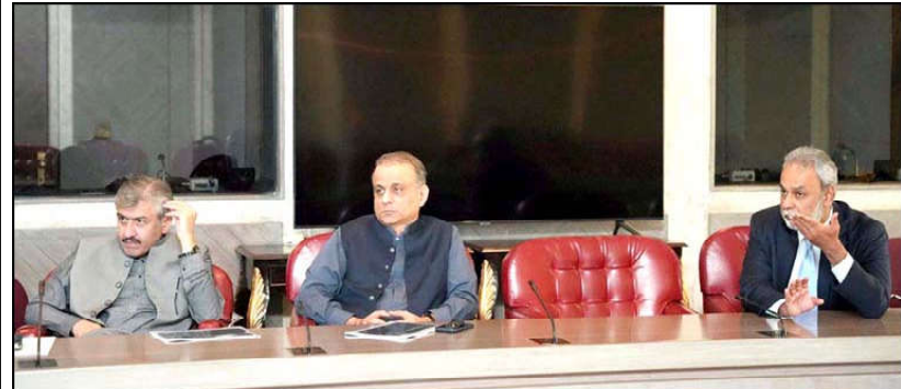
ISLAMABAD: Federal Minister for Communications, Privatization and Board of Investment Abdul Aleem Khan being briefed by Chairman National Highway Authority in the departmental briefing of National Highway Authority.