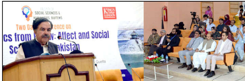
QUETTA: Governor Balochistan Sheikh Jaffar Khan Mandokhail addressing the participants of two-days workshop regarding Geo Politics held in BUITEMS with cooperation of King College London