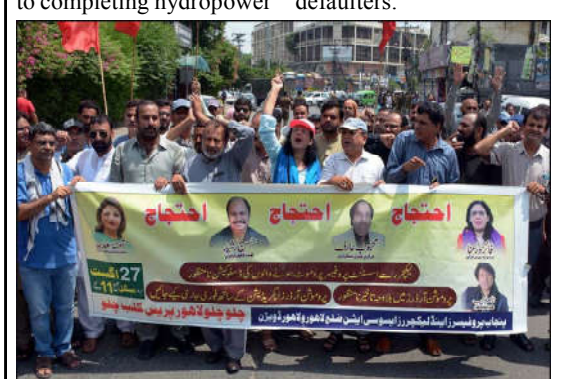
LAHORE: Members of Professors and Lecturers Association are holding protest demonstration for acceptance of their demands, at Lahore press club.

He stressed that the benefits of allocated funds should reach the community. The prime minister reaffirmed the government's commitment to completing hydropower projects in AJK.