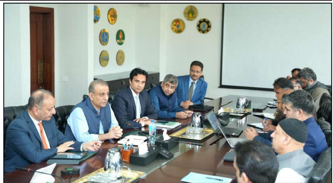
Chairman Prime Minister's Steering Committee on Gem & Stones and Federal Minister for Privatization, Board of Investment and Communications, Abdul Aleem Khan presided over a meeting in Islamabad.

investors and taking necessary steps to remove obstacles hindering foreign investment, ensuring a conducive environment for trade and investment. He directed the relevant authorities to complete and submit a framework for the transfer of Chinese industries to Pakistan within a week, outlining the standards and outcomes required for the quality and success of industrial sectors.