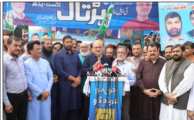
LAHORE: Ameer Jamaat-e-Islami Hafiz Naeem-ur-Rehman talking to media persons along with Traders Organization regarding countrywide shutter down strike during his visit to protest camp.

MULTAN (APP): Two persons of the same family were killed and three others sustained injuries in a traffic accident that occurred near Kheera Chowk area of Multan, tv channels reporting Rescue sources quoted on Tuesday. According to details, a rashly driven bus hit the two wheeler near Kheera chowk area.