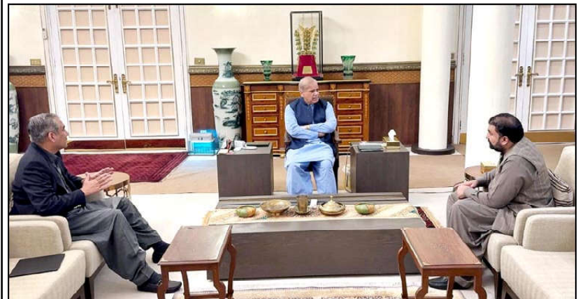
ISLAMABAD: Federal Minister for Interior Syed Mohsin Raza Naqvi and Chief Minister Balochistan Sarfraz Bugti call on Prime Minister Muhammad Shehbaz Sharif.

Besides the meeting also decided to increase staff and facilities in order to resolve the issues of passports in Chaman.