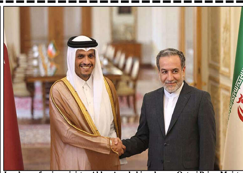
Iran's new foreign minister, Abbas Araghchi, welcomes Qatari Prime Minister Sheikh Mohammed bin Abdulrahman al-Thani ahead of their meeting in Tehran.

But the military rarely comments on individual strikes, which often kill women and children. Gaza's Health Ministry says Israel's offensive has killed over 40,000 people in Gaza. The war began when Hamas-led militants stormed into southern Israel on Oct. 7, killing some 1,200 people, mostly civilians, and abducting around 250 people.