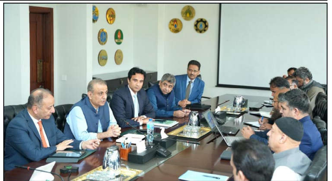
Chairman Prime Minister's Steering Committee on Gem & Stones and Federal Minister for Privatization, Board of Investment and Communications, Abdul Aleem Khan presided over a meeting in Islamabad.

He directed the relevant authorities to complete and submit a framework for the transfer of Chinese industries to Pakistan within a week, outlining the standards and outcomes required for the quality and success of industrial sectors.