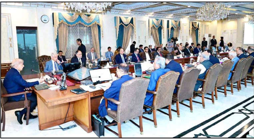
ISLAMABAD: Prime Minister Muhammad Shehbaz Sharif chairs a meeting of the Federal Cabinet.