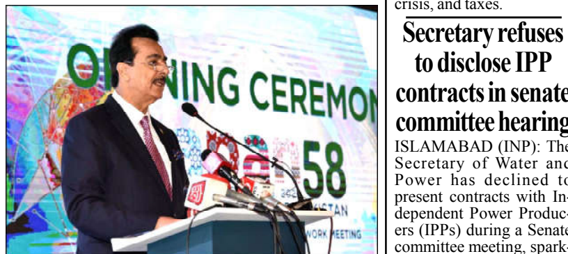
ISLAMABAD: Chairman Senate, Syed Yousuf Raza Gilani addresses during the inaugural ceremony as chief guest of 58th Asia Pacific Advanced Network (APAN) Meeting held in Islamabad.

Independent Report GWADAR: The All Parties Alliance Gwadar has expressed concern over the prolonged electricity crisis in the region, stating that the government has failed to provide electricity to the people. The alliance criticized the government for its inability to address the issue, despite claims of progress. They argued that the people of Gwadar are being collectively punished and that the government's promises have proven to be false. The alliance demanded that the government provide electricity from the national grid, citing the presence of power generation projects in the region. However, KESC officials expressed helplessness, citing the long transmission line as a major obstacle. The All Parties Alliance Gwadar has appealed to the assembly members from Makran to take responsibility and raise their voice against the electricity crisis. The meeting was attended by representatives from various parties, who expressed their concerns and demands for resolving the issue.