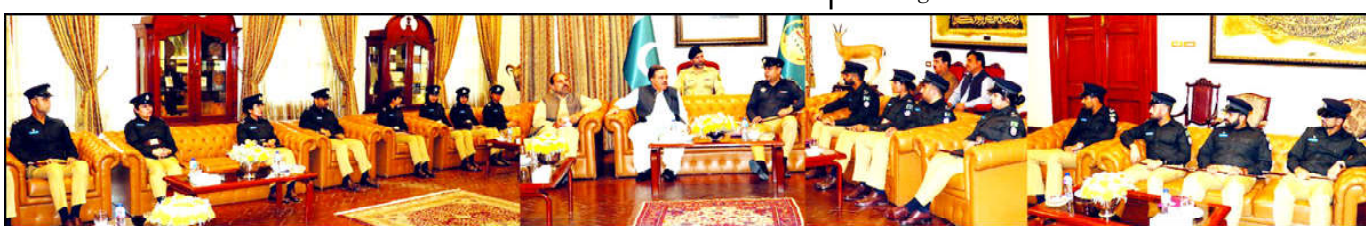
QUETTA: Under trainee officers of Police Service of Pakistan (PSP) of National Police Academy Islamabad meeting with Governor Balochistan, Sheikh Jaffar Khan Mandokhail

gravity of the situation into account, Washington strongly regretted the deaths of law enforcers and civilians in Balochistan's Musakhail and other areas. "Our hearts go out to the families and loved ones of those killed in yesterday's attacks. The United States will continue to stand shoulder-to-shoulder with Pakistan in its fight against terrorism," the US embassy in Islamabad wrote on its official X account.