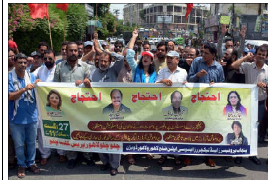
LAHORE: Members of Professors and Lecturers Association are holding protest demonstration for acceptance of their demands, at Lahore press club.

He stressed that the benefits of allocated funds should reach the community. The prime minister reaffirmed the government's commitment to completing hydropower