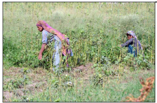
MULTAN: Farmer women busy in cutting grass in the field for their animals.