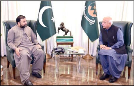
QUETTA: President National Party, MPA Dr. Abdul Malik Baloch meeting with Chief Minister Balochistan Mir Sarfaraz Bugti