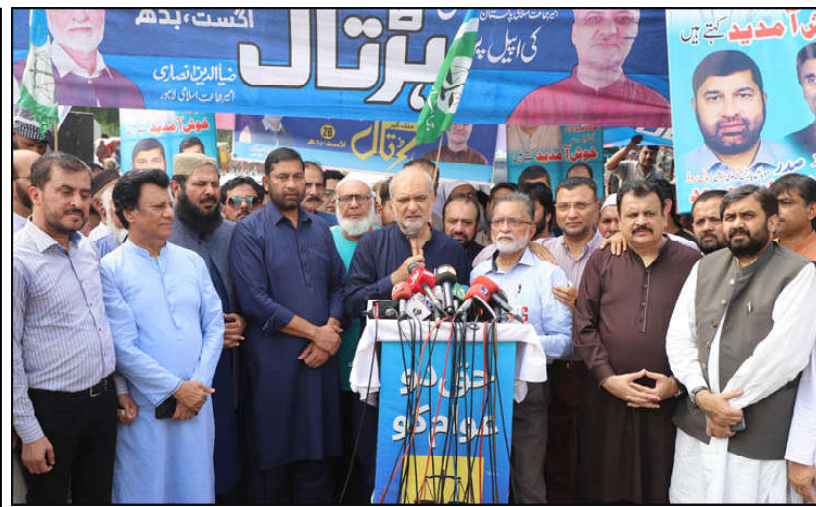
LAHORE: Ameer Jamaat-e-Islami Hafiz Naeem-ur-Rehman talking to media persons along with Traders Organization regarding countrywide shutter down strike during his visit to protest camp.