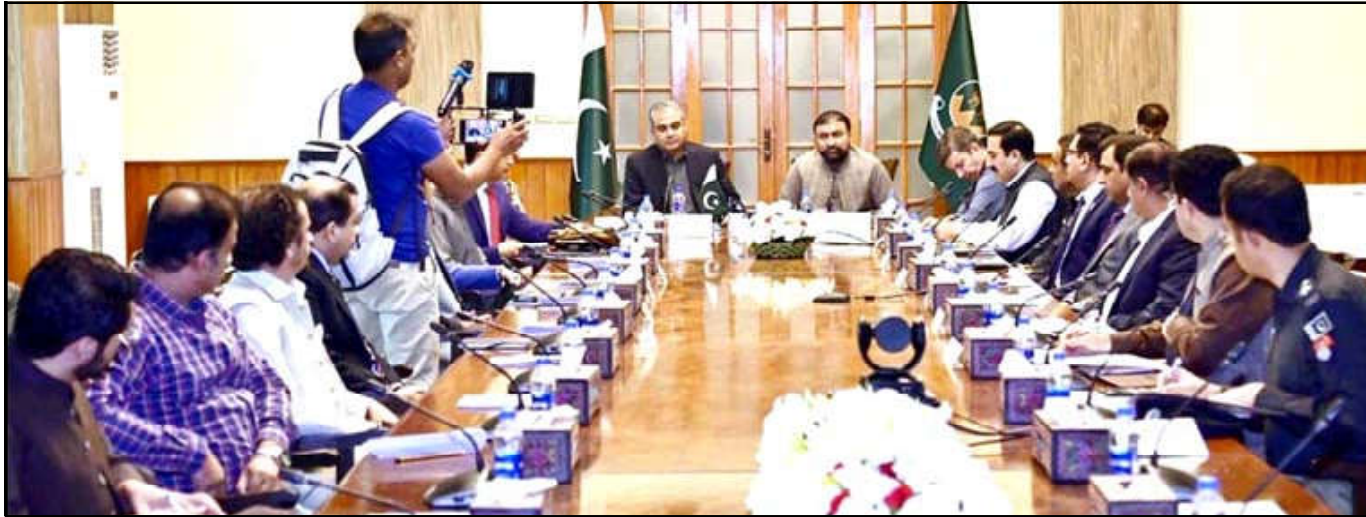
QUETTA: Federal Minister for Interior Mohsin Naqvi along with Chief Minister Balochistan Sarfraz Ahmad Bugti chairing an important law and order meeting.

Ph: 2841470/2841473 Vol: XIX No. 184, Safar 22, 1446 AH Wednesday August 28, Pages 04, Price Rs. 15