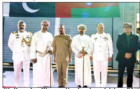
Civil and military dignitaries visiting PNS YARMOOK at Muscat, Oman.

ISLAMABAD (APP): Leader of Opposition in Senate, Shibli Faraz on Tuesday demanded the government of a briefing over the prevailing law and order situation in Balochistan in the wake of recent terror incidents. The 342nd Senate session commenced with Deputy Chairman, Senate, Syed Aza Khan Nasir in chair as the House offered fataha for the deceased who lost their lives in Balochistan incidents. Senator Kamran Murtaza of Jamiat Ulema-e-Islam Pakistan (JUIP) led the prayer. Senator Shibli Faraz said the situation in Balochistan needed to be addressed through effective measures and the government should take the House into confidence on the matter. He emphasized the need for conducive environment in the province to attract investments, and improve stability. The Opposition Leader also regretted the delay in production orders of the detained Senator Ejaz Chaudhry of Pakistan Tehreek-e-Insaf. He demanded the government to probe the incidents and address the issues of Balochistan on priority. Minister for Law and Justice and Parliamentary Affairs, Senator Azam Nazeer Tarar said during the previous regime, selective use of production orders' law was employed. However, he said, Senator Ejaz Chaudhry was arrested in many cases registered under criminal procedure laws and under judicial custody as per the court orders.