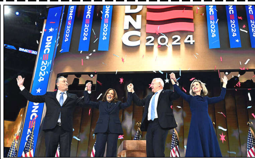
US Second Gentleman Douglas Emhoff, US 2024 Democratic presidential candidate Kamala Harris, Minnesota Governor and 2024 Democratic vice presidential candidate Tim Walz and Tim Walz's wife Gwen Walz hold hands at the end of the fourth and last day of the DNC at the United Center in Chicago, Illinois.