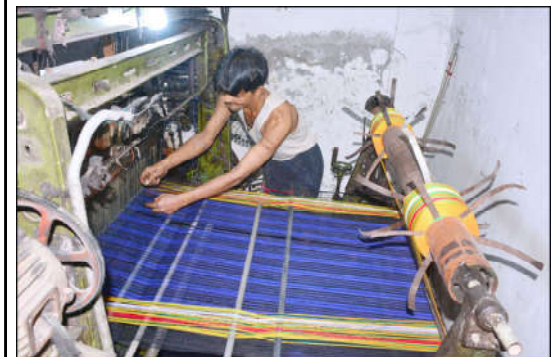
HYDERABAD: A worker is busy operating a power loom to prepare cloth in a local factory.