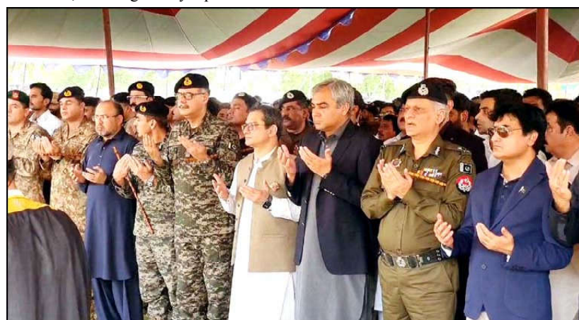
RAHIM YAR KHAN: Federal Minister for Interior, Mohsin Naqvi attending funeral prayer of martyred police personnel in Rahim Yar Khan.