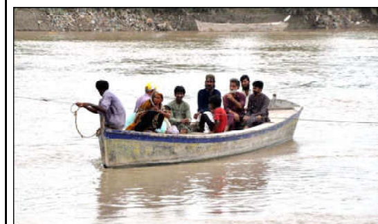
HYDERABAD: People are using boat for transportation due to non-availability of bridge to cross the canal, at Channel Mori in Hyderabad.

LAHORE (APP): A meeting was held at the Civil Secretariat on Friday to highlight and appreciate the Punjab government plans and efforts to protect rights of religious minorities in Punjab. Provincial Minister for Minorities Affairs Ramesh Singh Arora, presiding over the meeting, said that the Punjab government was taking all possible steps to protect rights of religious minorities to ensure elimination of the sense of deprivation that emerged in the past among the religious minorities. Chairperson of Punjab Women Protection Authority Hina Parvez Butt highlighted the vision of Punjab Chief Minister Maryam Nawaz's Digital Punjab and development of the province. She said that under the leadership of Chief Minister Maryam Nawaz, the rights of women, especially those belonging to religious minorities, were being safeguarded. She added that women in Punjab were making significant contribution to development of Pakistan, and they were prominently visible in every field.