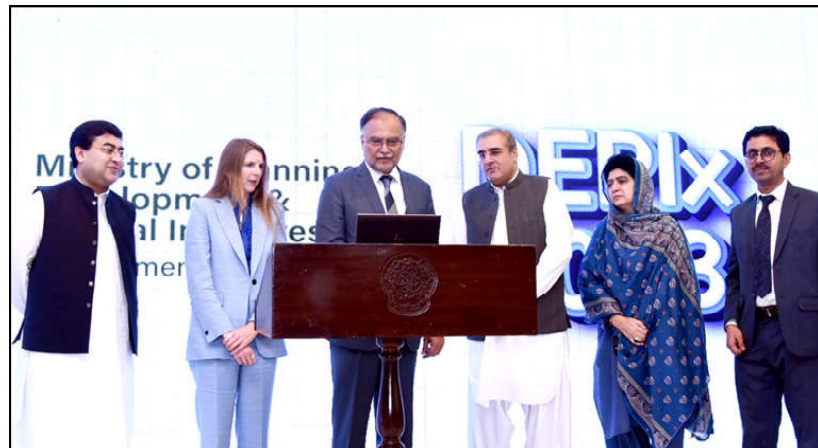
ISLAMABAD: Federal Minister for Planning, Development & Special Initiatives, Ahsan Iqbal, and British High Commissioner to Pakistan, Ms. Jane Marriott, jointly launched the "District Education Performance Index" in Federal Capital.