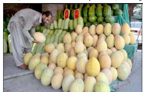
QUETTA: A vendor displaying fresh Melon (Garma) at Joint Road Quetta to attract customers to experience the sweet, juicy flavor of locally grown fruit.

centres and 51 essential items for all expenditure groups. Likewise, SPI for the lowest consumption group of up to Rs 17,732, witnessed decrease of 0.24 per cent and went down to 310.29 points from last week's 311.04 points. The SPI for the consumption groups of Rs 17,732-22,888; Rs 22,889-29,517; Rs 29,518-44,175 and above Rs 44,175 decreased by 0.22 percent, 0.15; 0.12 percent and 0.05 percent respectively. During the week, out of 51 items, prices of 21 (41.18%) items increased, 9 (17.64%) items decreased and 21 (41.18%) items remained stable. The items, which recorded major decrease in their average prices on a week-on-week basis included tomatoes (21.96%).