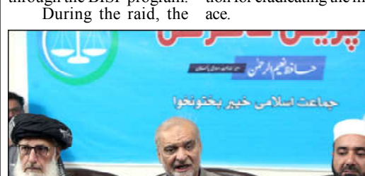
PESHAWAR: Jamat-e-Islami (JI) Chief, Hafiz Naeem-ur-Rehman along with others addresses to media persons during press conference, at Markaz-e-Islami in Peshawar.

ISLAMABAD (APP): The Pakistan Telecommunication Authority (PTA) Zonal Office in Lahore, in a close collaboration with the Federal Investigation Agency (FIA) Cyber Crime Circle, conducted a raid against a telecom franchisee located at Depalpur, District Okara. According to a press release, prior to this, hundreds of complaints were received from poor female residents of the area regarding the misuse of their fingerprints and the unlawful issuance of SIMs under the guise of distributing Rashan through the BISP program. During the raid, the FIA seized 25 suspicious SIMs, and 2 suspected BVS devices. The Retailer of the franchise was arrested at the spot and FIR has been registered by the agency. FIA Cybercrime Circle is further investigating the case. This action was the result of complaint filed by the PTA with the FIA, concerning the illegal activation of SIMs through the sales channel. The crackdown is part of PTA's ongoing efforts to curtail illegal issuance of SIMs and underscores Authority's dedication for eradicating the menace.