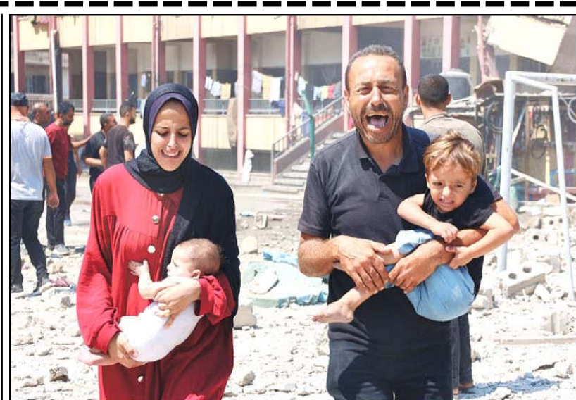
Palestinians carry their children as they flee after an Israeli strike on a school housing displaced people, in the Rimal neighbourhood of central Gaza City.