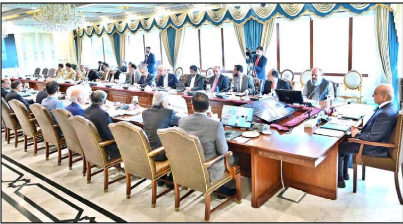
ISLAMABAD: Prime Minister Muhammad Shehbaz Sharif chairs a review meeting regarding country wide anti smuggling drive.