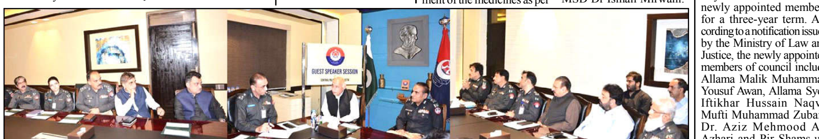
QUETTA: Former Chief Minister Balochistan Dr. Abdul Malik Baloch addressing officers at CPO office as chief guest