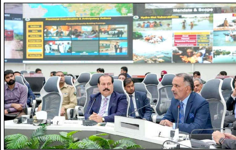
ISLAMABAD: NDMA conducted the first National Industrial Disaster Preparedness & Response Exercise at NDMA HQs.