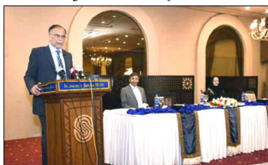
ISLAMABAD: Federal Minister for Planning, Development, and Special Initiatives, Prof. Ahsan Iqbal addressing a conference on "Empowering a Digital Pakistan" organizing by Institute of Regional Studies & COPAIR.