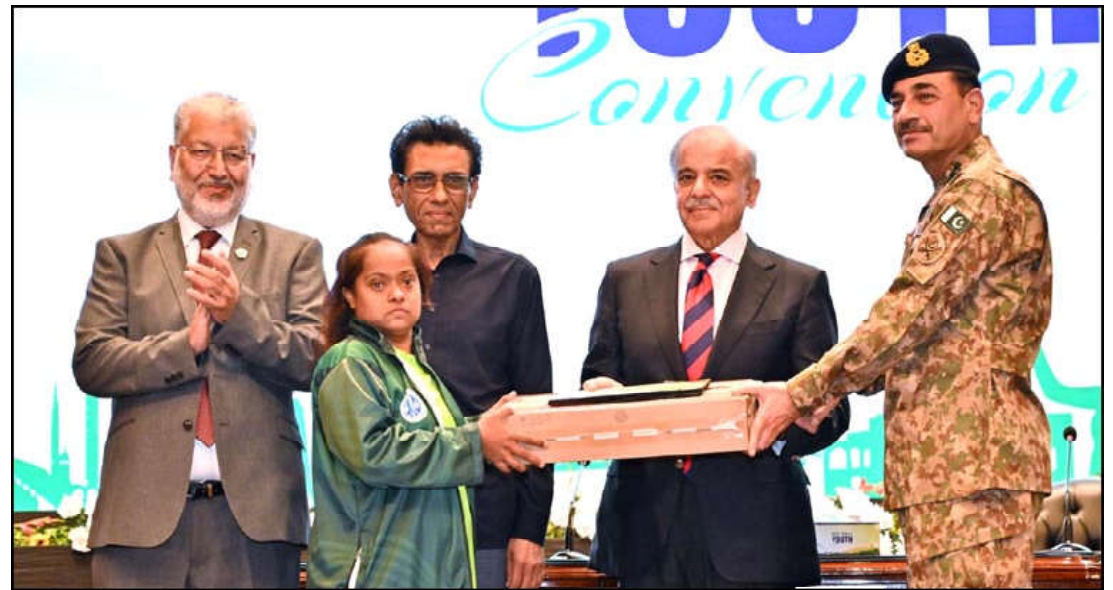
Prime Minister Muhammad Shehbaz Sharif and Chief of Army Staff General Syed Asim Munir distributing laptops among the high achievers during National Youth Convention held in Islamabad.

forbidden from despair," the COAS said. The Chief of Army Staff told the youth that life was a test, and read the Qur'anic verse, "Do people think that they will be left alone for saying, 'We believe,' and they will not be tested?" At the end of the speech, the Army Chief recited this poem of Allama Iqbal addressing the youth.