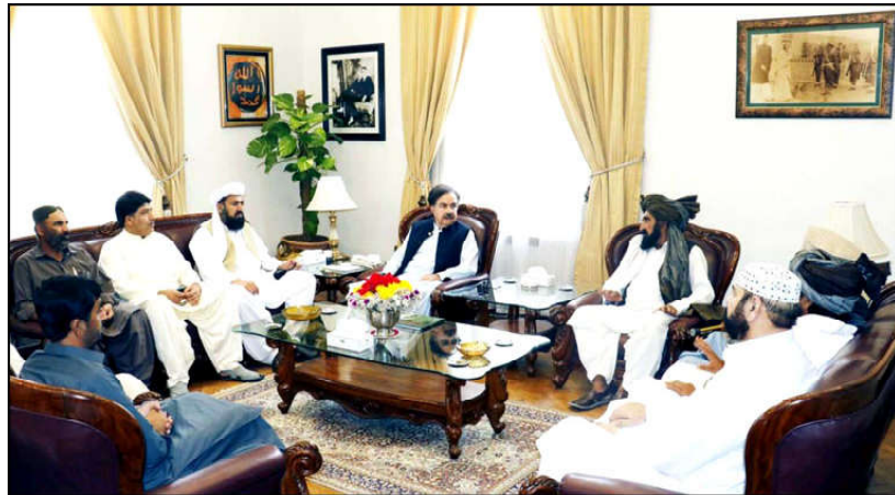
QUETTA: Different delegations meeting with Governor Balochistan Sheikh Jaffar Khan Mandokhail