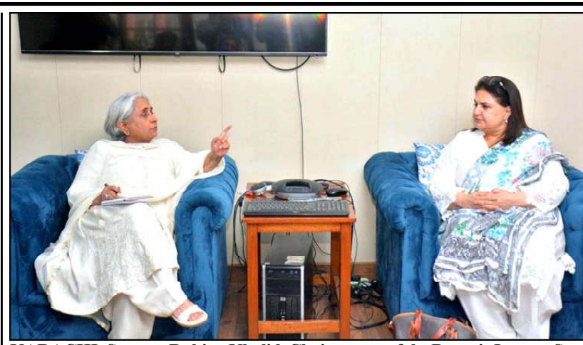
KARACHI: Senator Rubina Khalid, Chairperson of the Benazir Income Support Programme (BISP) call on Minister of Health Sindh Azra Fazal Pechuho at Sindh Secretariat Karachi.

The Minister directed the timely completion of work of shoulders of the said road without compromising on the quality and quantity of work.