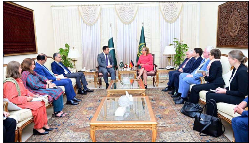
ISLAMABAD: Federal Minister for Economic Affairs, Ahad Khan Cheema exchanging views with Svenja Schulze, German Federal Minister for Economic Cooperation and Development during meeting held in Islamabad.