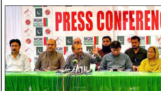
KARACHI: Muttahida Qaumi Movement (MQM-P) Leaders, Farooq Sattar along with others addressing to media persons during press conference held at Pakistan House in Karachi.

The MQM-P leader expressed concerns over the continuous increase in electricity bills and the persistent load shedding in Karachi, which he described as discrimination against the city's residents.