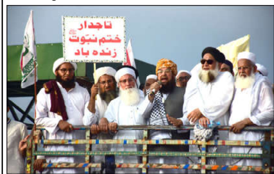
ISLAMABAD: General Secretary Jamiat Ulema-Islam-Fazi (JUI-F) Maulana Abdul Ghafoor Haideri addressing during Aalmi Majlis Tahaffuz Khatm-e-Nubuwwat protest in favor of their demands in front of Parliament house, in the Federal Capital.

By seeing the critical situation, the local dwellers called the driver of excavator immediately, who rescued the family with car they were riding in, from the flood water demonstrating extreme courage and bravery.