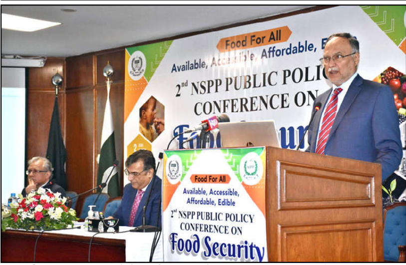
LAHORE: Federal Minister for Planning and Development Ahsan Iqbal addressing the conference on food security SPP (National School of Public Policy) during the opening ceremony.