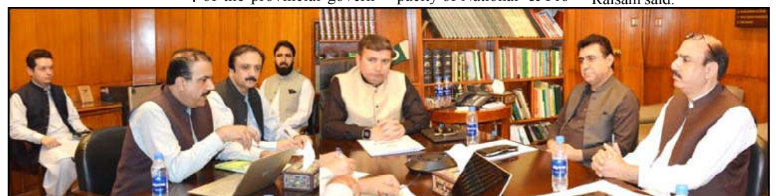
QUETTA: Chief Secretary Balochistan Shakeel Qadir Khan presiding over a meeting regarding provision of medicines to provincial hospitals

As per the allegations in the case, the petitioner of this plea, facilitated the settlement between the government and the property tycoon when he was the prime minister, the counsel added.