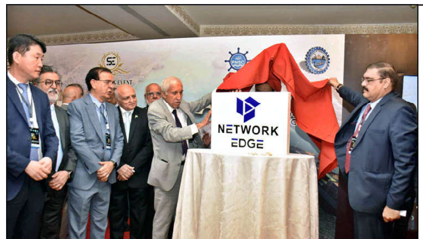
KARACHI: Federal Minister for Maritime Affairs Qaiser Ahmed Sheikh unveiling the plaque during the one-day conference titled 'COLMAB 24' on Logistics, Maritime Affairs and Blue Economy.