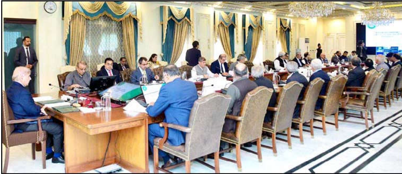
ISLAMABAD: Prime Minister Muhammad Shehbaz Sharif chairs a review meeting on Chinese investment in Pakistan.

Ph: 2841470/2841473 Vol: XIX No. 177, Safar 14, 1446 AH Tuesday August 20, Pages 04, Price Rs.15