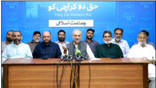
KARACHI: Jamat-e-Islami (JI) Chief, Hafiz Naeem-ur-Rehman along with others addresses to media persons during press conference, at Idara-e-Noor-ul-Haq in Karachi.

Gilani offered prayers for the swift recovery of those injured and urged the relevant authorities to expedite their relief efforts. He emphasized that natural disasters are a global challenge, and their negative impacts can only be mitigated through collective efforts. Highlighting the challenges Pakistan faces due to climate change, he advised people to take precautionary measures.