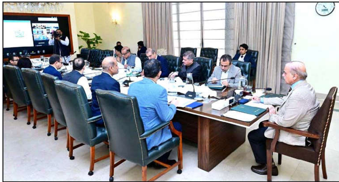
ISLAMABAD: Prime Minister Muhammad Shehbaz Sharif chairs a meeting on the matters related to Power Division, Ministry of Energy.