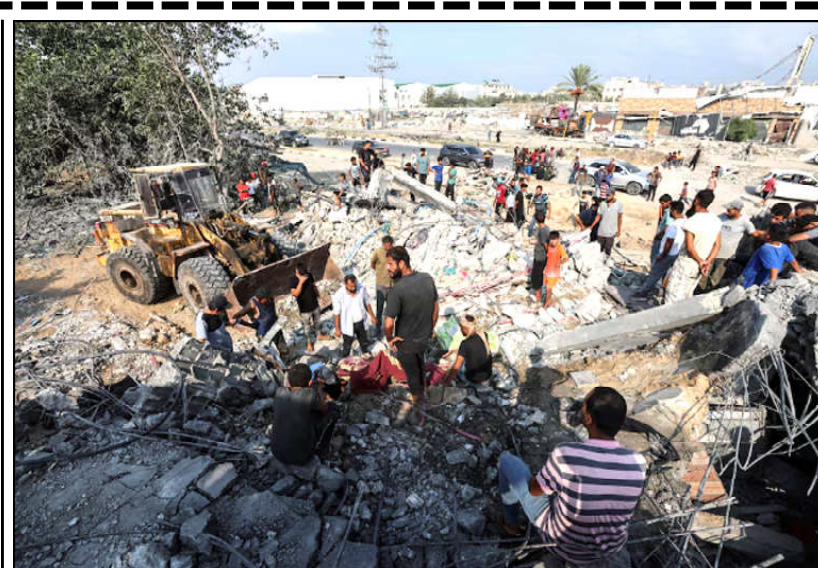
Palestinians stand at the site of an Israeli airstrike on a shelter housing displaced people, amid the conflict between Israel and Hamas, in central Gaza Strip.

He said militants were firing rockets from those locations and that the military was preparing to act against them.