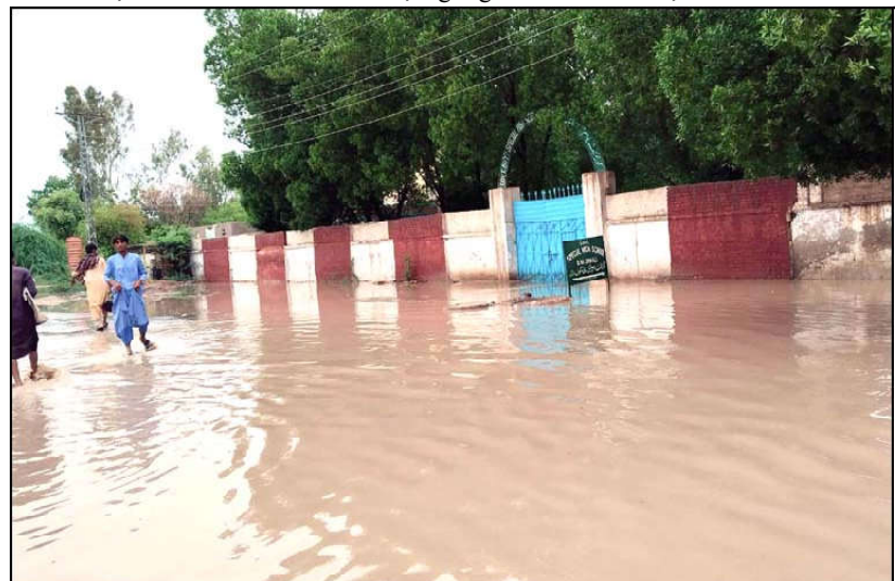
NASEERABAD: View of stagnant rainwater due to poor sewerage system after heavy downpour of monsoon season, showing the negligence of concerned department, at different areas of Dera Murad Jamali.