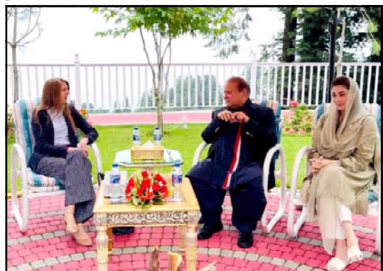
MURREE: British High Commissioner Jane Marriott meeting with Punjab Chief Minister Maryam Nawaz and PML-N President Nawaz Sharif

Therefore, it is necessary to speed up the official performance, ensure computerization in the institutions and take concrete steps for removing sense of deprivations prevailing among the people, adding he stressed.