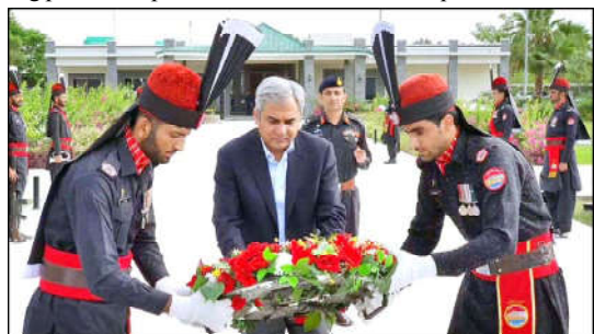
TURBAT: Interior Minister Mohsin Naqvi laying floral wreath at the Yadgar-e-Shuhada in Frontier Corps Balochistan (South) Headquarters.