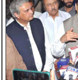
KHANEWAL: Chairman Senate Syed Yusuf Raza Gilani talking to media persons after the Convocation of the Punjab College Mian Channu.

Technical experts and internet service providers have also refuted reports that the government had slowed down or closed the internet nationwide.