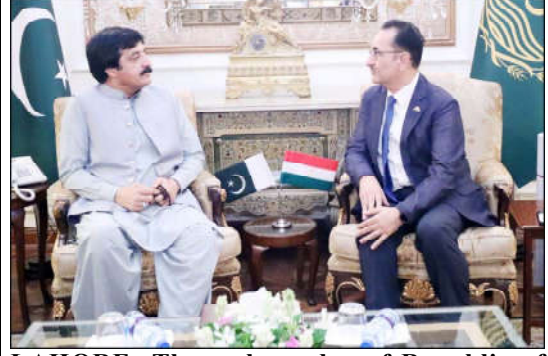
LAHORE: The ambassador of Republic of Tajikistan, Yusuf Sharifzoda called on Punjab Governor, Sardar Saleem Haider Khan at Governor House.