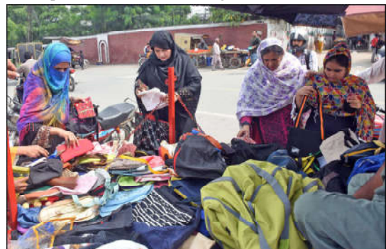
SARGODHA: A mechanic busy repairing bicycle at Liaquat Market.

The Special Assistant also highlighted the government's efforts to promote sustainable tourism practices, ensuring that the growth of the sector benefits local communities and preserves the country's natural environment. By engaging with stakeholders and implementing eco-friendly initiatives, the government aims to create a responsible and thriving tourism industry, he highlighted.