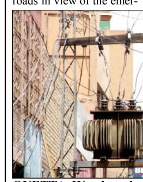
QUETTA: Wapda technician is installing electric wires on an electric pole after damages, at Sarki road in Quetta.