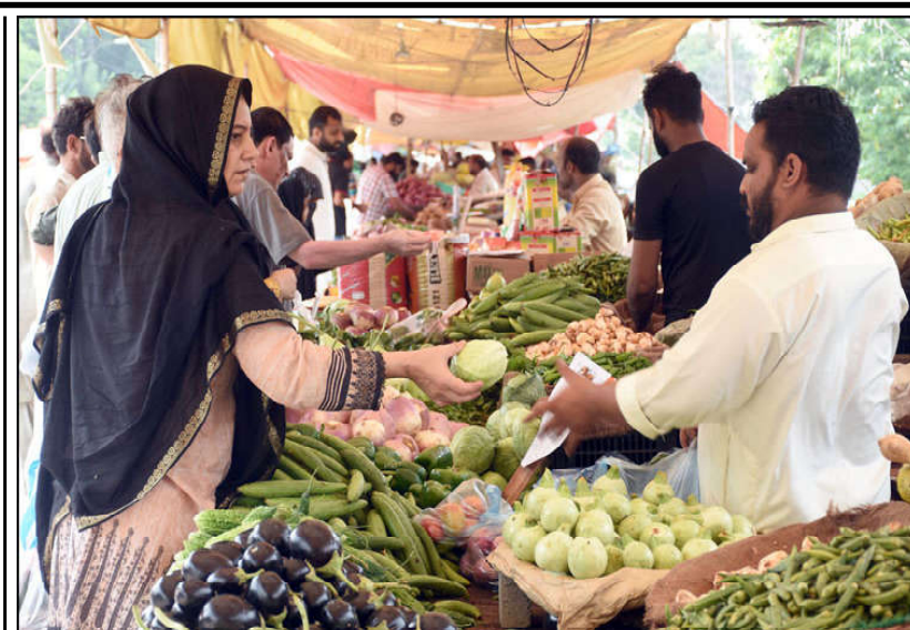
LAHORE: People are buying vegetables in Sunday weekly bazaar at Shadman area in the Provincial Capital.

ISLAMABAD (APP): In a bid to protect consumers, Assistant Commissioner City Farhan Ahmad on Sunday conducted a surprise visit to the bustling G-6 Sunday bazaar, scrutinizing price lists and enforcing the plastic bag ban. According to the spokesman of ICT administration, Assistant Commissioner City, Farhan Ahmad, led a team to the G-6 Sunday Market to ensure compliance with price regulations. The officials inspected price lists at various stalls, taking action against two shopkeepers for overcharging customers. The visit aimed to enforce the government's directive on price control and plastic bag usage. On the occasion, he emphasized the ongoing efforts to implement the plastic bag ban, promoting eco-friendly alternatives. During the visit, citizens refused to purchase from vendors without displayed price lists.