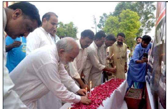
PESHAWAR: Members of Christian Community are enlightened candles as they are marking 1st anniversary of Jaranwala Incident, in Peshawar.

The Governor proposed allocating a quota for young lawyers in the Judicial Academy that would address the issue of starting LL.M. classes at Gomal University.