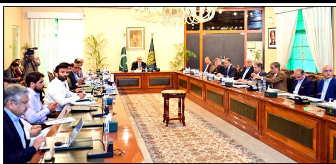
ISLAMABAD: Deputy Prime Minister and Foreign Minister Mohammad Ishaq Dar presides over the first meeting of a committee, formed to consider the issues faced by the petroleum sector's E&P companies.

the Petroleum Division to work closely with the industry and other stakeholders. The forum also directed the Petroleum Division to suggest appropriate amendments to the Ogra Ordinance to introduce a mechanism for the adjustment of gas rates on a monthly or quarterly basis. On security issues, the Forum directed the Interior Division to work closely with E&P companies and other stakeholders.