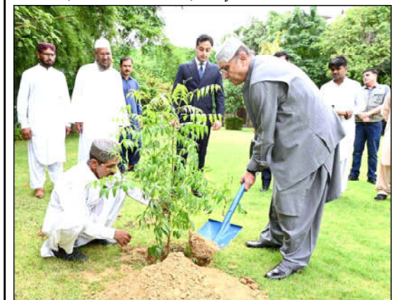
KARACHI: President Asif Ali Zardari planting a "Neem" sapling at Bilawal House as part of the Monsoon Tree Plantation Campaign.

The President stated that Monsoon Tree Plantation Campaign was a great opportunity to enhance forest cover, increase greenery in Pakistan.