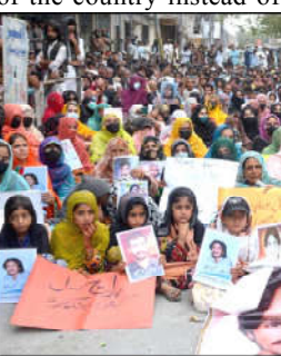
QUETTA: Relatives of missing persons hold a protest outside Quetta Press Club.

He urged PTI to think of the country instead of