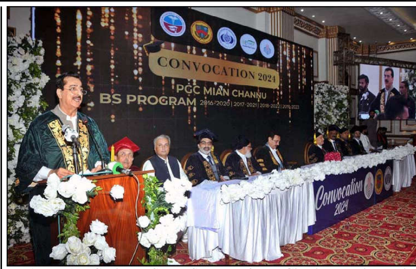
KHANEWAL: Chairman Senate Syed Yusuf Raza Gilani addressing during the Convocation of the Punjab College Mian Channu.