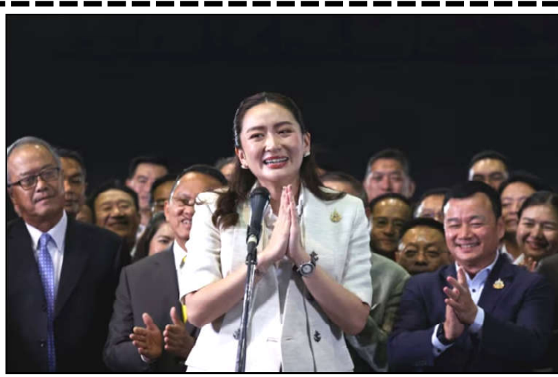
Pheu Thai Party's leader Paetongtarn Shinawatra reacts during a press conference after the Thai parliament confirms her as the country's next prime minister, in Bangkok, Thailand.

John Kirby told reporters at the White House. Israel, meanwhile, pressed its assault on Gaza. Gaza health officials said at least six Palestinians were killed on Thursday night in an Israeli air strike on a house in Jabalia in northern Gaza Strip. Israeli troops earlier hit targets in the southern cities of Rafah and Khan Younis. In a statement issued late on Thursday on Telegram, Hamas politburo member Hossam Badran said Israel's continuing operations were an obstacle to progress on a ceasefire. Hamas officials did not join Thursday's talks. Badran said the talks must move toward implementation of a framework agreement accepted previously and achieve a complete ceasefire, withdrawal of Israeli forces, return of displaced Palestinians and