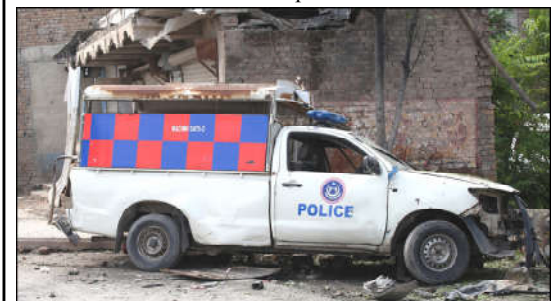
PESHAWAR: A view of damage police van seen at blast site. At least five people, including two police personnel, have been injured in an explosion at the Warsak Road in the Pir Bala area.

ISLAMABAD (INP): The Secretary of Railways has revealed that 67% of Pakistan Railways' tracks have exceeded their operational lifespan. The revelation was made during a Senate committee meeting on railways chaired by Senator Jam Sadiq Khan on Friday. The Secretary also disclosed that the design of the Main Line 1 (ML-1) project was altered due to the impact of recent floods. The revised PC-1 now estimates the project's total cost at approximately $6 billion, down from the initial $9 billion, despite the significant design changes. Senator Kamil Ali Agha questioned the unchanged cost despite the redesign, expressing concerns about compromising the project. He also raised alarms about the risks associated with the loans from China. The Secretary assured that there has been no compromise on ML-1's security and management, and emphasized the project's financial viability. In a related development, the committee was informed that the investigation into corruption involving 10 mysterious employees in Karachi has been inexplicably halted, leaving committee members surprised and concerned.