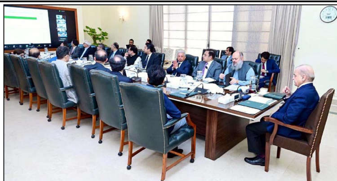
ISLAMABAD: Prime Minister Muhammad Shehbaz Sharif chairs a meeting regarding development of gemstone sector.

participants that the government would not allow smuggling of the gemstones and sought a report on the subject within a week, after consultation with the GB government. The prime minister also called for the priority measures to achieve the international certification of Pakistan's gemstones. In the briefing, it was told that a total of 178 licenses had so far been issued for mining of gemstones.