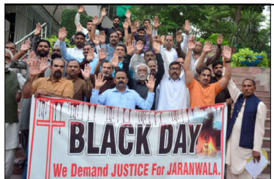
RAWALPINDI: Members of the Christian community held a protest demonstration outside the Press Club against the Jaranwala incident.