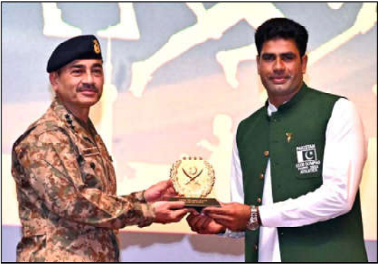
RAWALPINDI: Chief of Army Staff (COAS), General Asim Munir presenting a shield to Arshad Nadeem, Javelin Throw Olympian Gold Medalist during a ceremony in his honor held at Army Auditorium General Headquarters (GHQ) in Rawalpindi.

The event was attended by sports teams and legendary olympians including 1984 Olympic and National Hockey Teams, National Cricket Team, Street Football Team, Army Polo Team, Visually Impaired Cricket and Women Goal Ball Teams, Medal Winners of Common Wealth, SAF and Asian Games and participants of Paris Olympics 2024.