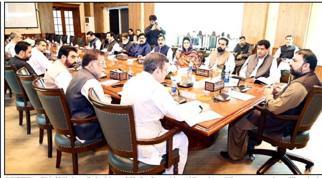
QUETTA: Chief Minister Balochistan Mir Sarfaraz Ahmed Bugti presiding over meeting of Provincial Cabinet

The Chief Minister said that the lady police cops are the pride of Balochistan. He said that they are the real face of Balochistan and custodians