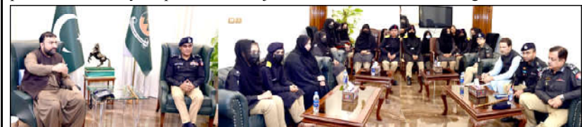
QUETTA: Women police officials of Balochistan Police who performed duties during the protests in Gwadar and Quetta meeting with Chief Minister Balochistan Mir Sarfaraz Ahmed Bugti