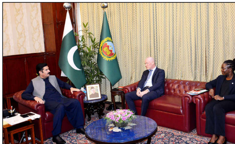
PESHAWAR: Governor Khyber Pakhtunkhwa Faisal Karim Kundi is called on by ICRC delegation Head in Pakistan Nicolas Lambert at Governor House.

previously provided substantial relief to earthquake and flood victims in 2010 and 2022. The Governor Kundi acknowledged the valuable contribution of the ICRC in the province's relief activities, particularly during natural disasters. Faisal Karim Kundi suggested that the ICRC focus on enhancing health and education services in the merged districts. He noted the significant impact of environmental changes and terrorism on Khyber Pakhtunkhwa, emphasizing the need for better health and education systems in the province's rural southern districts.