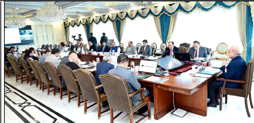
ISLAMABAD: Prime Minister Muhammad Shehbaz Sharif chairs a meeting on Rightsizing of Government Size.

The bodies have been sent to the hospital for post-mortem examination and identification as authorities continue their investigation into the incident.