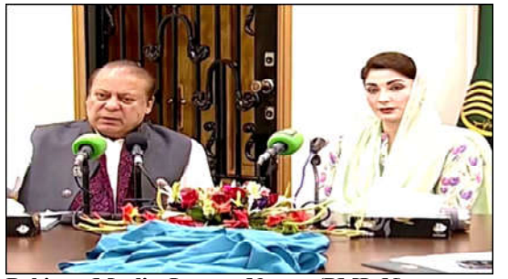
Pakistan Muslim League-Nawaz (PML-N) supremo Nawaz Sharif addressing the press conference along with Punjab Chief Minister Maryam Nawaz in Lahore.

He also mentioned another significant project introduced by the chief minister, which involves providing solar panels to people in need. The project, with an estimated budget of Rs 700 billion, aims to bring comfort to poor, lower-middle, and middle-class citizens. He expressed his hope that these measures would alleviate the financial strain on the common people and praised both the PM and the CM for their commitment to the welfare of citizens.