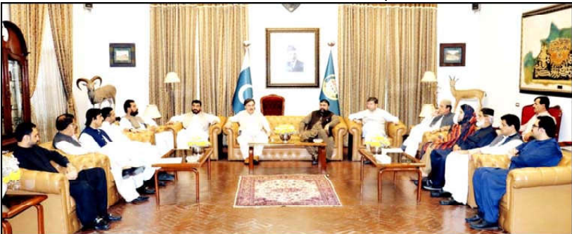
QUETTA: A delegation of Provincial Ministers led by Chief Minister Mir Sarfaraz Ahmed Bugti meeting with Governor Balochistan Sheikh Jaffar Khan Mandokhail

In another action carried out last week by the security forces in South Waziristan, four soldiers embraced martyrdom while six terrorists were killed during the exchange of gunfire.