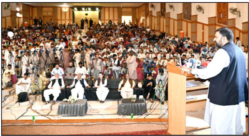
QUETTA: Chief Minister Balochistan, Mir Sarfraz Bugti addressing the ceremony of distribution of certificates of admission and scholarships the children of the registered labourers under the arrangements of Workers Welfare Board

The event served as a testament to the unbreakable bond between the Pakistan Army and its veterans, united in their commitment to the nation's prosperity and security.