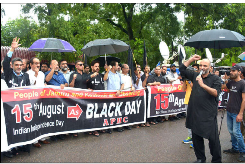
ISLAMABAD: People of Jammu and Kashmir observed Black day on the occasion of Indian Independence day in the Federal Capital.