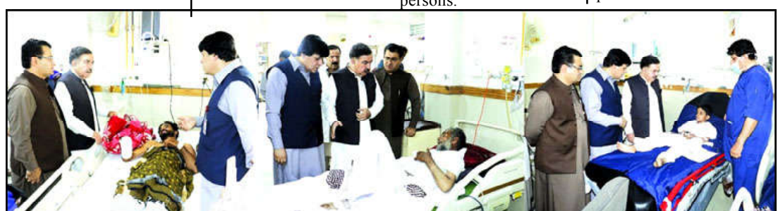
QUETTA: Governor Balochistan Sheikh Jaffar Khan Mandokhail enquiring about health of injured of Wednesday's bomb blasts at Trauma Center

He also prayed for early recovery of the injured persons.