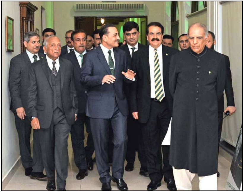
RAWALPINDI: Chief of Army Staff (COAS), General Syed Asim Munir interacts with retired officers of Pakistan Army during a graceful reception in honor of Pakistan Army veterans on the eve of 77th Independence Day of Pakistan held in Rawalpindi.

Ph: 2841470/2841473 Vol: XIX No. 174, Safar 10, 1446 AH Friday August 16, Pages 04, Price Rs.15