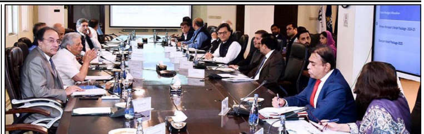
ISLAMABAD: federal Minister for Finance & Revenue Senator Muhammad Aurangzeb presiding over a meeting of Economic Coordination Committee (ECC).

ISLAMABAD (APP): The per tola price of 24 karat gold witnessed a decrease of Rs.300 on Thursday and was traded at Rs 257,400 against its sale at 257,700 on the last trading day in the local market. The price of 10 grams of 24 karat also decreased by Rs256 to Rs.220,680 from Rs.220,936, whereas that of 10 gram 22 karat decreased to Rs202,290 from Rs202,525. All Sindh Sarafa Jewellers Association reported. The price of per tola and ten gram silver remained unchanged at Rs.2,850 and Rs.2,443.41 respectively. Prices of gold in the international market decreased by $4 to $2,454.