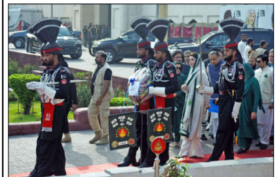
LAHORE: Chief Minister of Punjab Maryam Nawaz Sharif arriving for Fataha on the grave of Poet of Nation Dr. Allama Mohammad Iqbal at Mazar-e-Iqbal during Independence Day celebrations in the Provincial Capital.

The CM left her seat and sat among the differently-abled children and appreciated their presenting the national anthem. Ambassadors from various countries and prominent personalities from different walks of life participated in the Independence Day ceremony being held at Hazuri Bagh.