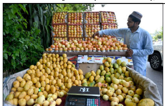
ISLAMABAD: A vendor displays fruits on his roadside setup to attract the customers at F-10 area.

Participants were divided into four groups, each presenting on different aspects of nutrition and the roles of various government departments.