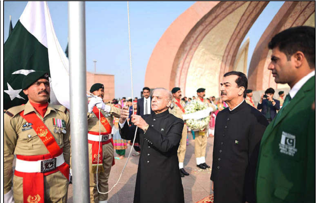
ISLAMABAD: Prime Minister Muhammad Shehbaz Sharif hoists the national flag at the Pakistan Monument on the 78th Independence Day.

He said although, today, the people were much worried about inflation, electricity bills, unemployment and other issues, but he was very concerned about providing maximum relief to the people.