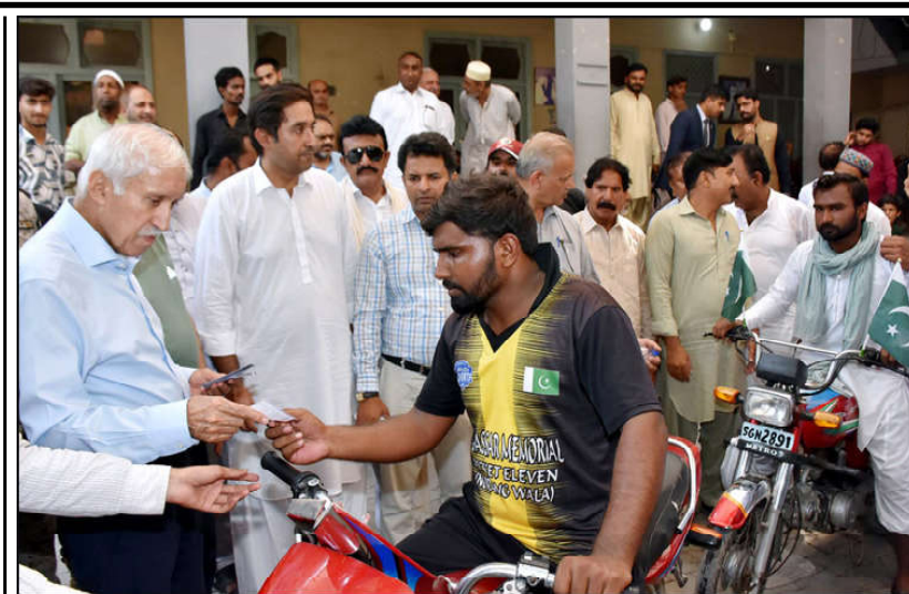
CHINIOT: Federal Minister for Maritime Affairs, Qaiser Ahmad Sheikh distributing the free coupon of 5 Liter Petrol to Ten Thousand bikers.