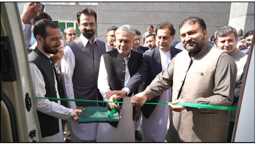
QUETTA: Deputy Prime Minister Ishaq Dar and Chief Minister Balochistan Mir Sarfaraz Ahmed Bugti inaugurating new Registration Centers of NADRA. Speaker National Assembly Sardar Ayaz Sadiq, Provincial Ministers and high officials are also present