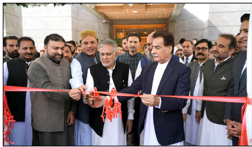
QUETTA: Deputy Prime Minister Ishaq Dar and Chief Minister Balochistan Mir Sarfaraz Ahmed Bugti inaugurating Quetta Solid Waste Management project. Speaker National Assembly Sardar Ayaz Sadiq, Federal Minister Jam Kamal Khan, Speaker Balochistan Assembly Abdul Khaliq Achakzai, Provincial Ministers and high officials are also present

He said that we are included in the atomic powers of the world despite limited resources.