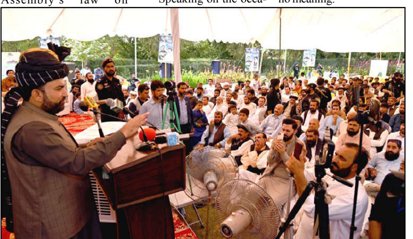
PISHIN: Chief Minister Balochistan Mir Sarfaraz Ahmed Bugti addressing a ceremony held in connection with Independence Day

He said that he wants to tell the whole world that Pakistan has minerals of billions and trillions of rupees. He said that there's no room of violence in the country. He said that the theory of angry people has no meaning.