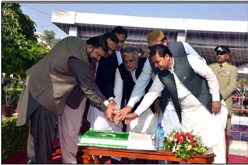
QUETTA: Deputy Prime Minister Ishaq Dar cuts cake during the flag hoisting ceremony at the lawn of Balochistan Assembly to mark the Independence Day, CM Balochistan Mir Sarfaraz Bugti, Speaker National Assembly Sardar Ayaz Sadiq and federal commerce minister Jam Kamal are also present.