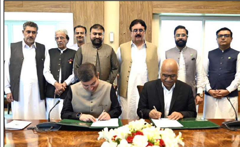
QUETTA: Memorandum of Understanding (MoU) is being signed between Government of Balochistan and Akhuwat Foundation. Chief Minister Balochistan Mir Sarfaraz Ahmed Bugti is also present

restoration of law and order in the province and assured complete cooperation by the federal government. Speaking on the occasion, the Chief Minister said that we are making provincial development programme compatible with the public needs. He said that we are determined to improve service delivery system and establishment of the good governance. However, the timely completion of the federal development projects is conditional with timely release of the funds.