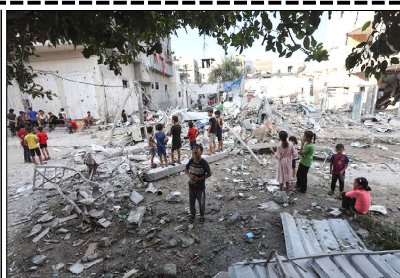
Palestinian children stand at the site of an Israeli strike on a house, amid the Israel-Hamas conflict, in Maghazi refugee camp in the central Gaza Strip.

The Ukrainian assault into Russian territory has dramatically changed the narrative around the two-and-a-half-year-old war. Russia had been advancing in eastern Ukraine since the failure of Kyiv's 2023 counter-offensive to make any major gains against Russian forces.