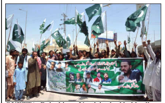
QUETTA: Balochistan Youth ittehad hold rally to mark independence day.

Independent Report QUETTA: The Deputy Prime Minister, Muhammad Ishaq Dar and Speaker National Assembly, Sardar Ayaz Sadiq returned back to Islamabad after winding up two-day visit to Quetta on Wednesday. The Governor, Sheikh Jaffer Khan Mandokhail, Chief Minister Balochistan, Mir Sarfaraz Ahmed Bugti, provincial ministers, members of national and provincial assemblies saw them off at the Quetta airport. The Deputy Prime Minister and Speaker National Assembly thanked the Chief Minister and expressed best wishes for him. It may be mentioned here that Ishaq Dar and Speaker National Assembly participated in the Independence day celebrations in Quetta. The Deputy Prime Minister also presided over the meeting about law and order and development projects. He also participated as chief guest at the main ceremony of flag hoisting at the provincial assembly's law on Wednesday morning. In addition to this, Ishaq Dar also inaugurated the Quetta solid waste management project along with the Chief Minister and Speaker National Assembly in Quetta.