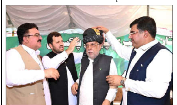
PISHIN: Parliamentary Secretary Asfandyar Kakar and MPs Asghar Tareen and Syed Zafar Ali Agha wearing traditional turban to Provincial Minister Mir Sadiq Umrani on eve of a ceremony held in connection with Independence Day

institutions to fully cooperate with the provincial government in providing services to the remote areas of Balochistan. Chief Minister of Balochistan, Mir Sarfaraz Bugti, on the occasion hoped that the establishment of new registration centers in 21 tehsils of Balochistan's remote areas would facilitate the public in obtaining registration and identity cards. The Chief Minister added that the people in remote areas had faced difficulties in registration and obtaining identity cards. The new registration centers and mobile vehicles would particularly benefit the elderly and women, allowing them to register and obtain identity cards at their doorstep.