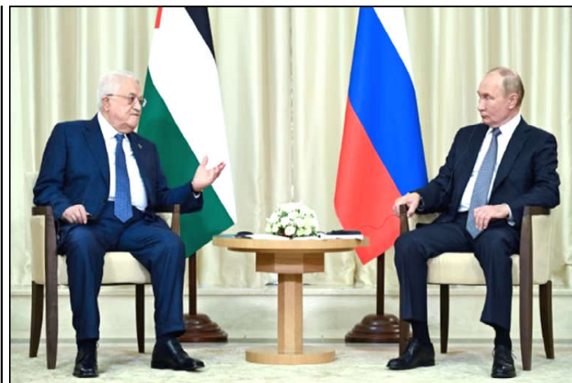
Russian President Vladimir Putin attends a meeting with Palestinian President Mahmoud Abbas outside Moscow, Russia.

LONDON: Over 700 migrants in small boats crossed the Channel to Britain on Sunday, the highest number on a single day since Prime Minister Keir Starmer took power vowing to tackle people-smugglers.