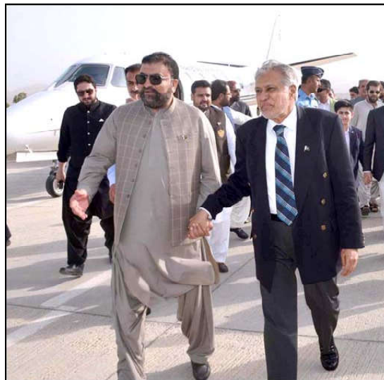
QUETTA: Deputy Prime Minister Muhammad Ishaq Dar and Balochistan Chief Minister Mir Sarfraz Bugti head to the Governor House from Quetta Airport.

He stressed that let's unite for celebrating our freedom, unity and unwavering spirit of Pakistan.