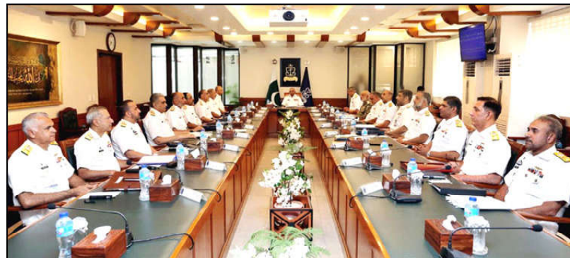
ISLAMABAD: Naval Chief Admiral Naveed Ashraf chairing command and staff conference of Pakistan Navy.