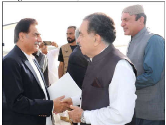
QUETTA: Governor Balochistan Sheikh Jaffar Khan Mandokhail receiving Speaker National Assembly Sardar Ayaz Sadiq upon arriving at Quetta Airport

Independent Report QUETTA: The Deputy Prime Minister Muhammad Ishaq Dar has stated that Balochistan is close to the heart of Prime Minister Muhammad Shahbaz Sharif and the federal government and as such steps would be taken to resolve the issues being faced by the province and its people. He said that it is necessary that Balochistan gets its genuine rights. He said that economic situation of the country is surely hard but it is not disappointing. He said that the future of Pakistan is bright and this country