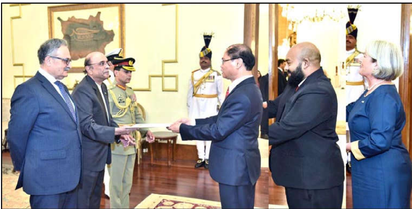
ISLAMABAD: The envoys of Vietnam, Maldives, and Ireland presenting their diplomatic credentials to President Asif Ali Zardari, at Aiwan-e-Sadr.