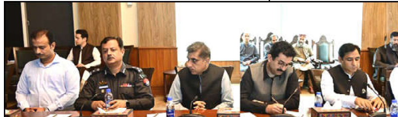
QUETTA: Chief Minister Balochistan Mir Sarfaraz Ahmed Bugti presiding over high level meeting regarding law and order situation