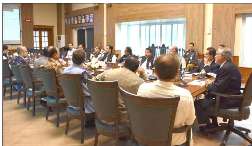
QUETTA: Deputy Prime Minister Ishaq Dar being briefed by Balochistan Chief Minister Mir Sarfraz Ahmed Bugti and Chief Secretary Shakeel Qadir Khan regarding law and order situation and ongoing development projects in Balochistan

Bilawal Bhutto emphasized that the PPP remains committed to the principles and vision of the founding fathers.