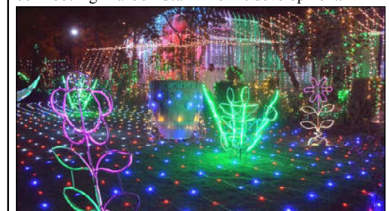
QUETTA: An illuminated view of Metropolitan corporation building decoration with national flag color lights in connection 77th Independence Day celebration.

ISLAMABAD (APP): Chairman Senate Syed Yousaf Raza Gilani Tuesday said that empowering women to take leadership roles in climate action will lead to more innovative and comprehensive solutions, driving progress in environmental conservation and sustainability. "The impacts of rising temperatures, erratic weather patterns, and natural disasters disproportionately affect women and marginalized communities and it is imperative that response to these challenges is inclusive, equitable, and transformative," he expressed these views at a reception hosted in honor of the delegation of Asian Forum of Parliamentarians on Population and Development (AFPPD). The delegation was led by Secretary General of AFPPD Dr. Jeth Sirathanout. He felicitated Romina Khurshid Alam, Coordinator to Prime Minister on Climate Change and Environmental Coordination, the Ministry, Asian Forum of Parliamentarians on Population and Development, and all the stakeholders for organizing such a significant and impactful conference on an issue that resonates deeply with our national and regional priorities.