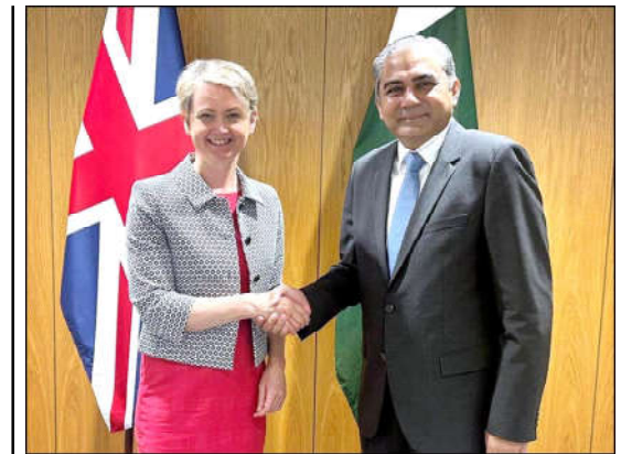
LONDON: Federal Minister for Interior Mohsin Naqvi shaking hands with British Home Secretary Yvette Cooper in London.

ISLAMABAD (APP): Minister for Interior Mohsin Naqvi called on British Home Secretary Yvette Cooper during his visit to the United Kingdom. The Minister congratulated Yvette Cooper on assuming the office of British Home Secretary and expressed good wishes for her. During the meeting, matters of mutual interest, including legal assistance in criminal cases, effective border management, and measures to curb illegal immigration were discussed. The training of Pakistani police officers in the UK was also discussed. The Minister welcomed the British cooperation in this regard and expressed his pleasure.