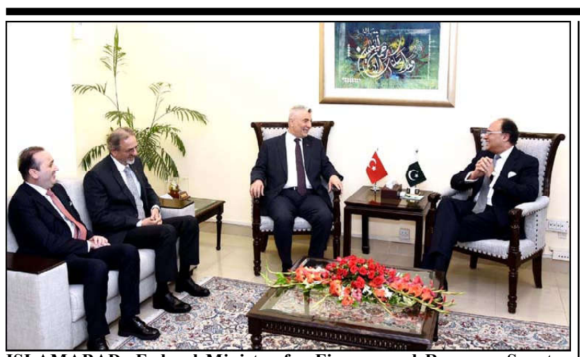
ISLAMABAD: Federal Minister for Finance and Revenue, Senator Muhammad Aurangzeb exchanging views with Prof. Dr. Omer Bolat, Trade Minister of Turkiye during meeting held in Islamabad.