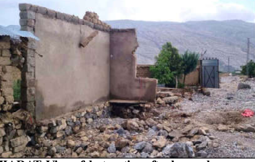
ZIARAT: View of destruction after heavy downpour of monsoon season, in Ziarat

A two members bench of IHC comprising Justice Hassan inquired was the next date of hearing given