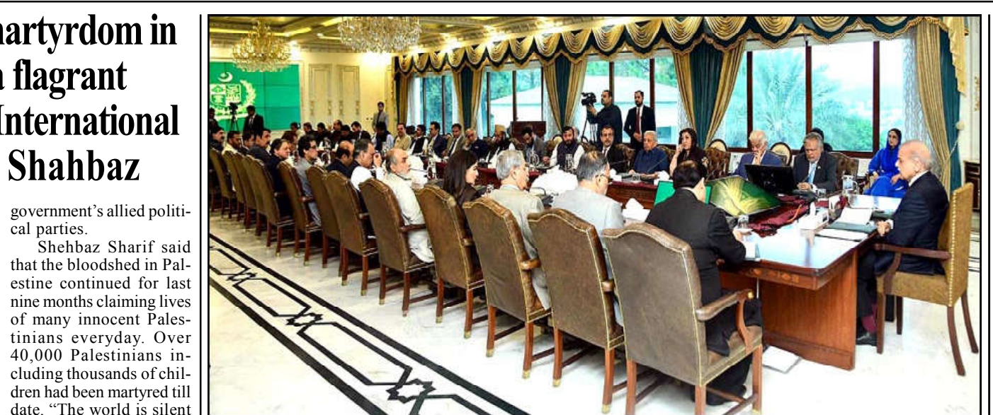
ISLAMABAD: Prime Minister Muhammad Shehbaz Sharif chairing a consultative meeting of Allied Parties regarding deteriorating situation in Palestine.