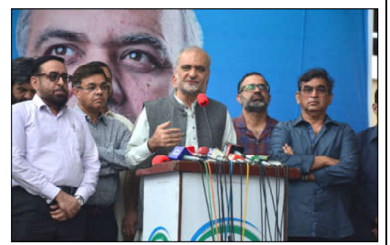
RAWALPINDI: Ameer Jamaat-e-Islami, Hafiz Naeem-ur-Rehman addressing a press conference in Liaquat Bagh sit-in in the city.

"So under the fund umbrella, it is not only getting the fund but making sure that this time we do the structural reforms," he remarked. "If we have to make it last programme of the fund then whether it is on taxation side, energy side, or SOE reforms and the privatization side, we have to move forward because we do not have the space to provide policy framework and room any more to and policy continuity.