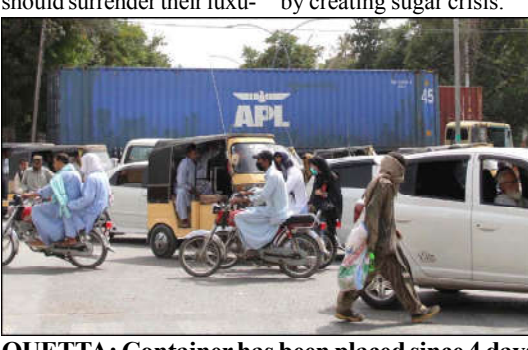
QUETTA: Container has been placed since 4 days in redzone area while commuters are facing inclashes between the tribes. | convenience due to blocked of road in Quetta.

'Taxes not being imposed over the feudal. They don't pay sugarcane price to farmer and mint money