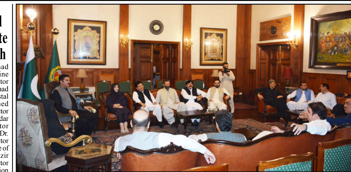
PESHAWAR: Opposition members and MPAs KPAssembly are participating in the dinner hosted by Khyber Pakhtunkhawa Governor Faisal Karim Kundi at Governor House.

Water, Splash Water, Still. Independent Report Starlite Water, Vivo Water KARACHI: As many as 22 brands of mineral water Plus Premium Drinking and Masafi. Director General have been declared harmful for human consumption. Among the mineral waters which have been declared harmful for human consumption are Fiji, BRO -H 20, Koh Noor, Rayaal Silver, Smart, Aqua Qismat, Asha Premium, Drinking Water, Buxton, Cliff Water, Health Drinking Water, Crystal Pure Life, Dream Pure, Neo Health Drinking Water, Oriel, Faraz Water, Premium Safa, Pure Refined Water, Smart Indus Pure of the people.