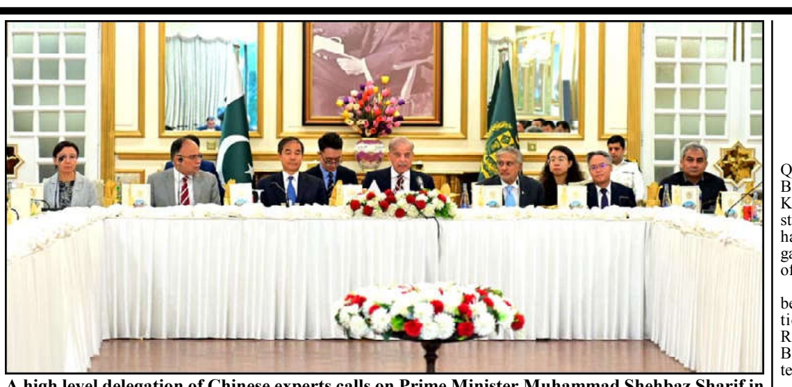
A high level delegation of Chinese experts calls on Prime Minister Muhammad Shehbaz Sharif in Islamabad.