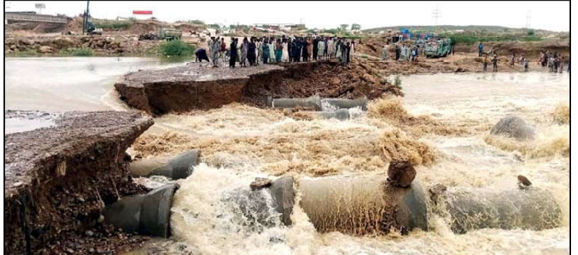
HUB: View of destruction at Hub River Causeway road once again due to floods causing of poor sewerage system creating problems for commuters and residents, after heavy rainwater flowed in area due to heavy downpour of monsoon season, showing negligence of concerned authorities, in Hub.

Keeping in view the hot weather, provision of cool water and shade should be ensured for the users.