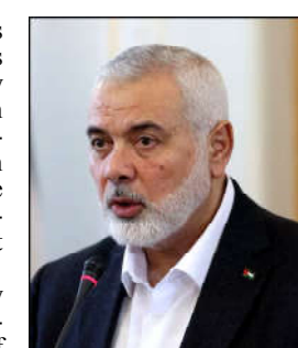
ate comment from Israeli authorities.

The news, which came less than 24 hours after Israel claimed to have killed the Hezbollah commander it said was behind a deadly strike in the Israeli-occupied Golan Heights, appears to set back chances of any imminent ceasefire agreement in Gaza.