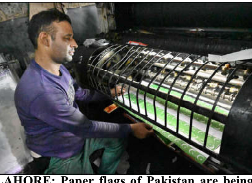
LAHORE: Paper flags of Pakistan are being printed at the printing press in preparation for Independence Day celebrations.

by the GB government. Some of these issues were chaired the meeting of the related to insufficient fund allocations and delays in PSDP projects which lead to employee related and other liabilities. The Chief Secretary advocated for solar power projects designed to address the region's growing energy needs. He also proposed initiatives for the digitization of land records and the expansion of airports to enhance tourism potential. These proposals aim to modernize GB's