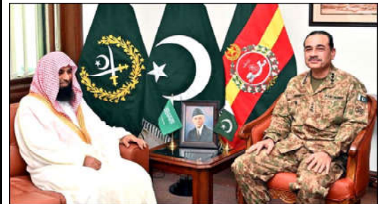
RAWALPINDI: Chief of Army Staff (COAS), General Syed Asim Munir exchanging views with Dr. Salah bin Mohammad Al-Budair, Imam Masjid-i-Nabwi (PBUH) during meeting held at General Headquarters (GHQ) in Rawalpindi.

At the end Imam Masjid Al-Nabawi prayed for the peace, stability and unity of Muslim Ummah.