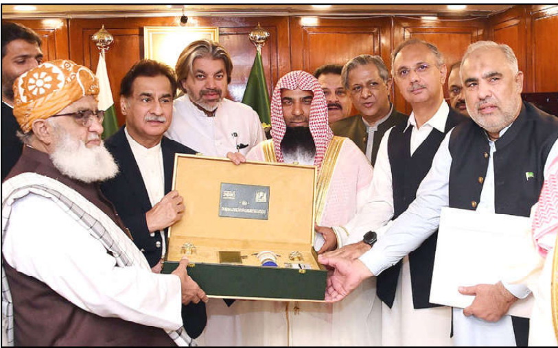
ISLAMABAD: Speaker National Assembly Sardar Ayaz Sadiq, along with other Parliamentarians present gift to Imam Masjid Al-Nabawi (S.A.W) Sheikh Dr Salah Mohammad MAI-Bdeer at Parliament House, in the Federal Capital.