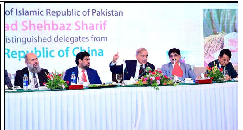
KARACHI: Prime Minister Muhammad Shehbaz Sharif addresses business delegates from the People's Republic of China.

She said, "This is a critical time in the Middle East. We, therefore, urge all parties, including the media, not to indulge in peddling of fake news."