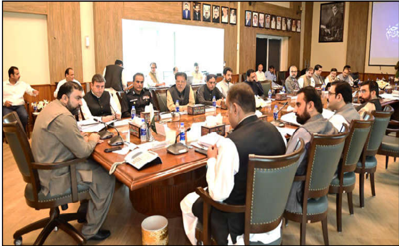
QUETTA: Chief Minister Balochistan Mir Sarfaraz Ahmed Bugti presiding over meeting of Provincial Cabinet

Ph: 2841470/2841473 Vol: XIX No. 169, Safar 04, 1446 AH Saturday August 10, Pages 04, Price Rs.15