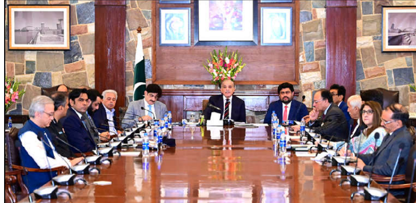
KARACHI: Prime Minister Muhammad Shehbaz Sharif chairing a review meeting regarding Pakistan polio eradication program.