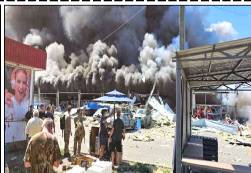
A view shows a supermarket heavily damaged in a Russian military strike, amid Russia's attack on Ukraine, in Kostiantynivka, Donetsk region, Ukraine.