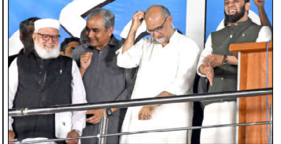
RAWALPINDI: Chief (emir) of the Jamaat-e-Islami Pakistan (JI) Hafiz Naeem Ur Rehman, Interior Minister Mohsin Naqvi, and Liaqat Baloch exchanging view on stage in sit-protest, after final round of negotiations between the government and Jamaat-e-Islami (JI) concluded successfully.

The PPP leader lamented that 'hate politics' is on the rise in Pakistan, which is unprecedented in the history of the country.