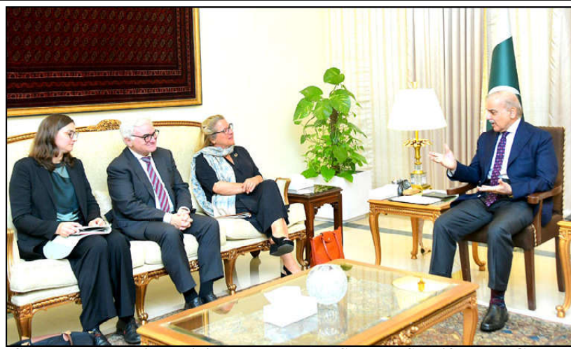
ISLAMABAD: Prime Minister Muhammad Shehbaz Sharif met the German Federal Minister for Economic Cooperation and Development, Ms. Svenja Schulze, at the Prime Minister's House, in the Federal Capital.