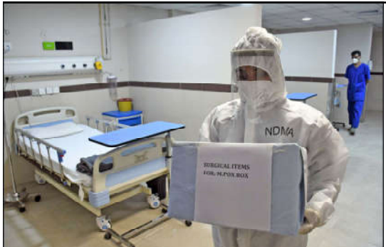
KARACHI: Paramedical staff prepare an isolation ward set up as a preventative measure at a hospital, following Pakistan's health ministry has confirmed a case of m.pox in the Khyber Pakhtunkhwa province, in the Provincial Capital.