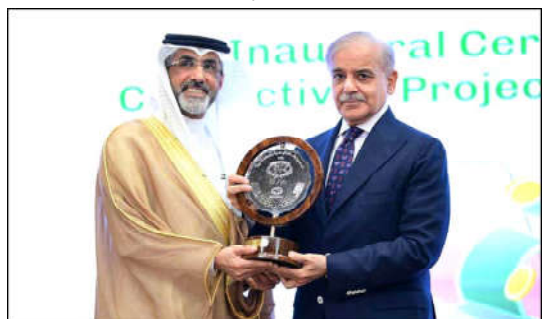
ISLAMABAD: Prime Minister Muhammad Shehbaz Sharif presenting a memento to Chairperson Arab Monteray Fund Dr. Fahad M Alturki at the inaugural ceremony of Buna-Raast Connectivity Project Implementation Phase.

"The root causes of these conflicts range from the legacies of colonialism, internal struggles for scarce food, water and pastures, external competition for precious national resources and interventions designed to suppress the struggle of peoples to reclaim their own political and economic destinies."