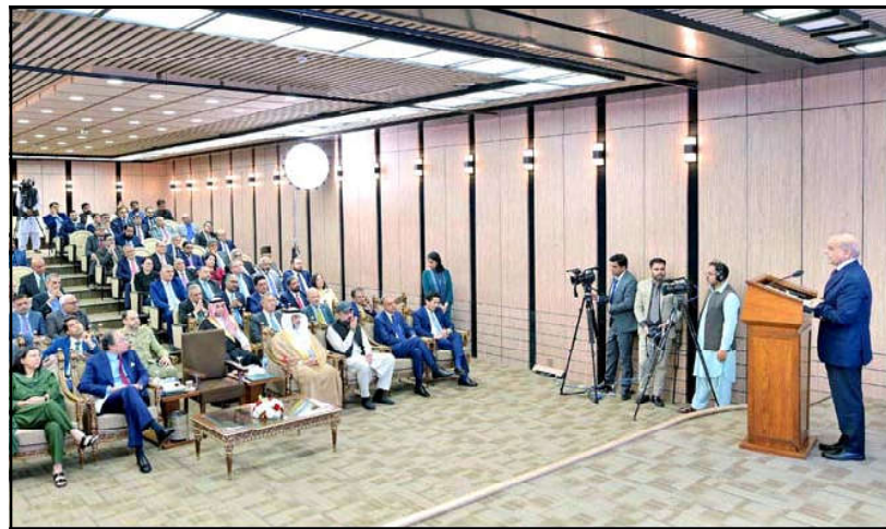
ISLAMABAD: Prime Minister Muhammad Shehbaz Sharif addressing the inaugural ceremony of BUNA-RAAST Connectivity Project Implementation Phase.

RAHIM YAR KHAN (INP): At least 11 policemen were martyred and seven others injured in an attack on police mobile vehicles by dacoits of Kacha near Machka police camp II in Rahim Yar Khan. A group of dacoits launched the attack when one of the vehicles in the convoy broke down. Some of the policemen were also missing after the incident. The culprits first attacked the police vehicles with rocket launchers before opening fire. Injured policemen have been shifted to Sheikh Zayed Hospital in Rahim Yar Khan for treatment. President Asif Ali Zardari and Prime Minister Shehbaz Sharif strongly condemned the attack on a police convoy in Rahim Yar Khan. A press release from the President's House, the President stated that the President extended his condolences to the families of the police officers, who were martyred in the attack. The president emphasised the need for strict action against criminals in the Kacha area and warned that attacks on personnel of police and law enforcement agencies would not be tolerated. The president paid tribute to the martyred policemen and prayed for their elevated ranks. He also wished for the speedy recovery of those injured in the incident. Prime Minister Muhammad Shehbaz Sharif has strongly condemned attack on Police convoy in Rahim Yar Khan. In a statement, he expressed deep sorrow and grief over the martyrdom of police personnel in the attack. The Prime Minister prayed for the elevation of the martyrs' ranks and patience for their families.