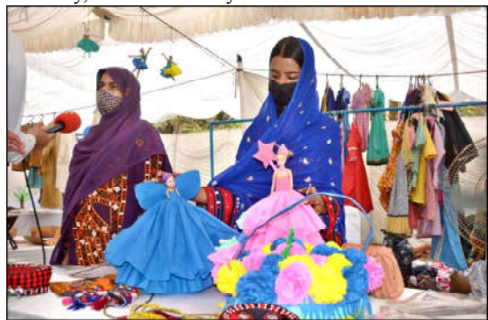
QUETTA: Students exhibiting their skills obtained in 18 months technical training program, under Balochistan Education Support Program II in collaboration with UNICEF and European Union.

During stay at port, Commanding Officer PNS HUNAIN called on RSNF Navy Western Fleet Commander Rear Admiral Mansoor Bin Saood Al Jayyad and Commander King Faisal Naval Base Rear Admiral Saleh Bin Abdullah Al-Amri. During the meeting, matters of mutual interest and bilateral cooperation between both the navies were discussed.