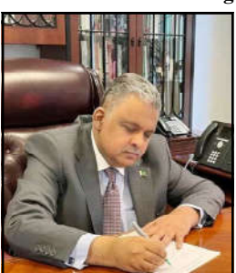
people-to-people contacts would be his top priorities.

Speaking to the mission officers, he also underscored the importance of the Pakistani community in the U.S., describing them as the country's valuable asset.