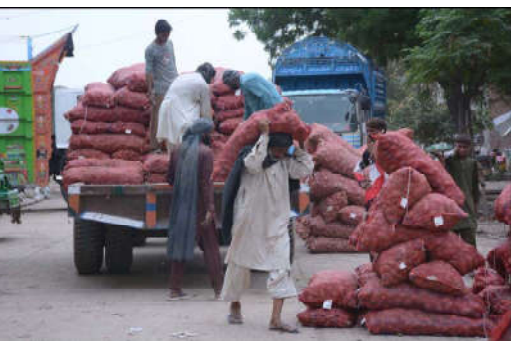
FAISALABAD: Daily wages laborers unload sacks of potatoes from a delivery truck at a bustling vegetable market.

Kashif Anwar highlighted the importance of this initiative stating that this MoU is more than just a formal agreement; it is a strategic alliance aimed at empowering our members with the knowledge and resources they need to meet global standards.