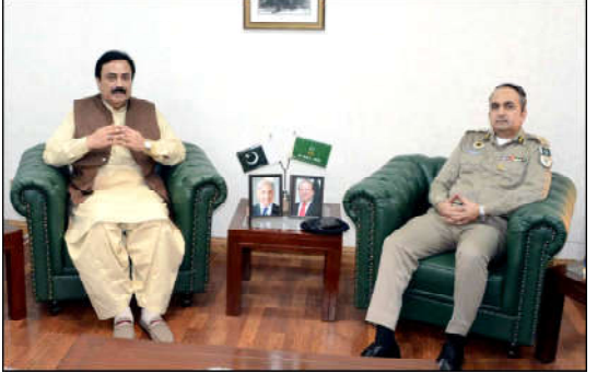
SLAMABAD: Deputy Chairman Senate Syedaal Khan in a meeting with Inspector General National Highways & Motorway Police (NHMP) Salman Chaudhry at Parliament House.

He also called for establishing the branches of the Regional Blood Centers (RBCs) in order districts of the province.