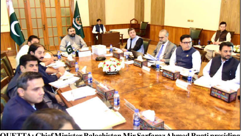
QUETTA: Chief Minister Balochistan Mir Sarfaraz Ahmed Bugti presiding over meeting of Disaster Management Commission

rupees to convert agricultural tube wells on solar energy in Balochistan.