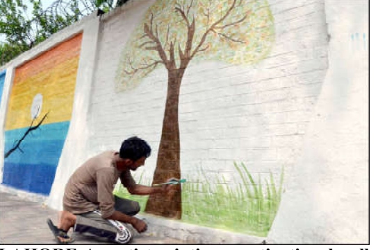
LAHORE:An artist painting a motivational wall mural on the Government Kinnaird High School wall to capturing the students' attention.

The Rescue operation has been completed and de-bris removed after retrievwith his two brothers were ing the bodies.