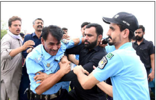
ISLAMABAD: Employees of PWD scuffle with the police during a sit-in protest (Dharna) in favor of their demands at Srinagar Highway in the Federal Capital.