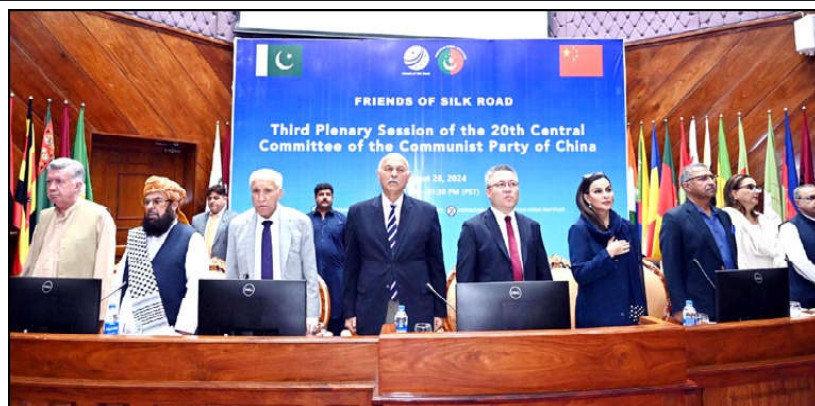
ISLAMABAD: Federal Minister for Maritime Affairs, Mr. Qaisar Ahmed Sheikh was chief guest in the special event program organized by Pak-China Institute in COMSTECH Auditorium.