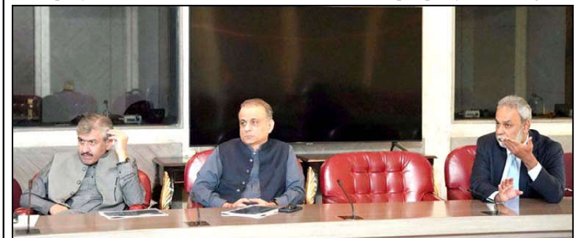
ISLAMABAD: Federal Minister for Communications, Privatization and Board of Investment Abdul Aleem Khan being briefed by Chairman National Highway Authority in the departmental briefing of National Highway Authority.