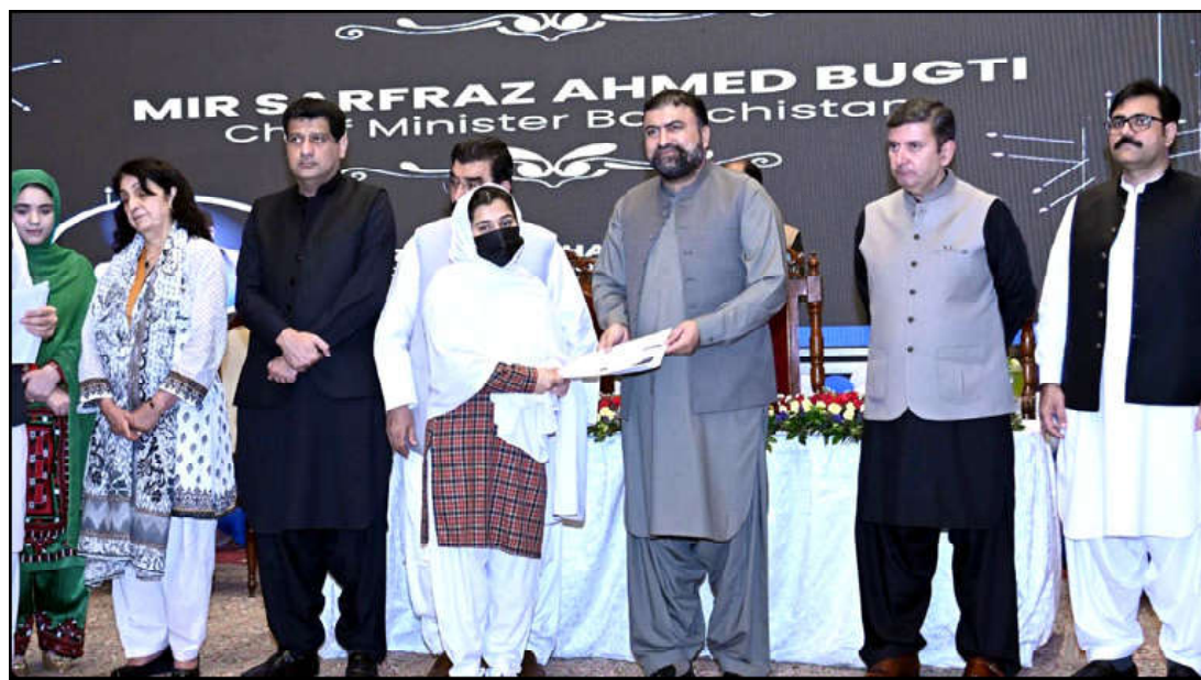
QUETTA: Chief Minister Balochistan Mir Sarfaraz Ahmed Bugti distributing cheques of scholarships through Balochistan Education Endowment Fund (BEEF) under Shaheed Benazir Bhutto Scholarship Program

The traders leaders asserted that the protest would be intensified if the demands were not met.