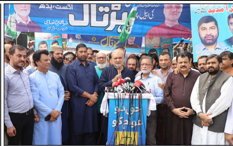
LAHORE: Ameer Jamaat-e-Islami Hafiz Naeem-ur-Rehman talking to media persons along with Traders Organization regarding countrywide shutter down strike during his visit to protest camp.