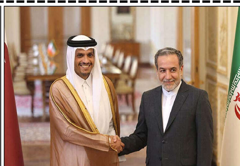
Iran's new foreign minister, Abbas Araghchi, welcomes Qatari Prime Minister Sheikh Mohammed bin Abdulrahman al-Thani ahead of their meeting in Tehran.

Palestinian health officials do not say whether those killed in Israeli strikes are civilians or fighters. Israel says it tries to avoid harming civilians and accuses Hamas of putting them in danger by fighting in residential areas. But the military rarely comments on individual strikes, which often kill women and children. Gaza's Health Ministry says Israel's offensive has killed over 40,000 people in Gaza. The war began when Hamas-led militants stormed into southern Israel on Oct. 7, killing some 1,200 people, mostly civilians, and abducting around 250 people.