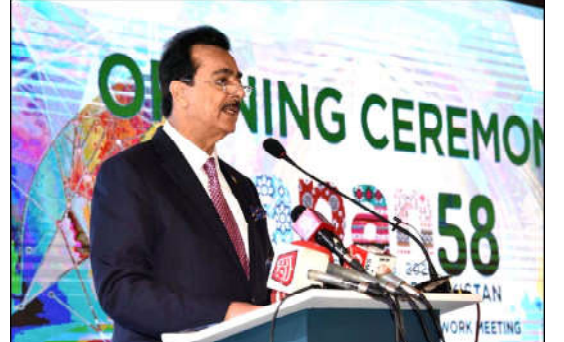
ISLAMABAD: Chairman Senate, Syed Yusuf Raza Gilani addresses during the inaugural ceremony as chief guest of 58th Asia Pacific Advanced Network (APAN) Meeting held in Islamabad.

Gwadar are being collectively punished and that the government's promises have proven to be false. The alliance demanded that the government provide electricity from the national grid, citing the presence of power generation projects in the region. However, KESC officials expressed helplessness, citing the long transmission line as a major obstacle.