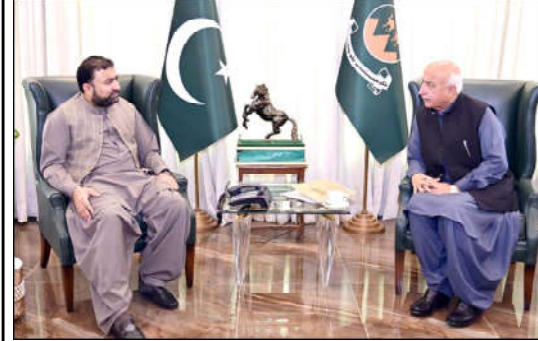
QUETTA: President National Party, MP Dr. Abdul Malik Baloch meeting with Chief Minister Balochistan Mir Sarfaraz Bugti

He said that our journey toward becoming a paperless chamber is well underway, with significant steps being taken to digitize all processes. This shift aims to ensure that our work is more transparent, efficient, and accessible. He informed that steps have been taken to develop internal digital communication mechanisms, including the creation of a comprehensive dashboard.