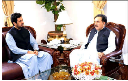
QUETTA: Provincial Minister for Finance Mir Shoaib Nausherwani meeting with Governor Balochistan Sheikh Jaffar Khan Mandokhail

The Leader of the House further stated that the State had collectively adopted the policy of operation of Zarb-e-Azb and Radd-ul-Fasad to counter the terrorism after the Army Public School attack in 2013 and law and order situation improved but unfortunately during the recent past the terrorist brought back and released from jails resultantly increase in crimes and terrorist attacks. The senator added that there was a need to think above the politics of Pakistan and resolve the country's problems being faced. He seconded the resolve of Chief Minister Balochistan that no one could be allowed to carry out violence in the name of nationality.