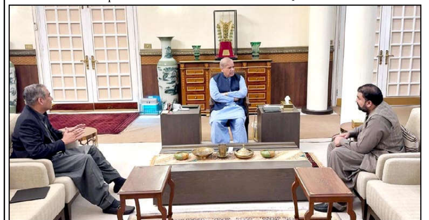
ISLAMABAD: Federal Minister for Interior Syed Mohsin Raza Naqvi and Chief Minister Balochistan Sarfraz Bugti call on Prime Minister Muhammad Shehbaz Sharif.

Khaliq Sheikh, and other concerned high ups particularly focused on the law and order situation in backdrop of different terrorists attacks in parts of Balochistan occurred on August 25 and 26. The meeting also decided to get approval of the required funds for improving security situation in the province from the Apex committee. Besides the meeting also decided to increase staff and facilities in order to resolve the issues of pass-ports in Chaman.