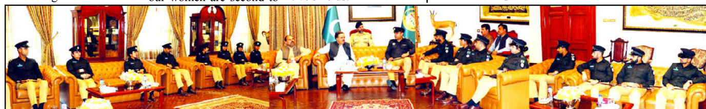
QUETTA: Under trainee officers of Police Service of Pakistan (PSP) of National Police Academy Islamabad meeting with Governor Balochistan, Sheikh Jaffar Khan Mandokhail

gravity of the situation into account, Washington strongly regretted the deaths of law enforcers and civilians in Balochistan's Musakhail and other areas. "Our hearts go out to the families and loved ones of those killed in yesterday's attacks. The United States will continue to stand shoulder-to-shoulder with Pakistan in its fight against terrorism," the US embassy in Islamabad wrote on its official X account.