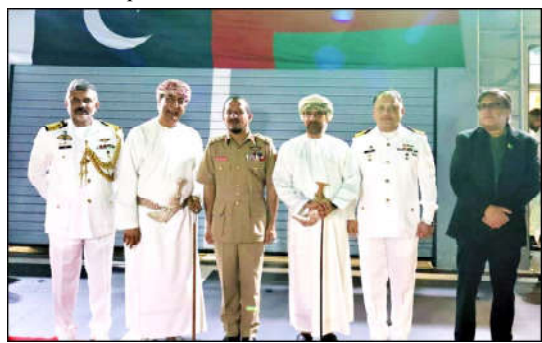
Civil and military dignitaries visiting PNS YARMOOK at Muscat, Oman.

Senator Shibli Faraz said the situation in Balochistan needed to be addressed through effective measures and the government should take the House into confidence on the matter. He emphasized the need for conducive environment in the province to attract investments, and improve stability. The Opposition Leader also regretted the delay in production orders of the detained Senator Ejaz Chaudhry of Pakistan Tehreek-e-Insaf. He demanded the government to probe the incidents and address the issues of Balochistan on priority. Minister for Law and Justice and Parliamentary Affairs, Senator Azam Nazeer Tarar said during the previous regime, selective use of production orders' law was employed. However, he said, Senator Ejaz Chaudhry was arrested in many cases registered under criminal procedure laws and under judicial custody as per the court orders.