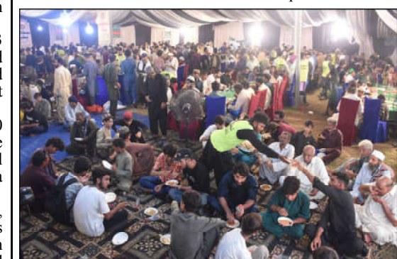
LAHORE: Members of a charity distributing Langar, free food to devotees at the 981st annual Urs of Hazrat Data Ali Hajveri.