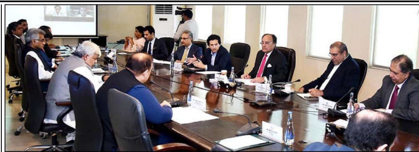
ISLAMABAD: Federal Minister for Finance and Revenue, Senator Muhammad Aurangzeb chaired the Steering Committee Meeting on the Pakistan Raises Revenue Program (PRRP) at the Finance Division.

KARACHI (APP): Four ships, Beek-6, Fairchem Mako, Chemroute Pegasus and Asklipios scheduled to load/offload Rice, Palm oil, Chemicals and LNG, berthed at Grain Terminal, Liquid Terminal, Engro Terminal and Port Gas Terminal respectively on Sunday. Meanwhile seven more ships, MSC Positano, APL Antwerp, MSC Silvia, Lydia, Tivolo Park, Amorgos and Marangas Asclepius carrying Container, Mogas, Chemicals, Coal and LNG are arrived at outer anchorage port during last 24 hours.