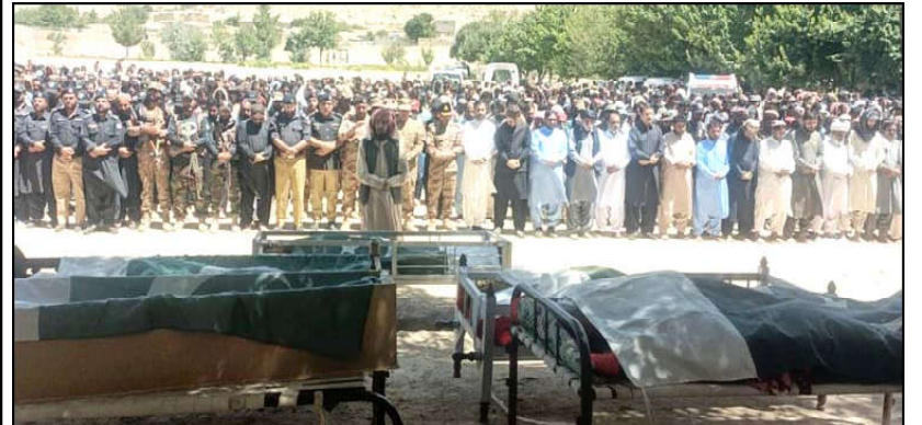
KALAT: Funeral prayers of police and levies personnel who embraced Shahadat during fight with terrorists being offered