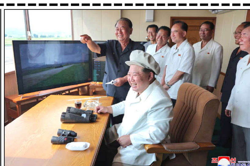
North Korean leader Kim Jong Un oversees a performance test of drones during a visit to the Drone Institute of North Korea's Academy of Defence Sciences at an undisclosed location in North Korea.

According to Prime Minister Denys Shmyhal, 15 Ukrainian regions sustained damage from the missile and drone barrage. Zelenskiy said the energy sector had suffered "a lot of damage".