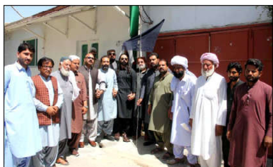
QUETTA: Jamhoori Watan Party (JWP) flag flying half-mast at Bugti House in connection of death anniversary of Leader of JWP Nawabzada Akbar Khan Bugti, in Quetta.

Independent Report QUETTA: Senator Samina Mumtaz Zehri, the chairperson of the Senate Standing Committee on Human Rights, has strongly condemned the terrorist incidents in other areas of Balochistan, including the killing of innocent people in the terrorist incidents in Musakhel. Expressing deep grief and anger. She said in her condemnation statement that humanity is ashamed of the Musa Khel incident, that innocent people were thrown from the vehicles and killed. Knowing the cowardly enemy and their facilitators will not be able to escape in any way. Very soon all these cowardly elements will be sent to hell. In her condemnation statement, she condemned the incident as little as possible. She further said in her