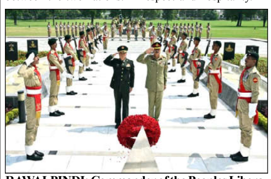
RAWALPINDI: Commander of the Peoples Liberation Army (PLA) Ground Forces, General Li Qiaoming paid respects at the Yadgar-e-Shuhada by laying a floral wreath during his visit to General Headquarters (GHQ) in Rawalpindi.

QUETTA: The Chief Minister Balochistan, Mir Sarfraz Bugti has categorically stated that the provincial government is ready for extraordinary measures in otherwise exceptional circumstances, and as such directed to the counter terrorism department (CTD), police, levies force and other law enforcement agencies to prepare comprehensive plan for security.