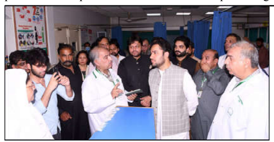
LAHORE: Punjab Minister for Labour and Human Resource Faisal Ayub Khokhar during his visit to Social Security Hospital Multan Road.