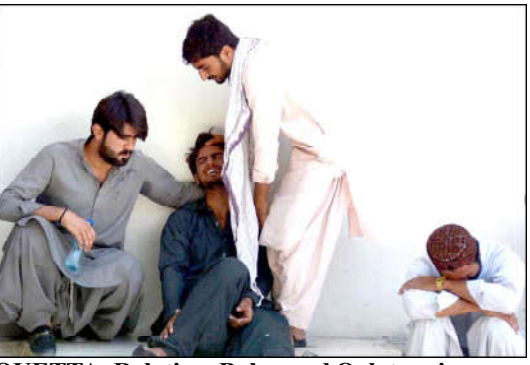
QUETTA: Relatives Bolan and Qalat crying over the dead of his love one at hospital. 6 person of Bolan and Qalat incident shifted to civil hospital.

ISLAMABAD (APP): Minister for Information and Broadcasting Attaullah Tarar has urged political parties to refrain from doing politics on the issue of terrorism.