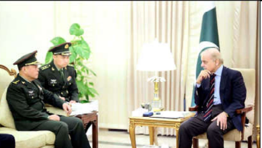
ISLAMABAD: Commander of the Ground Forces of the People's Liberation Army of China, General Li Qiaoming calls on Prime Minister Muhammad Shehbaz Sharif.

Kalat SSP Dostin Dashti reported that gunmen exchanged fire with law-enforcement agencies throughout the night on the national highway and within the city.