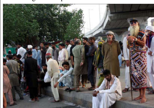
LAHORE: A huge number of devotees of Hazrat Ali Bin Usman Hajveri, popularly known as Data Ganj Bakhsh (RA) are gathered to attend 981th Annual Urs celebrations held at his shrine in Lahore.

ensuring a robust presence throughout the event. To enhance the safety of female visitors, lady police officials have been assigned for security duties and the checking of women entering the premises. In addition, 81 checkpoints, nine check-posts, and 12 walk-through gates have been established around Data Darbar to maintain strict security protocols. The CCPO Lahore affirmed that stringent security measures are in place to protect thousands of devotees expected.