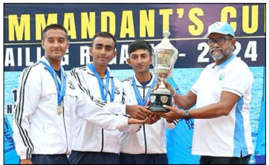
Victorious cadets of Pakistan Naval Academy receiving medals and trophy from Sri Lankan Naval Chief in International Inter-Navies Sailing Championship at Trincomalee, Sri Lanka.

Mohsin Naqvi welcomed the devotees coming from all over the country and the world. Saints including Hazrat Data Ganj Bakhsh (RA) taught peace and harmony in the subcontinent, he said.