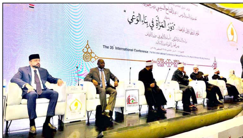
CAIRO: Federal Minister for Religious Affairs and Interfaith Harmony Chaudhry Salik Hussain attending an International Conference on role of women in building awareness.

According to media reports, a bus carrying Zaireens fell into a ravine on the Makran Coastal Highway, resulting in a number of deaths and injuries to other passengers.