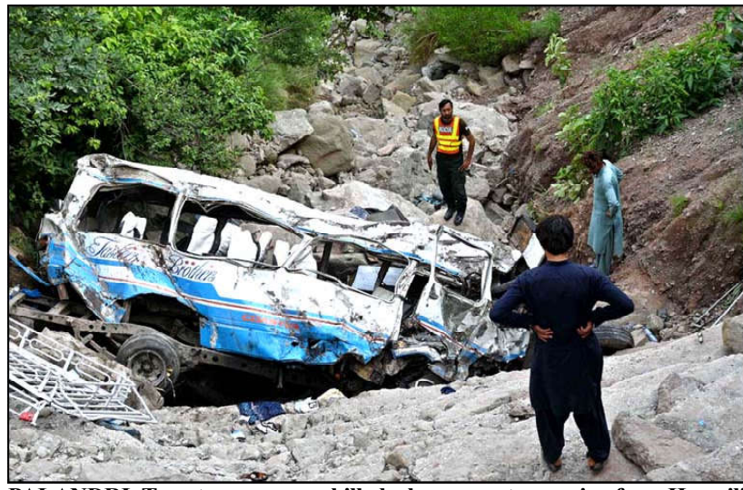
PALANDRI: Twenty passengers killed when a coaster coming from Hawaii Kahuta to Rawalpindi fell into a ditch near Azad Pattan.

The Chairperson also emphasized that this technology-driven approach is a testament to BISP's commitment to innovation and excellence in serving the most vulnerable populations. Replying to a query, she said with the new banking system in place, BISP beneficiaries will have greater control over their finances enabling them to make informed decisions about their economic well-being. This enhanced financial autonomy is expected to have a positive impact on their overall quality of life, empowering them to break the cycle of poverty and build a brighter future for themselves.