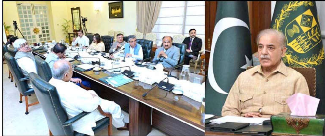
LAHORE: Prime Minister Muhammad Shehbaz Sharif chairs a meeting regarding the closing down of the Public Works Department.