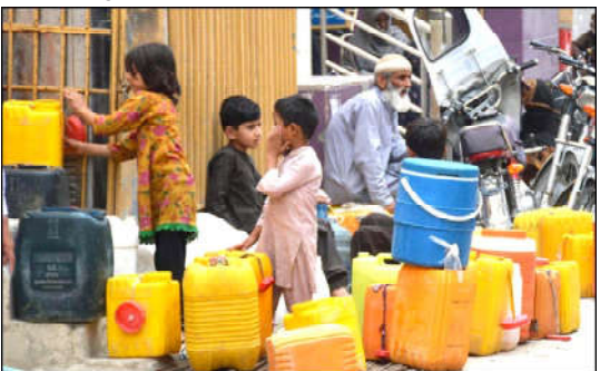
QUETTA: Children filling their canes with clean water at Rehmat Colony Sakri road due to shortage of clean drinking water in the city.

He concluded by asserting that Jamaat-e-Islami's contributions to national defense, legal reforms, and public service are well-documented.