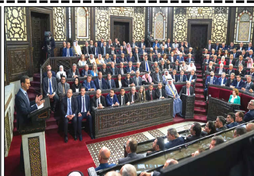
Syria's President Bashar al-Assad speaks to the Syrian parliament in Damascus, Syria.

In Israel, Prime Minister Benjamin Netanyahu has locked horns with ceasefire negotiators over his insistence that Israel will not pull out of the so-called Philadelphi Corridor in the south of the Gaza Strip, a person with knowledge of the talks said. The Philadelphi Corridor, along the border with Egypt, and the Netzarim Corridor cutting across the middle of the Gaza Strip, have been two of the main sticking points in talks backed by Egypt, Qatar and the United States. Netanyahu has repeatedly insisted that Israel will not give up control of the Philadelphi Corridor, accusing Hamas of smuggling weapons and fighters across the border with Egypt. He has also said Israel must maintain checkpoints in the Netzarim Corridor to stop the "movement of Hamas fighters from southern Gaza into the north".