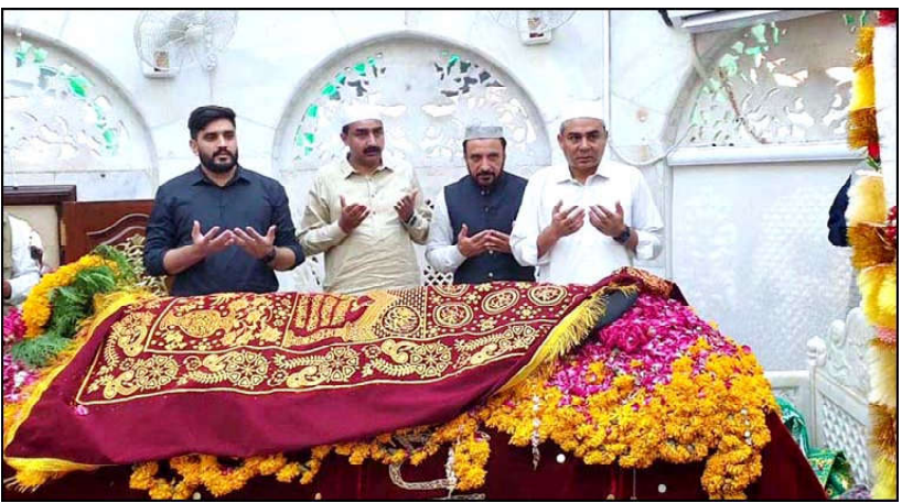
LAHORE: Interior Minister Mohsin Naqvi offering Fateha at the shrine of Hazrat Ali bin Usman Data Ganj Bakhsh Hijveri (RA).