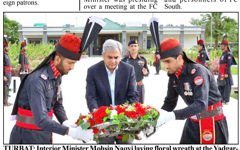
TURBAT: Interior Minister Mohsin Naqvi laying floral wreath at the Yadgar--Shuhada in Frontier Corps Balochistan (South) Headquarters.