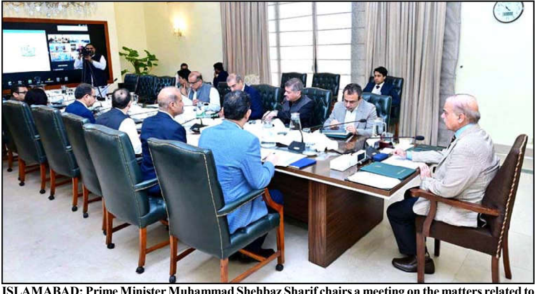
ISLAMABAD: Prime Minister Muhammad Shehbaz Sharif chairs a meeting on the matters related to

Ph: 2841470/2841473 Vol: XX No. 43, Safar 13, 1446 AH Monday August 19, 2024, Pages 04, Price Rs.15