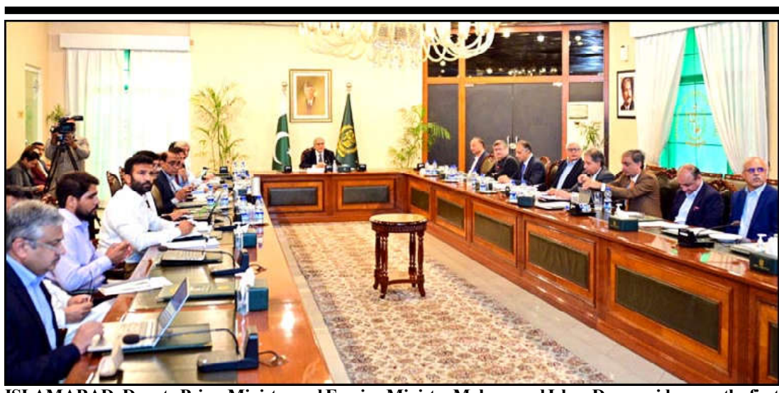
ISLAMABAD: Deputy Prime Minister and Foreign Minister Mohammad Ishaq Dar presides over the first meeting of a committee, formed to consider the issues faced by the petroleum sector's E&P companies.