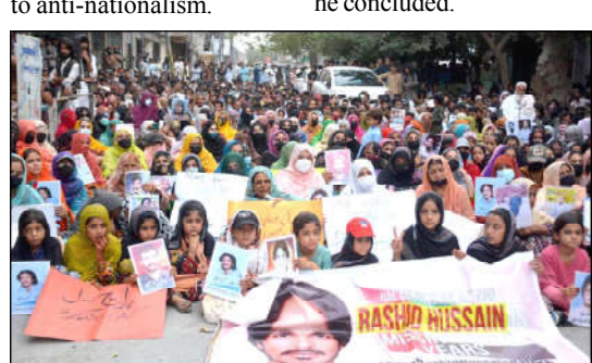
QUETTA: Relatives of missing persons hold a protest outside Ouetta Press Club.

"We all should fight together to eradicate conspiracies against Pakistan, he concluded.