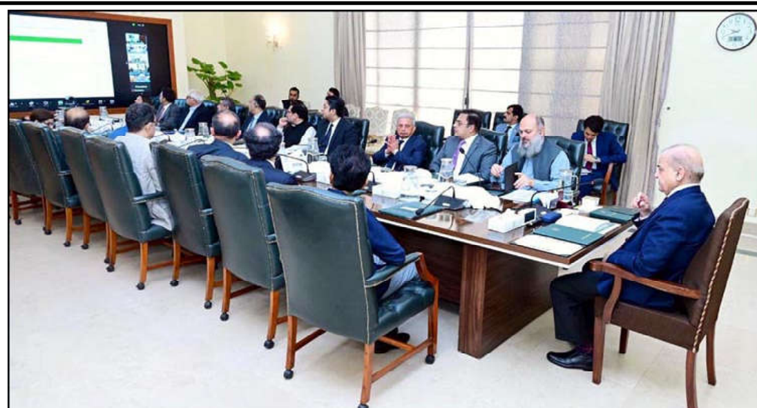
ISLAMABAD: Prime Minister Muhammad Shehbaz Sharif chairs a meeting regarding development of gemstone sector.

participants that the government would not allow smuggling of the gemstones and sought a report on the subject within a week, after consultation with the GB government. The prime minister also called for the priority measures to achieve the international certification of Pakistan's gemstones. In the briefing, it was told that a total of 178 licenses had so far been issued for mining of gemstones.