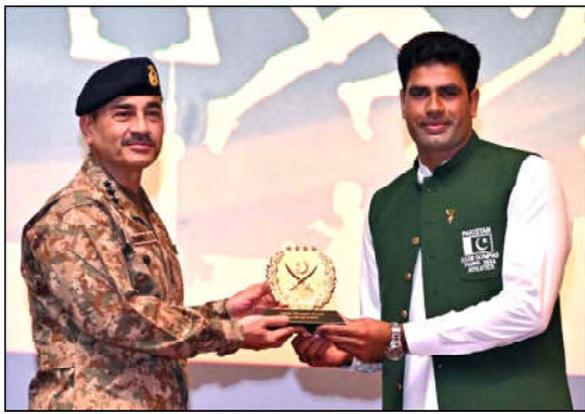
RAWALPINDI: Chief of Army Staff (COAS), General Asim Munir presenting a shield to Arshad Nadeem, Javelin Throw Olympian Gold Medalist during a ceremony in his honor held at Army Auditorium General Headquarters (GHQ) in Rawalpindi.

RAWALPINDI (APP): Chief of Army Staff (COAS), General Syed Asim Munir on Friday appreciated Arshad Nadeem's remarkable achievement of winning Pakistan's first-ever gold medal in a singles' event and setting a new Olympic record in javelin throw, attributing it to his commitment, perseverance, and passion for excellence. The Army Chief hosted a ceremony at Army Auditorium GHQ to honour Olympian Arshad Nadeem's historic achievement in Paris Olympics 2024 here, an Inter Services Public Relations (ISPR) news release said. The COAS highlighted Arshad's inspirational journey from humble beginnings to achieving greatness, emphasizing the importance of hard work and determination. The Army Chief recognized Arshad Nadeem's achievement as a national pride and highlighted that he has been honoured by the complete nation befitting his achievement.