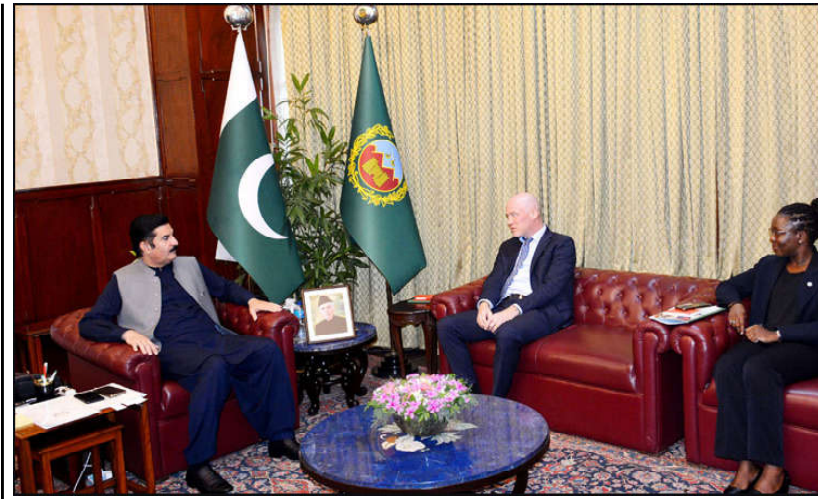
PESHAWAR: Governor Khyber Pakhtunkhwa Faisal Karim Kundi is called on by ICRC delegation Head in Pakistan Nicolas Lambert at Governor House.

previously provided substantial relief to earthquake and flood victims in 2010 and 2022. The Governor Kundi acknowledged the valuable contribution of the ICRC in the province's relief activities, particularly during natural disasters. Faisal Karim Kundi suggested that the ICRC focus on enhancing health and education services in the merged districts. He noted the significant impact of environmental changes and terrorism on Khyber Pakhtunkhwa, emphasizing the need for better health and education systems in the province's rural southern districts.