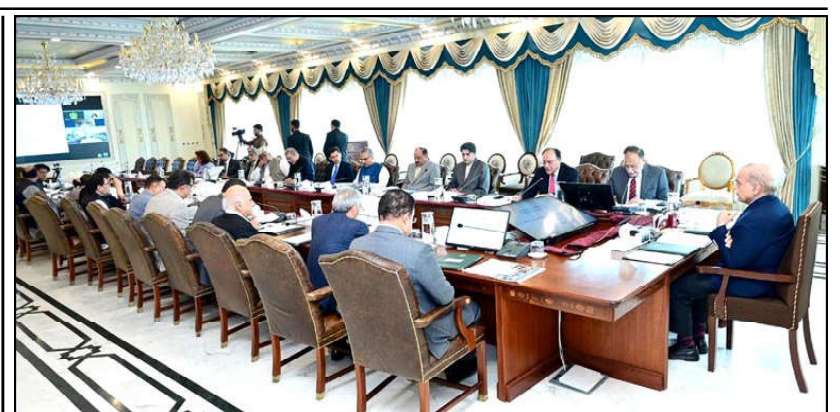
ISLAMABAD: Prime Minister Muhammad Shehbaz Sharif chairs a meeting on Rightsizing of Government Size.

QUETTA (APP): Spokesman of Balochistan Government Shahid Rind on Friday said that Balochistan Chief Minister chaired the cabinet and approved the appointment of 4000 teachers in the inactive schools of the department in the province. He said that these appointments would be made for 18 months and at the Union Council level. He expressed these views while addressing a press conference at Chief Minister House here. Mr. Shahid Rind said that several important decisions were taken in the cabinet meeting chaired by Balochistan Chief Minister Mir Sarfraz Bugti. He said that the Health and education were on top of the agenda in the cabinet meeting. He said that an inquiry report against Vice Chancellor Sardar Bahadur Khan Women's University was presented in the provincial cabinet meeting. The cabinet has decided to remove the vice chancellor of SBWU after considering the inquiry report, recommendations would be sent to Governor Balochistan to remove the VC.