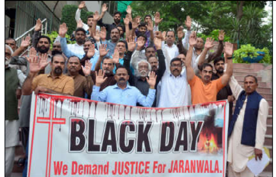
RAWALPINDI: Members of the Christian community held a protest demonstration outside the Press Club against the Jaranwala incident.