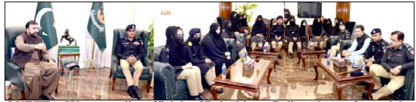
QUETTA: Women police officials of Balochistan Police who performed duties during the protests in Gwadar and Quetta meeting with Chief Minister Balochistan Mir Sarfaraz Ahmed Bugti

Jaffar Mandokhail hails interest of Russia in restoration of Quetta-Taftan railway track; believes initiative to promote economic activities, investment and bonds among masses; says Pak could break the statuesque of the whole region ISLAMABAD (APP): The Governor Balochistan, Sheikh Jaffar Khan Mandokhail has expressed optimism about the better relations between Pakistan and Russia in future. He also hailed the interest of Russia in restoration of the railway track between Quetta-Taftan believing that the initiative would help promote the economic activities, investment and relations among the people. The Governor was speaking to the Pakistani ambassador to Russia, Mir Muhammad Khalid Khan Jamali who called on him here at the Governor's House on Friday. During the course of meeting, matters were discussed about emerging political and economic changes, new prospects of development and cooperation between the Asian countries and promotion of economic growth and regional coordination. He said that he is optimistic about future of relations of Pakistan and Russia. He said that Pakistan is starting new era of development and partnership for building bright future of the nation and coming generations.