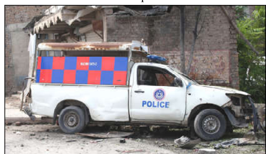
PESHAWAR: A view of damage police van seen at blast site. At least five people, including two police personnel, have been injured in an explosion at the Warsak Road in the Pir Bala area.

ISLAMABAD (INP): The Secretary of Railways has revealed that 67% of Pakistan Railways' tracks have exceeded their operational lifespan. The revelation was made during a Senate committee meeting on railways chaired by Senator Jam Sadiq Khan on Friday. The Secretary also disclosed that the design of the Main Line 1 (ML-1) project was altered due to the impact of recent floods. The revised PC-1 now estimates the project's total cost at approximately $6 billion, down from the initial $9 billion, despite the significant design changes. Senator Kamil Ali Agha questioned the unchanged cost despite the redesign, expressing concerns about compromising the project. He also raised alarms about the risks associated with the loans from China. The Secretary assured that there has been no compromise on ML-1's security and management, and emphasized the project's financial viability. In a related development, the committee was informed that the investigation into corruption involving 10 mysterious employees in Karachi has been inexplicably halted, leaving committee members surprised and concerned.