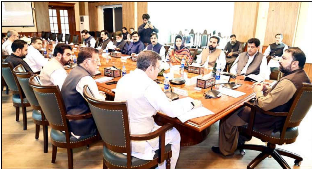
QUETTA: Chief Minister Balochistan Mir Sarfraz Ahmed Bugti presiding over meeting of Provincial Cabinet

Ph: 2841470/2841473 Vol: XX No. 42, Safar 11, 1446 AH Saturday August 17, 2024, Pages 04, Price Rs.15