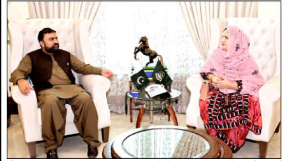
QUETTA: MNA Akhtar Bibi meeting with Chief Minister Balochistan Mir Sarfaraz Ahmed Bugti

ISLAMABAD (Online): Petition has been filed in Islamabad High Court (IHC) against closure of internet owing to installation of firewall. The petition was filed on Friday making cabinet secretary, IT secretary, and interior secretary respondents. PTA and ministry of human rights are also included in the respondents. The petitioner has requested the court through petition that installation of firewall which is affecting fundamental rights of citizens be stopped. Installation of firewall be linked to consultation with all stake holders and protection of basic human rights.