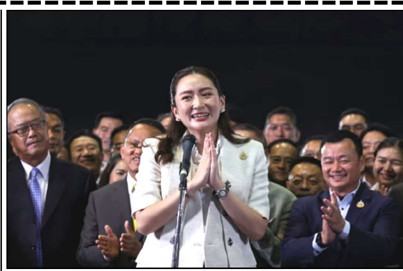
Pheu Thai Party's leader Paetongtarn Shinawatra reacts during a press conference after the Thai parliament confirms her as the country's next prime minister, in Bangkok, Thailand.