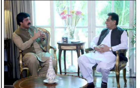
LAHORE: Punjab Governor, Sardar Saleem Haider Khan during his visit to residence of Speaker National Assembly Sardar Ayaz Sadiq discussed the parliamentary affairs and the current situation of the country.

Independent Report LAHORE: Punjab Governor, Sardar Saleem Haider Khan today visited the residence of Speaker National Assembly Sardar Ayaz Sadiq. During the meeting parliamentary affairs and the current situation of the country was discussed. Speaker National Assembly Sardar Ayaz Sadiq expressed good wishes for Punjab Governor. Speaking on this occasion, Punjab Governor, Sardar Saleem Haider Khan said that everyone should play a positive role for the development and stability of the country. Governor