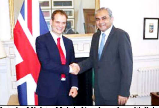
Interior Minister Mohsin Naqvi meeting with British Parliamentary Under-Secretary of State Hamish Falconer in London.

The COAS also cautioned against the insidious threat of fake news and propaganda being perpetrated by inimical elements Services Public Relations to weaken the bond between the people of Paki-