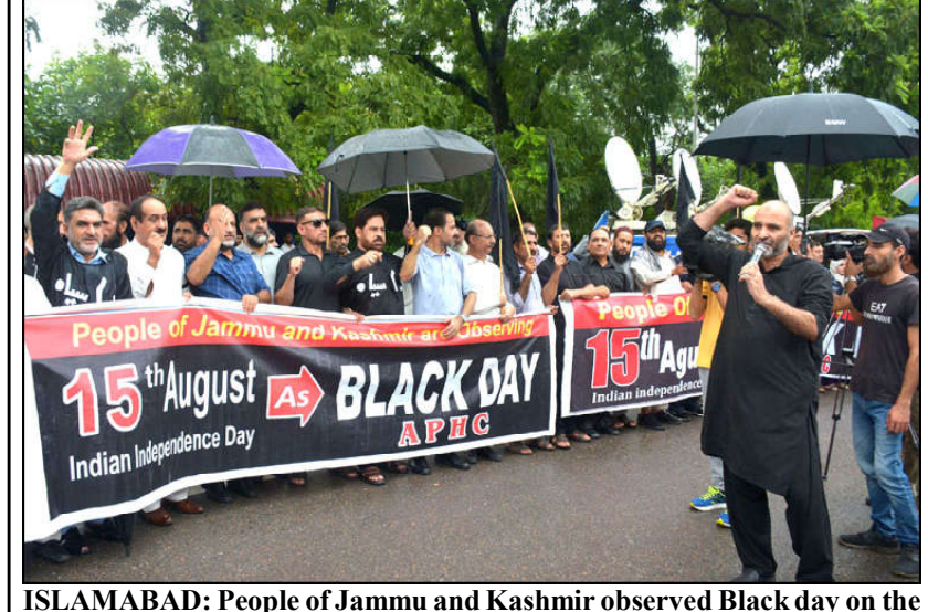
ISLAMABAD: People of Jammu and Kashmir observed Black day on the occasion of Indian Independence day in the Federal Capital.

The Fisheries Department has vowed to continue its crackdown on illegal fishing in the Ormaara marine limits.