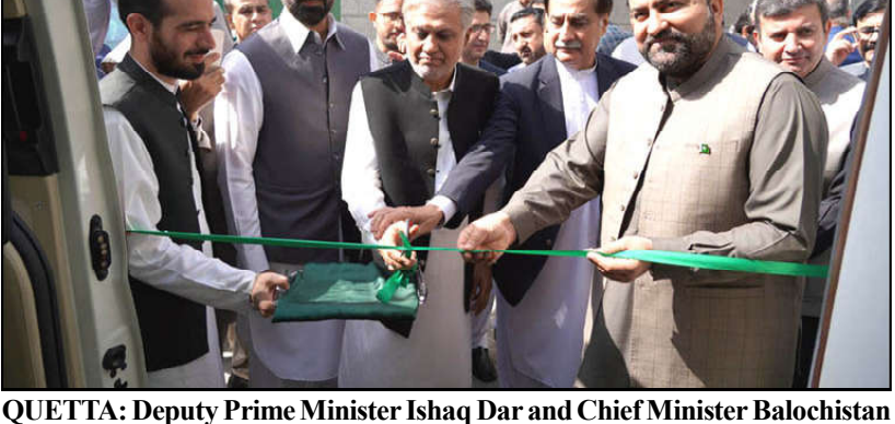
Mir Sarfaraz Ahmed Bugti inaugurating new Registration Centers of NADRA. Speaker National Assembly Sardar Ayaz Sadiq, Provincial Ministers and high officials are also present