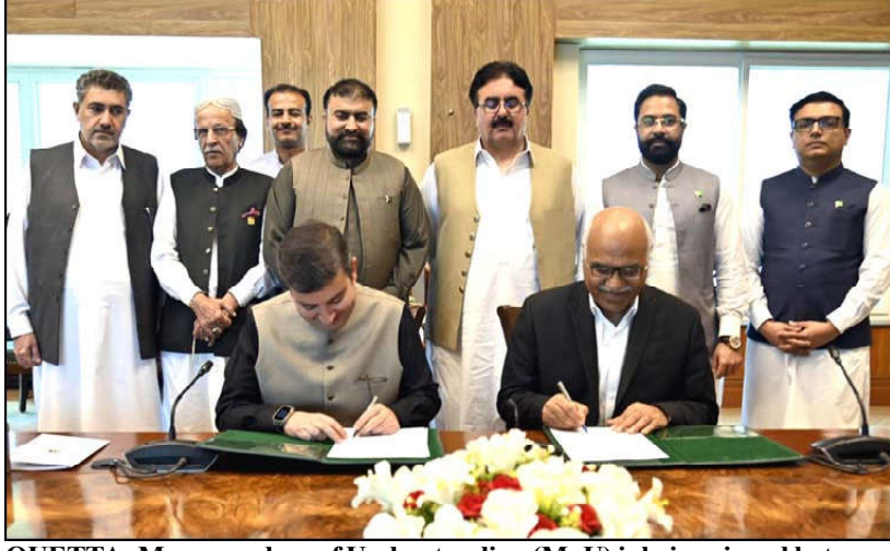
QUETTA: Memorandum of Understanding (MoU) is being signed between Government of Balochistan and Akhuwat Foundation. Chief Minister Balochistan Mir Sarfaraz Ahmed Bugti is also present

However, the timely completion of the federal development projects is conditional with timely release of the funds.