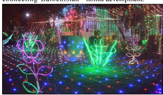
QUETTA: An illuminated view of Metropolitan corporation building decoration with national flag color lights in connection 77th Independence Day celebration.

QUETTA (APP): Governor Balochistan Jaffar Khan Mandukhail on Tuesday directed the National Highway Authority (NHA) to focus on developing its national highways and ensure its timely completion with standard. He said that completion of works on highways would not only boost our economy but also improve the lives of our citizens. He expressed these views while giving a briefing to National Highway Authority West Zone Member Bisharat Hussain at Governor House Quetta. Governor Balochistan said that national highways have a key role in the construction and development of the country and provinces. He said that in the context of Balochistan, Karachi to Chaman N25 and Quetta to Zhob N50 highways should be given more priority as they were important national highways connecting Balochistan