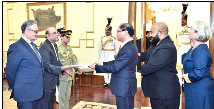
ISLAMABAD: The envoys of Vietnam, Maldives, and Ireland presenting their diplomatic credentials to President Asif Ali Zardari, at Aiwan-e-Sadr.

operation with Pakistan. The president said that Pakistan wanted to further solidify trade, economic and investment relations with friendly countries in all areas of mutual interest. He remarked that Pakistan was focused on boosting bilateral trade volume with all friendly countries. He stated that Pakistan offered great investment opportunities in diverse fields and businesses should invest in agriculture, energy, infrastructure, manufacturing, information technology, mining, and green technologies sectors. Earlier, the envoys were presented guard of honour by a smartly turned-out contingent of Pakistan Armed Forces upon their arrival at Aiwan-e-Sadr.