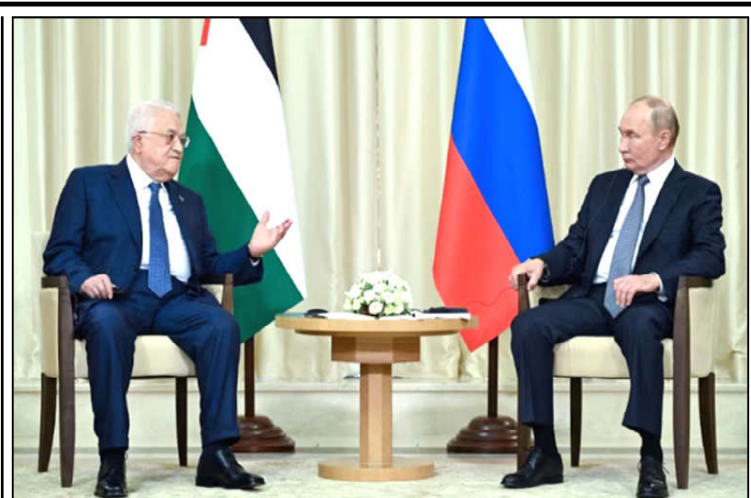
Russian President Vladimir Putin attends a meeting with Palestinian President Mahmoud Abbas outside Moscow, Russia.