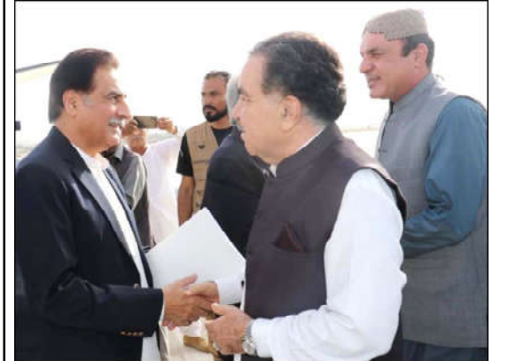
QUETTA: Governor Balochistan Sheikh Jaffar Khan Mandokhail receiving Speaker National Assembly Sardar Ayaz Sadiq upon arriving at Quetta Airport

has come into being for ever. The Deputy Prime Minister was presiding over the meeting about the law and order situation and development projects in Balochistan here at the Chief Minister secretariat on Tuesday. Also present in the meeting were the Speaker National Assembly, Sardar Muhammad Ayaz Sadiq, Chief Minister, Mir Sarfraz Ahmed Bugti, Federal Minister for Trade, Jam Kamal Khan, Member National Assembly, Mir Ejaz Jhakrani, provincial ministers and other senior high ups.