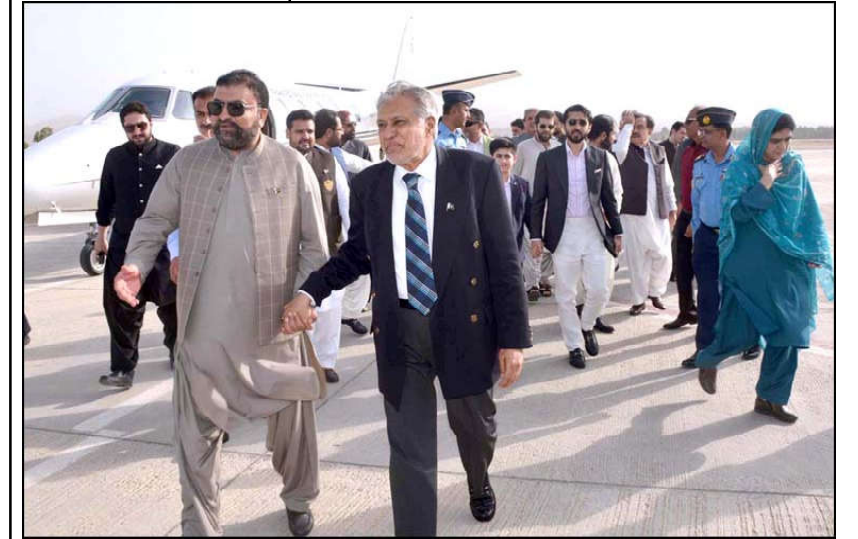
QUETTA: Deputy Prime Minister Muhammad Ishaq Dar and Balochistan Chief Minister Mir Sarfraz Bugti head to the Governor House from Quetta Airport.