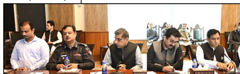
QUETTA: Chief Minister Balochistan Mir Sarfaraz Ahmed Bugti presiding over high level meeting regarding law and order situation

QUETTA (APP): The delegation of Pakistan Muslim League-Nawaz (PML-N)'s parliamentarians led by Balochistan Governor Jaffar Khan Mandukhail met with Deputy Prime Minister (DPM) Muhammad Ishaq Dar at Governor House Quetta here Tuesday. Speaker National Assembly (NA) Sardar Ayaz Sadiq and Federal Minister for Commerce Jam Kamal Khan were also present on the occasion. During the meeting, overall situation of the country, ongoing development projects and ensuring good governance were discussed. In the meeting, it was agreed to make the relations between the federation and the provinces more stable and pleasant with the aim to develop the country.