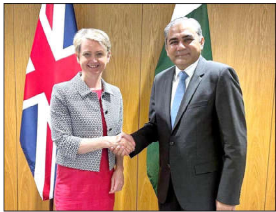
LONDON: Federal Minister for Interior Mohsin Naqvi shaking hands with British Home Secretary Yvette Cooper in London.

ISLAMABAD (APP): The Islamabad High Court (IHC) on Tuesday summoned secretaries of interior and defense, IGP ICT and DG FIA in person on non-compliance of orders to recover two missing brothers. The court also summoned Attorney General Pakistan (AGP) for assistance in the same case on August 15. The bench asked the respondents to clarify that why a contempt of court proceeding shouldn't be initiated against them for non-compliance of orders.