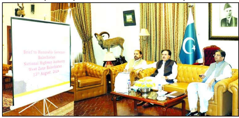
QUETTA: Governor Balochistan Sheikh Jaffar Khan Mandukhail being briefed by Member NHA West Zone Balochistan Bisharat Hussain regarding NHA

ISLAMABAD (APP): Command and Staff Conference of Pakistan Navy concluded here on Tuesday at Naval Headquarters chaired by Chief of the Naval Staff, Admiral Naveed Ashraf that reviewed maritime situation in North Arabian Sea and Gulf of Aden and deliberated on measures for safety and security of national sea trade passing through the region. During the conference, matters related to geo strategic milieu, national security, operational preparedness, training and welfare of troops were reviewed. Comprehensive briefing on important on-going and future developmental projects of Pakistan Navy was also given to Chief of the Naval Staff, a Pakistan Navy news release said. The Naval Chief expressed confidence over combat readiness and significant contribution of the Navy in maritime domain. Chief of the Naval Staff emphasized on strengthening maritime security and maintaining combat readiness so as to effectively respond to any aggression against Pakistan. He urged on acquisition of niche and novel capabilities while exploiting indigenous sources in order to cope with modern day challenges in maritime domain.