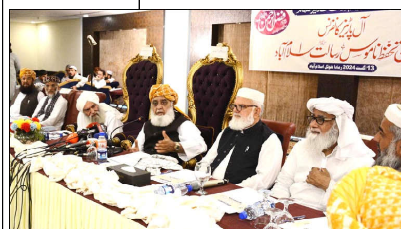
ISLAMABAD: Jamiat-e-Ulema Islam (F) chief of Maulana Fazlur Rehman addressing on the All Parties Tahaffuz Namooos-e-Risalat conference.