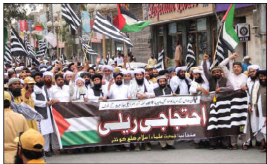
QUETTA: Activists of Jamiat Ulema-e-Islam (JUI-F) are holding protest rally against assassination of Hamas Leader Ismail Haniyeh, at Mannan Chowk.

attended by other members of the committee including the Finance Minister, Minister for Privatization, Minister for Commerce, Minister for Power, Minister for Industries & Production, Minister of State Finance and Revenue besides Federal Secretaries of various Ministries and Division. The CCOP was presented with a phased Privatization Programme (2024-29) by the Ministry of Privatization, based on the recommendations of the PC Board, in terms of Section 5(b) of the Privatisation Commission Ordinance 2000. The CCOP recommended that priority should be accorded to reducing the federal footprint in commercial space and limiting it to the strategic and essential SOEs only. CCOP emphasized that even SOEs making profits would also be considered for privatization.