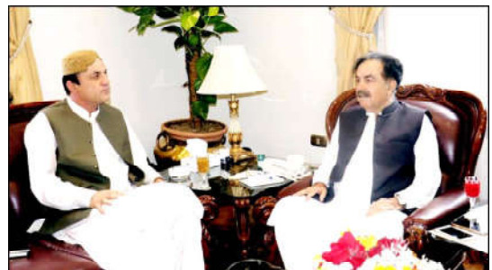
QUETTA: Speaker Balochistan Assembly Captain (Retd) Abdul Khaliq Achakzai meeting with Governor Balochistan Sheikh Jaffar Khan Mandokhail

The ministry has also vowed to reopen all roads for traffic and remove obstacles, ensuring the smooth movement of vehicles. Additionally, the deputy commissioner has assured that arrested individuals will be released once the protesters disperse peacefully. The sit-in began when protesters were prevented from attending the BYC's meeting in Gwadar, resulting in the dispersal of convoys and injuries to 14 people in Mastung.