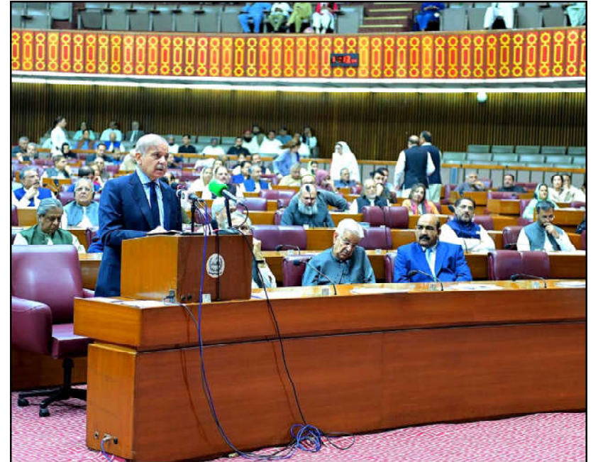
ISLAMABAD: Prime Minister Muhammad Shehbaz Sharif addressing National Assembly Session on situation in Palestine.

"The cities have turned into cemeteries. The cries have taken over the joys and smiles of the playing children. Palestine is giving a deserted look," the prime minister said and questioned the inaction and helplessness of the world to end the Israeli oppression. He said not only the Muslims rather every peace-loving human being, regardless of faith or creed, was questioning the non-implementation of the international laws and human rights charters for which the world bodies including the United Nations were created. "This is a question by an infant who was killed moments after his birth. This is a question by a mother, now in paradise, whose baby was aborted after she was killed. This is a question by a child awaiting his mother in the hospital... Finally, the answer has to be given," he remarked.