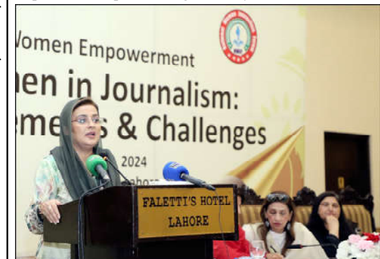
LAHORE: Punjab Information Minister Azma Bukhari addressing a ceremony titled "Problems faced by women journalists: progress and solutions", organised by the National Women Journalists Forum (NWJF).

ongoing development projects and devolving project authorities to the local level. He directed the elected representatives to propose projects based on local needs and priorities, ensuring wise use of public taxes. He also announced that these development projects would only be inaugurated when they were fully completed and providing public services. The chief minister said that he was working to strengthen local government institutions to resolve public issues locally.