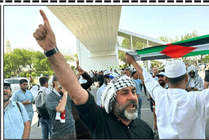
Mourners shout slogans in the grounds close to the Imam Muhammad bin Abdul Wahhab Mosque during the final prayers for Hamas leader Ismail Haniyeh during his funeral in the Qatari capital Doha.