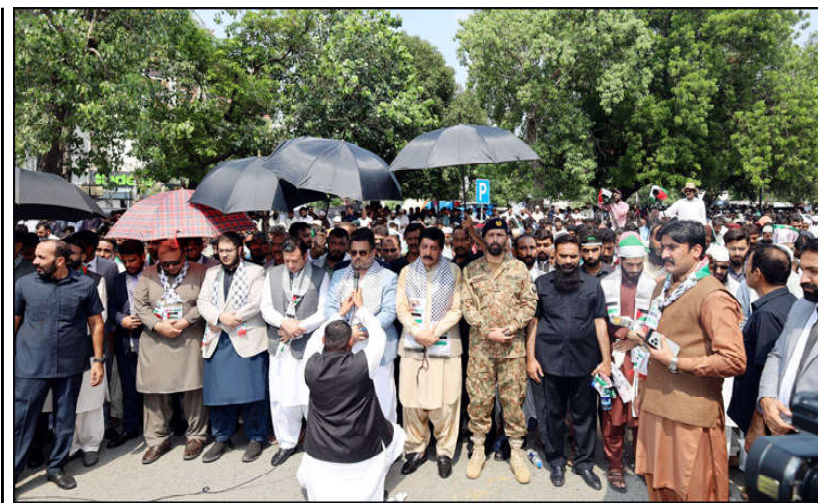
LAHORE: Governor Punjab Sardar Salim Haider and a large congregation offer absentia funeral prayers for Ismail Haniyeh at Masjid Shahada.