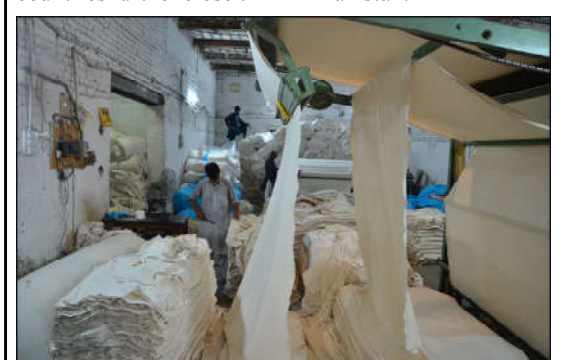
FAISALABAD: A labourer working in a local industry in the city.