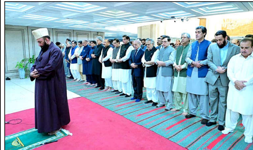
ISLAMABAD: Prime Minister Muhammad Shehbaz Sharif and Parliamentarians offering funeral prayer of Shaheed Ismail Haniyeh.