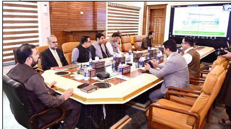
QUETTA: Chief Minister Balochistan Mir Sarfaraz Ahmed Bugti participating in a meeting through video chaired by Federal Minister Musaddiq Malik to review progress on Kachhi canal

The delegation members apprised the prime minister of the Coalition's services in Pakistan's IT sector.