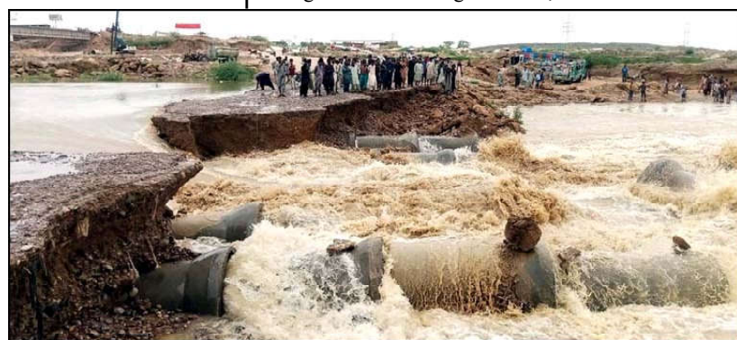
HUB: View of destruction at Hub River Causeway road once again due to floods causing of poor sewerage system creating problems for commuters and residents, after heavy rainwater flowed in area due to heavy downpour of monsoon season, showing negligence of concerned authorities, in Hub.

Keeping in view the hot weather, provision of cool water and shade should be ensured for the users.