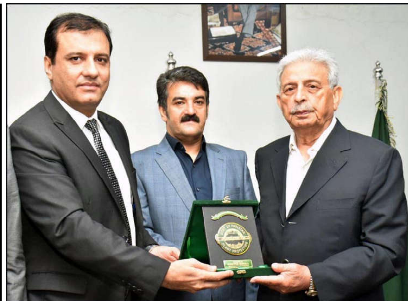
KARACHI: Federal Minister for National Food Security and Research Mr. Rana Tanveer Hussain Presented a Memento by the Director General of Department of Plant Protection.