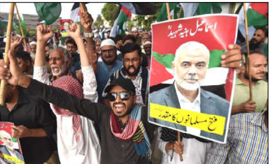
KARACHI: Karachi Jamaat e Islami hold protest against Israel Government after killing of Hamas political chief Ismail Haniyeh in Tehran.

"We are deeply shocked by the timing of this reckless act, coinciding with the inauguration of the President of Iran, an event attended by several foreign dignitaries, including the Deputy Prime Minister of Pakistan," according to a Foreign Office press release.