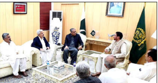
ISLAMABAD: Federal Minister for Interior Mohsin Naqvi in a meeting with a delegation from Kurram led by MNA Hamid Hussain.

The bill is now set to be presented to the National Assembly for final approval on Friday.