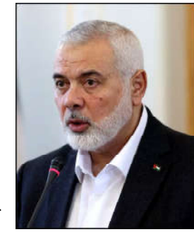
ate comment from Israeli authorities.

The news, which came less than 24 hours after Israel claimed to have killed the Hezbollah commander it said was behind a deadly strike in the Israeli-occupied Golan Heights, appears to set back chances of any imminent ceasefire agreement in Gaza.