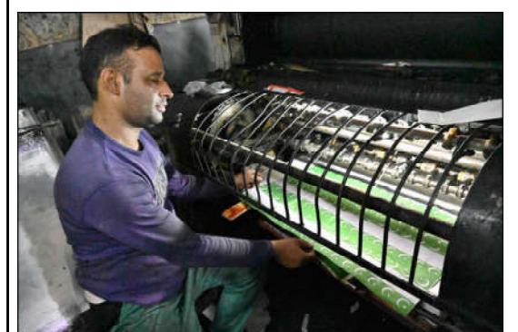
LAHORE: Paper flags of Pakistan are being printed at the printing press in preparation for Independence Day celebrations.