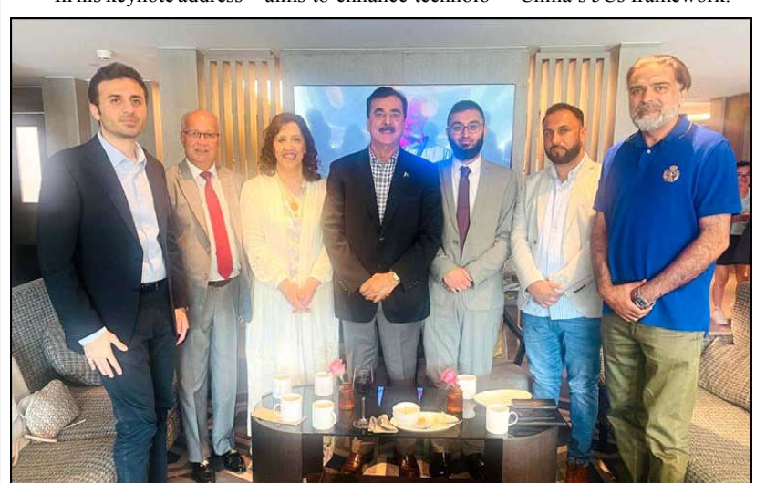
Chairman Senate Syed Yousaf Raza Gilani while leading a delegation of the members of Senate held a meeting with UK based representatives of Jammu & Kashmir self-determination movement, International Lobby on Kashmir and International Students society based in UK London.

In his keynote address on CPEC Phase 2.0, Federal Minister Ahsan Iqbal emphasized that CPEC has been a transformative force for Pakistan's economy, shifting it from the brink of collapse to an attractive investment destination. He highlighted the strong bond of trust and shared vision between China and Pakistan, which has enabled them to overcome initial challenges. Now, as they enter the second phase of CPEC, the focus will be on industrial collaboration, regional connectivity, and socioeconomic development.