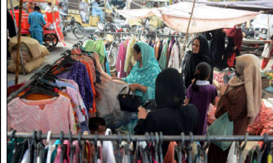
KARACHI: Women purchasing used clothes at Saturday Bachat Bazar.