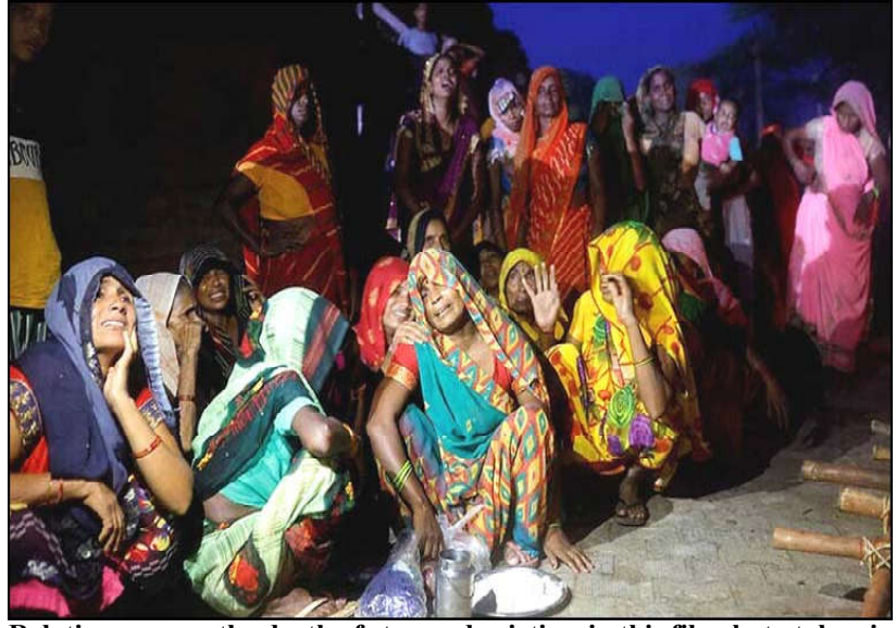
Relatives mourn the death of stampede victims in this file photo taken in Daunkeli village in Hathras district.