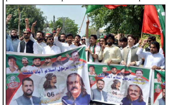
PESHAWAR: Members of Insaaf Students Federation are holding protest demonstration for releasing Tehreek-e-Insaaf Chairman, Imran Khan, held at Peshawar press club