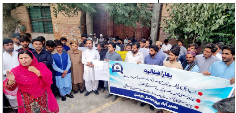
QUETTA: Members of Naseerabad Educational Council are holding protest demonstration for acceptance of their demands, held at Quetta press club

The Chief Minister said that the existing rules are hurdles in termination of the habitual employees and officers.