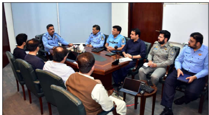
ISLAMABAD: Inspector General of Police (IGP) Islamabad, Syed Ali Nasir Rizvi chaired a high-level meeting to review security arrangement for Muharram. Meeting attended by all division DIGs, SSPs, AIGs, and SPs.

ISLAMABAD (INP): The National Disaster Management Authority (NDMA) has warned of floods and landsliding due to heavy and very heavy falls in many parts of the country. According to latest advisory, heavy and very heavy falls with wind and thundershowers are expected in Islamabad, Khyber Pakhtunkhwa and Azad Kashmir. Hot and humid weather with rain-wind and thundershowers has been forecast for few areas of Sindh and Balochistan while partly cloudy weather with rainfall activity is expected in Gilgit Baltistan. The rains are likely to induce flash floods and landsliding in hilly mountainous regions of Balochistan, Khyber Pakhtunkhwa, Gilgit Baltistan and Azad Kashmir. The NDMA has also warned of hill torrents along Kirthar and KPh-i-Sulaiman ranges which may affect at-risk areas of Balochistan and Punjab. It has also warned of urban flooding in Lahore, Sialkot, Gujranwala, Narowal, Faisalabad, Rawalpindi and Peshawar. Increased temperatures and rains may trigger Glacial Lake Outburst Flooding in vulnerable valleys of KPK and Gilgit Baltistan. From tomorrow, medium to high level flood peaks are expected at river Chenab downstream near Marala, medium level peaks at River Kabul near Nowshera and river Jhelum upstream Mangla dam. In view of the above forecast, NDMA has directed all provincial disaster management authorities to issue early warnings and ensure timely evacuation of at-risk populations from vulnerable areas.