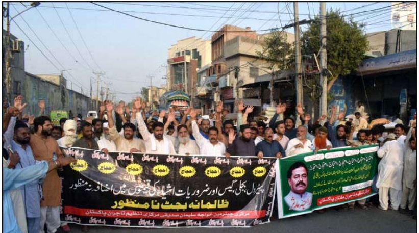
MULTAN: Members of Markazi Tanzeem-e-Tajran are holding protest demonstration against price hiking and the highly inflated electricity bills, held in Multan.