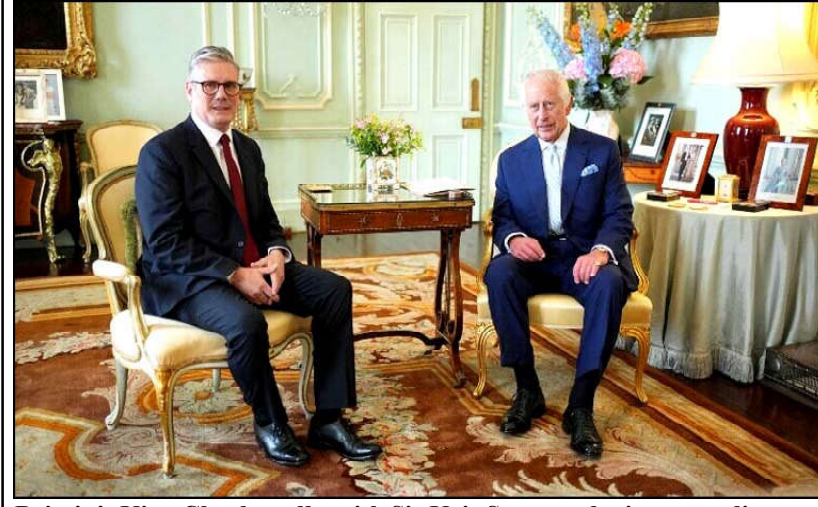
Britain's King Charles talks with Sir Keir Starmer during an audience at Buckingham Palace, where he invited the leader of the Labour Party to become Prime Minister and form a new government following the landslide General Election victory for the Labour Party.

Hamas' new proposal responded to a plan made public in late May by U.S. President Joe Biden that would include releasing about 120 hostages still held in Gaza and a ceasefire.