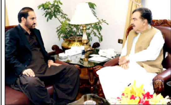
QUETTA: Chairman Senate Standing Committee for Aviation Senator Mir Abdul Quddus Bizenjo meeting with Governor Balochistan Sheikh Jaffar Khan Mandokhail

Further details are awaited as the inquiry is underway.