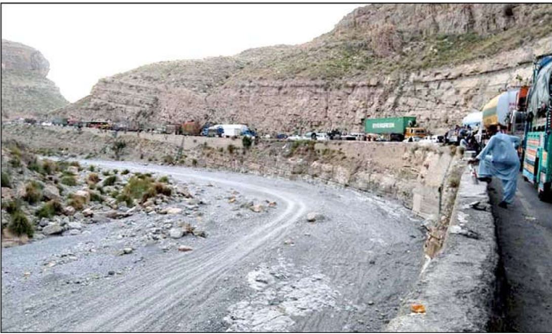
BOLAN: A large numbers of vehicles stuck in traffic jam at Bolan Quetta Highway road due to traffic accident while passengers are facing difficulties in the extreme heat weather of summer season.