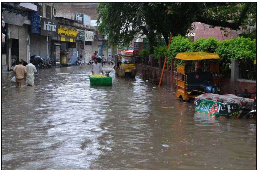
CHINIOT: People passing through stagnant rain water after heavy rain in the city.

forest carbon stocks were present in KP. In Pakistan, he said most of the carbon dense forests were temperate forests KP contains about 170 tons carbon per hectare. He said "Avoiding one hectare deforestation means emission reduction of 367 tons of carbon dioxide." Through natural forests and substantial plantations on vast areas achieved under billion tree project having a potential of annual carbon sequestration ie 11.20 million tons and gets stock of 194.31 million tons including 67.60 million tons in Hazara division, 73.25 million tons in Malakand division.