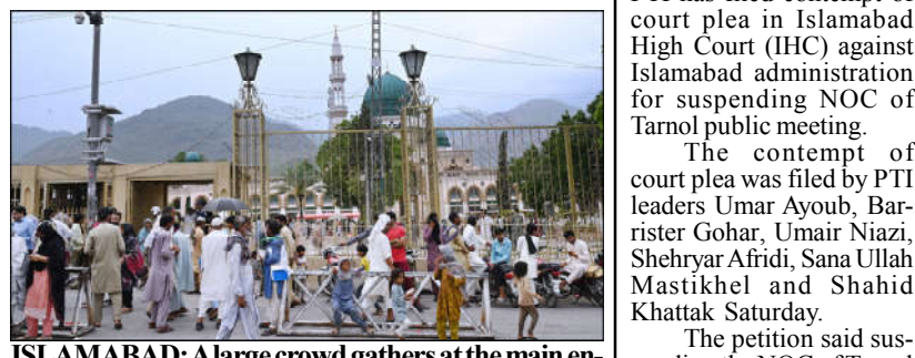
ISLAMABAD: A large crowd gathers at the main entry gate of Shrine Bari Imam in the Federal Capital.