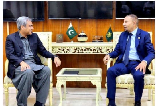
day met with Federal Minister for Interior Mohsin Naqvi at the Ministry of Interior.