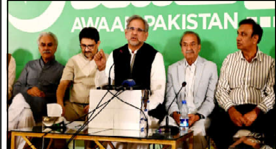
Abbasi expressed concerns about the country's leadership, stating, "The rulers do not care about the country. What can a government that taxes milk do? The majority of those sitting in national and provincial assemblies have lost elections. We are standing at the brink of disaster, and the current rulers are indifferent."

"Pakistan is plagued by political and economic instability. Remember, countries cannot be built by those relying on Form 47," Abbasi said during the launch event in Islamabad.