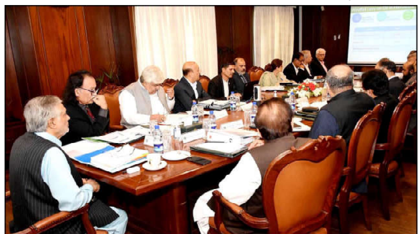
ISLAMABAD: Deputy Prime Minister and Foreign Minister Senator Mohammad Ishaq Dar chairs a meeting of committee to firm up agenda for the upcoming 52nd meeting of Council of Common Interests (CCI).

A lengthy question-answer session was held in which students actively participated and the speakers answered their questions about terrorism.