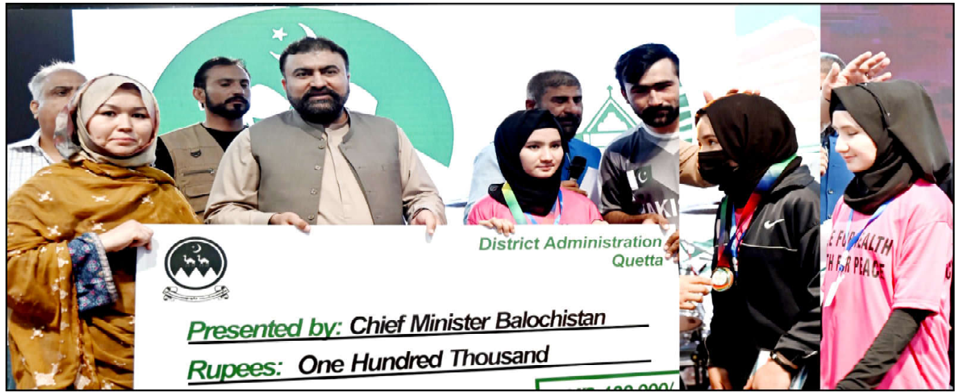
QUETTA: Chief Minister Balochistan Mir Sarfaraz Bugti giving away prizes among women who got 1st, 2nd and 3rd positions in cycling race organized by district administration