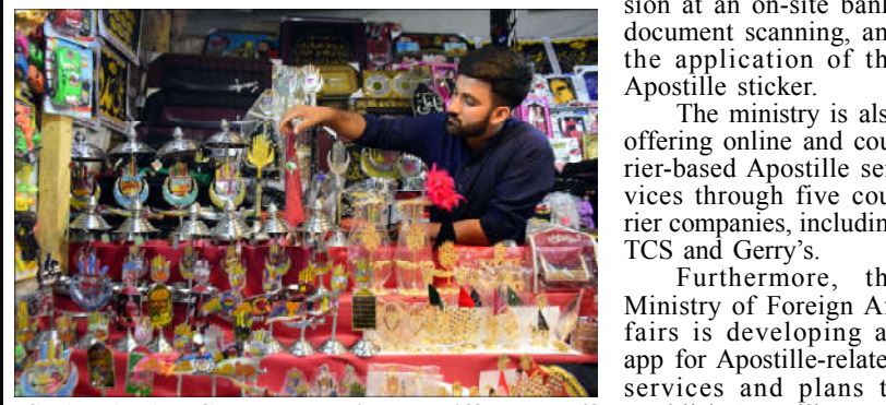
ISLAMABAD: Shopkeeper displays different stuff including Alam-e-Hazrat Abbas Alamdard (RA) and other things in preparation for the upcoming Islamic Holy month of Muharram-ul-Haram at Bari Imam Sarkar area for the Federal Capital.