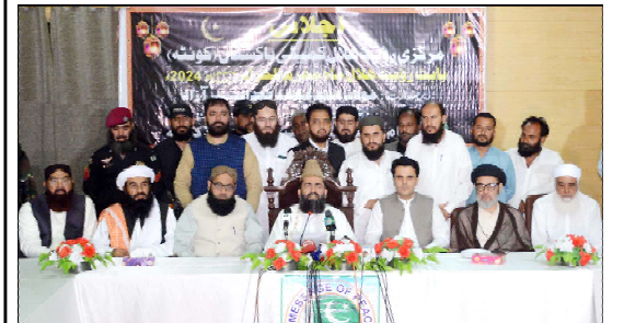
According to the notification issued here, the ministry has made this announcement in pursuance of the decision of Central Ruet-e-Hilal Committee, in its meeting held in Quetta.

QUETTA (APP): The Ministry of Religious Affairs and Interfaith Harmony on Saturday announced that the first Muharram-ul-Haram 1446 AH would fall on Monday, July 8, 2024 as the crescent has not been sighted from any nook and cranny of the country.