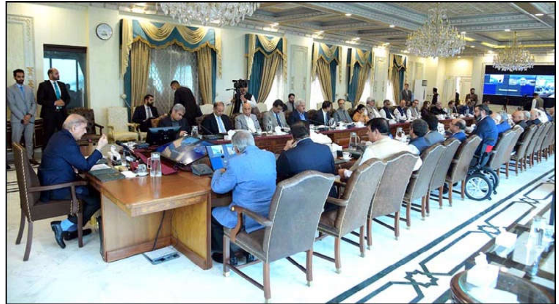
ISLAMABAD: A delegation of Petroleum and Gas Exploration & Production companies calls on Prime Minister Muhammad Shehbaz Sharif.

solutions to them. The meeting was informed that currently, Pakistan's domestic production stood at 70998 barrels and 3131 MMSCFD gas per day. The prime minister invited petroleum and gas exploration and production companies to also find the offshore reserves. Exploring the oil and gas reserves at the local level in Pakistan is our top priority, PM Shehbaz said adding that Pakistan spent billions of dollars every year on importing oil and gas.