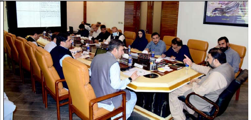
QUETTA: Chief Minister Balochistan Mir Sarfraz Bugti presiding over a meeting regarding preparation for upcoming meeting of CCI

KARACHI (INP): Kamal said that the Pakistan People's Party (PPP) government has done nothing substantial for Sindh during its tenure and has spent billions of rupees on advertisements alone. He criticized the PPP for trying to deceive the people of Sindh, claiming that if there had been any real improvements, the public would have praised the CM themselves.