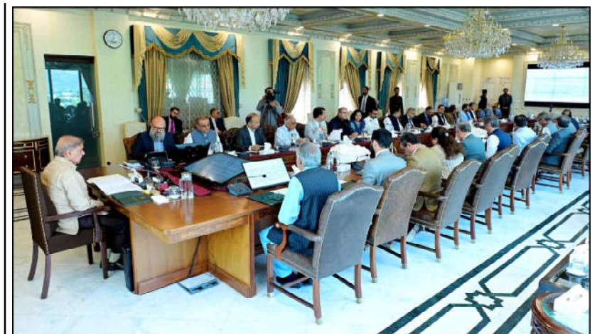
ISLAMABAD: Prime Minister Muhammad Shehbaz Sharif chairs a review meeting on implementation of Agreements and MOUs agreed upon during PM's visit to China.