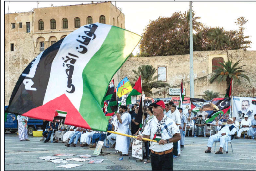
Libyans gather for a demonstration in solidarity with Palestinians at Tripoli's Martyrs' Square.

Scrutiny on his public appearances has markedly risen since the debate. In a White House speech to military families on Thursday to mark July 4 Independence Day, he stumbled over his words when referring to Trump as "one of our colleagues, the former president". And in an interview in Philadelphia, he lost his thread and appeared to say he was proud to be the first black woman to serve with a black president. Donors have been reconsidering their bets. Abigail Disney, an heiress to the Disney family fortune, told business news channel CNBC.