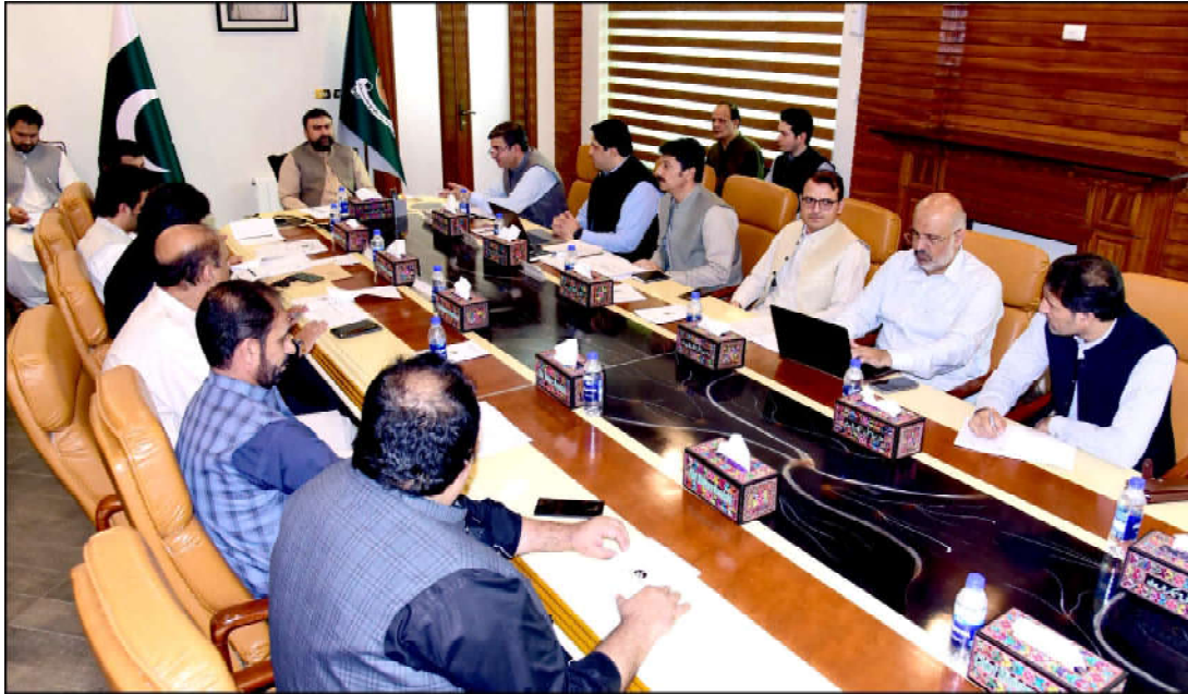
QUETTA: Chief Minister Balochistan Mir Sarfaraz Bugti presiding over a meeting to review implementation of development budget of new FY and arrangement by PDMA for monsoon season

Ph: 2841470/2841473 REG: No. BC-116 B/ID-445 Vd: XXV No. 315, Zil Hajj 30, 1445 AH Sunday July 07, 2024 Pages 08, Price Rs.15