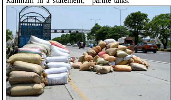
ISLAMABAD: Driver unload goods from the truck after a mechanical breakdown at Expressway.