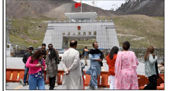
KHUNJRAB: Tourist their visits to China Gate at Khunjrab pass.