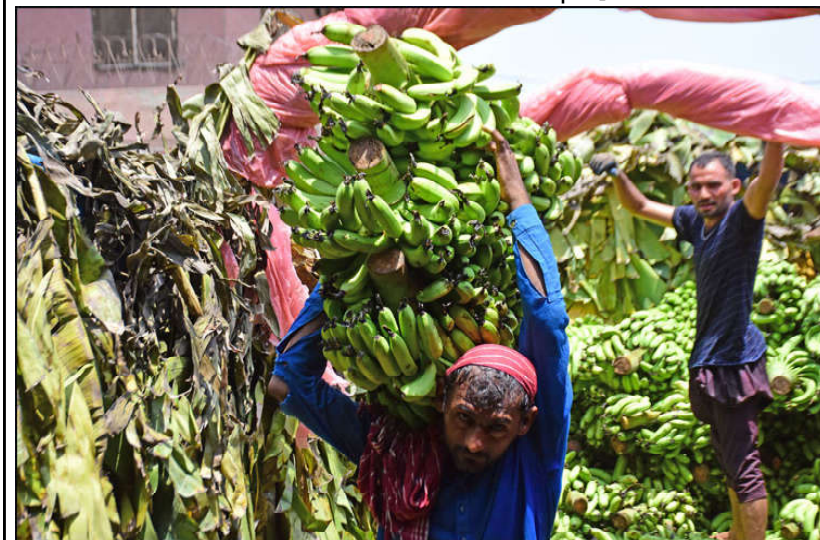
ISLAMABAD: Green banana being preserved for ripening at I-11 Food and Vegetable Market in the Federal Capital.

ISLAMABAD (APP): The price of per tola of 24 karat gold decreased by Rs.1,000 and was sold at Rs. 250,000 on Saturday against its sale at Rs. 251,000 on last trading day. The price of 10 grams of 24 karat gold also decreased by Rs. 857 to Rs. 214,335 from Rs. 215,192 whereas that of 10 gram 22 karat gold went down to Rs.196,473 from Rs. 197,259, the All Sindh Sarafa Jewellers Association reported. The price of per tola silver increased by Rs.70 to Rs.2,920 from Rs.2,850 whereas that of ten gram silver went up by Rs.60.01 to Rs.2,503.42 from Rs.2,443.41.