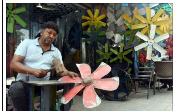
LAHORE: Craftsmen preparing big blower fans used in big halls and for Industrials purposes in the Provincial Capital.