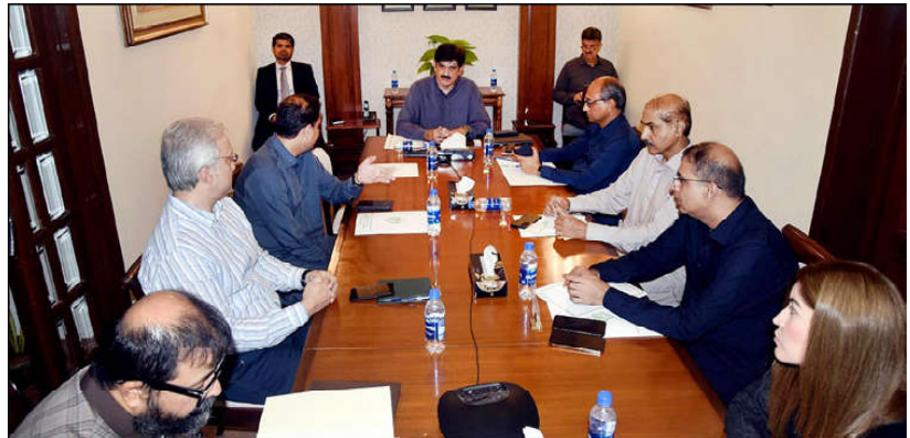
KARACHI: CM Sindh Syed Murad Ali Shah presides over a meeting of KMC to discuss a plan to bring its 28 off-road CNG buses on the road.