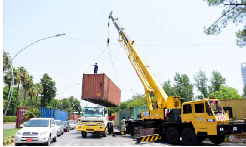
ISLAMABAD: Islamabad Administration clearing the roads, as TLP protesters wrap up Faizabad sit-in after a week in the Federal Capital.

The revenue generated from digital advertising will be utilized for the up-gradation, maintenance, and beautification of Islamabad, creating a self-sustaining cycle of growth and development. Chairman CDA was briefed on the policy, which promises to enhance the city's visual appeal and provide a new platform for businesses to reach their target audiences.