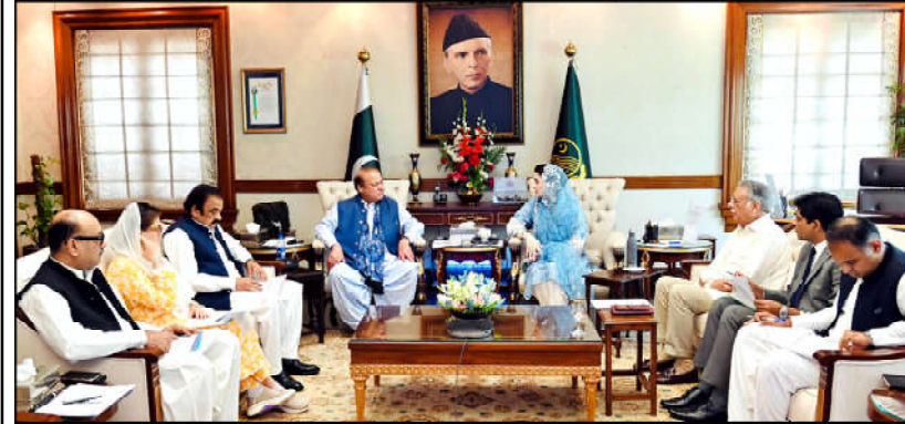
LAHORE: Chief Minister Punjab Maryam Nawaz Sharif and President PML-N Muhammad Nawaz Sharif being briefed about Chief Minister Solar Panel Financing Scheme during a meeting