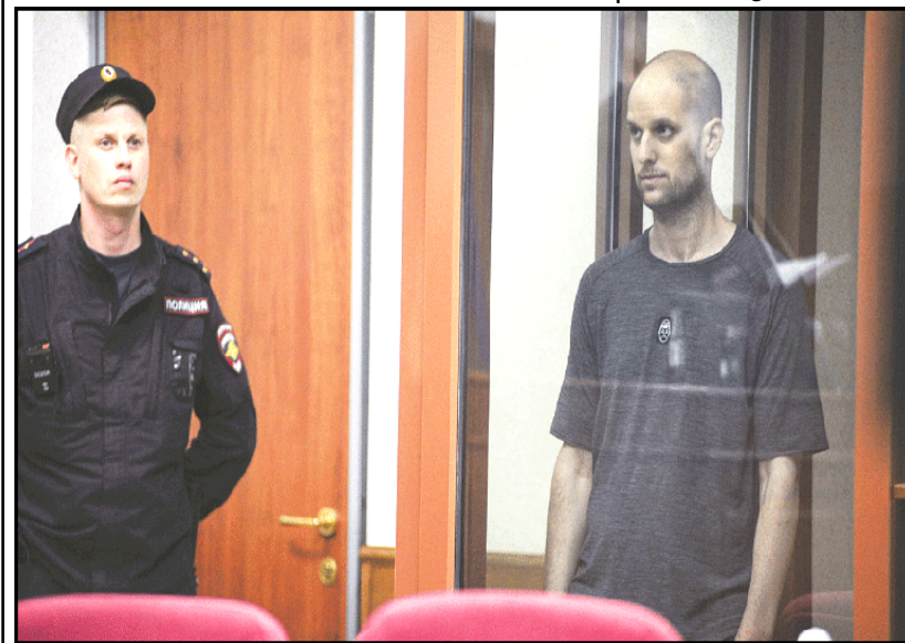
Evan Gershkovich, a reporter for Wall Street Journal, stands inside an enclosure for defendants during a court hearing in Yekaterinburg, Russia