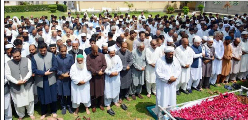
The funeral prayer of the father of PIO Mubashir Hassan performed in Peshawar. The funeral attended among many, by Governor KPK, Faisal Karim Kundi and other notables.