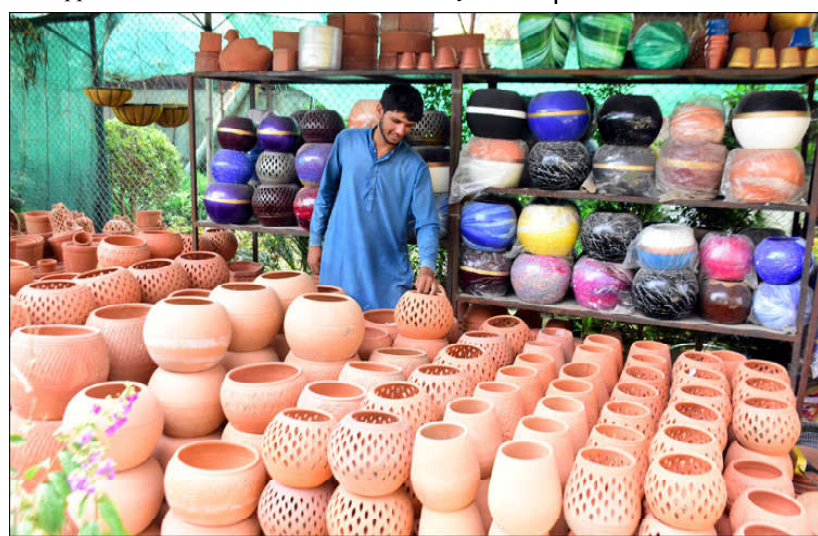
ISLAMABAD: A vendor selling clay flower pots at H-9 in the Federal Capital.

The initiative is expected to save the ministry's millions of rupees utilized in electricity costs annually, which will be used to further improve educational facilities.