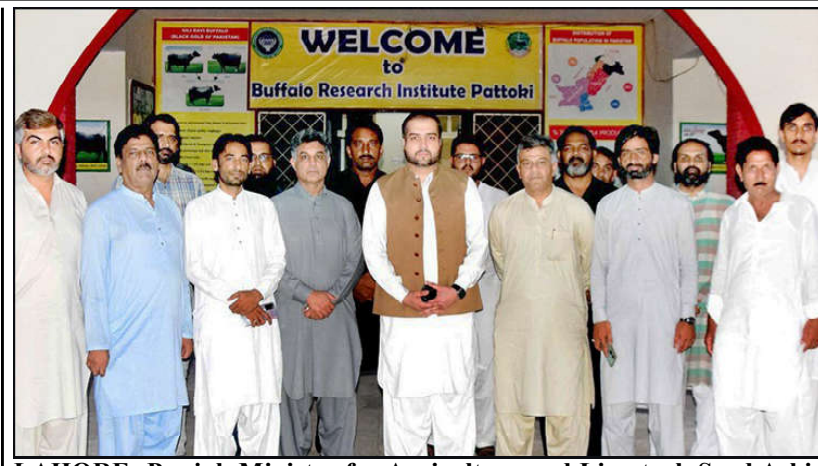
LAHORE: Punjab Minister for Agriculture and Livestock Syed Ashiq Hussain Kirmani in a group photo during his visit to Buffalo Research Institute Pattoki.

our needs, the minister said, adding, we must adopt scientific approaches to agriculture, leveraging technology and research to enhance crop yields, improve resource management, and promote sustainable practices." The minister also highlighted the sector's contribution to employment and livelihoods, noting that millions of people depend on agriculture for their income. "We must support our farmers and agricultural workers by providing them with the resources and infrastructure they need to thrive," he said. The minister stressed that food security remains a top priority for the government.