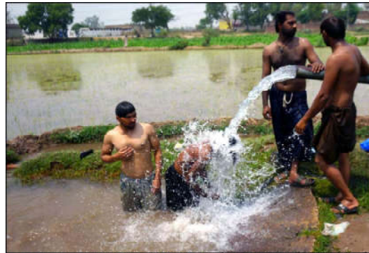
GUJRANWALA: People are enjoying bath at a tube-well to beat the heat of scorching sun to cool them from current hot weather of summer season, in Gujranwala.

LAHORE (APP): Punjab Chief Minister Maryam Nawaz Sharif, chairing a video link meeting here on Saturday, appreciated all ministers, cabinet committee on law & order, commissioners, deputy commissioners, RPOs and DPOs for making best administrative and security arrangements on Ashura. The CM appreciated them all by their names one by one. "My team made me proud by making great arrangements. On behalf of Quaid Muhammad Nawaz Sharif, I congratulate everyone," she said. Inspector General Police, Home Secretary and other relevant officers also participated in the meeting. CM Maryam Nawaz praised "Sabil on Wheels" for mourners, and commended the first-ever provision of 'Niaz' at government level. She said, "Before Ashura, provincial ministers personally met and took on board scholars of different schools of thought to ensure peace and harmony on the day. She added that law and order was ensured by following security instructions. She said that ministers, officers and police remained in the field day in and day out, adding that drone monitoring of large processions had been very beneficial. She directed immediate arrest of those responsible for the incident in Sheikhupura. Maryam Nawaz said that security arrangements without shutting down mobile phone and Internet services was a huge success, adding that traffic managements.