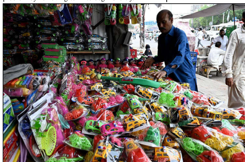
LAHORE: Vendor displaying Children's plastic toys to attract the customers at roadside in the city.