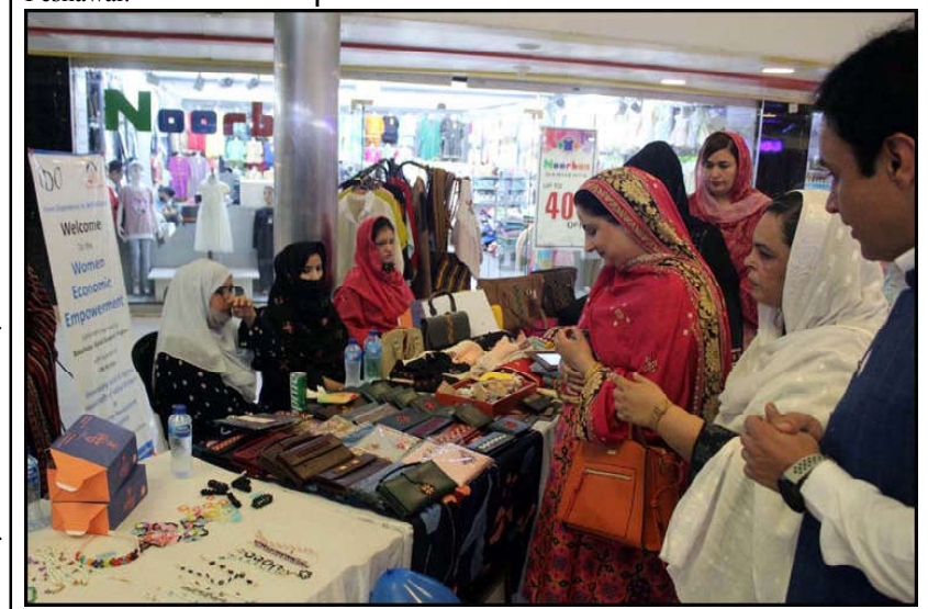
QUETTA: Women take keen interest at stalls during Handmade Crafters and Empower Women Exhibition organized by Balochistan Rural Support Program.