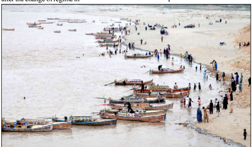
HYDERABAD: A large number of visitors enjoying boating at Al-Manzar downstream Kotri barrage

"Pakistan remains committed to these objectives and looks forward to continued collaboration with the UN and with all regional and cross-regional partners,"