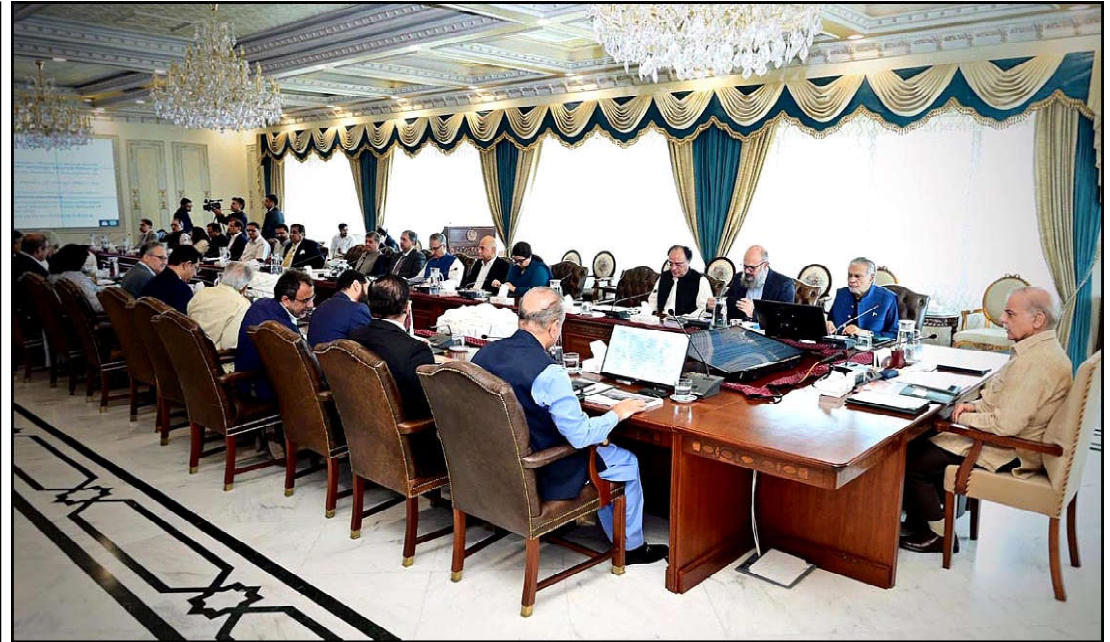
ISLAMABAD: Prime Minister Muhammad Shehbaz Sharif chairs a review meeting regarding Pak-China cooperation.

It was informed that the plan to send 1,000 students for modern agricultural vocational training at government expense had been completed. The first batch of students was being sent to China at the beginning of this academic year while the next batch would be sent to the Chinese modern agricultural universities after learning Chinese in Pakistan.