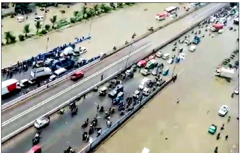
KARACHI: Commuters are facing difficulties in transportation due to stagnant rainwater due to poor sewerage system caused by heavy downpour of monsoon season

In June 2021, Jazz secured a Rs. 50 billion 10-year syndicated credit facility from a banking consortium led by Habib Bank Limited. Earlier on, Jazz announced the successful closure of its Rs. 15 billion Sukuk led by Askari Bank Limited, marking a milestone as the first-ever and largest short-term unsecured Sukuk by a telecom operator in Pakistan, which won global accreditations from EuroMoney Islamic Finance Awards and Asian Banking & Finance, and is expected to boost the use of Shariah-compliant financial instruments within Pakistan's capital markets.