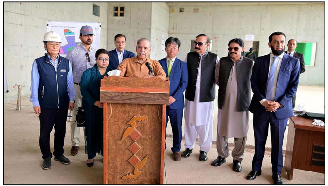
ISLAMABAD: Prime Minister Muhammad Shehbaz Sharif talking to media persons during his visit to the under-construction site of Islamabad Technology Park.

The prime minister highlighted that as a result of the construction of the IT Park, the country's exports would be increased by around US$70 million per year. He said a level 3 data center-one of the highest and first ever in Pakistan-would be established in the IT Park. He pointed out that Islamabad Technology Park would create synergy between domestic and foreign academia, researchers, industry and planners. The prime minister vowed to replicate such projects in other parts of the country with cooperation of the provincial governments.