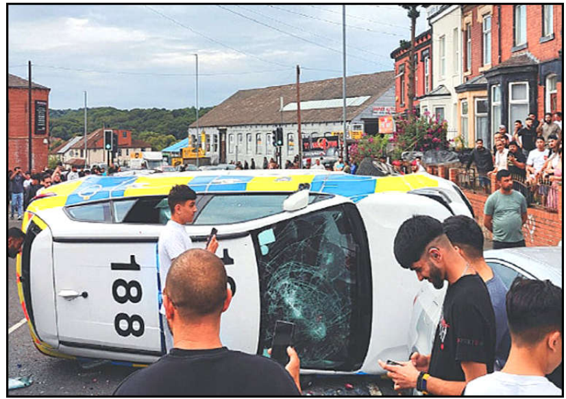
A police car lies on its side during unrest in Harehills, Leeds.

The UAE denies the allegations although UN experts have said they are credible. The allegations surfaced in a fiery back-and-forth at the UN Security Council in June. Emirati state news agency WAM reported on Thursday that in the call UAE President Sheikh Mohammed bin Zayed Al Nahyan "affirmed the UAE's keenness to support all solutions and initiatives aimed at halting escalation and ending the crisis in Sudan".