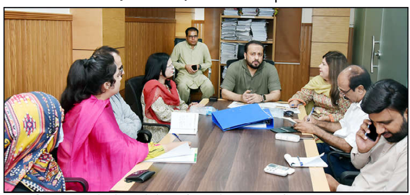
LAHORE: Provincial Minister for Primary and Secondary Healthcare Khawaja Imran Nazeer presides over the meeting about Punjab Hepatitis Control Program.

LAHORE (APP): In a significant development aimed at bolstering the healthcare system, the Punjab Finance Department has approved 197 vacant posts for Holy Family Hospital Rawalpindi. The announcement was made by Punjab Minister for the Department of Specialized Healthcare and Medical Education, Khawaja Salman Rafique, in a statement issued on Saturday. The minister hailed the approval as a positive step, stating, "The approval of 197 vacancies is very welcome." He emphasized that the completion of the human resource requirements will greatly enhance the hospital's performance and efficiency.