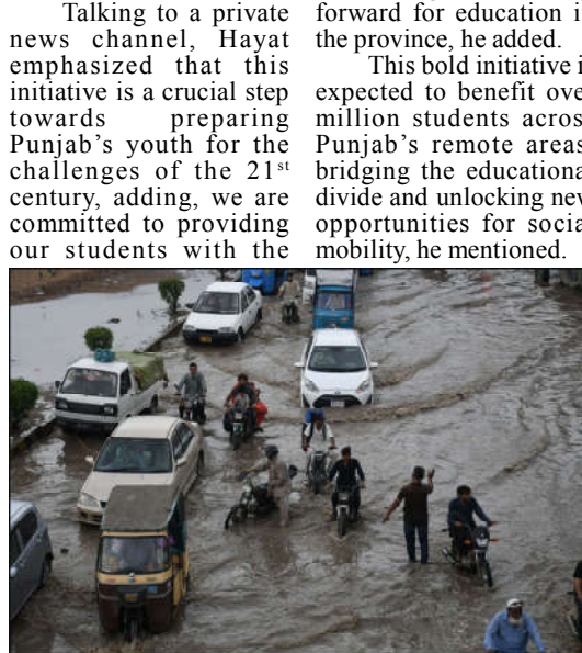
KARACHI: Commuters struggle to move forward in a flooded street after heavy monsoon rains in Pakistan's port city of Karachi.