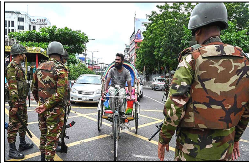
Commuters move along the road as Bangladeshi soldiers stand guard following a curfew and the deployment of military forces in Dhaka on July 20 after days of violent clashes during protests against government job quotas.

claimed he would end the war very quickly, without offering details as to how. Last week, the ex-president hosted at his Florida estate Hungary's Prime Minister Viktor Orban, who met with Russian President Vladimir Putin earlier this month. Trump's frequent praise for Putin and reluctance to outright criticise the Russian invasion have stirred concerns among Ukraine's allies that he would force the country into accepting partial defeat. He has also repeatedly suggested backing away from NATO, even undermining the alliance's collective defense guarantee by saying he would encourage Russia to attack any members not who had not met their financial obligations.