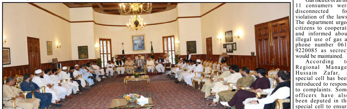
PESHAWAR: Governor Khyber Pakhtunkhwa Faisal Karim Kundi talks to representatives delegation of Peshawar Traders Chamber at Governor House.