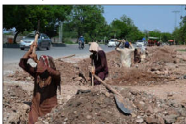
ISLAMABAD: Laborers busy digging at roadside for installing new pipeline at Lehrar Road.