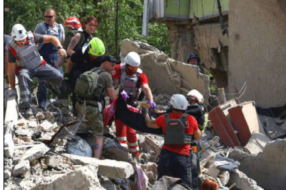
Rescuers and paramedics carry a body of a child found at a site of an apartment building heavily damaged during a Russian missile strike, amid Russia's attack on Ukraine, in Kyiv, Ukraine.

Modi is visiting the Mumbai area to inaugurate "a project" and may briefly attend the Ambani wedding, said Manoj Shinde.