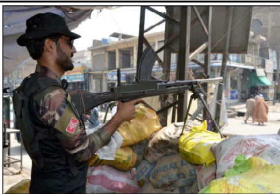
PESHAWAR: Security official stand alert to avoid any untoward incident as security has been tightened during the Holy month of Muharram-ul-Haram, at Gunj area in Peshawar.

Over the past eight months, the Pakistani delegate highlighted that Israel's "genocidal" military aggression in Gaza had resulted in the tragic loss of over 37,000 Palestinian lives, with more than 84,500 injured, mostly women and children, as also displacing the entire Gaza population of Gaza.