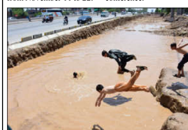
ISLAMABAD: Children enjoying in muddy water on the side of Karnal Sher Khan Shaheed Road in the Federal Capital.