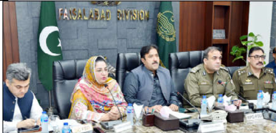
LAHORE: Punjab Minister for Local Government Zeeshan Rafique presides over the meeting to review arrangements of security on the eve of Youm-e-Ashoor.

violation of government orders, was presented to the provincial cabinet. The cabinet approved the committee's recommendations. The ministerial committee was established by provincial cabinet to assess capacity of ETEA, examine cases of tests assigned to private testing agencies and seek explanations from administrative departments that did not adhere to the cabinet's decision regarding conducting tests through ETEA. The tenure of the committee was extended to further six months with the responsibility to oversee the function.