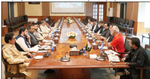
QUETTA: Provincial Home Minister Mir Ziaullah Lango presides over the meeting for talks with participants of Baloch Yekjehi Committee sitting on protest. Provincial Ministers, Parliamentary Secretaries and MPs are also present.