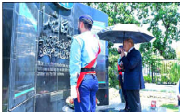
ISLAMABAD: Prime Minister Muhammad Shehbaz Sharif laying a floral wreath at the Yadgar-e-Shuhada at the FBR Headquarters

He expressed confidence that the day to end India's illegal occupation is not far off.