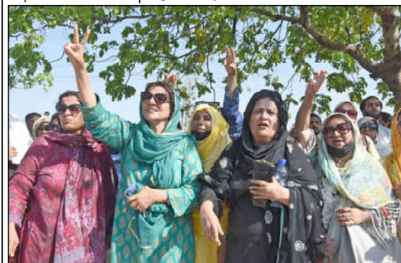
ISLAMABAD: Supporters of former prime minister and Pakistan Tehreek-e-Insaf (PTI) party leader Imran Khan, celebrate after a court verdict overturned his illegal marriage conviction, outside the court building in Federal Capital.

They said the history of Kashmir is full of eternal sacrifices. In 1947, they added, the cruel era of Dogra ended when India occupied Jammu and Kashmir by force. They said India has made the lives of Kashmiris hell at this time.