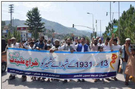
MUZAFFARABAD: Kashmiri women and men raising slogans against Indian atrocities in a protest rally from Bank Square Chhatar Chowk in memory of Kashmiri martyrs of July 13, 1931.