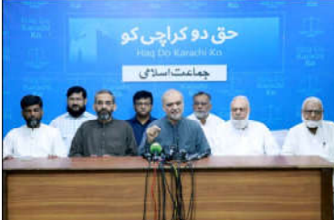
KARACHI: Jamat-e-Islami (JI) Chief, Hafiz Naem-ur-Rehman along with others addresses to media persons during press conference, at Idara-e-Noor-ul-Haq in Karachi.

He said that it is our duty to respect the women