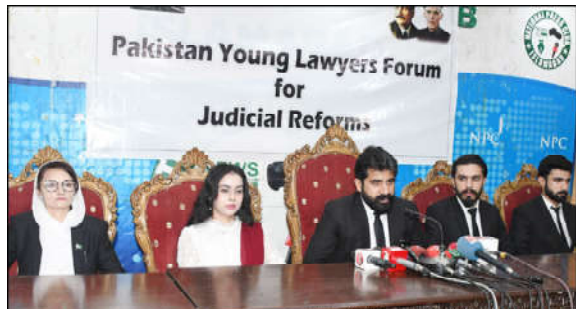
ISLAMABAD: President Young lawyers Forum for Judicial Reforms along with other officials addressing a press conference at NPC in the Federal Capital.