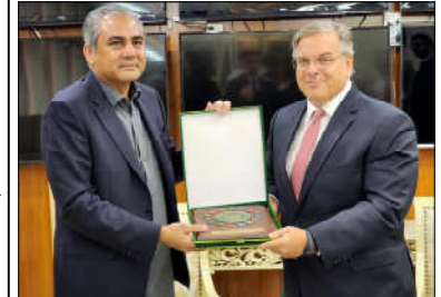
ISLAMABAD: Federal Minister for Interior Mohsin Naqvi presenting souvenir to US Ambassador Donald Blome.

Appreciating the positive role of Muslim League (N) in the Senate, the prime minister said that the Upper House should guide all the elected houses for democratic values and dignified environment.