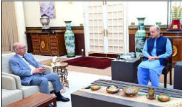
ISLAMABAD: Parliamentary leader of Pakistan Muslim League (N) in Senate and Chairman Senate Standing Committee on Foreign Affairs Senator Irfan Siddiqi calls on Prime Minister Muhammad Shehbaz Sharif.

"China and Pakistan have also signed a Memorandum of Understanding (MoU) on Strengthening Development Cooperation and Promoting the Implementation of Global Development Initiative, focusing on areas including poverty reduction, medicine, education, infrastructure construction, agriculture, planning consultation, culture and sports, law-enforcement cooperation, and human resource development," it was further added.