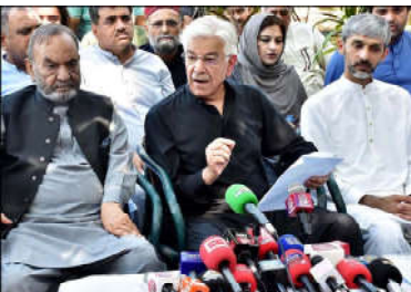
SIALKOT: Defense Minister Khawaja Muhammad Asif addressing to the media persons at his residence.