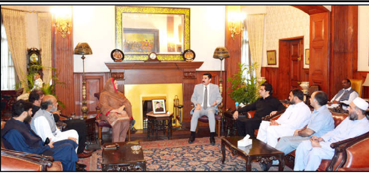
PESHAWAR: Governor Khyber Pakhtunkhwa Faisal Karim Kundi called on by the Educational Experts delegation of KP Province at Governor House.

The DC informed that the line marking process has been completed near Pir Makki, Data Darbar, LOS Road Samanabad, and other important roads. Business owners are being informed to conduct their activities within their designated boundaries to ensure smooth traffic flow.