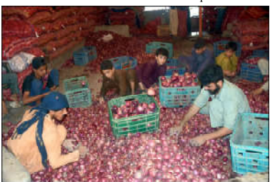
LAHORE: Workers putting onions and potatoes into baskets after sorting them at a Sabzi Mandi of the Provincial Capital.