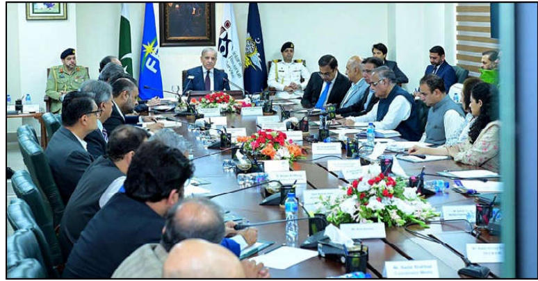
ISLAMABAD: Prime Minister Muhammad Shehbaz Sharif addressing officers during his visit to headquarters of the Federal Board of Revenue.