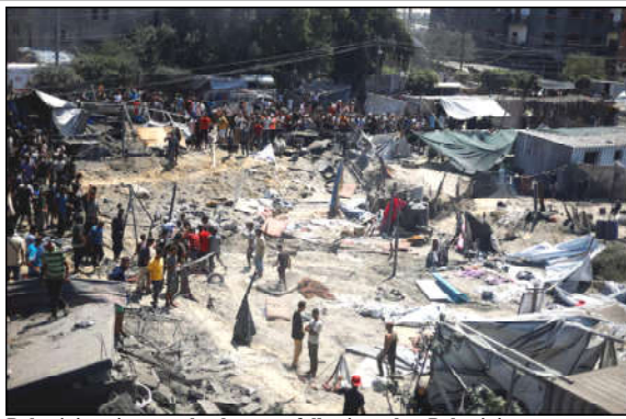
Palestinians inspect the damage, following what Palestinians say was an Israeli strike at a tent camp in Al-Mawasi area, amid Israel-Hamas conflict, in Khan Younis in the southern Gaza Strip.

"The location of the strike was an open area surrounded by trees, several buildings, and sheds," it said in a statement. The Israeli military official said the area was not a tent complex, but an operational compound run by Hamas and that several more militants were there, guarding Deif. Many of those wounded in the strike, including women and children, were taken to the nearby Nasser Hospital, which hospital officials said had been overwhelmed and was "no longer able to function" due to the intensity of the Israeli offensive and an acute shortage of medical supplies.