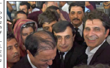
ISLAMABAD: Gohar Ali Khan (front L), lawyer of Imran Khan celebrates with member of parliament Zartaj Gul (4R) after a court verdict overturned Khan's illegal marriage conviction, outside the court building.

The development comes amid a push for foreign investment by Pakistan, which has been facing low foreign exchange reserves, currency devaluation and high inflation. The South Asian country is making desperate attempts to boost foreign investment and has reached a $7 billion loan deal with the International Monetary Fund (IMF) to support its $350 billion fragile economy.