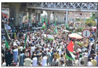
RAWALPINDI: Tehreek-e-Labaik Pakistan (TLP) hold a rally to express solidarity with the Palestinians at Murree Road in the city.

He held opposition alliance is near at hand. The efforts being made by Asad Qaisar and Mehmood Khan Achakzai are appreciable.