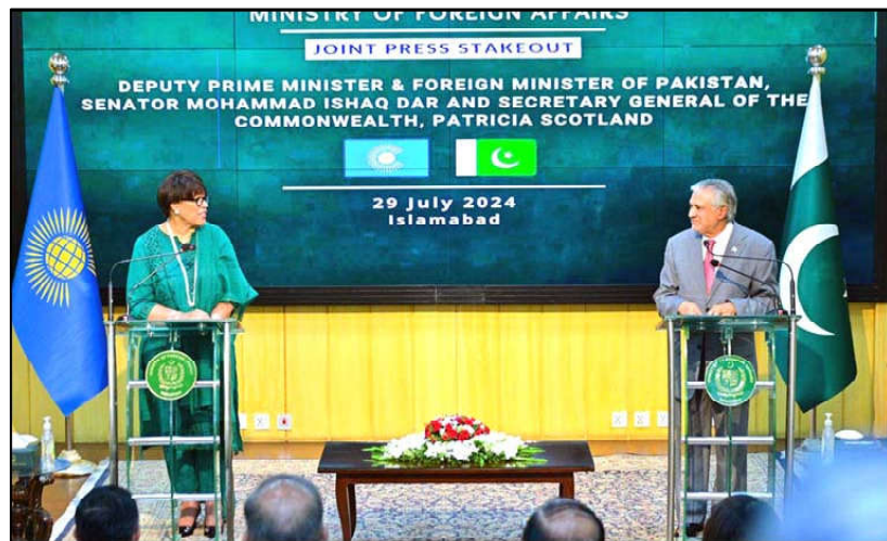
ISLAMABAD: Deputy Prime Minister and Foreign Minister Senator Muhammad Ishaq Dar along with Secretary General of the Commonwealth Patricia Scotland addresses a joint press stakeout at the Ministry of Foreign Affairs.