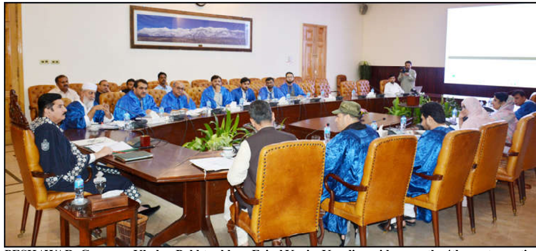
PESHAWAR: Governor Khyber Pakhtunkhwa Faisal Karim Kundi presides over the 4th senate meeting of the University of Agriculture D.I.Khan at Governor House.