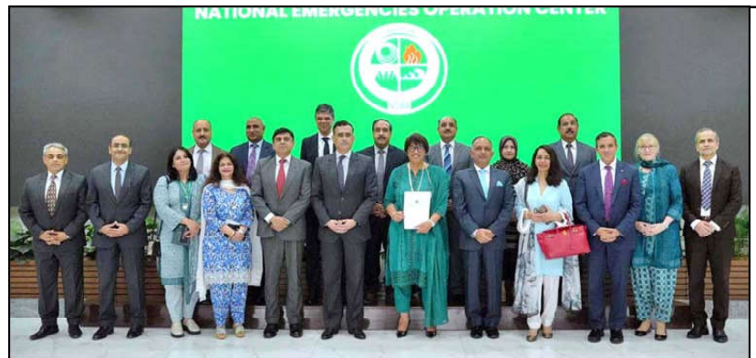
ISLAMABAD: H.E. Patricia Scotland, Secretary General of the Commonwealth of Nations in a group photograph during visit the National Emergencies Operation Center (NEOC) at NDMA Headquarters.