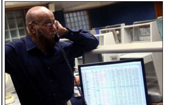
KARACHI: Brokers are busy in trading at Pakistan Stock Exchange (PSX) in Karachi.

During a meeting with the Chairman Prime Minister's Youth Programme, Rana Mashhood Ahmad Khan, the minister expressed support for the initiative, highlighting its role in stimulating entrepreneurial activity and contributing to economic growth. Earlier, Rana Mashhood provided an overview of the Prime Minister's Youth Business and Agriculture Loan Scheme. The scheme promotes entrepreneurship among youth by providing business loans on simple terms and with less markup through Commercial, Islamic and SME banks.