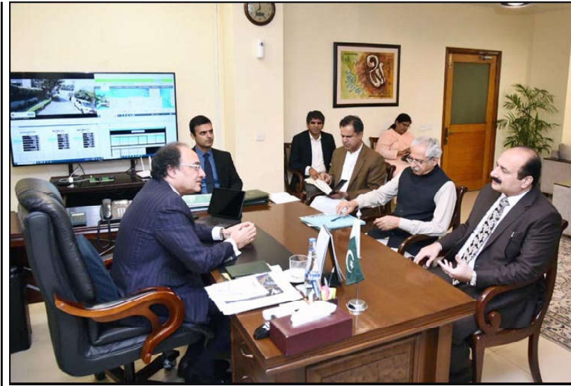
ISLAMABAD: Federal Minister for Finance and Revenue Senator Muhammad Aurangzeb in a meeting with the Chairman Prime Minister's Youth Programme Rana Mashhood Ahmad Khan.