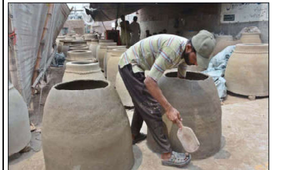
FAISALABAD: An artisan is giving final touch to the clay ovens (Tandoors) at his workplace Novlty Bridge Samanabad.

During the meeting, detailed discussions were held on the topics of minority religious tourism and green tourism. Furthermore, a five-year strategic plan was also discussed.