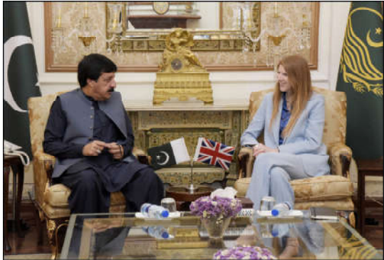
LAHORE: British High Commissioner to Pakistan, Jane Marriott meeting with Governor Punjab Sardar Saleem Haider Khan.

to participate in the project. Chief Minister Maryam Nawaz Sharif briefed British High Commissioner Jane Marriott that the Punjab government was taking all possible measures for the protection of women and children. She apprised her about the establishment of first Virtual Women Police Station and Virtual Child Safety Center in Punjab. The British High Commissioner appreciated the implementation of the Sikh Marriage Act in Punjab, and termed the Child Marriage Bill an exemplary initiative of the Punjab government. She said the Punjab government was taking unique and historic steps for the protection of women and children.