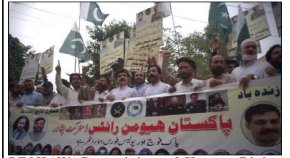
PESHAWAR: Activists of Human Rights Association hold protest outside PPC.

also having adverse effect on the agricultural sector of the country. Sardar Saleem Haider Khan said federal and provincial governments are working on various projects to deal with the issue of climate challenge. He said Pakistan has plenty of renewable energy resources. He said that there is a need to bring people towards solar energy to deal with the energy crisis. The Governor informed the British High Commissioner about the efforts to solarize the Governor House Lahore and universities of Punjab. He hailed the British government for the water management program started in different districts of Punjab. British High Commissioner Jane Marriott, speaking on the occasion,