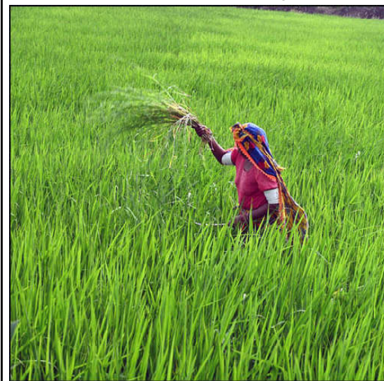
HYDERABAD: A woman farmer busy in cutting the rice crop in her field at Tando Muhammad Khan Road.

However, he lamented that there was no facility for liver transplant in Faisalabad as a kidney and liver transplant institute is available only in Lahore. He said that the Punjab government has established 36 hepatitis filter clinics in different districts and these clinics must be made more proactive to identify patients suffering from this disease.