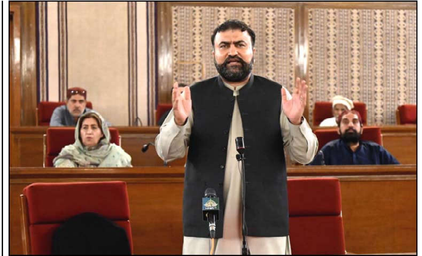
QUETTA: Chief Minister Balochistan Mir Sarfraz Ahmed Bugti expressing views in Balochistan Assembly