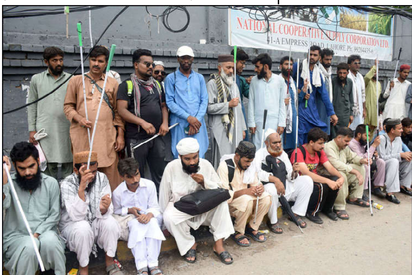
LAHORE: Blind persons hold a protest in favor of their demands outside press club in the Provincial Capital.