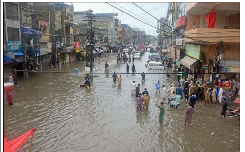
RAWALPINDI: People wade through a flooded street at Raja Bazaar amid heavy rainfall, in the city.