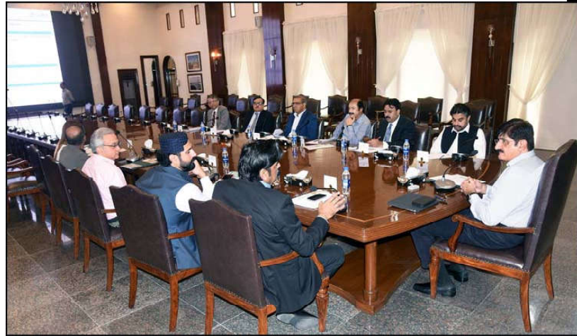
KARACHI: Sindh Chief Minister, Syed Murad Ali Shah presides over a joint Agriculture and Irrigation department meeting, held at CM House.

to provide the required information promptly to facilitate the process and set an example for other institutions. He said that technical issues were noted in the budget preparation, and the committee will review the transparency of the statistics. Governor Faisal Kundi stressed that the university should contribute regularly to its pension fund, noting a current need of 1.7 billion rupees solely for pension payments. He expressed the desire for universities to become self-reliant and increase their resources.