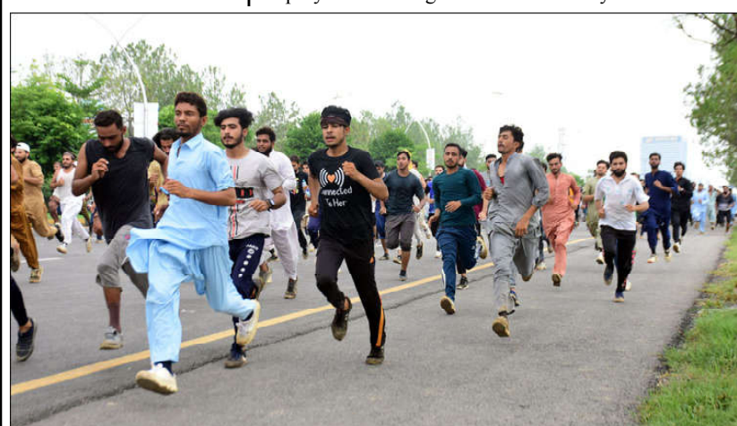
ISLAMABAD: Youth participating in the race on Jinnah Avenue for recruitment in Islamabad Police.

They said the officers and employees get their son or daughter recruited before retirement and the house is allotted to them, adding that the affected employees are demanding that the allotment of houses should be done only on the principle of seniority.