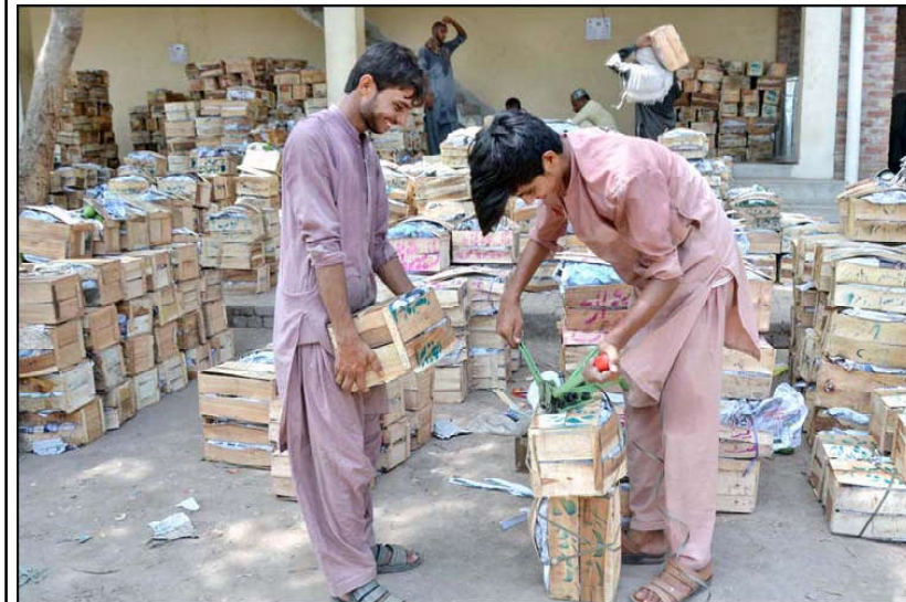
MULTAN: Labourers are packing seasonal fruit mangoes in wooden boxes.