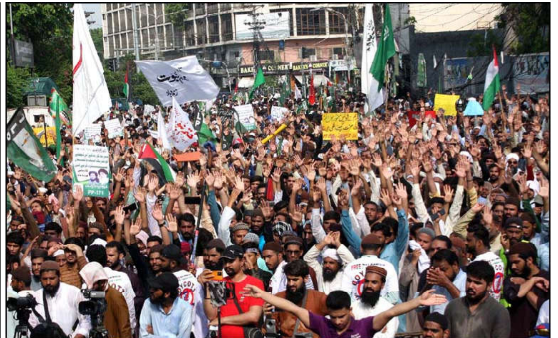
LAHORE: Leaders and members of Tehreek-e-Labbaik Pakistan (TLP) are holding protest demonstration against the Supreme Court Pakistan, nearby Lahore press club.

each subject. Through a series of training camps, this number is gradually reduced to the 4-6 best students in each subject who will participate in the ISOs. The STEM Careers program office in HEC manages the activities of these training camps and their subsequent traveling to ISOs. NIBGE-C (PIEAS) serves as the HI for Biology, the HEJ Research Institute of Chemistry at the University of Karachi for Chemistry, COMSATS-Lahore for Mathematics, and PIEAS for Physics. Pakistan has been participating in the International Physics Olympiad since 2001, the Mathematics Olympiad since 2005, and the Biology and Chemistry Olympiads since 2006.