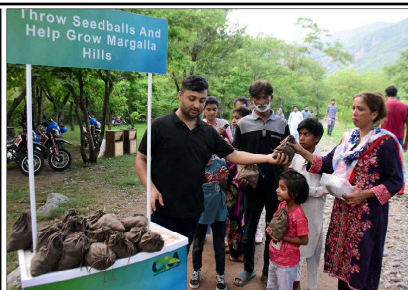
ISLAMABAD: A plantation drive titled 'Throw and Grow' initiative started by CDA and PTC to enhance greenery in Islamabad's renowned Margalla Hills. The entrance points of Trail 3 and Trail 5, stalls offering seedballs made from native species like Sukcham, Pine, and others in the Federal Capital.

Experts like Martino Miraglia and Riccardo Maroso from UN-Habitat presented on SDG localization and VLRs. They noted the growing global movement of VLRs, with cities worldwide using them to track and report on SDG progress. UN-Habitat views VLRs as crucial accelerators for localizing the Sustainable Development Goals, offering opportunities for peer learning, capacity building, and international engagement. The training highlighted the joint efforts of UN-Habitat and CDA to equip Pakistani cities, starting with Islamabad, with the tools and knowledge necessary to achieve sustainable urban development. CDA, responsible for implementing the Islamabad Master Plan, has committed to aligning all its projects with SDG-11 by 2030.