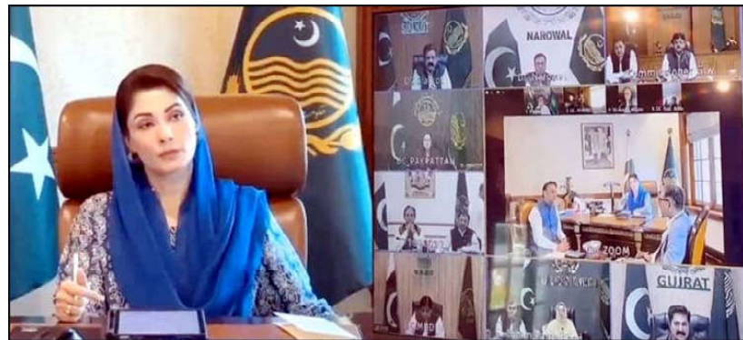
LAHORE: Punjab Chief Minister Maryam Nawaz Sharif chairs meeting regarding launching of prosperity survey "Ab Ho Ga Sub Ka Shumar" in the province.

project should be used for that specific purpose. He said that the bid to sell the land was a classic example of the PTI's poor economic management. He said that this would set a bad precedent and would open a Pandora's box. "This shows the PTI has miserably failed to run the economic affairs of the province and it has now started selling off the provincial assets," he maintained. Expressing concern over the deteriorating law and order in various parts of the province, the QWP leader said the local administration in Kurram tribal district should swing into action to broker a ceasefire between the warring tribes. He said that the clashes had claimed several lives, but the provincial government was acting like a silent spectator. He said that the provincial ministers and advisers were already ready to give political talks and indulge in making political statements over petty issues.