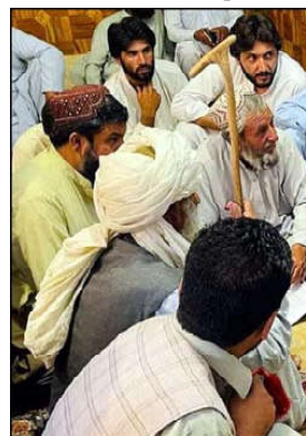
QUETTA: Provincial Minister for Livestock and Dairy Development Bakht Muhammad Kakar listening problems of people at his residence

is still much work to be done. We must continue to prioritize hepatitis prevention, ensure early diagnosis, and provide affordable and accessible treatment options for all, he added. Prime Minister Shehbaz said that the government stood firm in its dedication to overcome the challenges posed by hepatitis. "I am pleased to announce a nationwide campaign aimed at eradicating Hepatitis C. As a part of this noble endeavor, our focus will be on decentralizing testing and treatment centers, ensuring that the services provided are tailored to the needs of our citizens, in alignment with the global strategy," he said.