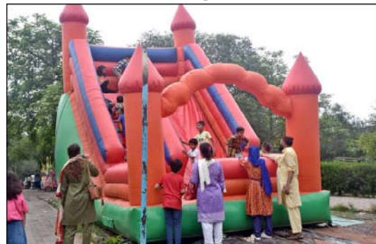
ISLAMABAD: Children enjoying at playing area at the famous picnic spot Daman-e-Koh.