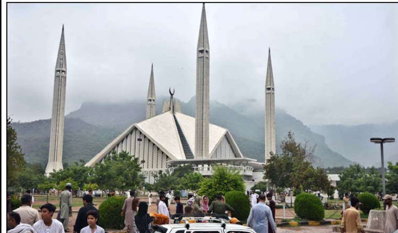
ISLAMABAD: A large number of people visiting famous Faisal Masjid to spend their holiday during cloudy weather in Federal Capital.

The General Authority for the Care of the Prophet's Mosque seeks to apply globally approved lighting specifications, stemming from the commitment of the Custodian of the Two Holy Mosques, King Salman bin Abdulaziz Al Saud's government, to improving the services provided by the Prophet's Mosque.