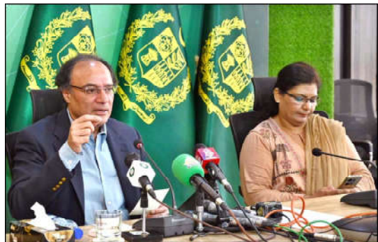
ISLAMABAD: Federal Minister for Finance and Revenue Senator Muhammad Aurangzeb addressing media persons at PTV Headquarters.