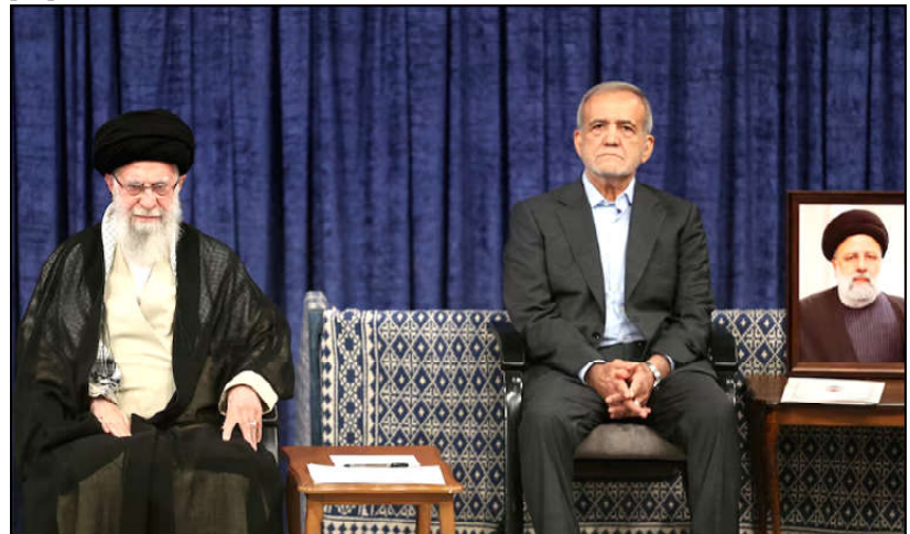
Iran's Supreme Leader Ayatollah Ali Khamenei and Iran's new president, Masoud Pezeshkian, attend an endorsement ceremony in Tehran, Iran.