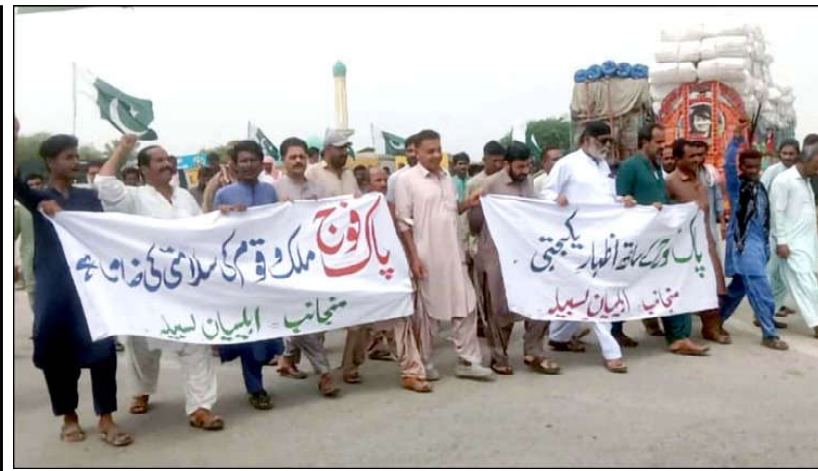
HUB: Residents of Lasbela are holding demonstration in favor Pakistan Army, held in Hub.

The accident has cast a pall of gloom over the Kishtwar district, with local residents expressing their condolences to the bereaved family, the report added.