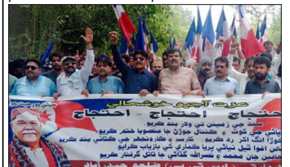
HYDERABAD: Activists of STP hold a protest in favor of their demands outside HPC.

officers. During the briefing, it was informed that the 15 Call Data, issued by the Punjab Safe Cities Authority, indicated a significant reduction in crime rate in the provincial capital. The CCPO emphasised that the police force must ensure timely response and actions upon receiving calls through the 15 service. He urged that in the light of the Punjab government's KPIs, every department, officer and official should align their performance.