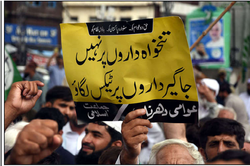
RAWALPINDI: Activists of Jamaat-e-Islami hold placard and chanting slogans during 3rd day of sit in protest (Dharna) against the country's rising inflation, at Murree road, in the city.

structure transformation including East Asia and Southeast Asia have been on governing the markets who had identified economic winners and supported them to deliver their economic goals. India's three decades journey where it has reformed its economic structure and built up its private sector is evident. Pakistan has to start from somewhere," he mentioned. He said the country's financial system is unable to support new development initiatives which is the job of the development banks and not the commercial banks. For instance, to promote the agriculture sector the government should revise ZTBL with the help of Chinese investors which is lying redundant through capital and experts.