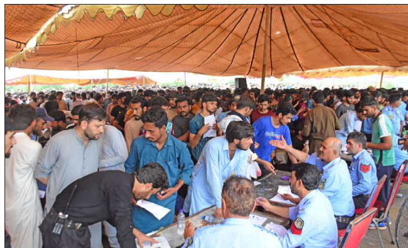
ISLAMABAD: Youth line up for registration to participate in the race on Jinnah Avenue for recruitment in Islamabad Police.

"When we stand united under the banner of our national flag, we send a strong message to those who seek to harm our country," he said.