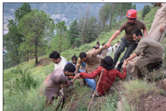
MUZAFFARABAD: Rescue 1122 officials transferring injured people to hospital with the help of people of the area.

from his people. "Perhaps they forgot that despite their strategies, Allah also has a strategy. Alhamdulillah, my leader returned, his disqualification was overturned, and the people gave him the mandate. Despite all conspiracies, Pakistan and its largest province, Punjab, are governed by Nawaz Sharif today," she concluded.