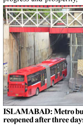
ISLAMABAD: Metro bus service has been partially reopened after three days in the Federal Capital.

"By respecting our national flag, we are not only showing love and loyalty for our country, but also reaffirming our commitment to its progress and prosperity,"