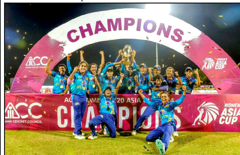
DAMBULLA: Sri Lankan women cricket team celebrating after beating India in Final of Asia Cup final

The finance minister admitted the fact that inflation went up after the GST measures were introduced in the Federal Budget for the Fiscal Year 2-24-25, however, he said that some elements were taking undue benefit and artificially sparking the prices of essential commodities. The minister warned that such elements would be dealt with iron hands and directed the provincial government to enhance their vigilance through the price monitoring committees and ensure the fair prices of these commodities across the country to facilitate the common man in the country.