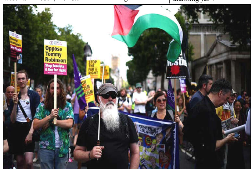
People take part in a counter-demonstration against British far-right activist and founder of the anti-Islam English Defence League (EDL), Stephen Yaxley-Lennon, also known as Tommy Robinson, in central London.