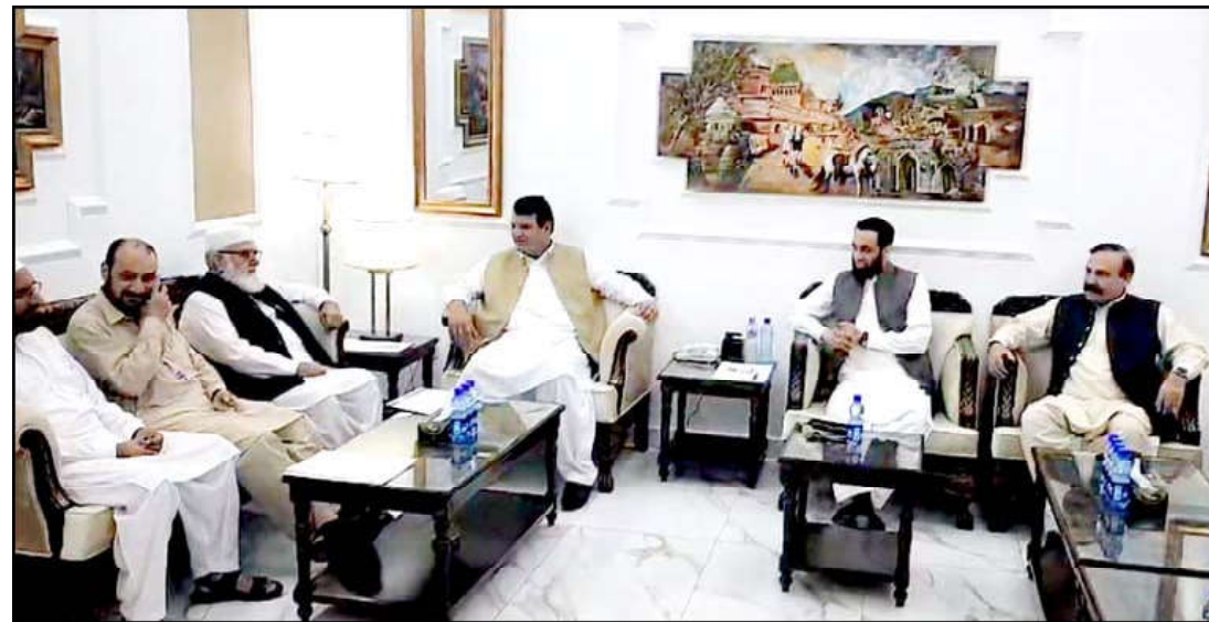
RAWALPINDI: A view of meeting with Government team and Jamaat-e-Islami delegation

On receiving information, police reached the area and started a chase for the arrest of the fleeing bandits. According to law enforcers, during the chase police opened fire and injured a robber, but he could be captured.