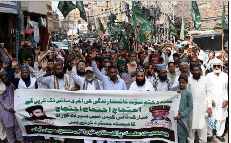
HYDERABAD: Activists of Jamit Ulma Pakistan Norani hold a protest in favor of their demands outside HPC.