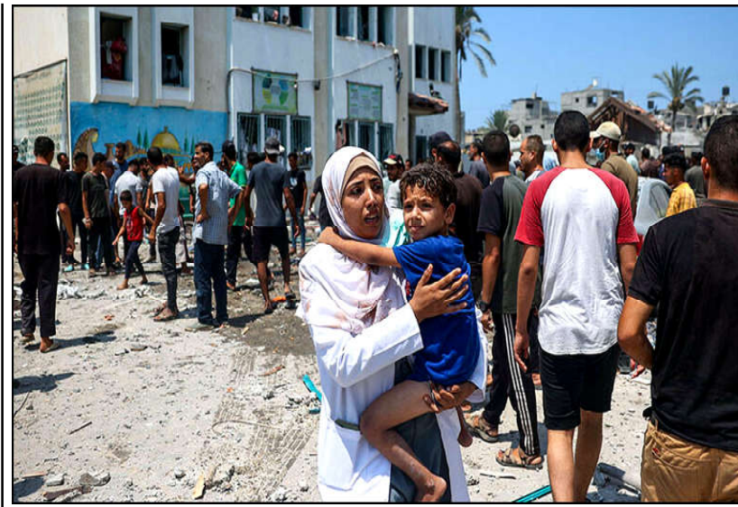
Palestinians inspect the damage following an Israeli strike on the Khadija school housing displaced people in Deir al-Balah, in the central Gaza Strip.