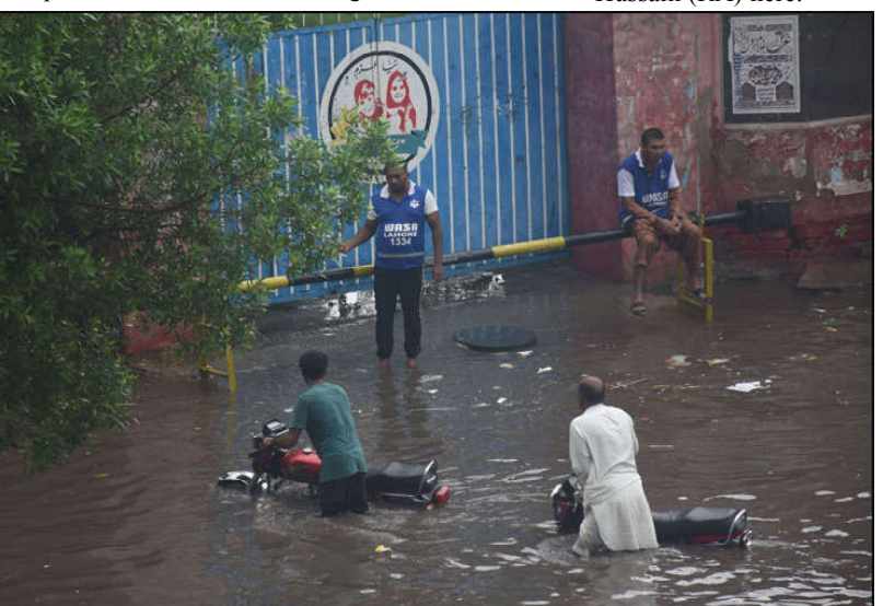
LAHORE: Garbage-clogged rainwater drains on the roads are a testimony to the inefficiency of the WASA.