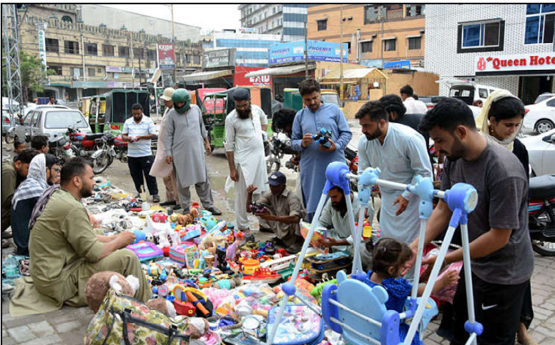
RAWALPINDI: People are busy in buying secondhand toys at Sunday weekly bazaar at Committee Chowk area, in the city.

manufacturers, led by Muhammad Arabi Arain, he said in today's fast-paced world, buyers increasingly prefer furniture that offers both functionality and aesthetic appeal. Modern designs emphasize simplicity, clean lines, and innovative use of materials, catering to a wide range of tastes and spaces. He said the global furniture market is highly competitive, with buyers having access to diverse products from around the world.