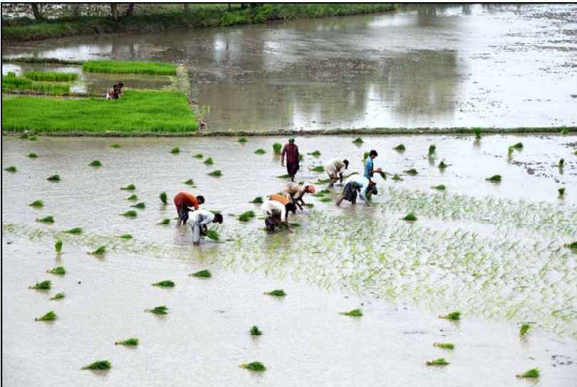
LARKANA: The farmers are busy planting the seedlings of rice crop in their field near the Bypass Road.

Facilitation Centres have been established across the province and the number of centres would be increased after consultation with the public representatives. Kirmani directed officers concerned to ensure strict monitoring for the provision of quality pesticides in the market. Speaking on the occasion, Secretary Agriculture Punjab Iftekhar Ali Sahu said that the shops of pesticide dealers selling quality pesticides in the market would be given the status of mini Farmer Facilitation Centre. He stressed the need for more coordination with the irrigation department for the proper supply of canal water. Secretary Agriculture South Punjab Saqib Ali Ateeel said that an online Google workbook with the title of Virtual Cotton Pest Management Hub has been launched to trace activities related to pest scouting, management and others.