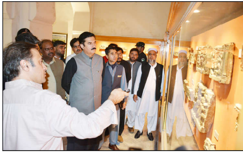
PESHAWAR: Governor Khyber Pakhtunkhwa Faisal Karim Kundi being briefed about Gandhara heritage displayed in Peshawar Museum.

described the Peshawar Museum as crucial for projecting a positive image of the province to international tourists. He stressed the need to promote Khyber Pakhtunkhwa for its peace and tourism potential. Governor Kundi also mentioned that the first session of the Khyber Pakhtunkhwa Assembly was held in Peshawar Museum. He said that the museum and its artifacts are valuable assets. He asserted that while there may be political differences, the primary goal should be to advance the province's rights and public welfare. He called for a collective political effort to present the province's case at the federal level and highlighted the need for more industries to create job opportunities for youth.