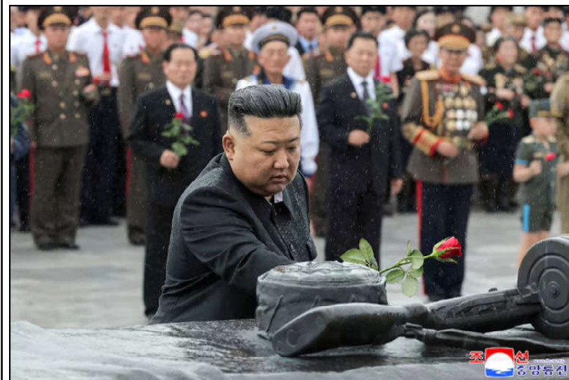
Kim Jong Un, General Secretary of the Workers' Party of Korea and President of the State Affairs of the Democratic People's Republic of Korea, in Pyongyang, North Korea.