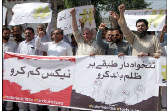
PESHAWAR: Members of Salaried Class Alliance are holding protest demonstration against high taxes on salaried class, at Peshawar press club.

PESHAWAR (APP): Governor Khyber Pakhtunkhwa Faisal Karim Kundi in a special message marking the birthday of President Asif Ali Zardari, on Friday lauded his contributions to democracy and political harmony in the country. Faisal Karim Kundi described Asif Ali Zardari as a towering figure in the realm of democratic governance and political reconciliation, noting his significant role after the martyrdom of Benazir Bhutto. He emphasized that Asif Zardari remains a prominent and challenging figure for those opposed to democracy and Pakistan's stability. According to Governor Faisal Kundi, Zardari's life has been characterized by resilience in the face of difficulties and a steadfast commitment to the stability of democracy and Pakistan. He praised Asif Ali Zardari for setting a high standard by transferring powers to the provinces instead of concentrating them, showcasing his dedication to decentralization. The Governor highlighted Zardari's unique role in promoting Pakistan's stability, fostering regional trade, and upholding the Constitution. Governor Kundi's message underscores Zardari's influential and enduring impact on Pakistan's political landscape.