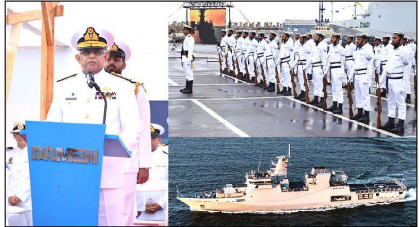
Chief of the Naval Staff Admiral Naveed Ashraf addressing the Commissioning Ceremony of Pakistan Navy Ship HUNAIN at Constanta Port, Romania.

various subjects of socio-economic and political significance for the masses, he added. The Speaker highlighted the contours of "Parliamentary Studies Program" as a top 25 universities of Pakistan signed a declaration to commence parliamentary studies degrees and as of now 17 of them implemented the declaration by offering it. In addition, diplomas and short courses had also been introduced. In order to engage the educated youth of Pakistan, around 100 young fresh graduates had been recruited in the Parliament House through Young Parliamentary Associates program to serve in different departments, providing the much-needed research services, he said.