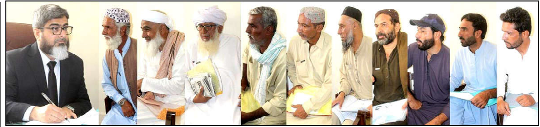
DG NAB (Balochistan) listening complainants during Khuli Kachehri held at NAB's complaint office at DC Office Quetta