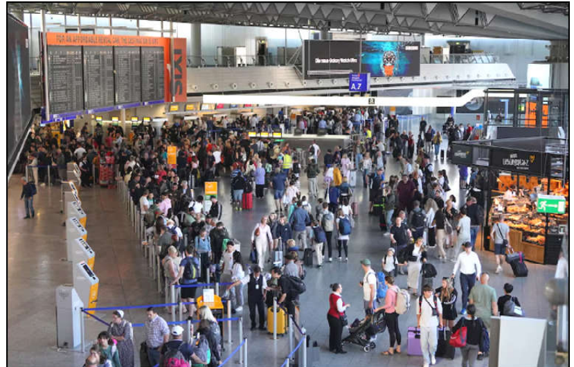
A display shows cancelled flights on the day activists of the "Letzte Generation" (Last Generation) staged a demonstration near the runways at the airport in Frankfurt, Germany.

Monitoring Desk KAMPALA: Ugandan police detained several people in the capital Kampala on Thursday during a second day of anti-corruption protests that are demanding the resignation of the parliament speaker, footage broadcast by local media showed. Drawing inspiration from weeks of youth-led protests in neighbouring Kenya that forced the president there to withdraw proposed tax hikes, young Ugandans began demonstrating this week against alleged graft by elected leaders. The police quickly shut down a planned march to parliament on Tuesday. They arrested at least 73 young protesters, according to Chapter Four Uganda, an organisation providing legal services to those detained. On Thursday, more demonstrators took to the streets, according to video posted on X by the Daily Monitor newspaper. The footage showed police in riot gear forcing several young adults into the back of a truck as they