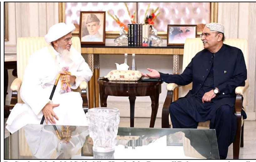
Dr Syedna Mufaddal Saifuddin, Head of the Dawoodi Bohra community, called on President Asif Ali Zardari at Bilawal House, Karachi.

KARACHI (APP): Head of Dawoodi Bohra community Syedna Mufaddal Saifuddin called on President Asif Ali Zardari here at Bilawal House on Friday. Speaking on the occasion, President Asif Ali Zardari said that the Bohra community was playing a significant role in the socio-economic development of Pakistan. The President said that the Bohra community was actively participating in the economy and business sectors of Pakistan. President Zardari said the services of Bohra community in education, health and other sectors are commendable. The President also appreciated the services of Syedna Mufaddal Saifuddin for Pakistan in the field of social services.