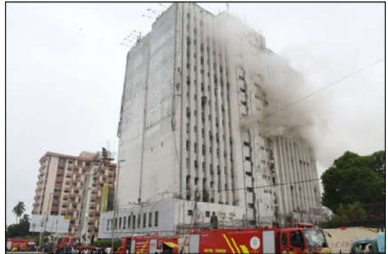
KARACHI: Pakistani fire fighters struggle to control a fire which broke out in a multi-story building located on Shahr-e-Faisal in Karachi.