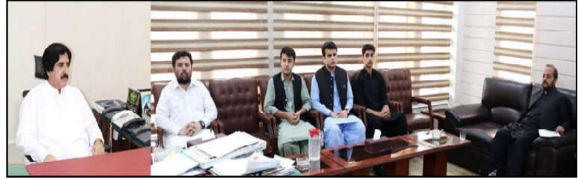
QUETTA: Internee students of University and Cadet College meeting with Director General Public Relations Balochistan Muhammad Noor Khetran

digital terrorism. It also references a fake clip attributed to Uzma Bukhari that was widely circulated, which had no basis in reality. The resolution calls for strict measures to stop digital terrorists and punish them severely. The federal government has designated special courts in Islamabad under the Prevention of Electronic Crimes Act (Peca), 2016, to try 'digital terrorists' and those allegedly involved in spreading 'anti-state propaganda' through digital content in the virtual world, it emerged on Tuesday. The federal government's decision to try people under Peca surfaced after the law ministry issued a notification pertaining to the establishment of the special courts, stating that the decision was taken after consulting the chief justice of the Islamabad High Court (IHC).