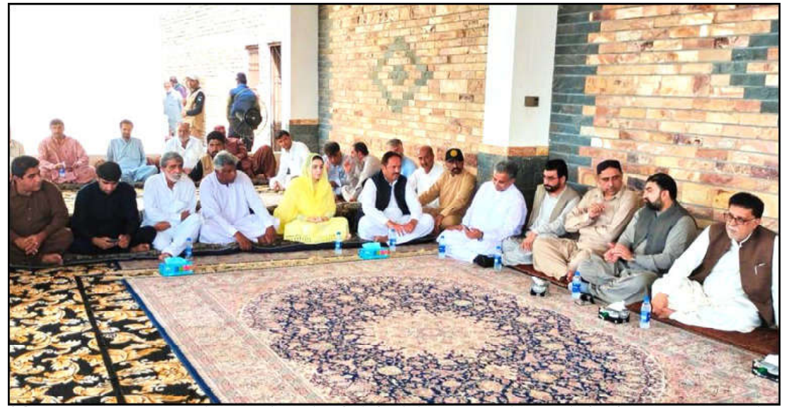
SOHBATPUR: A delegation meeting with Chief Minister Balochistan Mir Sarfaraz Ahmed Bugti at Khosa house

Rs 71 billion on electricity and flour. The PM said that despite limited resources the government had fulfilled its demands adding that there was a dire need that the people must also acknowledge their duties towards the state. He said that the government was keen to address the issue of unemployment and provide basic amenities of life to the people.