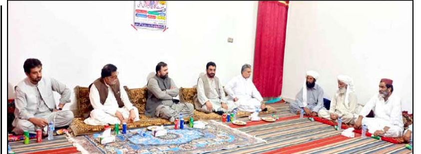
ERA BUGTI: A delegation of tribal elites meeting with Chief Minister Balochistan Mir Sarfraz Ahmed Bugti