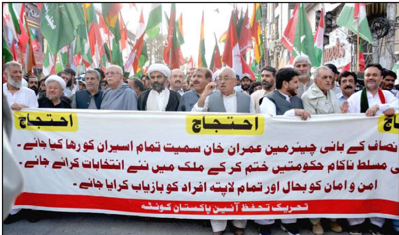
QUETTA: Members of Tehreek-e-Tahafuz Aain-e-Pakistan holding protest demonstration for recovery of missing persons and release of Imran Khan

ISLAMABAD (APP): The Supreme Court of Pakistan in a decision on a criminal review petition No.2/2024 stated that no one can claim to be Muslim until he/she has unconditional faith in 'Khatam-e-Nabuwwat' of Prophet Muhammad Peace Be Upon Him (PBUH).