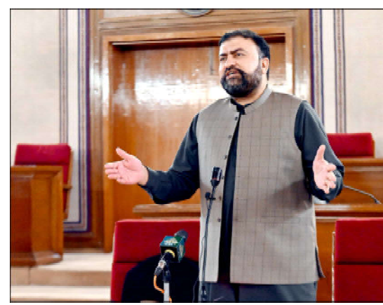
He said that one of the challenge relates to the crimes of theft, dacoity and robbery, which is not too big issue. He stressed that we need to depoliticize the police completely. Let, make pledge not to interfere in the police from today, adding the Chief Minister stressed. Speaking to the IGP Balochistan present in the