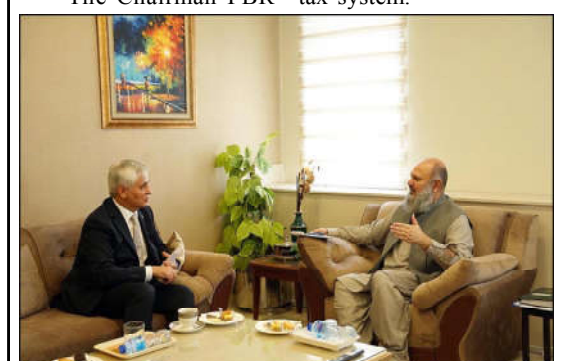
ISLAMABAD: ECO Secretary General Ambassador Khusrav Noziri calls on Federal Minister for Commerce Jam Kamal Khan to discuss regional trade dynamics and the future direction of the Economic Cooperation Organization (ECO).

also apprised about the ongoing tax reforms being implemented by the FBR including digitisation and automation of its systems to enhance efficiency, transparency and accountability. He reiterated the FBR's dedication to creating a conducive environment for taxpayers through continuous reforms and improvements in the tax system. Governor Faisal Karim Kundi expressed his appreciation for the efforts being made by the FBR to modernize and improve the tax system.