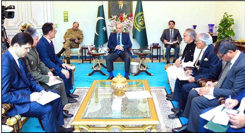
ISLAMABAD: Ambassador of Tajikistan H.E. Sharifzoda Yusuf Toir called on Prime Minister Muhammad Shehbaz Sharif.

Ph: 2841470/2841473 REG: No. BC-116 B/ID-445 Vol XXV No 334, Muharram 20, 1446 AH Saturday July 27, 2024 Pages 08, Price Rs.15