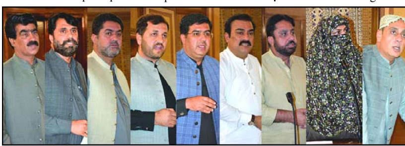
QUETTA: Provincial Ministers, Advisors and MPAs expressing their views during Balochistan Assembly session

ISLAMABAD: Jamaat-e-Islami (JI) has announced sit-ins at three locations in Islamabad and Rawalpindi following the arrest of its workers and road blockages at D-Chowk.