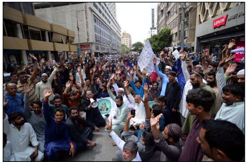
KARACHI: Members of All Saddar Alliance of Market and Mall Association are holding protest demonstration against economic crisis, at Saddar area in Karachi.

journalists he outlined a comprehensive strategy to accelerate Pakistan's shift towards a cashless society, underscoring the critical importance of prioritizing digital and financial inclusion as national imperatives. He proposed several key policy interventions to drive the adoption of digital financial services included ensuring universal access by integrating smartphones, SIM cards, and digital wallets or bank accounts (with already established services) into the national identity card issuance process, potentially funded through the Universal Service Fund.