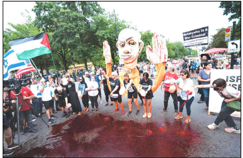
WASHINGTON: Pro-Palestinian demonstrators carrying an effigy of Israeli Prime Minister Benjamin Netanyahu protest in front of the White House to protest US President Joe Biden's meeting with Netanyahu.

Monitoring Desk WASHINGTON: Republican presidential nominee Donald Trump on Thursday invoked the annihilation of US adversary Iran in a social media post reminiscent of his most incendiary outbursts while in the White House. "If they do 'assassinate' President Trump, which is always a possibility, I hope that America obliterates Iran, wipes it off the face of the Earth — if that does not happen, American Leaders will be considered 'gutless cowards!'" he wrote on his social media platform, Truth Social. Trump made the remarks alongside a brief video of Israeli Prime Minister Benjamin Netanyahu bringing up alleged Iranian plots against Trump in his address to the US Congress on Wednesday. US media reported last week that the US Secret Service had increased security for Trump weeks ago after authorities learned of an Iranian plot to kill him, although it was not linked to the recent attempt on his life in which a 20-year-old American fired shots during a campaign rally. CNN reported that US authorities received intelligence from a "human source" on a plan by Tehran targeting the former president, causing protection to be boosted for Trump. Other US outlets also reported the plot.