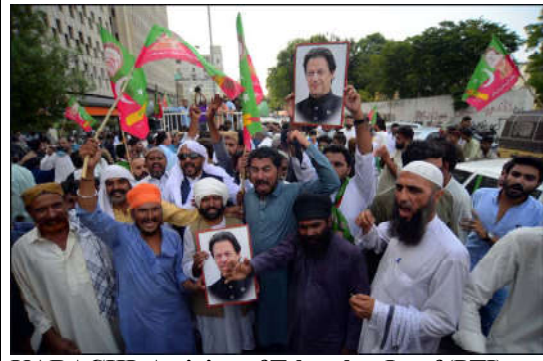
KARACHI: Activists of Tehreek-e-Insaf (PTI) are holding protest demonstration for release of PTI Founder Imran Khan, at Karachi press club.