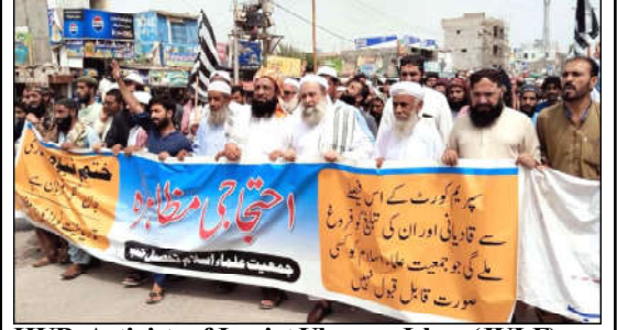
HUB: Activists of Jamaat Ulema-e-Islam (JUI-F) are holding protest rally for acceptance of their demands, in Hub.