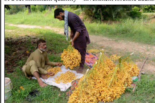
FAISALABAD: Labourers busy in plucking dates at his Farm.