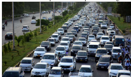
ISLAMABAD: A view of traffic jam at Islamabad Expressway in the Federal Capital.

During the Khuli Kachehri, he listened to the complaints of the citizens and marked their applications to the concerned officers for timely action on merit. He also directed them to send reports to his offices in the given time frame. He further said that strict action will be taken against officials involved in bribery or corruption and a zero tolerance policy will be adopted in this regard.