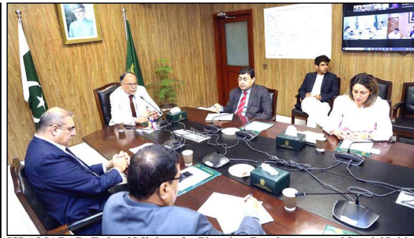
ISLAMABAD: Federal Minister for Planning, Development, and Special Initiatives, Ahsan Iqbal chaired a high-level meeting with provincial planning ministers.