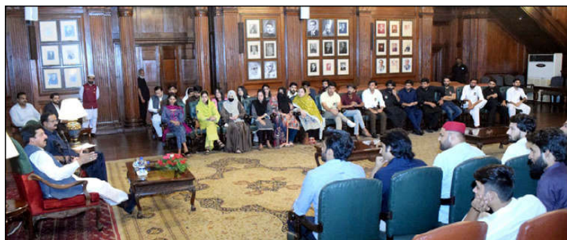
LAHORE: The students of various universities called on Chancellor/Punjab Governor Sardar Saleem Haider Khan here at Governor House.

The provincial minister further said that some people are carrying propaganda against them on social media regarding deforestation and old videos from some foreign countries are being shared. He said that he had not issued orders for cutting even a single tree.