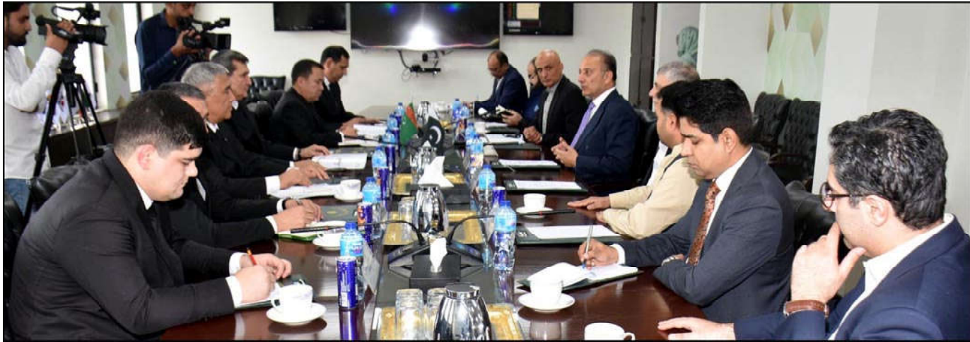
Federal Minister for Petroleum, Dr. Musadik Malik held a meeting with the Deputy Chairman of the Cabinet of Ministers and Minister of Foreign Affairs of Turkmenistan, Mr. Rashid Meredov in Islamabad