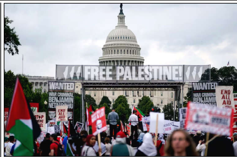
Pro-Palestinian demonstrators gather on the day of Israeli Prime Minister Benjamin Netanyahu's address to a joint meeting of Congress, on Capitol Hill in Washington, U.S.

The boat has been at the center of controversy since it was first towed into Portland harbor in Dorset a year ago to house up to 500 asylum-seekers.