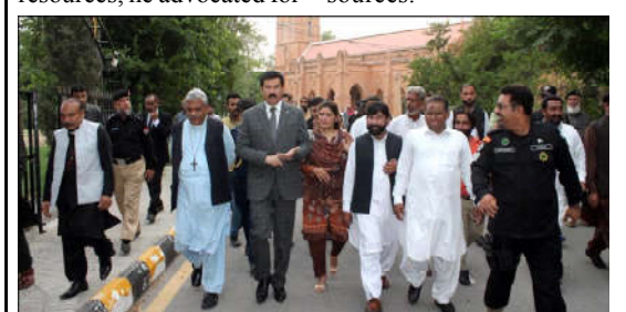
PESHAWAR: Khyber Pakhtunkhwa Governor Faisal Karim Kundi visiting the Saint Jan Cathedral Church at Cantt area.

This move is expected to promote sustainable energy practices, reduce dependency on conventional power sources.