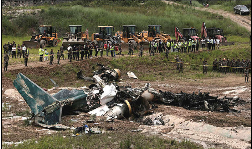
A view shows wreckage of a Saurya Airlines plane that caught fire after skidding off the runway while taking off at Tribhuvan International Airport, in Kathmandu, Nepal

Biden, 81, ended his reelection effort after a debate with Trump in which he often stammered and failed to aggressively challenge attacks by Trump that included falsehoods.