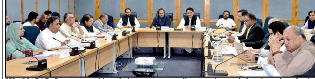
ISLAMABAD: Senator Aon Abbas, chairman senate standing committee on industries and production presiding over a meeting of the committee at Parliament Lodges.

provided a comprehensive overview of Solar and Allied Equipment Manufacturing and the Automobile Policy EV incentive regime. The Chairman of the Committee, Senator Aon Abbas, recommended that in the next meeting, EDB officials must provide details of the implementation plan for the EV Policy 2030.