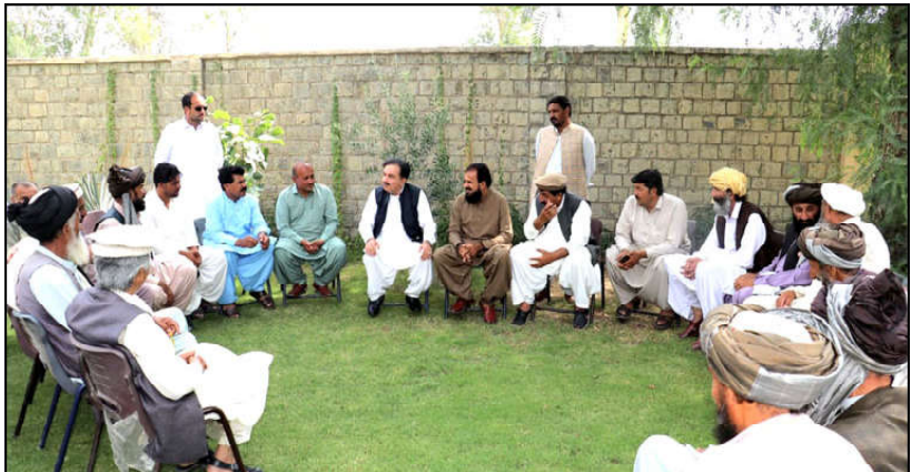
ZHOB: Governor Balochistan Sheikh Jaffar Khan Mandokhail listening problems of people

Speaking about PTI founder Imran Khan, he said the 14-month long illegal incarceration of Imran Khan couldn't achieve anything for the government as people had voted for his party without the PTI having a party symbol for the polls. He warned the government against rampant human rights abuses which may lead to anarchy. "The world is watching everything happening in Pakistan where even court orders are brushed under the carpet," he cautioned.