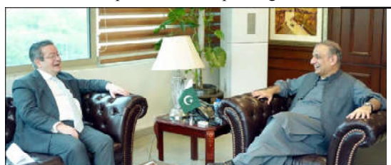
Ambassador of France to Pakistan, Nicolas Galcy called on Federal Minister for Board of Investment, Privatization and Communications, Abdul Aleem Khan in Islamabad.

prosperity in the country. The senior officials of FBR and other concerned officers also attended the meeting, which also deliberated on measures to promote industrial growth in the province. Speaking on the occasion, the governor lauded the efforts of the Federal Government and revenue-collecting authority in developing the industrial sector in Khyber Pakhtunkhwa. He said that the business community of Khyber Pakhtunkhwa (KP) plays a major role in revenue contribution to the national treasury. Faisal Karim said that the federal government has already given relief to the KP industrial sector.