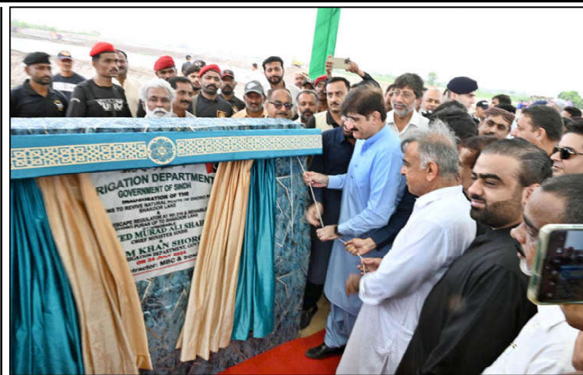
BADIN: Chief Minister Sindh Syed Murad Ali Shah inaugurating newly constructed regulator of spinal drain of LBOD at RD210 near Shadi Large.

The CM said that 204 drains from three divisions, totalling 1735 miles in length, would discharge into the LBOD. These include 108 drains from Badin, spanning 813 miles, 51 drains from Mirpurkhas, covering 454 miles and 43 drains from Sanghar, extending over 336.6 miles.