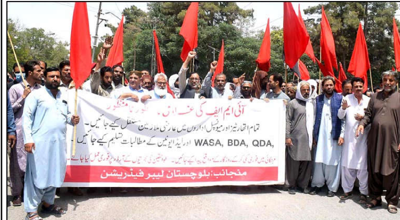
QUETTA: Activists of Balochistan Labour Federation hold protest rally in favor of their demand.

During the meeting, overall working of the local government bodies and development works were discussed.