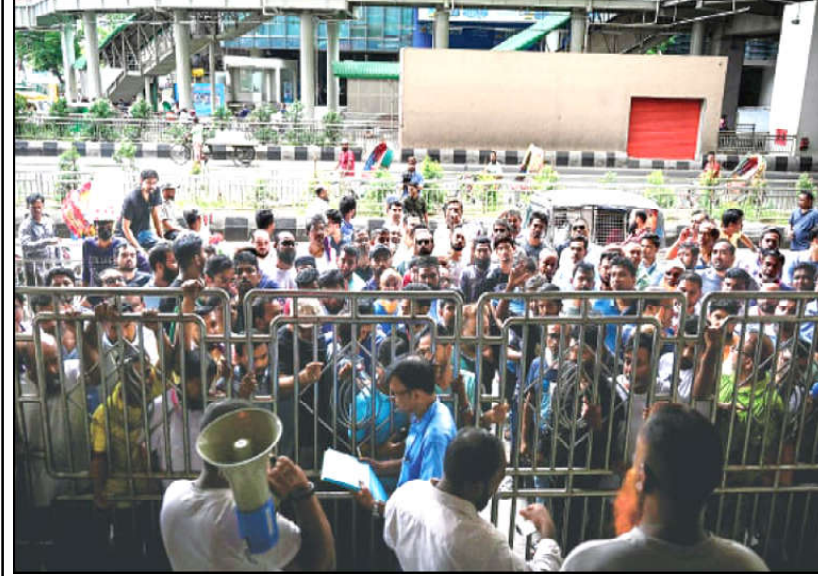
Residents queue in Dhaka to receive credit on their prepaid electric bills after an internet blackout during the anti-quota protests.

Hamas and other Palestinian militant groups. "We are on the UN's blacklist in any case. All the excessive mortality ended on October 7," MK Yulia Malinovsky of Yisrael Beiteinu, who proposed to designate the UNRWA as a terrorist organization, said on Monday. She called the agency "a fifth column" within Israel. The Knesset voted 50-10 in favor of her bill, in the first reading. Israeli lawmakers also advanced the bills that would ban the UNRWA from any activity.