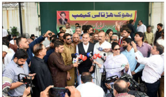
LAHORE: PTI workers and MPAs stage hunger strike camp at the main gate of the Punjab Assembly of the provincial capital.