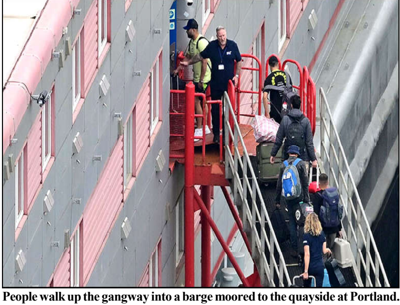
People walk up the gangway into a barge moored to the quayside at Portland.