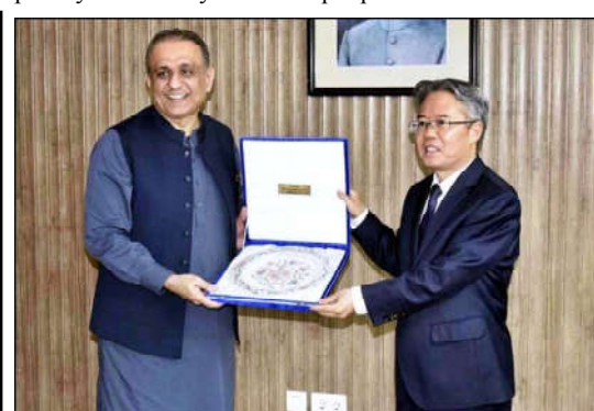
ISLAMABAD: Federal Minister Board of Investment, Abdul Aleem Khan meets with the Chinese Ambassador, His Excellency Jiang Zaidong to Bolster Economic Cooperation.

The WASA MD also announced plans to increase surveillance and enforcement along the nullah to prevent dumping and encourage community involvement in maintaining the waterway's cleanliness.