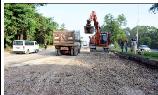
ISLAMABAD: Work in progress on Park Road expansion project in the Federal Capital.

"PTI members themselves believe that fake votes casted votes in the elections. I had filed a petition in the Election Commission against this rigging, but Umar Ayub, who considers himself the champion of fair and transparent elections, started opposing him to dismiss his petition.