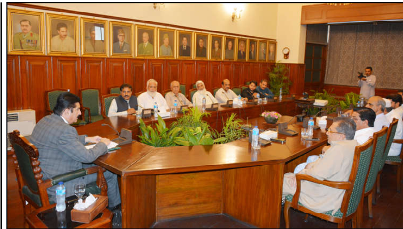
PESHAWAR: A delegation of Khyber Union of Journalists meeting with Khyber Pakhtunkhwa Governor Faisal Karim Kundi.