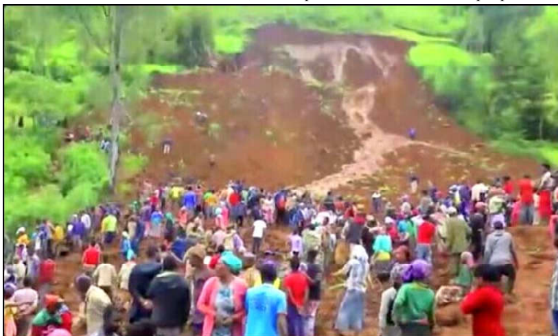
The aftermath of a landslide in Gofa zone in Southern Ethiopia regional state.

Less than 36 hours after Biden endorsed Harris, she secured the nomination on Monday night by winning the pledged support of a majority of the party's delegates who will determine the nomination, the campaign said.