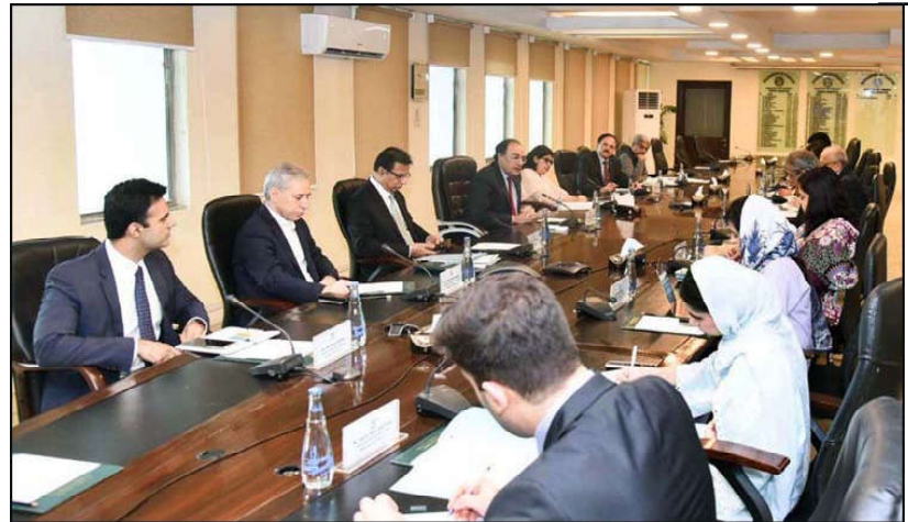
ISLAMABAD: Federal Minister for Finance & Revenue Senator Muhammad Aurangzeb in a virtual meeting with the Representatives from Moody's Ratings.