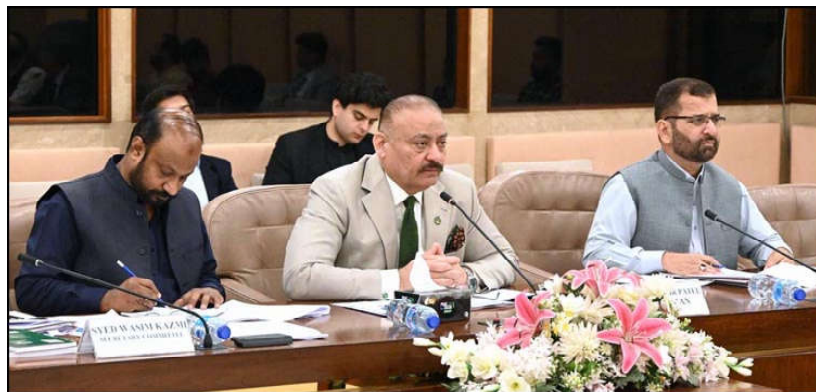
ISLAMABAD: National Assembly Standing Committee Meeting on Maritime Affairs under the Chairmanship of Abdul Qadir Patel, Minister for Maritime Affairs Qaiser Ahmed Sheikh, Federal Secretary Maritime and senior officials of Ministry and KPT were present.

Moreover, all zonal officers and SHOs are directed to meet citizens during the designated office hours and resolve their issues promptly and on merit.