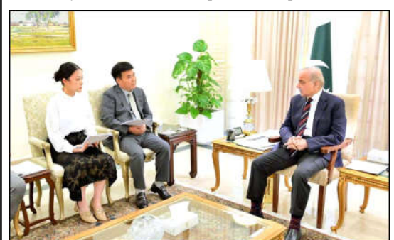
ISLAMABAD: A delegation of Hangeng Trade Company calls on Prime Minister Muhammad Shehbaz Sharif.