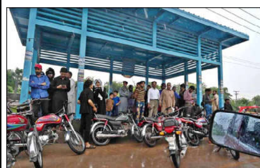
ISLAMABAD: People standing under the bus shed at Expressway to take shelter during rain that experienced the Federal Capital.