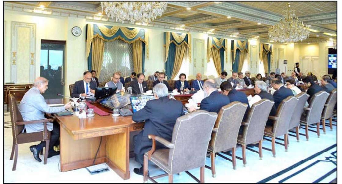
ISLAMABAD: Prime Minister Muhammad Shehbaz Sharif chairs a meeting of National Export Development Board (NEDB).

taking measures to introduce crop varieties with high yields. He said that the delivery time of Pakistani goods to Europe and America should be reduced by solving the problems related to the shipping of exports immediately. Similarly, the commerce ministry and Board of Investment should ensure cooperation regarding the transfer of Chinese export industries to Pakistan. He also called for carrying out research and development, innovation and brand development.