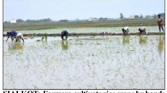
SIALKOT: Farmers cultivate rice crops by hands in the fields on the outskirts near the border.

ISLAMABAD (APP): The 100-index of the Pakistan Stock Exchange (PSX) witnessed bullish trend on Tuesday, gaining 447.90 points, a positive change of 0.57 percent, closing at 78,987.09 points against 78,539.19 points on the last working day. A total of 316,245,462 shares were traded during the day as compared to 375,599,184 shares the previous day,