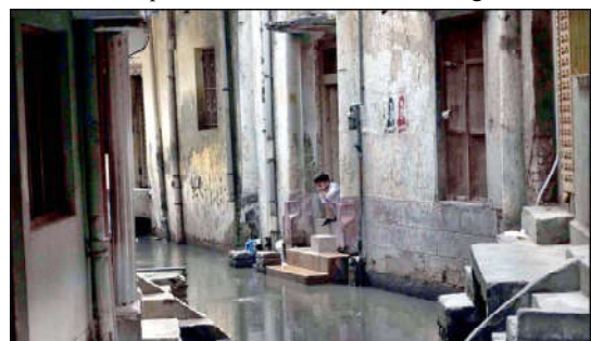
RAWALPINDI: A view of rain water accumulated in the street at Imambara Mohallah after rain that experienced the Twin Cities.

LAHORE (APP): Lahore Development Authority (LDA) teams, during an on going operation against commercialization fee defaulters, sealed another 15 properties in the Sabzazar Scheme here on Tuesday. On the directions of Director General LDA Tahir Farooq, the teams sealed properties including Plot No. 120 Block A, Plot No. 41 Block G, Plot No. 59 Block G, Plot No. 51 Block C, Plot No. 54 Block C, Plot No. 22 Block C, Plot No. 9 Block E, Plot No. 170 Block C, Plot No. 766, 768, 782, 851, 994 in Block H, Plot No. 324 in Block N, and Plot No. 10 in Block P.