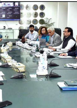
ISLAMABAD: Federal Minister for Industries and Production, Rana Tanveer Hussain chaired a meeting of the Sugar Advisory Board.