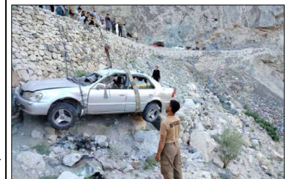
GILGIT: Rescue 1122 crew in action, expertly lifting a car from the ditch after an accident.

MIRPUR (AJK): (APP): Seasonal nullahs, besides rivers and streams, flowing in Azad Jammu and Kashmir (AJK), including in Mirpur division, were flooded after the upper reaches - besides various ground parts of the state lashed with first heaviest rainfall since the wee hours on Tuesday. The AJK State Disaster Management Authority (SDMA) has warned people living near the seasonal nullahs and streams to refrain from visiting the flooded ponds, rivers and streams as the main spell of the torrential rains reported in various parts of the State today. The Mirpur district and outskirts lashed with much awaited heavy rains that opened the advent of the monsoon rains which also hit various other parts of the liberated state. Various parts of the AJK state lashed with first heaviest rainfall that affected various areas including Mirpur district causing partial loss to the material - especially in the New City and various adjoining slums areas of this district.