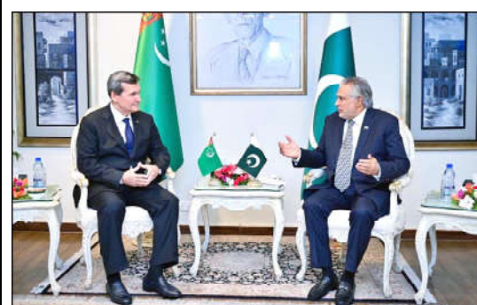
ISLAMABAD: Deputy Prime Minister and Foreign Minister Senator Mohammad Ishaq Dar holds talks with Deputy Chairman of the Cabinet of Ministers and Minister for Foreign Affairs of Turkmenistan Rashid Meredov at Ministry of Foreign Affairs.

a news release said. Out of the 162 PSDP projects managed by Pak-PWD, as many as 138 projects are attributed to provinces and 24 to federal entities. The minister underscored the pivotal role of the Central Development Working Party (CDWP) in this process, emphasizing that all PSDP projects must be presented before the CDWP forum before any transfer decisions were made. He directed the departments concerned to compile comprehensive "Position Papers" outlining each province's projects for consideration during upcoming CDWP meetings.