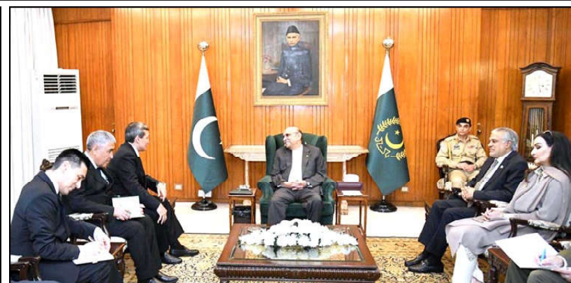
ISLAMABAD: Deputy Chairman of the Cabinet of Ministers and Foreign Minister of Turkmenistan, Mr. Rashid Meredov, called on the President Asif Ali Zardari, at Aiwan-e-Sadr, Deputy Prime Minister, Senator Mohammad Ishaq Dar, was also present on the occasion.

tives are properly spent on infrastructure improvements to guarantee uninterrupted 5G services in the country. The Committee also discussed "The Establishment of Telecommunications Appellate Tribunal Bill, 2024" in detail. According to the bill, a tribunal will be established to expedite pending cases in the telecom sector, which are currently delayed in the High Court. Once established, the tribunal will be bound to decide within 90 days. Currently, 71 cases are pending before the High Court and will be transferred to the tribunal upon the bill's passage.