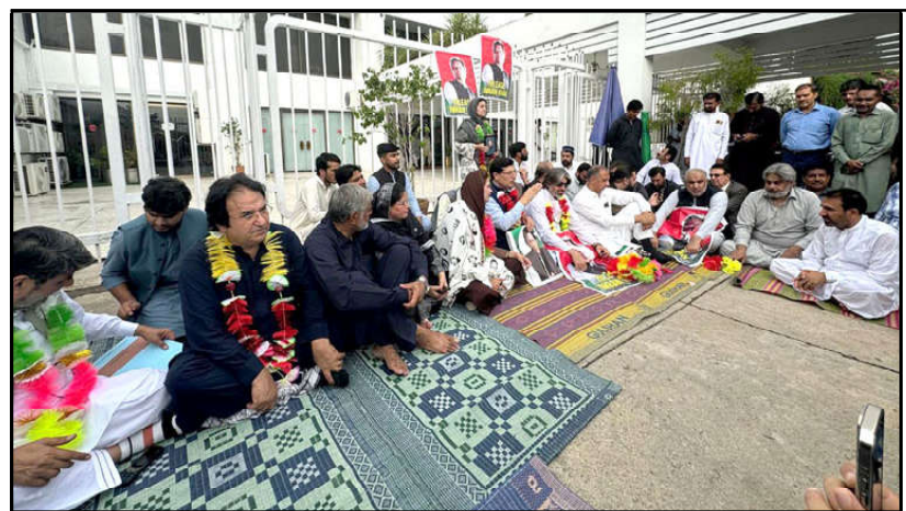
ISLAMABAD: Members National Assembly of Opposition parties sits outside Parliament House during hunger strike protest in favor of their demands in the Federal Capital.