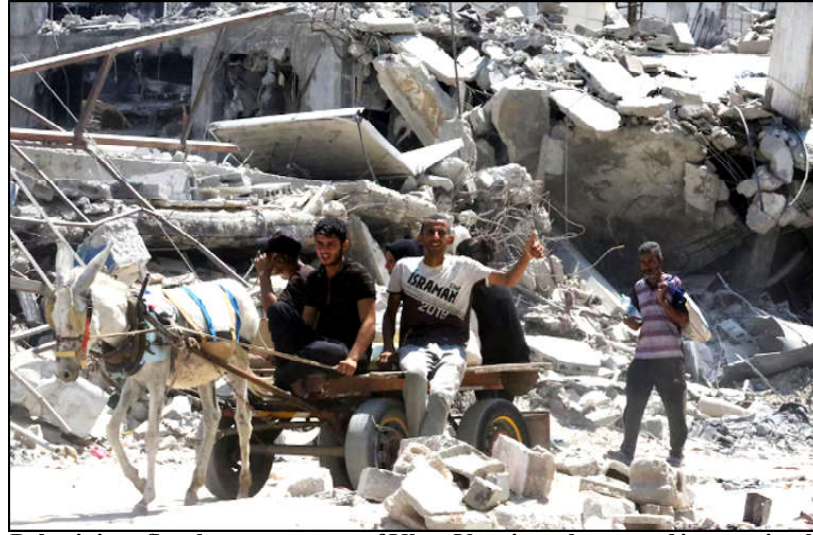
Palestinians flee the eastern part of Khan Yunis as they travel in an animal-drawn cart after they were ordered by Israeli army to evacuate their neighborhoods, amid Israel-Hamas conflict, in Khan Yunis in the southern Gaza Strip.

Earlier this year it carried out a sweeping operation in Khan Yunis for months that reduced swaths of the city to rubble and displaced tens of thousands of people.