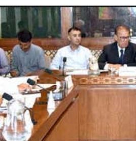
ISLAMABAD: Federal Minister for Industries and Production, Rana Tanveer Hussain chaired a meeting of the Sugar Advisory Board.

and innovations were being introduced. The official said that lot of work was being done on institutional reforms in the CDNS. Given the current market trend in the country, an ambitious target had been set to improve the savings culture further, he added. Replying to another question, he said that the CDNS has set an annual target of Rs 1650 billion for the current Fiscal Year, 2024-25, which will promote the saving culture in the country. He said that the CDNS has realized a target of Rs1.742 trillion in fresh bonds and exceeded 100 percent of the annual target in the last fiscal year 2023-24, from July 1 to June 30 th . The National Savings has set an annual target of Rs 1.7 trillion for the year.