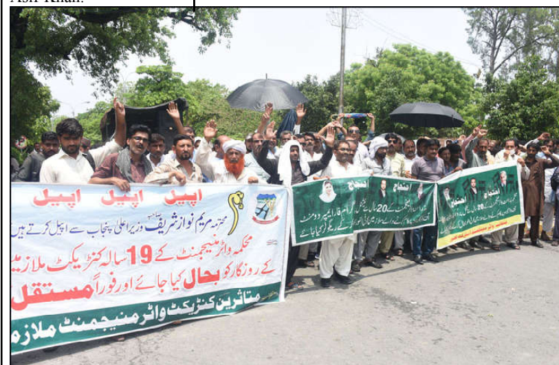
LAHORE: Employees of the Water Management Department protesting for their restoration during the protest sit-in of water management department.