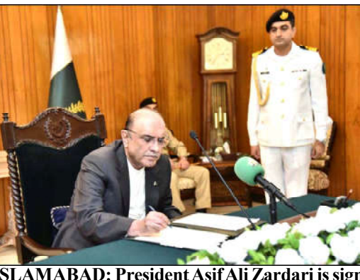
ISLAMABAD: President Asif Ali Zardari is signing the Christian Marriage (Amendment) Act 2024 into law in a special ceremony held at Aiwan-e-Sadr.

The company was also constructing a slaughter house with all the latest facilities at Gwadar, at a cost of $50 million.