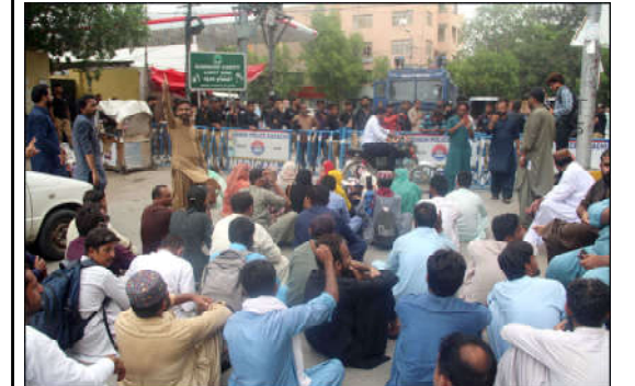
KARACHI: IBA cleared teachers are protesting in favor of their demands outside press club in the Provincial Capital.

LAHORE (APP): Provincial Minister for Information and Culture Azma Bokhari has said that the entire nation now knows who digital terrorists are and who is behind them. In a press statement issued here on Tuesday, she said the younger generation is being incited against the country's security institutions through systematic planning. "The children of the person conspiring against the country are living a luxurious life in London. Pakistan's youth should stay away from the agenda of this disruptive party," she added. She mentioned that parents should learn a lesson after the events of May 9. "A specific group and their facilitators are causing unrest, disorder, and divisive politics in Pakistan under their agenda. A progressing and developing Pakistan is not acceptable to this group. They continuously create new obstacles against the country's security and development. The PTI started different movements against the country including resignations from assemblies, jail bhara movement, and hunger strikes. The failed movements of the 'Nakaam' Khan have become a source of disgrace and embarrassment for him. All the narratives of this group have failed just like their politics. The people of Pakistan should recognize their real enemies. The public was deceived in the name of a Naya Pakistan. People should stay away from this disruptive group," she maintained.