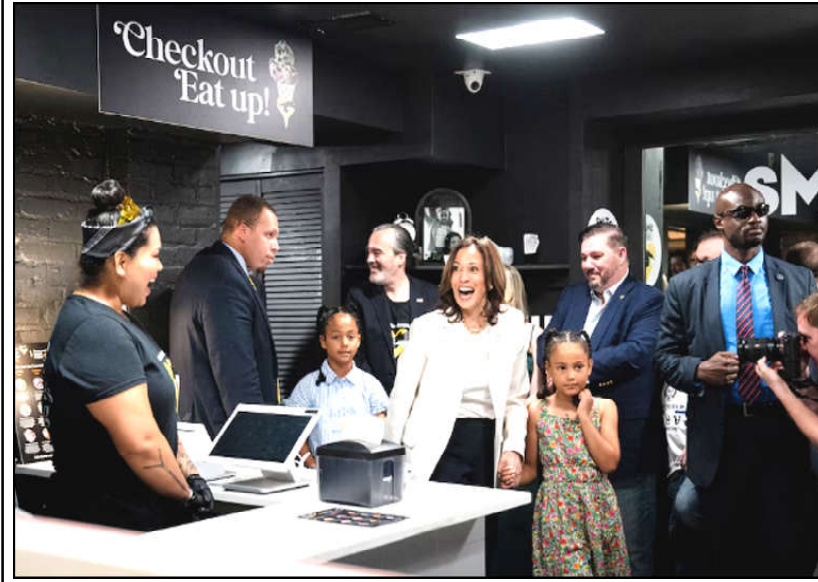
Vice President Kamala Harris smiles as she attends the opening of a pop-up ice cream shop "Smize & Dream" owned by Tyra Banks, in Washington, U.S.

Monitoring Desk BEIJING: A bridge collapse caused by torrential rains in northern China killed 12 people and left more than 30 missing, state media said on Saturday. Large parts of northern and central China have been battered in recent days by rains that have caused flooding and significant damage. The bridge in the northwestern Shaanxi province buckled "due to a sudden downpour and flash floods" on Friday night, according to state news agency Xinhua.