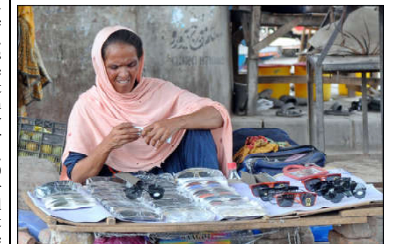
MULTAN: A woman vendor selling sunglasses at her roadside setup to earn livelihood.