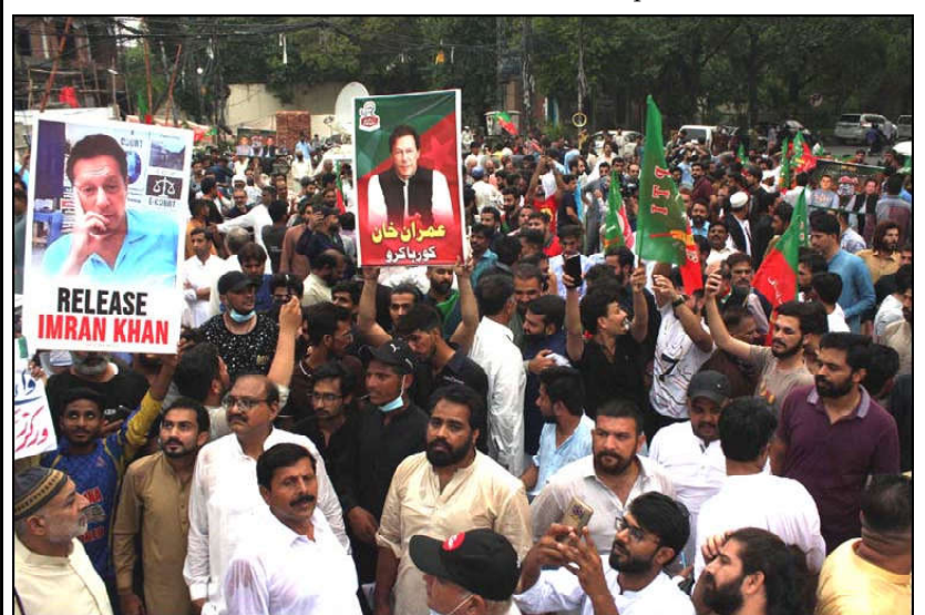
LAHORE: Activists of Tehreek-e-Insaf (PTI) are holding protest demonstration for release of PTI Founder Imran Khan, at Lahore press club.