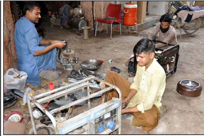
HYDERABAD: Laborers are busy in repairing works to generators to earn their livelihood for support their families, at their workplace in Hyderabad.

Food exports during July-June (2023-24) were recorded at $7,369.917 million as compared to the exports of $5,021.290 million in July-June (2022-23), according to the latest PBS data.