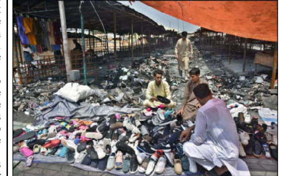
ISLAMABAD: People selecting and purchasing shoes from a makeshift stall at H-9 weekly bazaar.