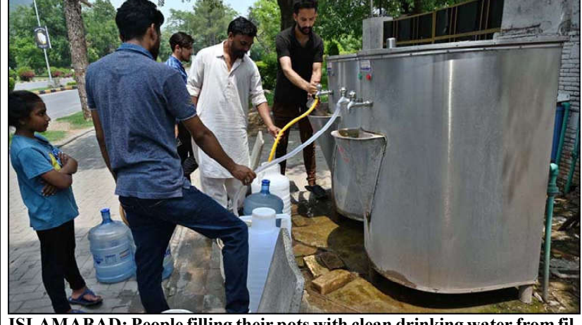
ISLAMABAD: People filling their pots with clean drinking water from filtration plant at F-6 in the Federal Capital.

Additionally, city officials are urged to develop emergency response plans.