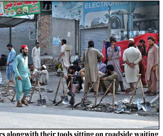
ISLAMABAD: Labourers alongwith their tools sitting on roadside waiting for clients to be hired for work during morning time at Khanna Pul.

No record of FIA was summoned in the Islamabad High Court, none of our representatives appeared in the High Court, the court issued notices to the parties for July 23.