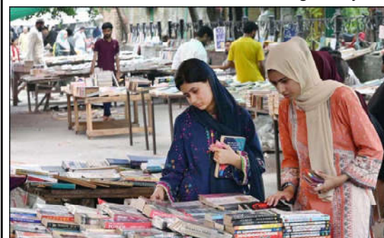
LAHORE: Girls busy in selecting and purchasing old books from roadside stall at Mall Road in Provincial Capital.

once it enters the brain, it starts eating it adding that severe headache, vomiting, flu and restlessness are mainly its symptoms. This free living microorganism primarily feeds on bacteria but can turn pathogenic in humans causing an extremely rare, sudden and usually fatal brain infection known as naegleriasis, Dr Iftikhar informed. The known thoracic surgeon explained that the first patient with amoeba was diagnosed in 2008 first time in Pakistan and as many as 150 had died of it so far and added that 148 of them had a history of ablation while only two had swimming history.