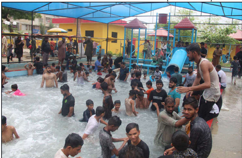
KARACHI: Children cool off in a swimming pool during hot weather in the Provincial Capital.

mitigate risks and protect communities. This proactive measure underscores our commitment to safeguarding lives and minimizing the impact of emergencies. As we continue to face the challenges posed by natural disasters and emergencies, NDF Pakistan reaffirms its dedication to implementing robust contingency measures that prioritize safety, resilience, and community well-being. We urge all stakeholders to remain vigilant and prepared during times of potential crisis.