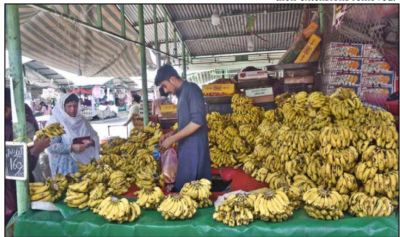
ISLAMABAD: A vendor selling bananas to customers at his stall in weekly Sunday Bazaar in the Federal Capital.

In case of heavy rains, farmers should dig a deep trench along the edges of the fields to allow excess water to drain out. This water can later be directed to a larger channel to irrigate paddy or sugarcane fields. If it is not possible to drain water from the fields, deep pits should be dug on both sides of the field to collect the excess rainwater.