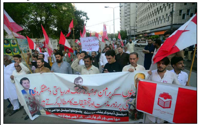
KARACHI: Members of National Democratic Movement are holding protest demonstration against Bannu incident, at Karachi press club.