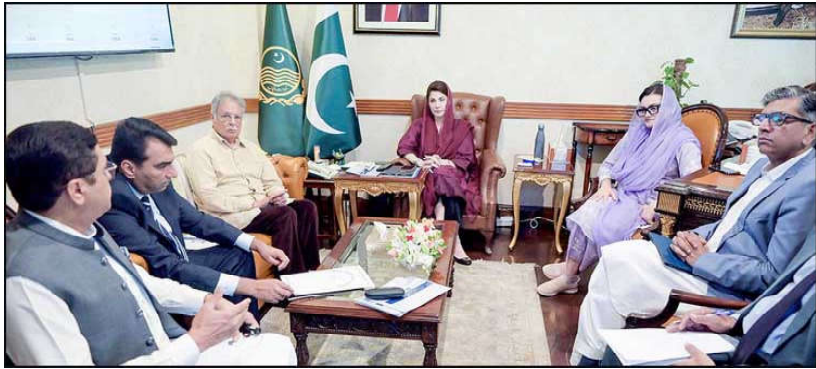
LAHORE: Punjab Chief Minister Maryam Nawaz Sharif Chairing a meeting to finalise Technical Education and Vocational Training Authority (TEVTA) Mapping Plan.

'Heavy Machinery Driving/Operator Course' in collaboration with Large Scale Construction Developers. The CM approved the construction of 45 welding workshops in 45 cities, besides the construction of state-of-the-art welding and construction course labs in Gujranwala, Sahiwal, Bahawalpur, Multan, Attock, Taxila, Layyah and Mianwali. She also agreed to a proposal to recruit 1,000 employees to overcome shortage of human resource in TEVTA, and directed to increase monthly budget for the purchase of training material for practical training @ Rs 2,000 per student per month.