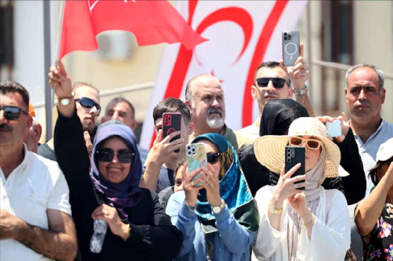
People watch a military parade to mark the 1974 Turkish invasion of Cyprus in response to a short-lived Greek-inspired coup, in the Turkish-controlled northern Cyprus, in the divided city of Nicosia.

Monitoring Desk LONDON: Three police officers were injured and one man was arrested on Friday in the latest anti-immigration protests at a site earmarked for housing asylum seekers in Dublin, authorities said. It was the latest in a series of clashes at the site in a deprived northern suburb of the Irish capital over the past week. Police said a planned public gathering at the site on Friday initially "passed off peacefully" before turning into an "incident of public disorder". A fire broke out at the building site, with police subjected to "both verbal and physical abuse including rocks, concrete bricks and other objects being thrown at them", they said in a statement. The Garda — Ireland's national police force — said officers used pepper spray and batons to "defend themselves".