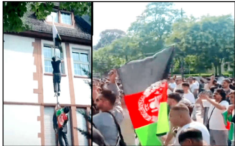
The picture shows Afghan nationals attacking Pakistan consulate in Frankfurt, Germany.