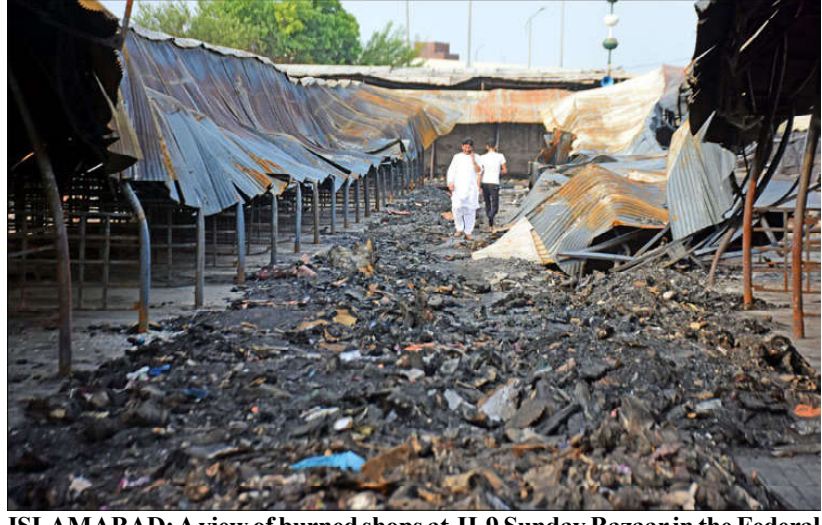
ISLAMABAD: A view of burned shops at H-9 Sunday Bazaar in the Federal Capital.