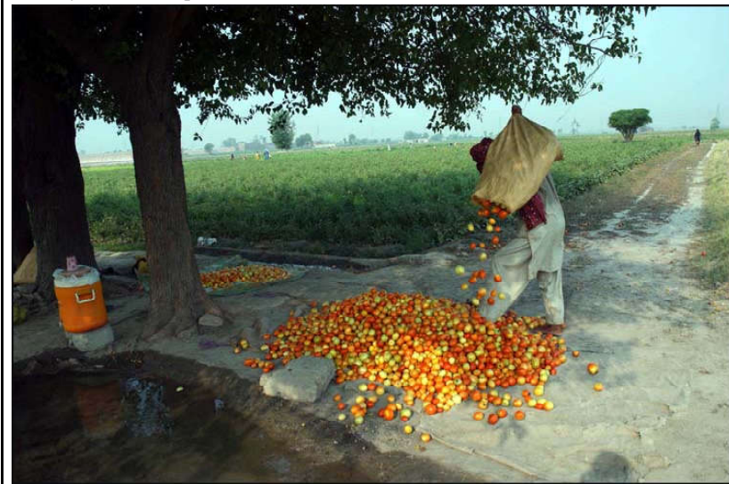
GUJRANWALA: Farmer is busy in plucking tomatoes at a field to earn his livelihood for support of family, in Gujranwala. Farmers adopt pick and choose of their tomato crop and then to pack them in wooden cartons for the market to get better prices of their produce and attract the buyers.