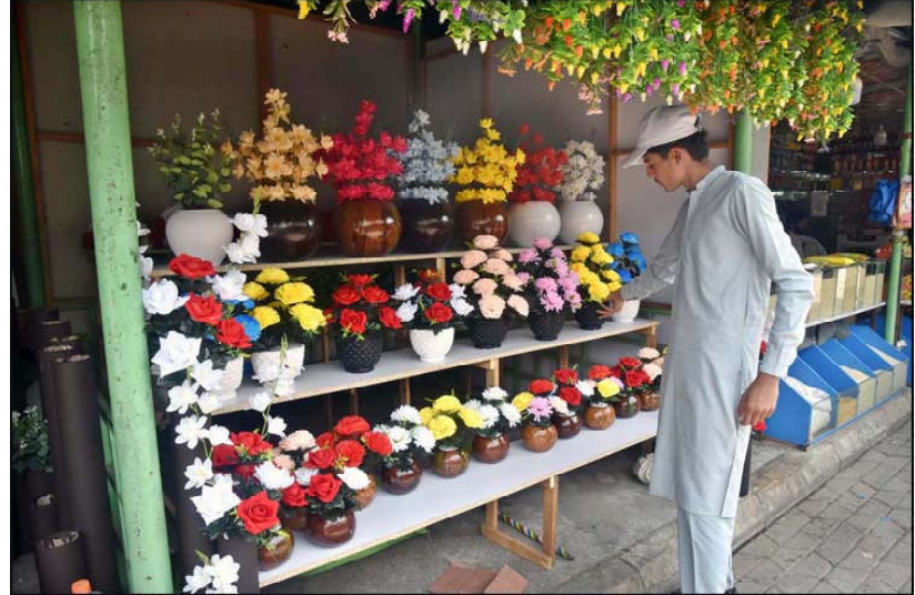
ISLAMABAD: A vendor arranging and displaying artificial flower to attract the customers outside weekly Sunday Bazaar setup in H-9 Sector.

By providing farmers with access to superior breeding stock, the department aimed to address some of the key challenges faced by the livestock sector, including low productivity and poor animal health.