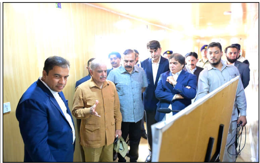
Prime Minister Muhammad Shehbaz Sharif receives briefing regarding the construction of Jinnah Medical Complex in Islamabad.

In 2017, Nawaz Sharif was removed from power but the nation does not want to see any such thing again. We have to free the country from debt and every conspiracy against Pakistan will be countered. No one can stop Pakistan's development now and anti-Pakistan powers will be exposed in front of the whole world, he said.