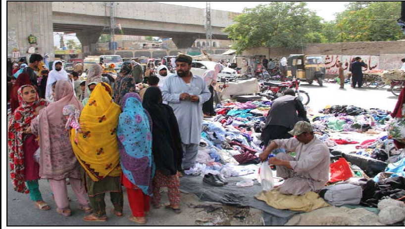
QUETTA: People are buying clothes from a stall, at a weekly bazar in Quetta.