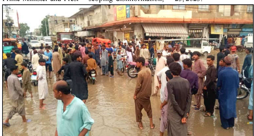
HUB: Residents of Allahabad Town are blocked road as they are holding protest demonstration against prolong electricity and sui gas load shedding in their area, at Main RCD road in Hub.

be a crucial step towards rectifying these historical injustices and allowing the Kashmiri people to shape their own political future, he added. The international community has a moral obligation to support the Kashmiris' quest for self-determination and pressurize India to abide by its international commitments. "The plight of political detainees in Kashmir serves as a poignant reminder of the ongoing human rights debacle, as countless individuals remain incarcerated without charge or trial, subjected to inhumane treatment, and denied their fundamental rights," he added. The implementation of UNSC resolutions would