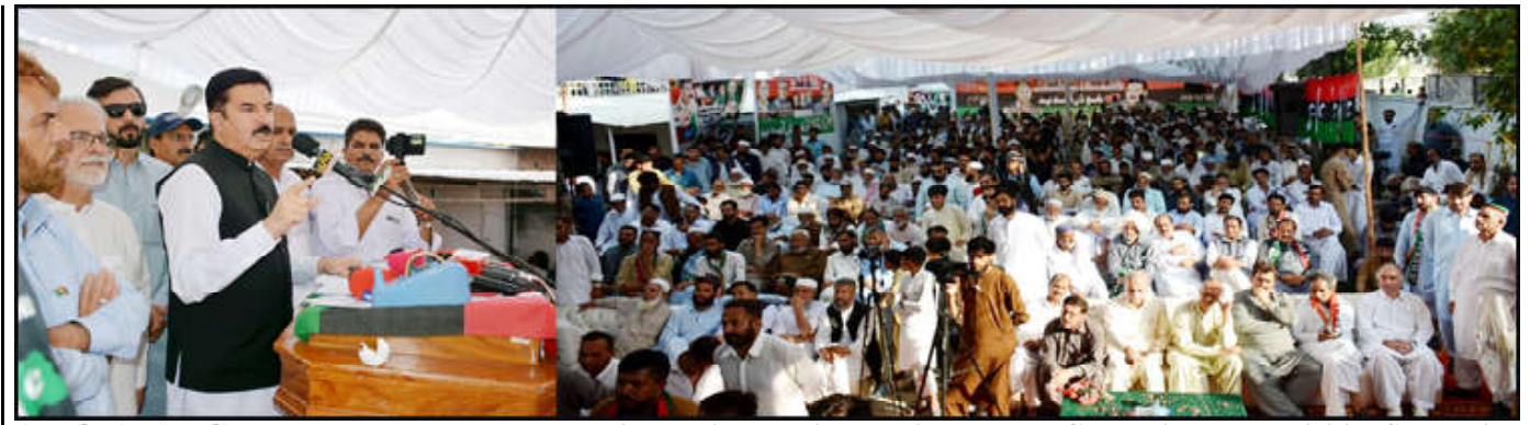
ABBOTABAD: Governor Khyber Pakhtunkhwa Faisal Karim Kundi addressing Workers Convention at PPP Division Secretariat.

bribes. Addressing the possibility of an alliance between PTI and Jamiat Ulema-e-Islam-Fazl (JUI-F) against the Pakistan Muslim League-Nawaz (PML-N)-led federal government, Governor Kundi expressed skepticism. He argued that such an alliance was almost impossible as Maulana Fazlur Rehman was seeking retribution, having labeled Imran Khan's party as foreign agents. In a separate address at a Pakistan People's Party (PPP) workers' convention, Governor Kundi announced the reorganization of his party in Khyber Pakhtunkhwa. He also criticized the provincial government for failing to appoint full-time vice-chancellors in 26 out of 36 universities of the province, highlighting another area of governance that needs urgent attention.