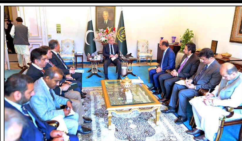
ISLAMABAD: A delegation of Abu Dhabi Ports Pakistan calls on Prime Minister Muhammad Shehbaz Sharif.

ated in May 9 riots cases. Maryam Nawaz alleged that when the country starts to stabilize, some individuals become uncomfortable and make decisions that hinder progress. She questioned the Supreme Court's judgement, asking if it was not a cause of instability, then what was? She also criticised the PTI-led government, saying that despite being in power for four years, they had caused unprecedented destruction.