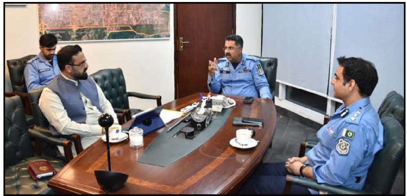
ISLAMABAD: Inspector General of Police (IGP) Islamabad Syed Ali Nasir Rizvi, chaired important meeting regarding the security of the federal capital and new recruitment in Islamabad Police.

Ambassador Blome also highlighted the broader societal benefits of supporting women entrepreneurs, stating, "The United States firmly believes that expanding opportunities for women entrepreneurs leads to more stable societies. When women entrepreneurs succeed,