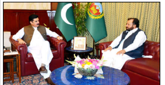
PESHAWAR: Former Provincial Minister Muzaffar Sayed meeting with Khyber Pakhtunkhwa Governor Faisal Karim Kundi at Governor House.

KARACHI (APP): The funeral prayers of Constable Yousuf, who was martyred in the firing of unknown suspects in the limits of Samanabad Police Station, was offered at Police Headquarters Garden, South. Sindh Home Minister Zia Ul Hasan Lanjar along with IGP Sindh Ghulam Nabi Memon, Additional IGP - Karachi Javed Akhtar Odho, Zonal DIGPs, District SSPs, Pakistan Rangers Sindh officers, relatives of the martyred constable, friends and local people attended the funeral prayer on Friday. The Sindh Home Minister expressed his condolences and sympathy with the relatives of the martyred constable and said that the Sindh government and the Sindh Police Department were with them in these moments of extreme grief. Paying tribute to the services of the martyred constable of the Sindh Police, the minister said that the sacrifices of the police martyrs for the security of life and property of the people and the establishment of peace were priceless and unforgettable. On the occasion, the Home Minister issued special orders to the senior officers to provide the prevailing benefits to the heirs of the martyr.