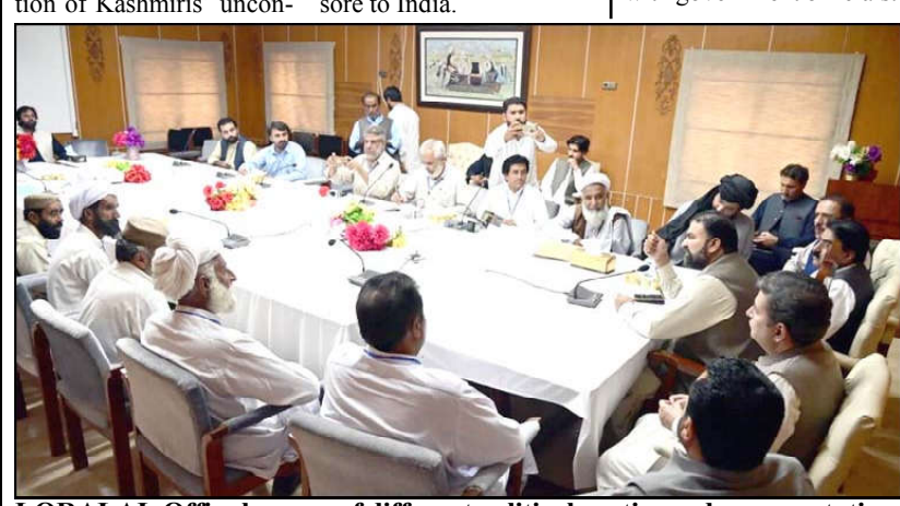
LORALAI: Office bearers of different political parties and representatives of civil society meeting with Chief Minister Balochistan Mir Sarfraz Ahmed Bugti

hoc judges after the appointment of permanent judges. He noted that the proposal for ad hoc judges came on the same day the Supreme Court ruled in favour of PTI with a 5-8 decision and that no transparent procedure was followed for the selection of ad hoc judges. He added that the proposed ad hoc judge, retired Justice Maqbool Baqar, held significant positions in the caretaker government while retired Justice Tariq Masood prolonged the military custody case of 100 PTI supporters, and retired Justice Mazhar Miankhal made remarks about invoking Article 6 against PTI leaders. Shibli Faraz highlighted that critical cases such as the civilian military trial, the February 8 election case, and the recent ban on PTI are pending in the Supreme Court.