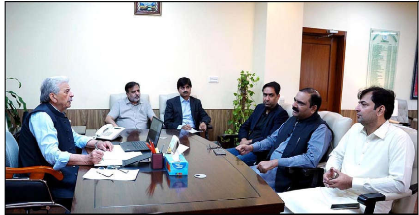
ISLAMABAD: A delegation of the Pakistan Cotton Ginners Association, called on the Federal Minister for National Food Security and Research.