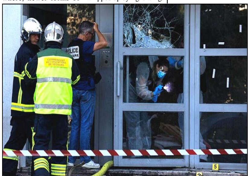
A judicial police officer and forensics police inspect the entrance of a residential building where a fire broke out overnight in Nice.

Last month, Kyiv urged officials to turn off air conditioners in government buildings and called on regional authorities to limit street lighting to ease pressure on the grid.