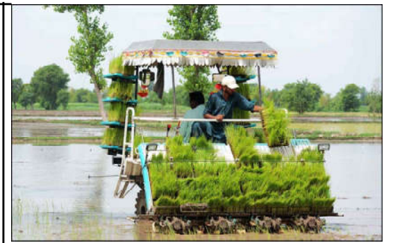
FAISALABAD: A Farmer utilizing modern agricultural machinery for planting rice seedlings in their fields on outskirts area in the city.

overall progress to date. He also emphasized the need for government stakeholders to be more proactive in taking up implementation. The minister appreciated the technical assistance provided, stressed on consolidation of interventions and on speeding up on government implementation for impact. Jane Marriot, thanked the minister for his interest in the programme interventions and commitment to reform that will take Pakistan forward. She assured of FCDO's full support to the government on high priority areas, the statement added.