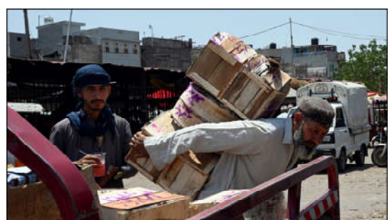
ISLAMABAD: A middle-aged laborer carries crates of mangoes to load them onto a delivery truck at the Islamabad Fruit and Vegetables Market.