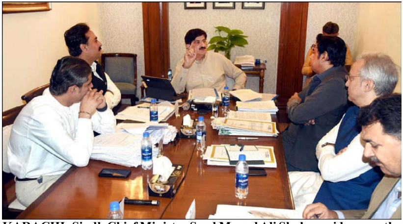
KARACHI: Sindh Chief Minister Syed Murad Ali Shah presides over the meeting of Irrigation Department at Chief Minister House.