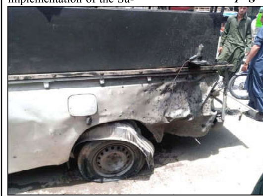
QUETTA: View of site after bomb blast on police vehicle, at Band Khushdil Khan road in Pishin area of Balochistan.