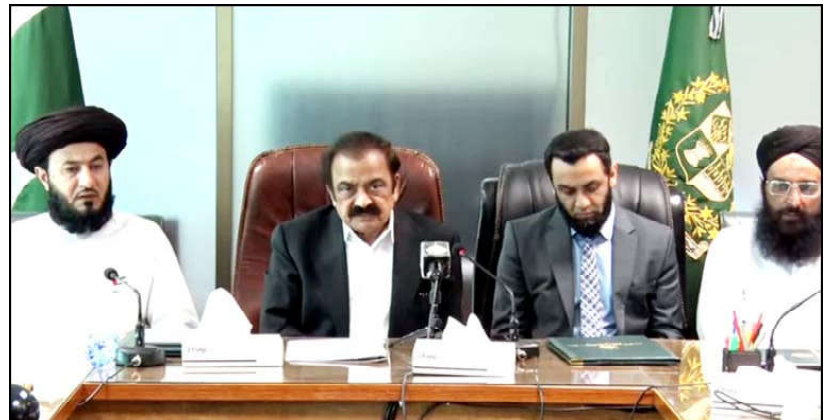
ISLAMABAD: Adviser to Prime Minister on Political Affairs Rana Sanaulah alongside Minister for Information and Broadcasting Attaullah Tarar, Islamabad Capital City administration and representatives of Tehreek-i-Labbaik Pakistan addressing a joint news conference.