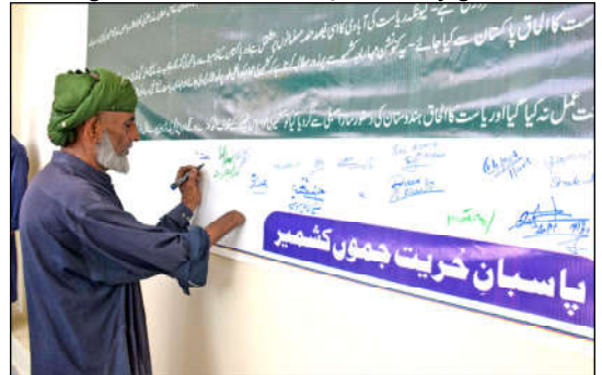
MUZAFFARABAD: Members of Pasban-e-Hurriyat Jammu and Kashmir signatures on a banner on the occasion of Youm-e-Ilhaq-e-Pakistan, in the city.