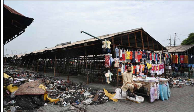
ISLAMABAD: A vendor showcases children's garments at a makeshift stall amidst the debris of last week's devastating blaze at the H-9 weekly bazaar, which destroyed 2,743 stalls and 625 shops, causing millions in damages in Federal Capital.

"The United States firmly believes that expanding opportunities for women entrepreneurs leads to more stable societies. When women entrepreneurs succeed, they're more likely to invest back into their families and communities—into education, nutrition, well-being, and children's health."