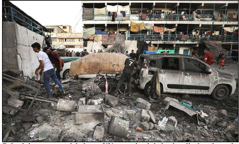
Palestinians remove debris at a UN-run school sheltering displaced people, following an Israeli strike in Gaza City.

The dead include three children — 5, 7 and 10 years old — and a 17-year-old who tried to escape by jumping from a window, they added. The apartment is located in the low-income neighbourhood of Les Moulins, known for being a drug-dealing hub, in the west of the city.