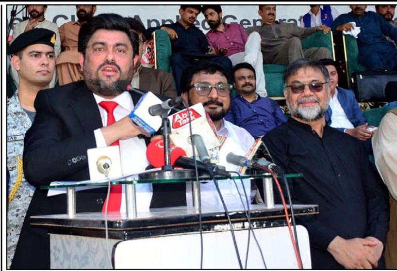
HYDERABAD: Governor Sindh Kamran Khan Tessori addresses participants at the Grand Entry Test for the Governor Sindh IT Initiative Program 2024, held at Niaz Stadium in the city.

HYDERABAD (APP): Sindh Governor Muhammad Kamran Khan Tessori on Friday announced an initiative to strengthen the country's economy by providing IT courses to young people of Hyderabad. He said that the country was currently indebted to the IMF, and strengthening the economy was very crucial. He maintained that after launching the program in Karachi, it has now been extended to Hyderabad, with future plans to introduce it in Sukkur, Mirpurkhas, Larkana and Shaheed Benazirabad. He expressed these views while talking to the media at Niaz Stadium Hyderabad on the occasion of the entry test organized to conduct IT courses for the youth under the Governor Sindh IT Initiative Program. This initiative aims to equip young people with skills in artificial intelligence and other IT fields. The entry test will last for three days and see around 50,000 students participate. Governor Tessori described the impact of these courses, which will enable young people to get online employment and contribute to the country's economic stability. He mentioned that the IT sector's growth was essential, noting that Pakistan's IT exports were currently low compared to neighboring countries. He added that the cost of IT