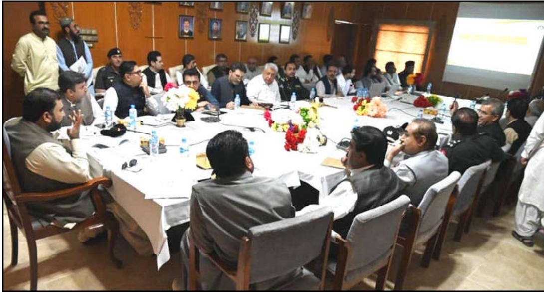
LORALAI: Chief Minister Balochistan Mir Sarfaraz Ahmed Bugti presiding over a meeting regarding departmental performance and progress on development projects

Ph: 2841470/2841473 REG: No. BC-116 B/ID-445 Vol XXV No. 327, Muharram 13, 1446 AH Saturday July 20, 2024 Pages 08, Price Rs.15