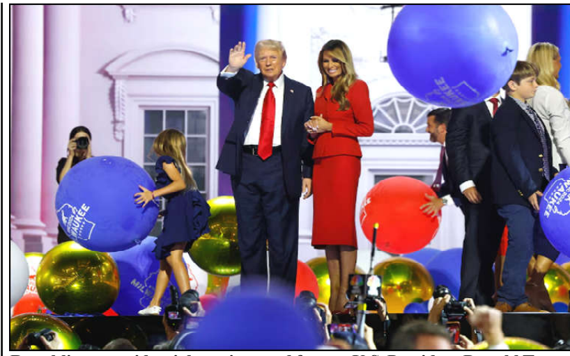
Republican presidential nominee and former U.S. President Donald Trump is joined on stage by wife Melania and other relatives after he finished giving his acceptance speech on Day 4 of the Republican National Convention (RNC), at the Fiserv Forum in Milwaukee, Wisconsin, U.S.

Guterres has repeatedly called for an immediate ceasefire in Gaza, saying Wednesday that "the humanitarian situation is a moral stain on us all".