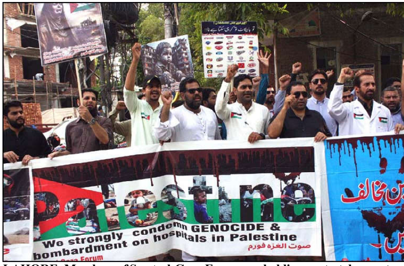
LAHORE: Members of Sawt-ul-Gaza Forum are holding protest demonstration against Israeli cruel and inhumane acts and express unity with the innocent people of Palestine, at Lahore press club.