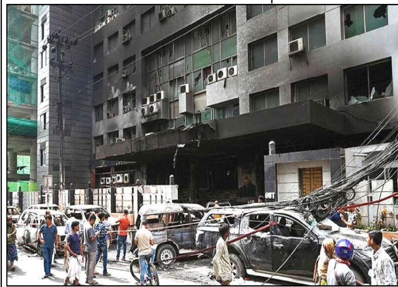
People walk past burnt vehicles after students set them on fire amid the ongoing anti-quota protests in Dhaka.

The six were all of Vietnamese ethnicity, two of those US nationals. Police said the US Federal Bureau of Investigation had assisted with the investigation.