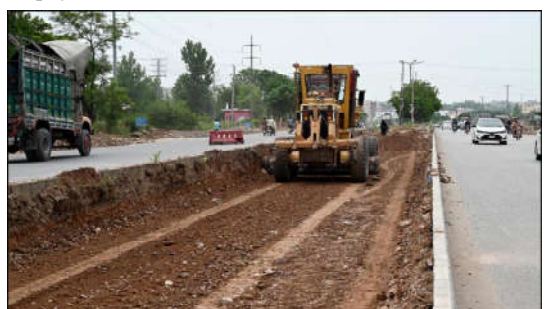
ISLAMABAD: Heavy machinery being used during extension work of Club Road during development work in Federal Capital.

Atif Bajwa agreed to initiate pilot skill training projects for BISP beneficiaries.