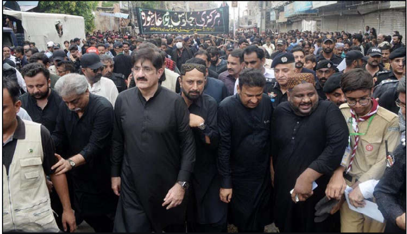
HYDERABAD: Sindh Chief Minister Syed Murad Ali Shah visit along with advisor attending the mourning procession of Ashura on Youm-e-Ashura, the 10th day of Muharram-ul-Haram station road.