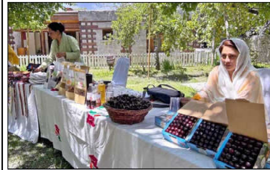
HUNZA: Business women of local community displaying cherry for selling purpose for tourists.

The conference intends to address the linked concerns of water, energy, food, and ecosystem security.