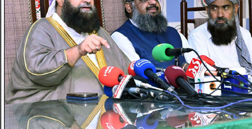
LAHORE: Chairman Pakistan Ulema Council Allama Tahir Ashrafi addressing a press conference at Press Club.