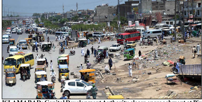
ISLAMABAD: Capital Development Authority clears encroachment at Pir Wadhari Mor to restore its original beauty of the city in Federal Capital.