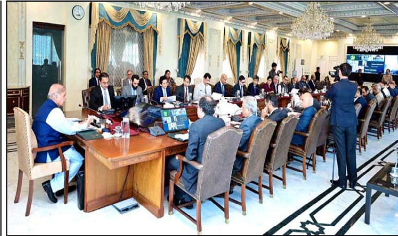
ISLAMABAD: Prime Minister Muhammad Shehbaz Sharif chairs a review meeting on the reforms and digitisation of the Federal Board of Revenue.

The fare for all freight and goods trains would see a two percent increase. All stations, booking offices, reservation offices, and relevant staff had been informed in this regard.