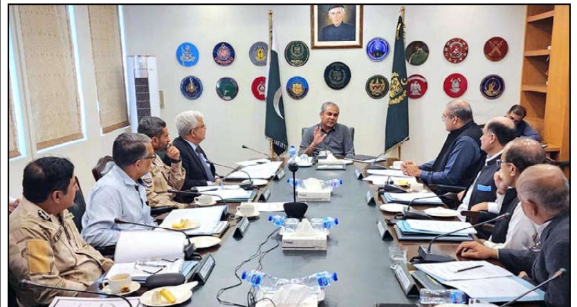
ISLAMABAD: Federal Minister for Interior and Narcotics Control Mohsin Naqvi chairing a meeting of Committee regarding National Drug Survey.

The National Drug Survey will be a comprehensive and authoritative exercise, covering homes, educational institutions, slums, and other areas. The data collected will enable policymakers to make informed decisions in the fight against narcotics.