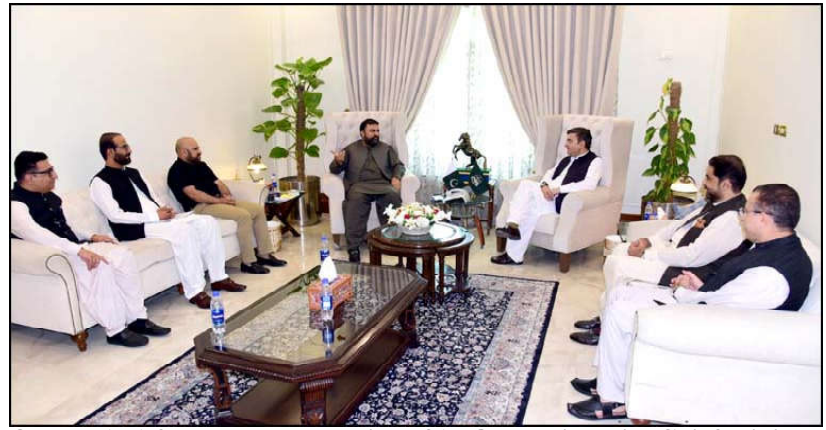
QUETTA: A 3-members delegation of AEOs meeting with Chief Minister Balochistan Mir Sarfraz Ahmed Bugti. Chief Secretary Balochistan Shakeel Qadir Khan is also present