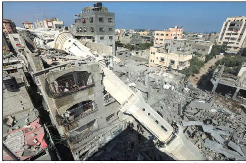
The collapsed minaret of Abdullah Azzam mosque leans against a house after the mosque was hit by an Israeli strike, amid the Israel-Hamas conflict, in Nuseirat refugee camp in the central Gaza Strip.