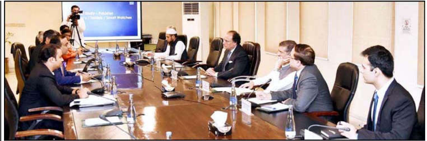
ISLAMABAD: Federal Minister for Finance and Revenue Senator Muhammad Aurangzeb in a meeting with the delegation of Pakistan Mobile Phone Manufacturers Association (PMPMA).

the national economy. The delegation also presented proposals aimed at promoting the growth of the local industry and increasing the exports of the mobile phone manufacturing industry. According to the statement, the meeting concluded with a mutual agreement on the need for a strategic and supportive policy framework aimed at fostering local manufacturing and enhancing export potential, thereby contributing to the broader goals of national economic growth and digital transformation.