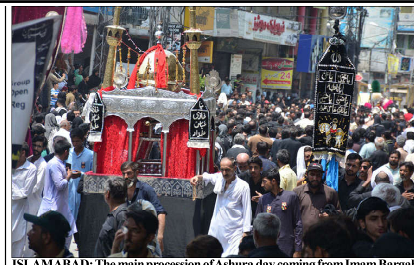
ISLAMABAD: The main procession of Ashura day coming from Imam Bargah Ashiq Hussain Teeli Mohalla passing through Committee Chowk in the city.