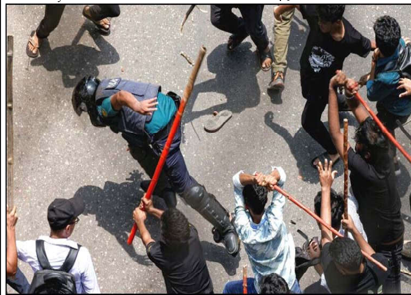
Anti-Quota protesters clash with students backing the ruling Awami League on Dhaka University campus.

170 million population out of work or education. Six people died in clashes with police in Dhaka on Thursday, including a bus driver whose body was brought to a hospital with a bullet wound to his chest, and a student, officials told Reuters. Hundreds more were injured, they said. Law Minister Anisul Huq said the government was willing to talk to the protesters, who want the state to stop setting aside 30 per cent of government jobs for the families of those who fought in the 1971 war.