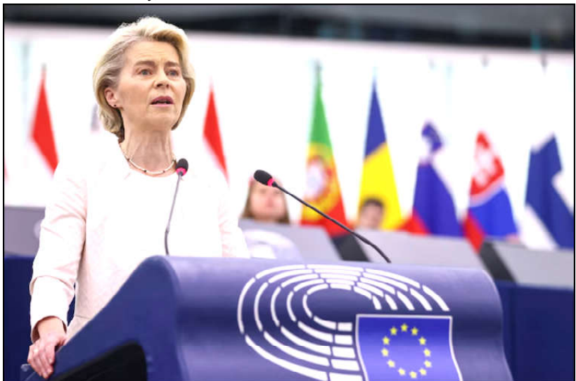
Ursula von der Leyen addresses lawmakers before a vote to choose the next President of the European Commission, at the European Parliament in Strasbourg, France.