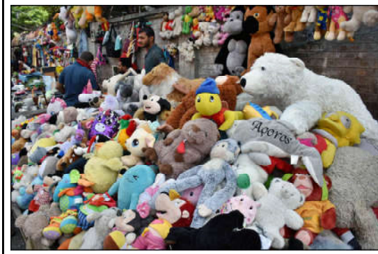
LAHORE: A vendor waiting for customers to sell second hand toys at his roadside setup in Provincial Capital.

The signing of this protocol marks a significant milestone in the bilateral relations between Romania and Pakistan.