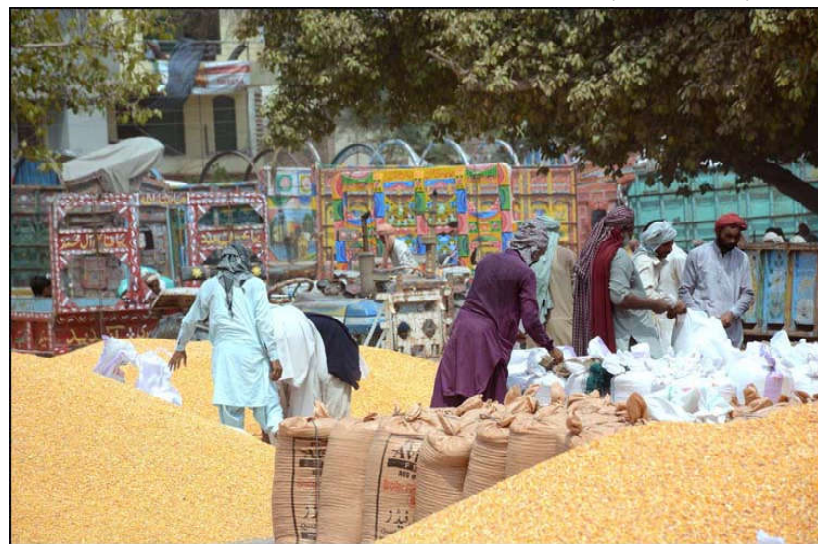
FAISALABAD: Labourers packing freshly harvested maize into sacks for transport to factories and market in the city.

8.60 metric tons respectively, said an official in the Ministry of National Food Security and Research. Talking to APP here on Thursday, he said that during the season 2024-25, gram crop to be cultivated over 865 thousand hectares, where as the lentil pulse would be sown over 6.64 thousand hectares. He said that the mung bean to be cultivated over 214.80 thousand hectares and mash over 11.05 thousand hectares during the period under review to fulfill the domestic requirements of leguminous vegetables.