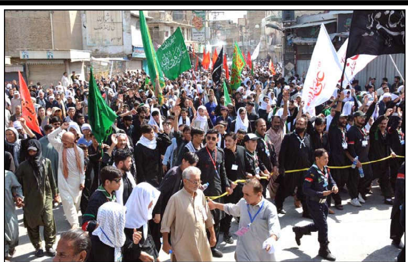
QUETTA: Shiite Muslims mourners to Imam Hussain (R.A) are participating religious procession to show their devotion and respect for cradle as they remember the martyrs of Karbala, during Ashura mourning procession in connection of 10th Muharram-ul-Haram, in Quetta.