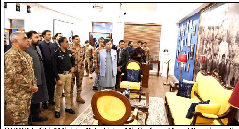
QUETTA: Chief Minister Balochistan Mir Sarfaraz Ahmed Bugti inspecting Museum during his visit to Central Police Officer Quetta. Commander 12 Corps Lt. General Rahat Naseem Ahmed Khan is also present