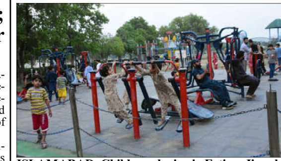
ISLAMABAD: Children playing in Fatima Jinnah Park in the Federal Capital.

During the meeting, Bilal Azhar Kayani elaborated on the plans of the Parliamentary Taskforce on SDGs. He explained that the task force has divided the 17 SDG goals into four categories defined by the United Nations—People, Prosperity, Planet (Earth), and a combined category of Peace & Partnerships—to ensure the dedicated and effective pursuit of the goals. Each sub-group within the task force has a sub-convenor representing one of the four major parliamentary political parties, both genders, and both houses of Parliament to promote bipartisanship and gender equality. The UNDP delegation expressed confidence in Kayani's leadership and agreed to extend assistance and support. They aim to maintain a meaningful working relationship with various UN departments and to conduct, participate in, and facilitate sessions aimed at knowledge-building and capacity-building for MPs.