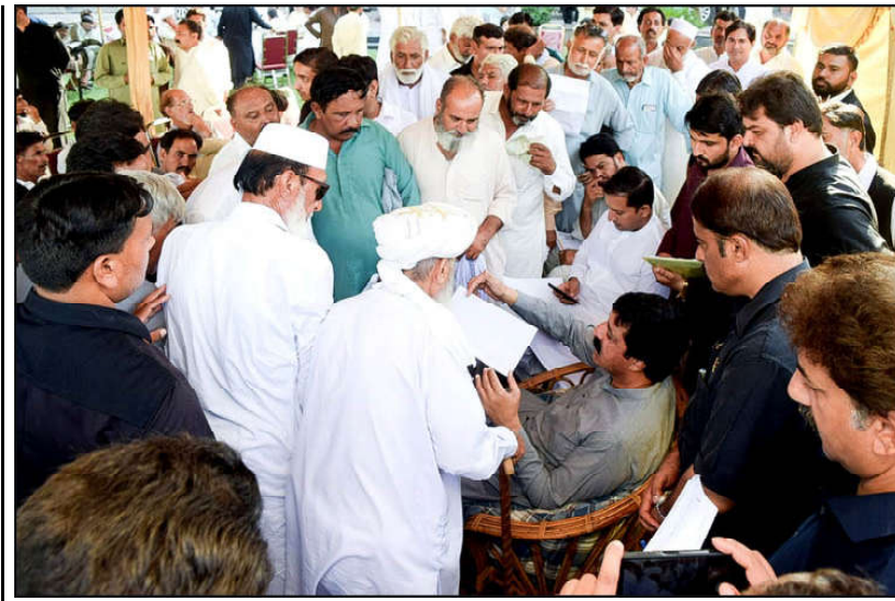
LAHORE: Governor Punjab Sardar Saleem Haider listening the problems of the people during open court for held for solving public problems in Punjab House Rawalpindi.

NOWSHERA (APP): At least seven persons were injured in a police mobile van accident that occurred near Col. Shaikh Khan Interchange of Nowshera district, tv channels quoting police reported on Thursday. According to details, a police mobile van was crossing the Col. Shaheed Shaikh Khan Interchange when it turned turtle due to tyre burst.