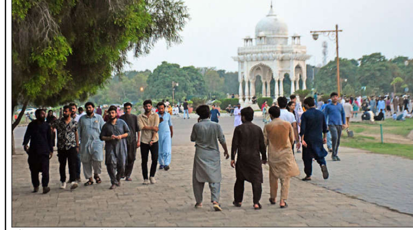
ISLAMABAD: Citizens spending their evening hours in Fatima Jinnah Park having fun and walk in the Federal Capital.