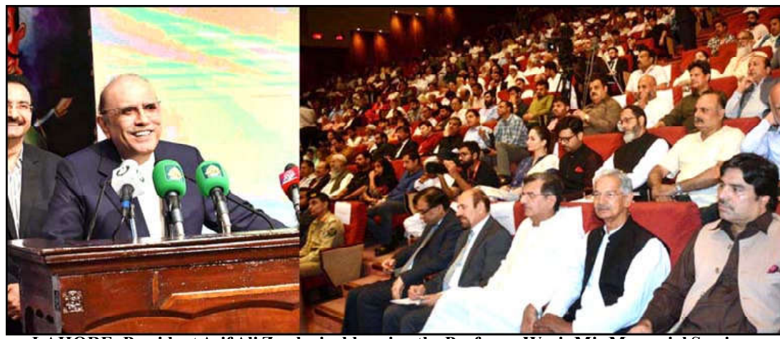
LAHORE: President Asif Ali Zardari addressing the Professor Waris Mir Memorial Seminar.

abling instant communication, mobilization, and dissemination of information," he said. The minister expressed these views while addressing an event titled "Digital Democracy in Action: Enhancing Engagement through Social Media," organized by the United Nations Development Programme (UNDP). He said social media platforms provided spaces for dialogue, enabling people from all walks of life to voice their opinions, share concerns.