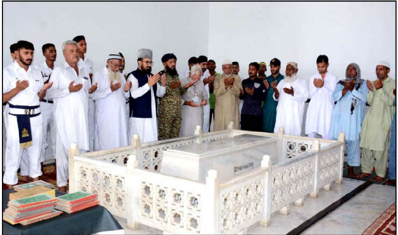
KARACHI: Members of Quaid-e-Azam Management Board and others are paying homage to the Madar-e-Millat, Mohtarma Fatima Jinnah during their visit at Quaid-e-Azam Mausoleum on the occasion of her Death Anniversary.

ISLAMABAD (INP): A British delegation led by Sir Michael Barber called on Prime Minister Shehbaz Sharif in Islamabad Tuesday. Speaking on the occasion, the Prime Minister said Pakistan and the United Kingdom enjoy historic bilateral relations that span decades and are growing stronger with time. He said Pakistan attaches high value to its relations with the United Kingdom. Shehbaz Sharif said the United Kingdom is an important partner and extending cooperation to Pakistan in various sectors. He expressed the resolve to further strengthen people-to-people contacts between the two countries. The Prime Minister apprised the delegation of government's steps for economic revival. He said state-owned enterprises are being privatized, whereas measures are being taken for economic digitization, including the Federal Board of Revenue. He said the government is pursuing a policy of downsizing and abolishing the dysfunctional institutions to reduce state expenditure. He said measures are being taken to enhance exports and expand the tax base. Shehbaz Sharif said Pakistan has immense potential for agricultural and IT exports. Sir Michael Barber appreciated the government's economic recovery plan. He expressed the confidence that the Pakistan will certainly be successful in overcoming its difficulties and problems under the leadership of Prime Minister Shehbaz Sharif.