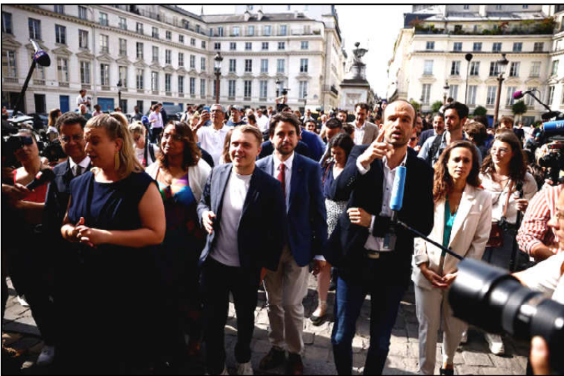
Members of Parliament Mathilde Panot, Louis Boyard, Manuel Bompard and Clemence Guette of the French far-left opposition party La France Insoumise (France Unbound - LFI) and the alliance of left-wing parties, called the "Nouveau Front Populaire" (New Popular Front - NFP), arrive with other elected members of parliament at the National Assembly in Paris after the second round of the early French.

Scorching heat has blanketed swathes of the world from India to Saudi Arabia, the United States and Mexico in the first half of this year. Relentless rain, a phenomena scientists have also linked to a warmer planet, caused extensive flooding in Kenya, China, Brazil, Afghanistan, Russia and France. Wildfires have torched land in Greece and Canada and last week, Hurricane Beryl became the earliest category five Atlantic hurricane on record as it barreled across several Caribbean islands. The streak of record-breaking temperatures coincided with El Nino, a natural phenomenon that contributes to hotter weather globally, said Julien Nicolas, a senior scientist at C3S. "That was part of the factors behind the temperature records, but it was not the only one," he said. Ocean temperatures have also been hitting new highs. Record sea surface temperatures in the Atlantic, the Northern Pacific and Indian Ocean also contributed to the soaring heat across the globe.