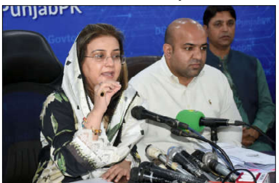
LAHORE: Information Minister of Punjab Azma Bokhari addressing a press conference along with Minister for Education of Punjab Rana Sikandar Hayat, at D.G.P.R in the Provincial Capital.

target clusters were administered polio vaccines. The week-long campaign witnessed an increased trend of positive response by the residents. However, a number of children were remained unattended due to summer vacations in schools. In a brief interaction with APP, the Superintendent District Health Authority, Dr. Nadim Ahmad informed that cent percent result could be achieved if schools were opened.