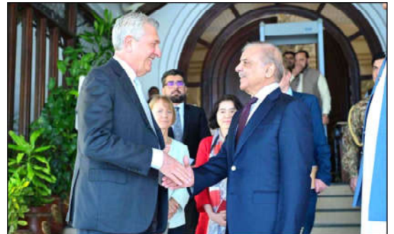
ISLAMABAD: UN High Commissioner for Refugees Filippo Grandi called on Prime Minister Muhammad Shehbaz Sharif.

ISLAMABAD (APP): Prime Minister Shehbaz Sharif on Tuesday urged the international community to recognize the burden being shouldered by Pakistan while hosting such a large refugee population and demonstrate collective responsibility. The prime minister, in a meeting with the United Nations High Commissioner for Refugees (UNHCR) Filippo Grandi at the PM House, reaffirmed Pakistan's commitment to address the protection and safety needs of people in vulnerable situations and underscored that the international community needed to be mindful of the socio-economic challenges and security threats being faced by Pakistan in this regard, according to a PM Office press release. While recalling Pakistan's longstanding partnership with UNHCR, the prime minister appreciated the UN agency's support to Pakistan in hosting Afghan refugees for over four decades. He noted that despite numerous challenges, Pakistan had hosted Afghan refugees with exemplary respect and dignity. He sought UNHCR's support in mobilizing adequate resources to supplement Pakistan's efforts in this regard and urged the UN body to play its role in promoting durable solutions to address the situation of Afghan refugees.