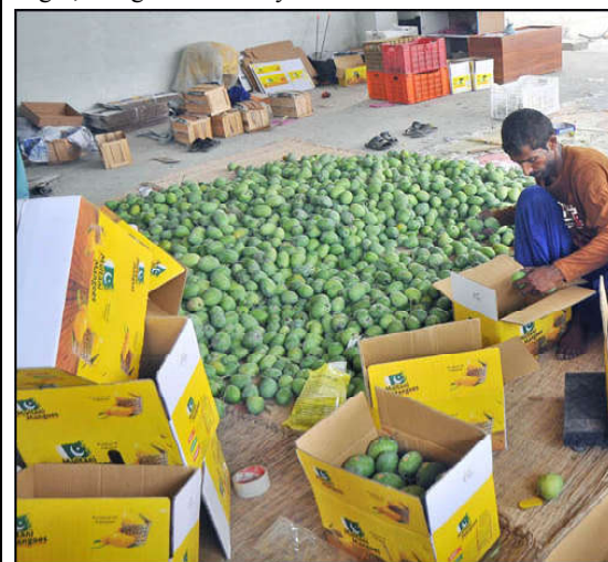
MULTAN: A worker weighing and packing good quality mangoes into the boxes for delivery to the other City.

ISLAMABAD (APP): The Competition Commission of Pakistan (CCP) has approved a Scheme of Arrangement for the merger of M/s. Shamim and Company (Pvt.) Ltd with M/s. JK Sugar Mills (Pvt.) Ltd. JKSM is a private limited company with the business of production and sale of sugar or related products in Pakistan, said a press release issued here on Tuesday. JKSM primarily produces refined white sugar, along with three by-products namely, molasses, bagasse, and mud. SCL, since 1967 is into the business of manufacturing and distribution of PepsiCo products across Pakistan. The Phase-I competition assessment by the CCP identified two relevant markets namely, "Sugar and by-products" and "Non-alcoholic beverages". As per the Scheme of Arrangement, the transaction involves merger of SCL with JKSM.