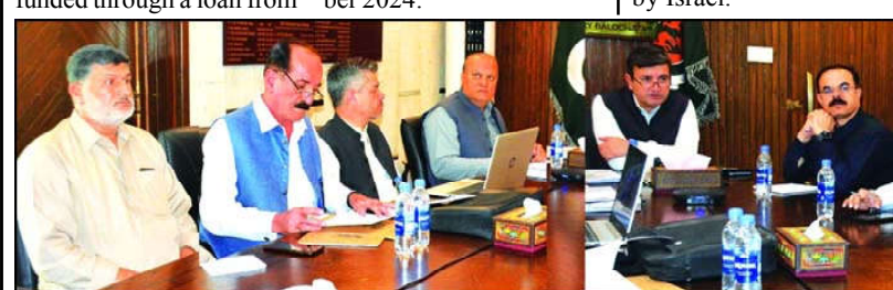
QUETTA: Balochistan Chief Secretary Shakeel Qadir Khan presides over the meeting regarding shifting of Agricultural Tubewells on solar.

ISLAMABAD (INP): Deputy Prime Minister and Foreign Minister has said economic diplomacy is a major constituent of Pakistan's foreign policy. The FM remarked that Pakistan's economy has shown some positive signs over the past few months and it may come out of the woods soon. He said all the efforts to isolate Pakistan at the international stage have been failed and the country has been regaining its status internationally. The deputy premier added that inflation has come down to 11 percent from 38 percent and the country has been playing its active role to counter Islamophobia. Your next read: Pakistan to implement five-year roadmap for economic turnaround On the Gaza war, he said Pakistan has played a crucial role to highlight the atrocities committed by Israel.