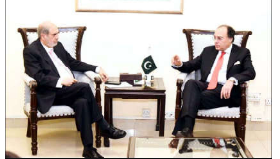
ISLAMABAD: Federal Minister for Finance & Revenue Senator Muhammad Aurangzeb in a meeting with the Chairman Nestle Pakistan and Ex-President Farmers Association of Pakistan.