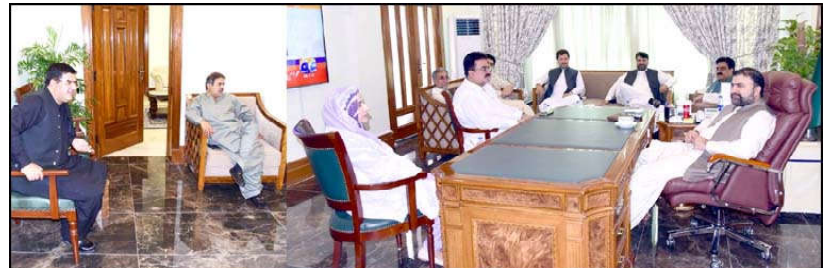
QUETTA: Parliamentary Secretaries and MPAs meeting with Balochistan Chief Minister Mir Sarfraz Ahmed Bugti.