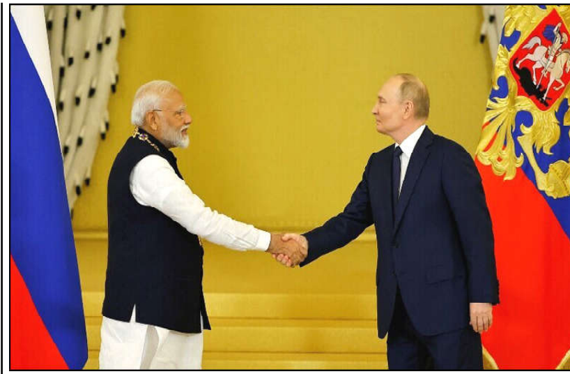
Russia's President Vladimir Putin awards India's Prime Minister Narendra Modi with the Order of St. Andrew the Apostle the First-Called at the Kremlin in Moscow, Russia.

At the Kremlin, Putin hailed India and Russia's "very long-standing friendship" and said they now enjoy a "specially privileged, strategic partnership". Putin thanked Modi for "the attention you pay to the most urgent problems" and said, "you are trying to find some ways to solve the Ukrainian crisis, too, of course primarily by peaceful means". However, Kremlin spokesman Dmitry Peskov later told Russian news agencies that Modi "is not claiming to offer mediation efforts". Modi wrote on X that the talks were "productive" on "ways to diversify India-Russia cooperation in sectors such as trade, commerce, security, agriculture, technology and innovation".