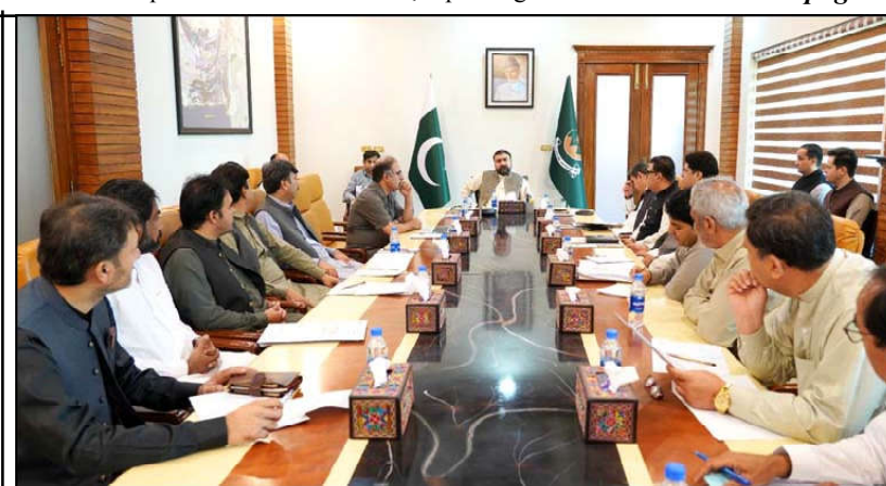
QUETTA: Balochistan Chief Minister Mir Sarfraz Ahmed Bugti presides over a meeting to review the departmental affairs of Culture, Tourism and Archeology.