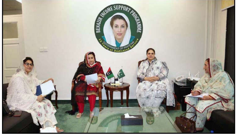
ISLAMABAD: Senator Rubina Khalid, Chairperson Benazir Income Support Programme (BISP), meets with the delegation from the Pakistan People's Party (PPP) Khyber Pakhtunkhwa Women's Wing at BISP Headquarters. The delegation discussed challenges faced by women beneficiaries in Khyber Pakhtunkhwa, receiving assurances of support from the Chairperson.