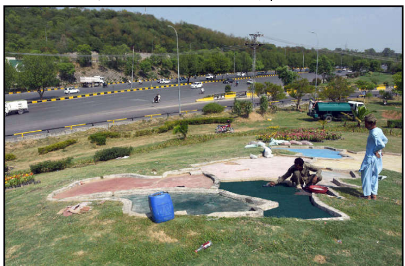
ISLAMABAD: Workers of Capital Development Authority (CDA) busy in preparing map of Pakistan on a green belt at Zero Point during development work, in the Federal Capital.

ISLAMABAD (APP): The Prime Minister Youth Programme (PMYP) office had announced the National Youth Council (NYC) membership under which the last date for submitting forms deadline is July 10. The PMYP spokesperson told APP that NYC an initiative under the Prime Minister's Youth Programme, is accepting applications till July 10. "We're just 24 hours away from closing applications for the National Youth Council, and we want you to take advantage of this life-changing opportunity.