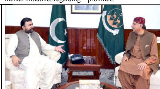
QUETTA: Former Governor Balochistan Malik Abdul Wali Khan Kakar meeting with Balochistan Chief Minister Mir Sarfraz Ahmed Bugti.