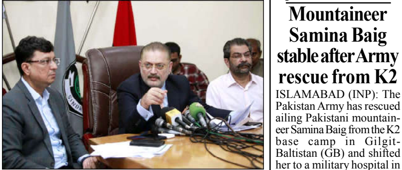
KARACHI: Sindh Minister for Excise and Taxation, Transport Sharjeel Inam Memon along with others addresses to media persons during press conference.