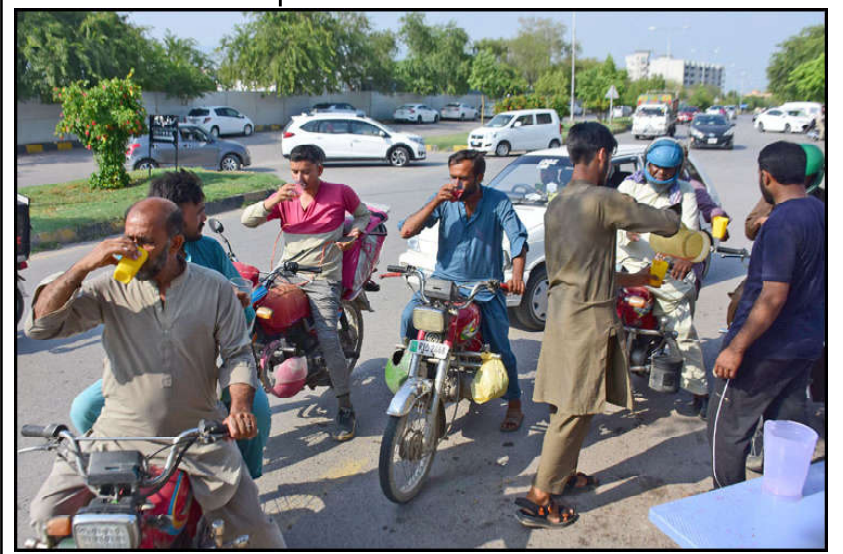
ISLAMABAD: People drinking free sweet water (Sharbat) from a roadside Sabeel at sector G-II in the Federal Capital.