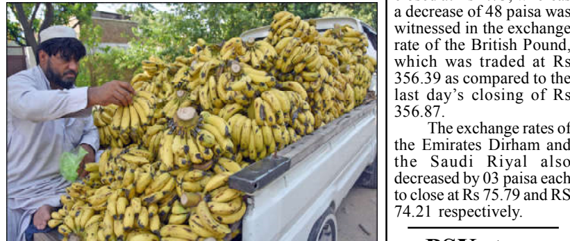
ISLAMABAD: A vendor is displaying Bananas attraction for customers on his loading van alongside a road, in the Federal Capital.