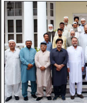
PESHAWAR: Khyber Pakhtunkhwa Governor Faisal Karim Kundi in a group photo with delegation of representative of Farmers Itehad of Swabi and Mardan.

During the meeting at Governor House, the delegation briefed the Governor on the challenges faced by the business community at the provincial and commercial