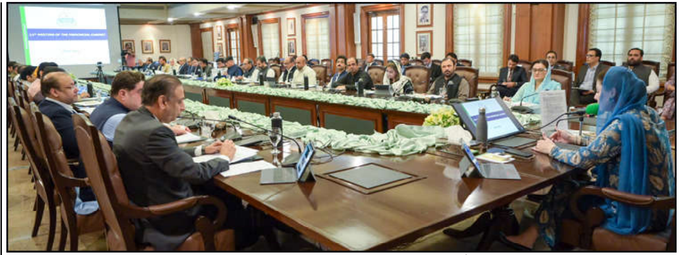
LAHORE: Punjab Chief Minister Maryam Nawaz Sharif presides over the 11th meeting of Provincial Cabinet.