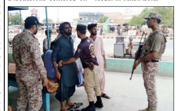
LARKANA: Rangers and Police officials carry out the combing search operation against criminals as security has been tightened in city to maintain law and order situation during the Holy Month of Muharram-ul-Haram, in Larkana.