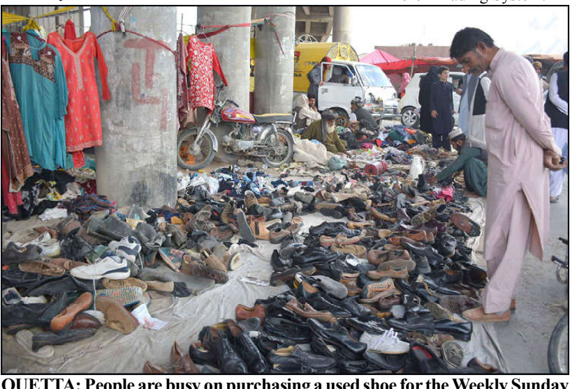
QUETTA: People are busy on purchasing a used shoe for the Weekly Sunday Bazaar at joint Road.