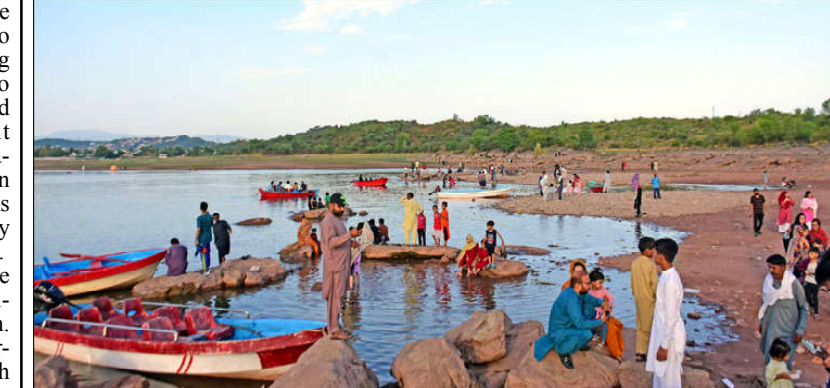
ISLAMABAD: Citizens enjoy holiday at Rawal Dam in the Federal Capital.

about the history of the traffic police force, its targets and achievements. Students were told about safety measures while walking along the road, road crossing code, causes of accidents and how to protect oneself, defensive driving and its requirements, practice to prevent risky situations on road, planning for a long journey, positioning car or lane discipline, right of way on junctions and road markings, safe overtaking, traffic sign boards and traffic light signals and perils of using mobile phone and not fastening seat belts while