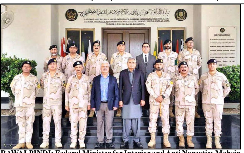
RAWALPINDI: Federal Minister for Interior and Anti Narcotics Mohsin Naqvi in a group photo during his visit to ANF Headquarters.