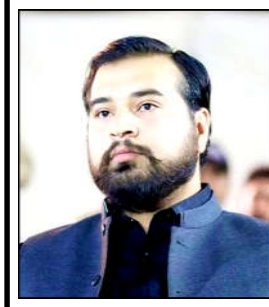
By Hamza Shahzad

In governance, the first 100 days of any administration serve as a critical benchmark—a period during which promises are tested against action, aspirations encounter challenges, and the vision begins to crystallize in governance. The Government