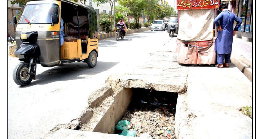
QUETTA: A view of the cover of the manhole is missing in front of the Civil Hospital which may cause any accident that need the attention of concerned authorites