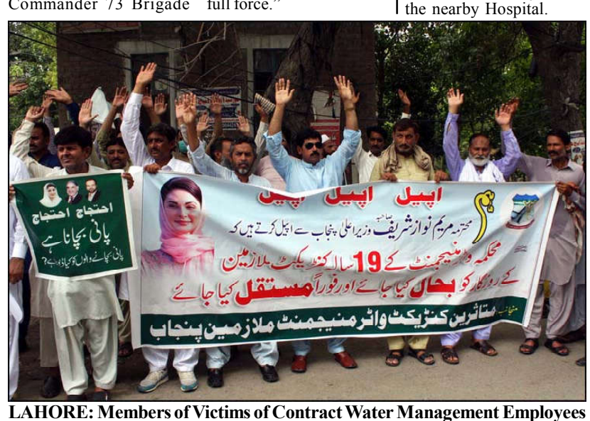
Punjab are holding protest demonstration for restoration of their employment,

The climate change has impacted and strained the agriculture sector in the region and has disrupted the entire pattern of cultivation. The sowing and harvesting of different crops especially wheat.