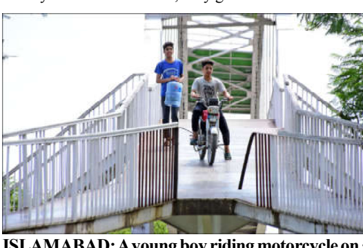
ISLAMABAD: A young boy riding motorcycle on a broken food pedestrian bridge alongside 7th Avenue, in the Federal Capital, which may cause any incident any times as needs to attention for con-

The objective of this programme is to develop new scientific and techno logical cooperation between French and Pakistan's higher education institutions (HEIs) research laboratories by supporting the mobility of researchers from both sides. The joint research proposals have been invited from Pakistan's faculty members of public and private universities for mobility grants in three areas.