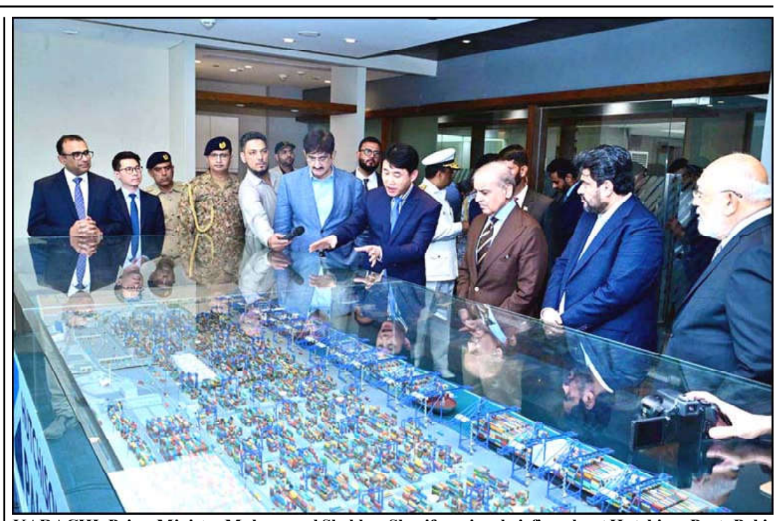
KARACHI: Prime Minister Muhammad Shehbaz Sharif receives briefing about Hutchison Ports Paki-Continued on page 2 stan Terminal at Karachi Port.

The prime minister was further informed that the port had the capacity to handle the shipment of 35,00,000 containers annually.