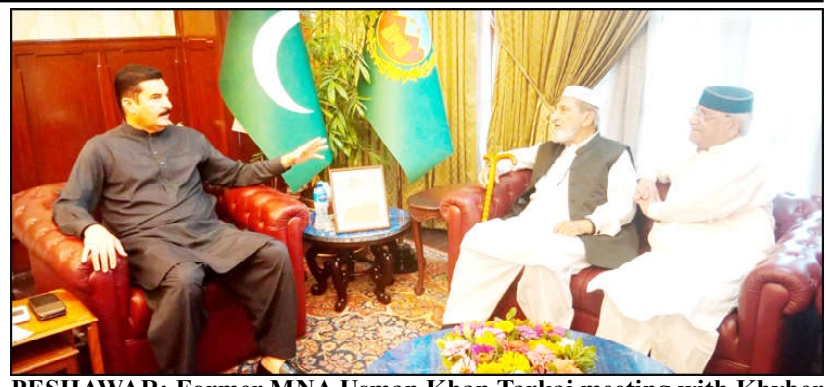
PESHAWAR: Former MNA Usman Khan Tarkai meeting with Khyber Pakhtunkhawa Governor Faisal Karim Kundi.