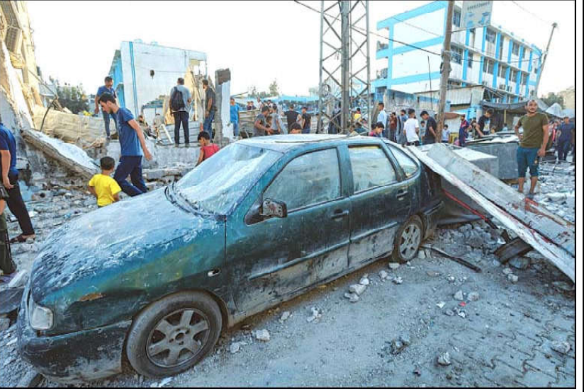
Palestinians gather at the site of an Israeli air strike on a UN school sheltering displaced people at Nusairat in central Gaza Strip.

The Israeli military said forces continued "intelligence-based opera-