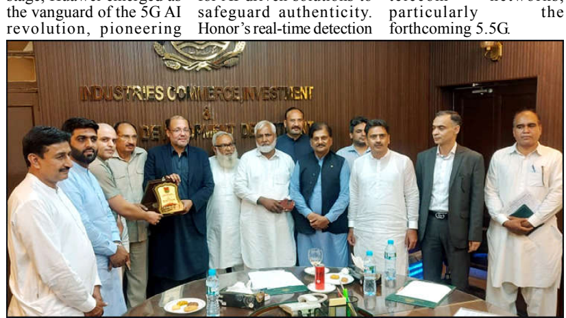
LAHROE: President Industries and Commerce Mandi Bahauddin presenting souvenir to Punjab Minister for Industries and Commerce during a meeting.

these discussions was Huawei, whose executives manipulate audio and video outlined a vision where AI's omnipresence is supported by robust