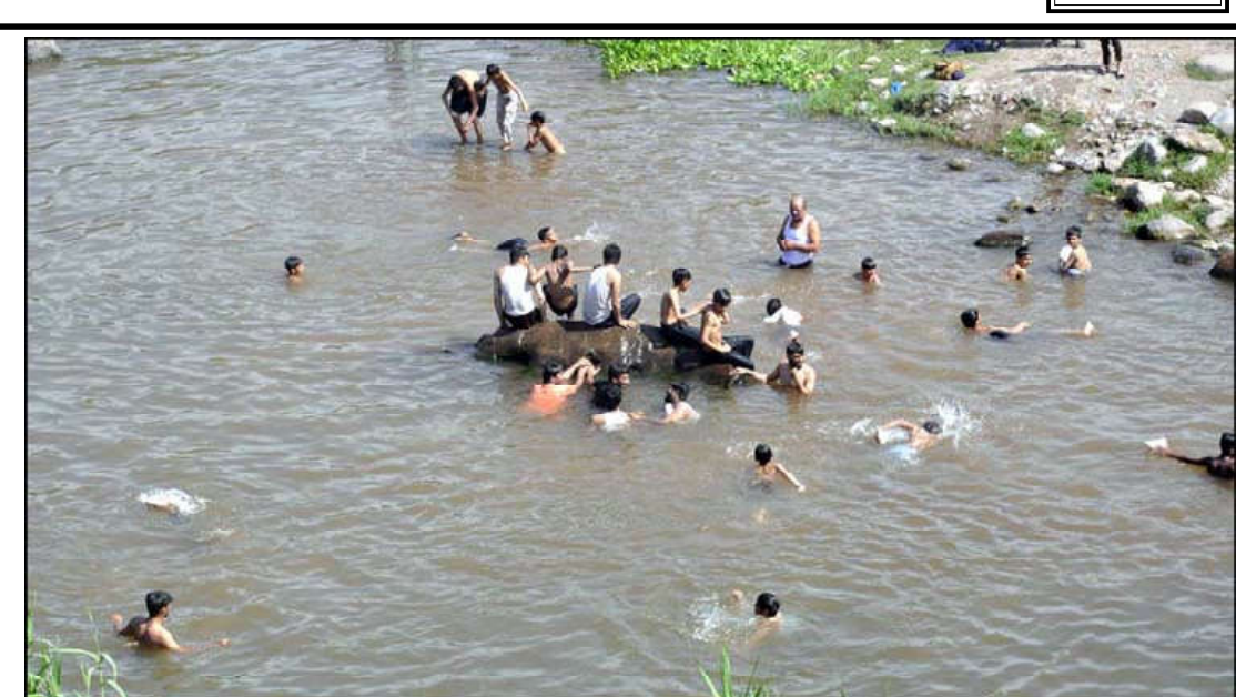
ISLAMABAD: Youngsters jumping and bathing in nullah korang to get relief from hot weather.

During different meetings convened in June over global heat waves and floods, the PM's aide directed relevant institutions to strengthen official media teams to keep vulnerable communities informed about climate change